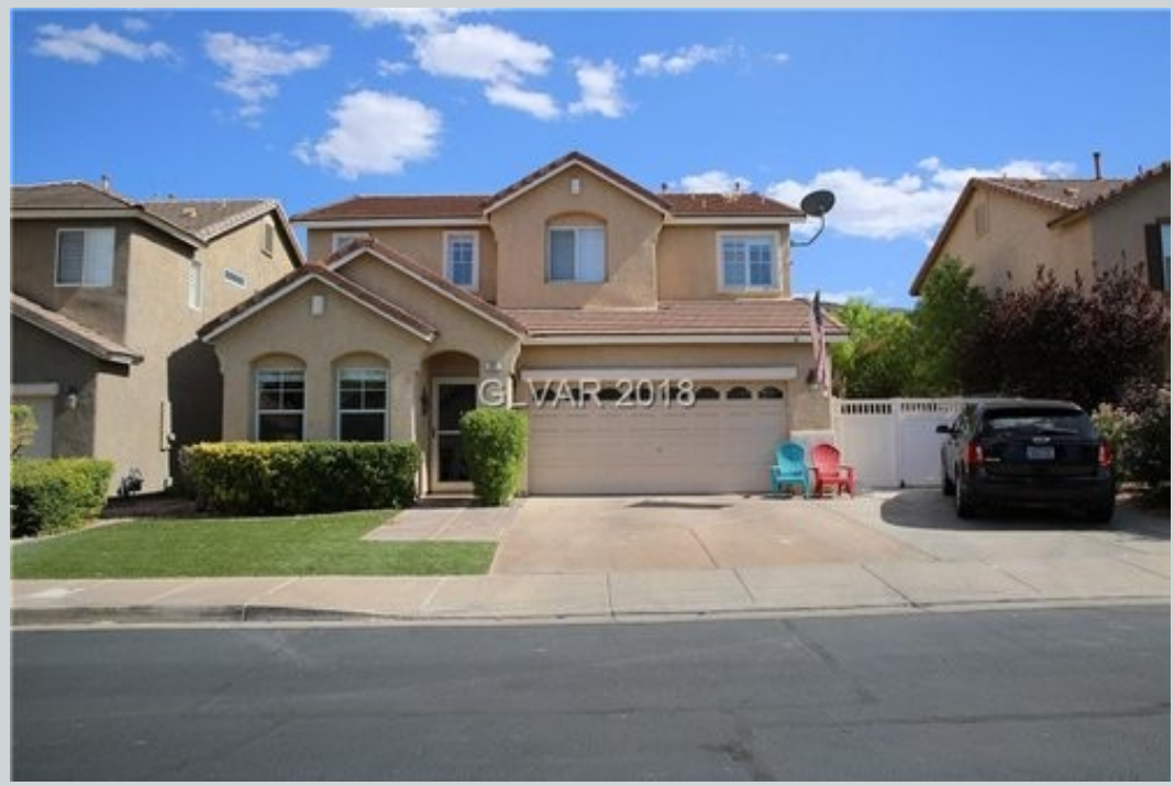
Listing Comp 2 727 Smokey Mountain Ave