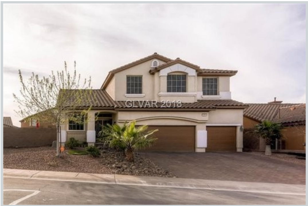
Sold Comp 3 257 Quail Ranch Dr