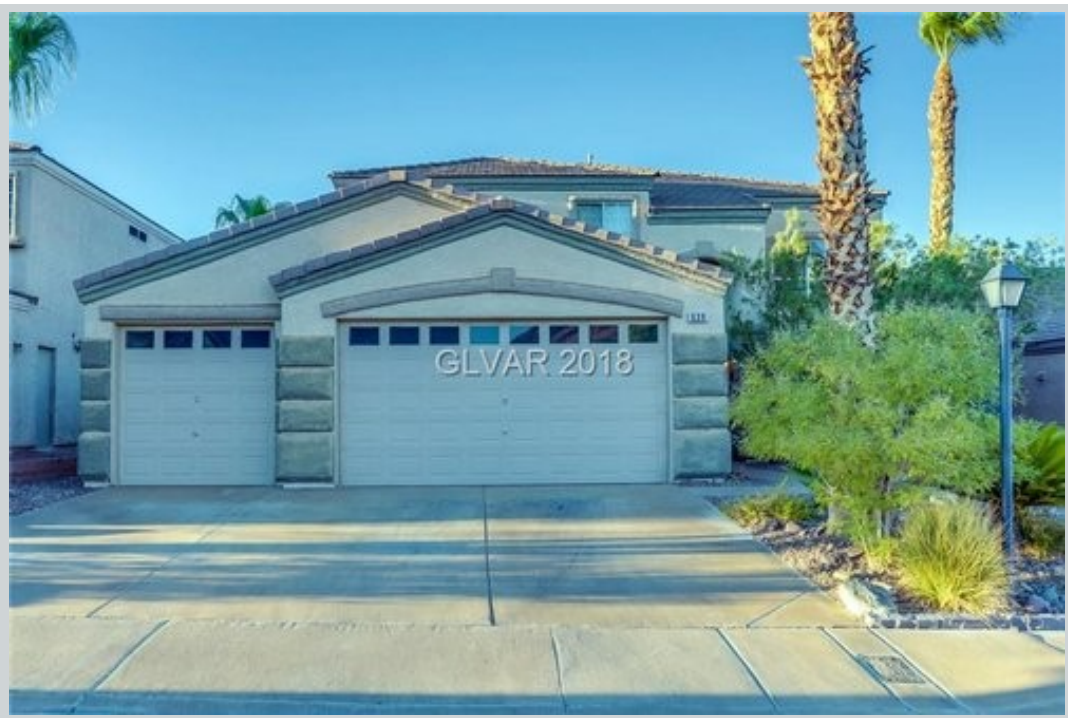
Listing Comp 3 638 Tyler Ridge Ave