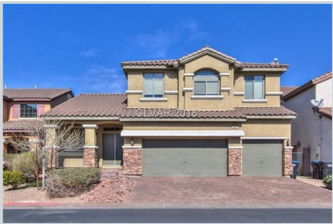
Sold Comp 2 684 Finch Island Ave