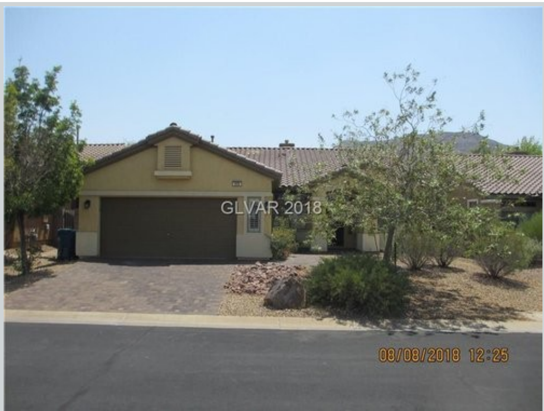
Listing Comp 1 629 Indian Corn Ave