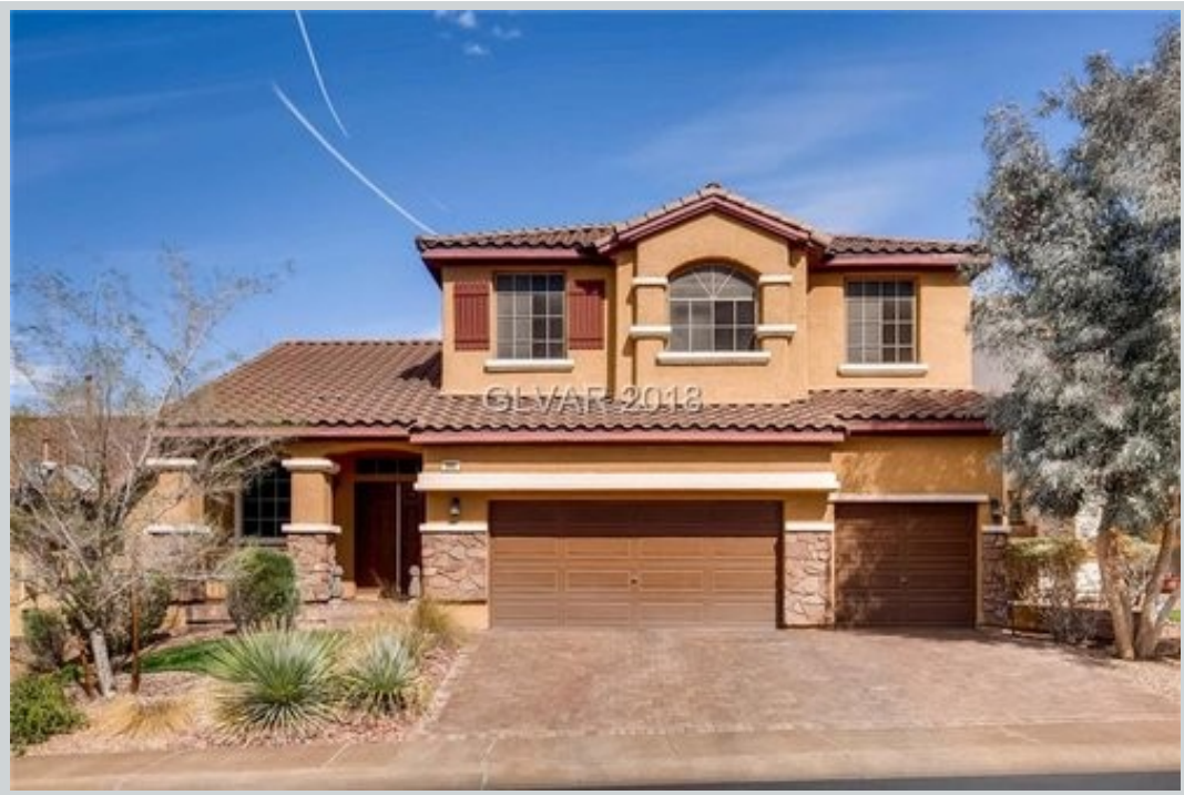
Sold Comp 1 260 Garnet Garden St