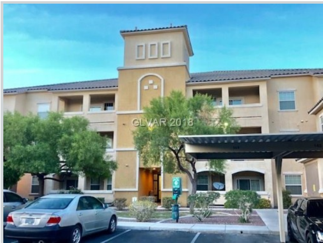
Listing Comp 2 8777 Maule Av #2087