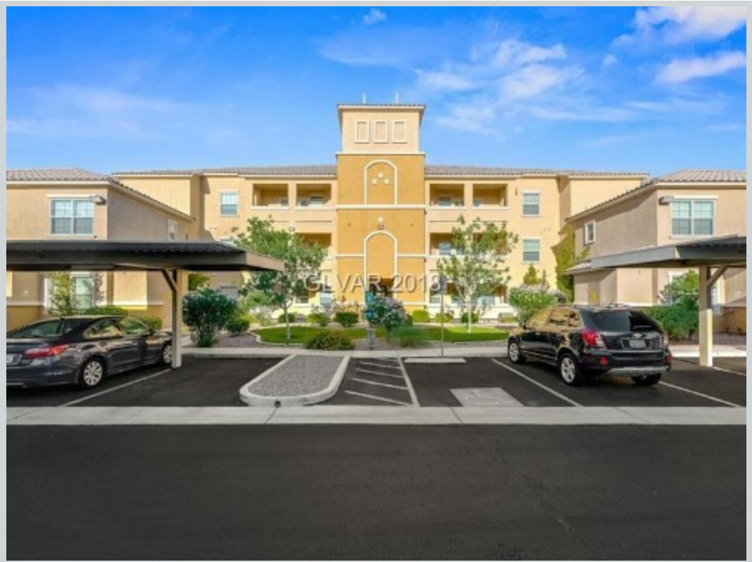
Sold Comp 3 8777 W Maule Av #1112