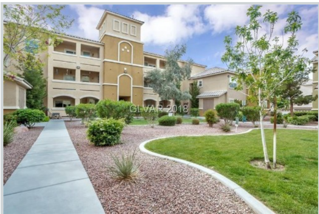
Sold Comp 1 8777 W Maule Av #1117