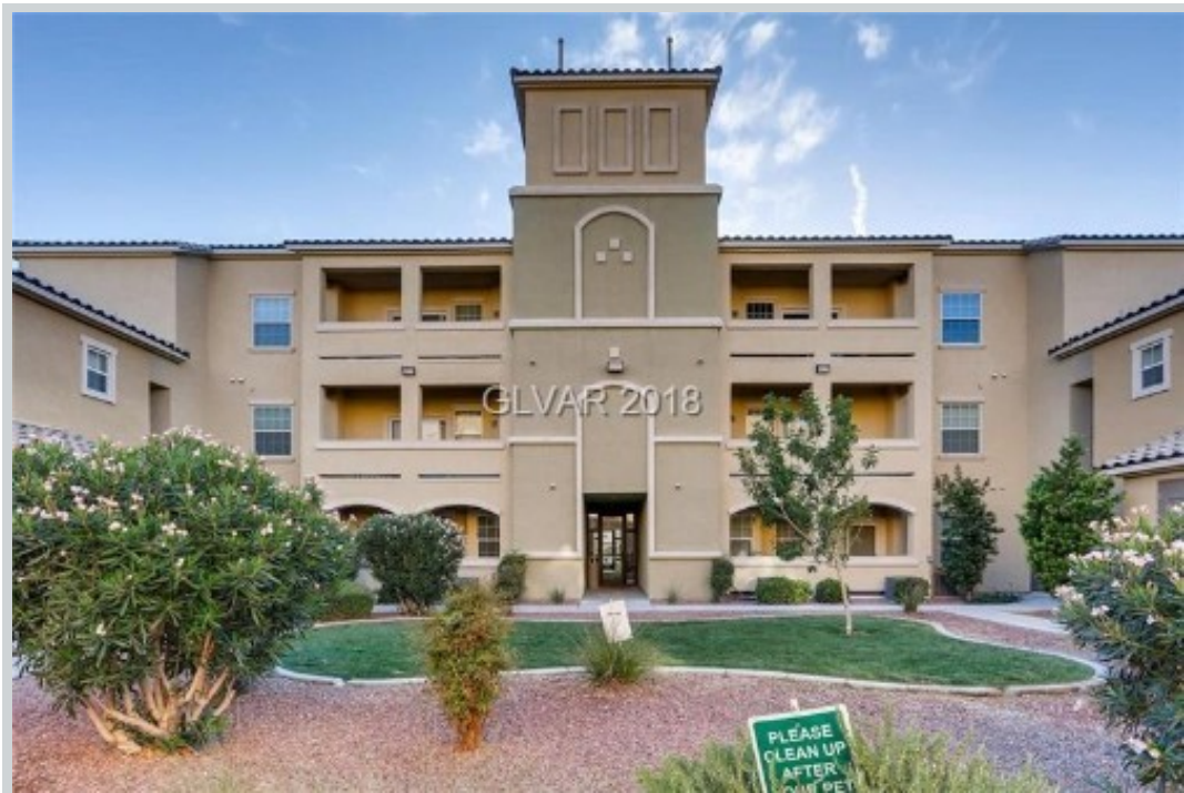
Listing Comp 3 8777 W Maule At #2128