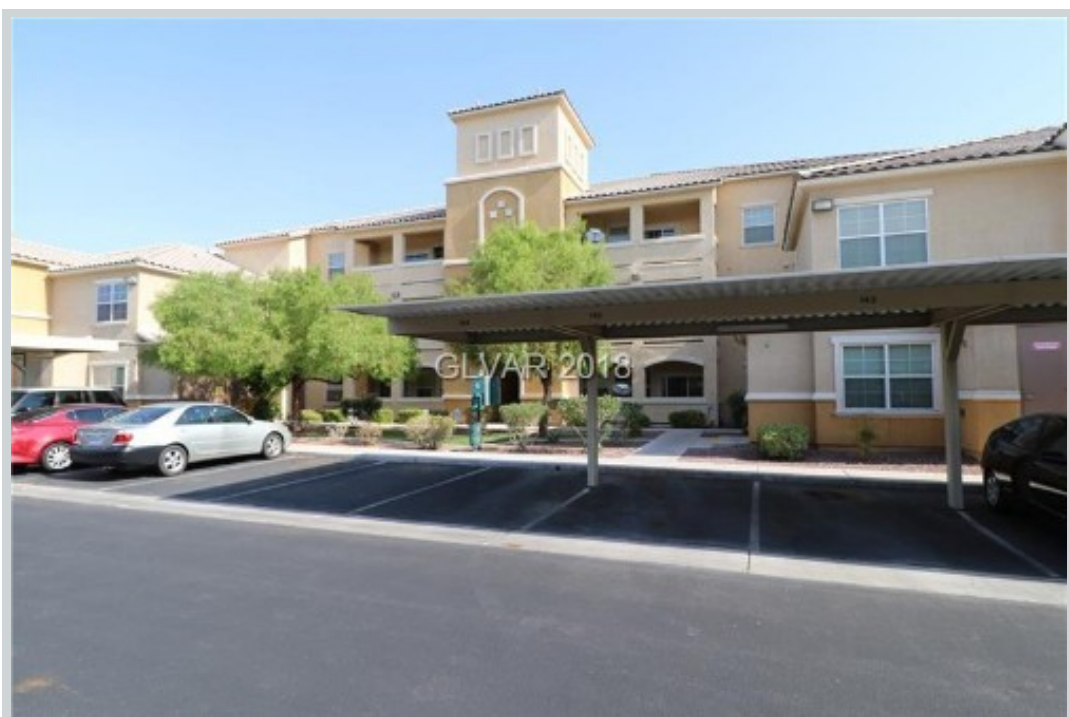
Sold Comp 2 8777 W Maule Av #3119