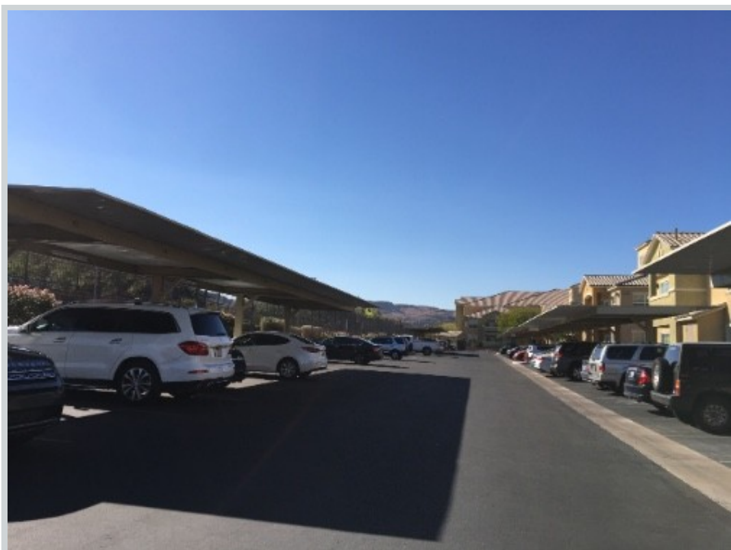
Subject 8777 W Maule Ave Unit 2089