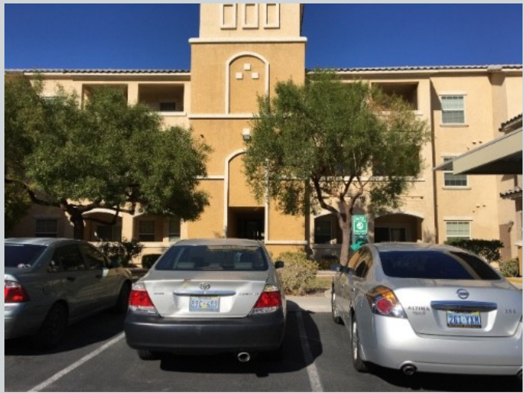
Subject 8777 W Maule Ave Unit 2089