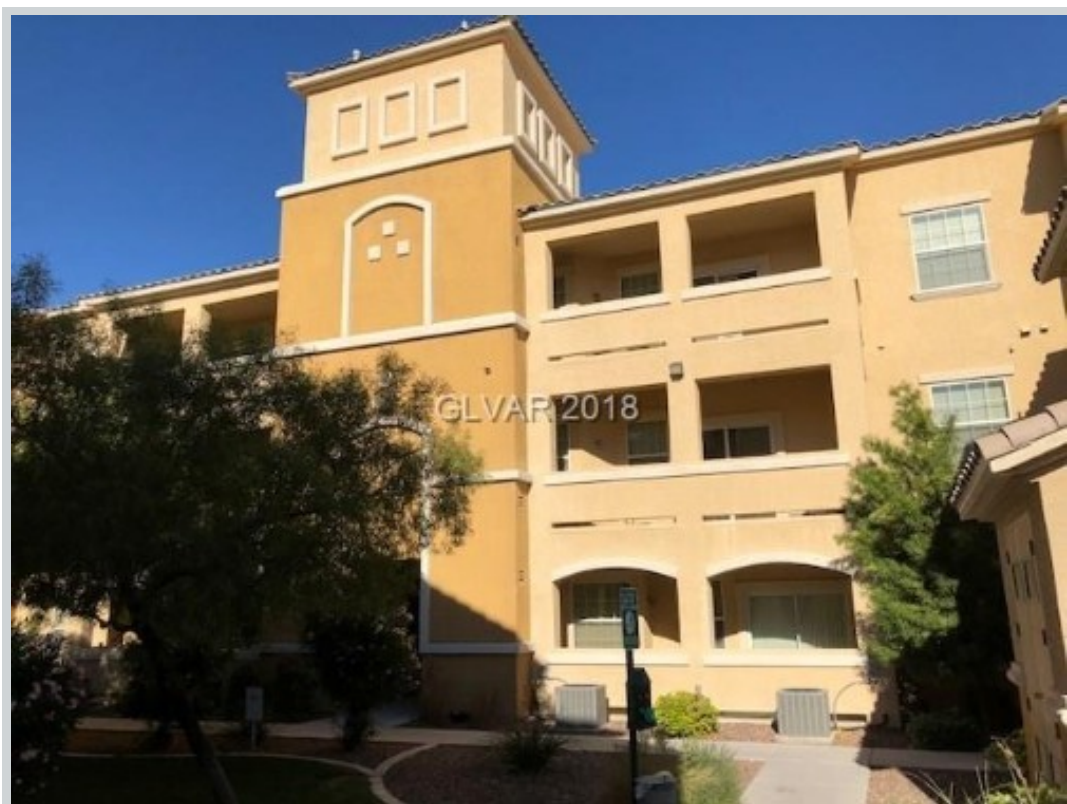
Listing Comp 1 8777 W Maule At #1140