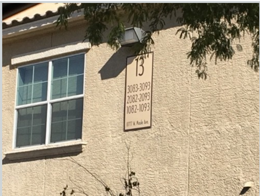
Subject 8777 W Maule Ave Unit 2089