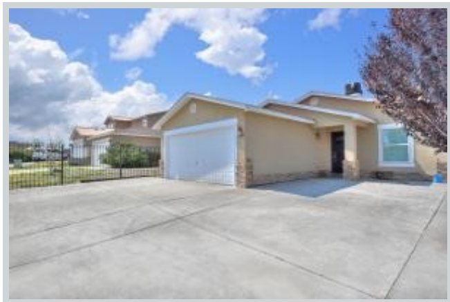
Listing Comp 1 8509 Mesa Entrada Ave Sw