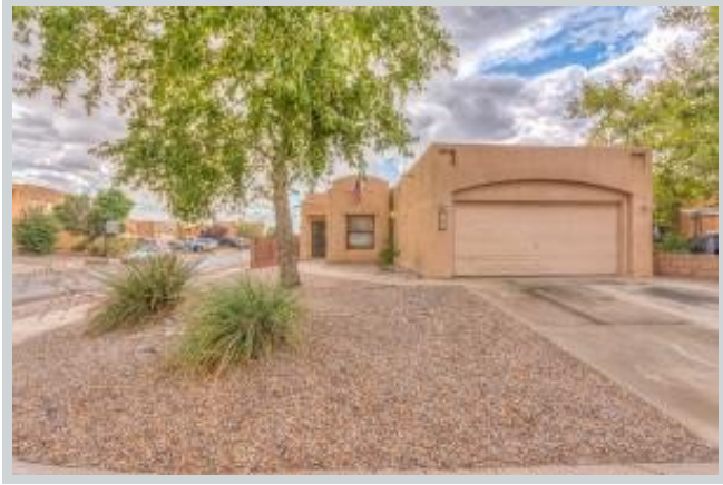
Sold Comp 1 767 Seaborn Dr Sw View Front