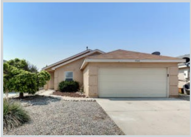
Sold Comp 2 7940 Christopher Rd Sw View Front