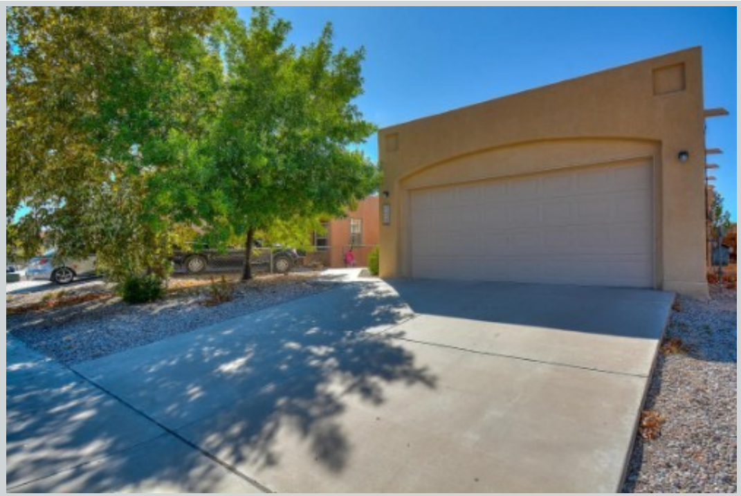
Sold Comp 3 759 Nicklaus Dr Sw