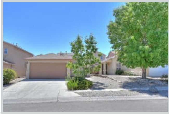
Listing Comp 2 1325 Arroyo Hondo St Sw View Front