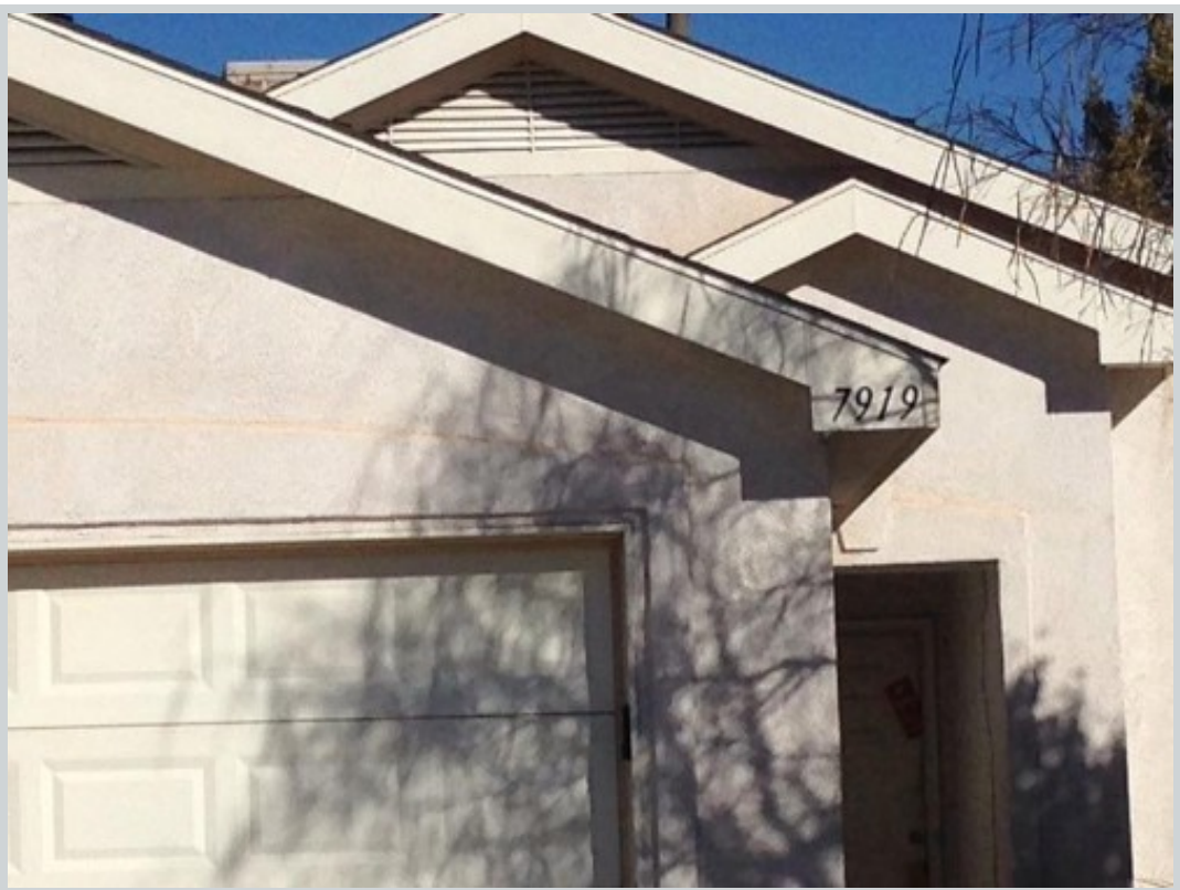
Subject 7919 Christopher Rd Sw