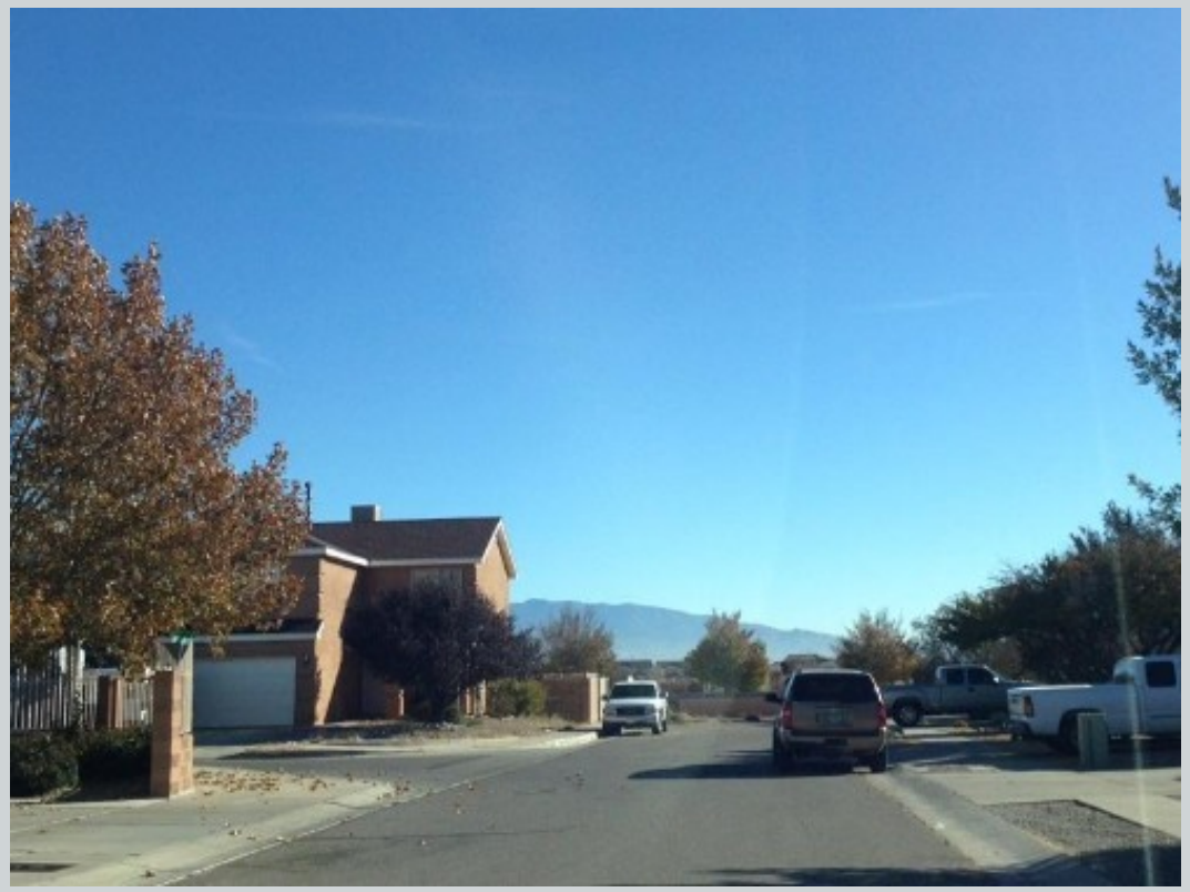
Subject 7919 Christopher Rd Sw