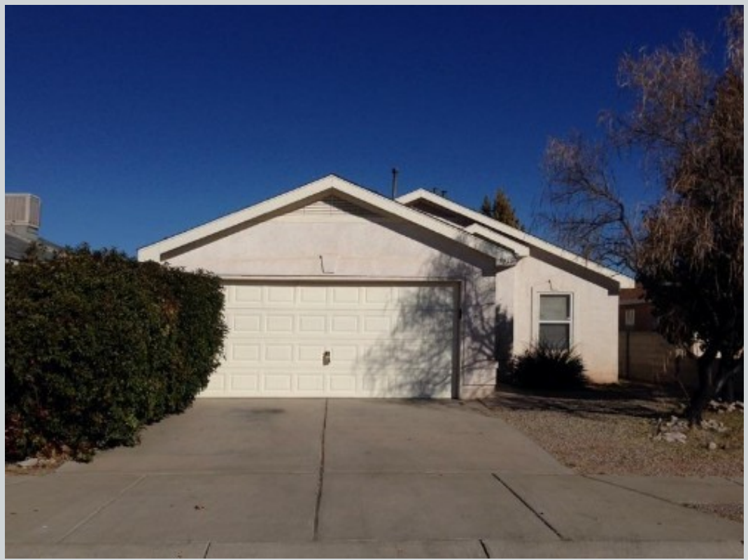
Subject 7919 Christopher Rd Sw