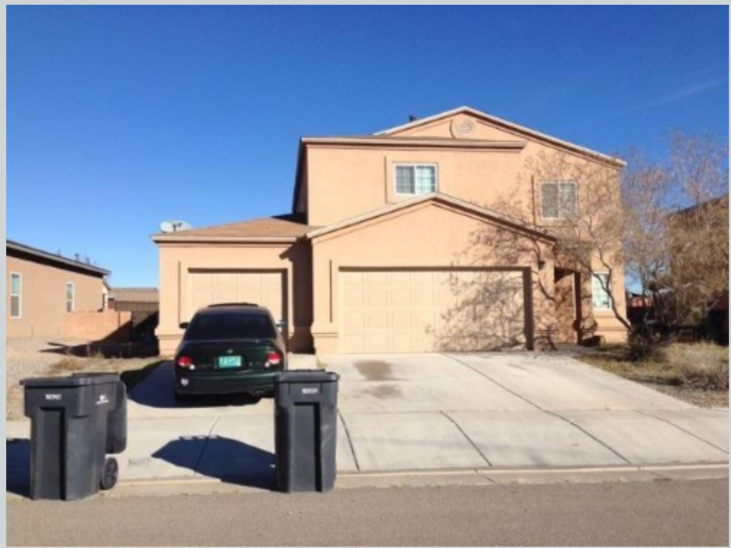
Subject 3125 Caliber Rd Sw