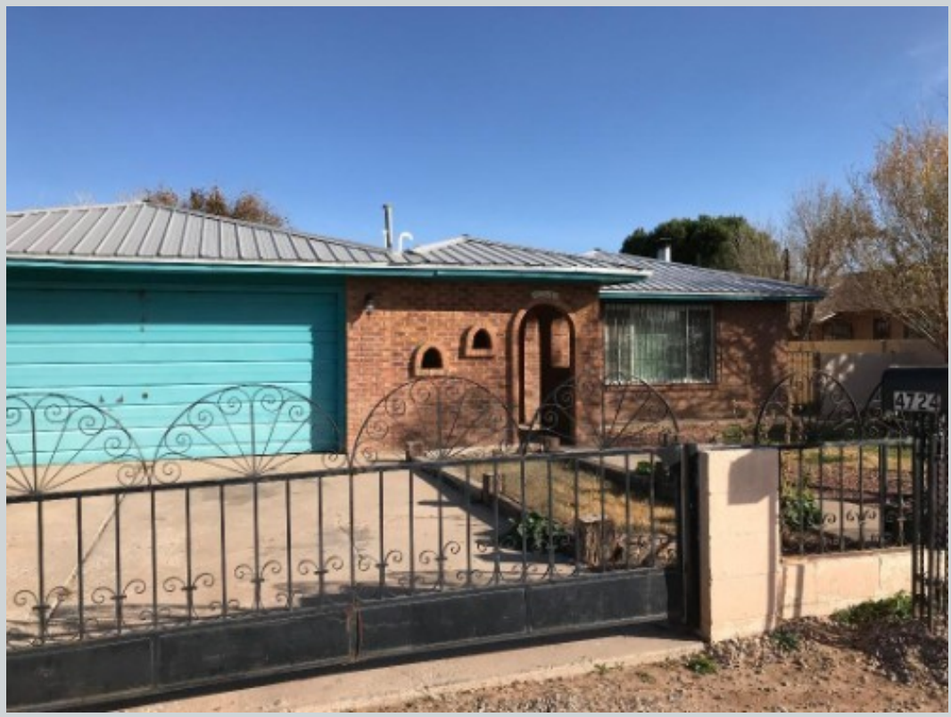
Sold Comp 2 8424 Llano Vista Ave Sw