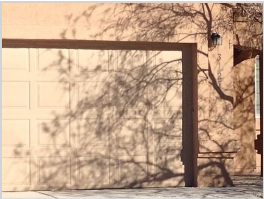
Subject 3125 Caliber Rd Sw