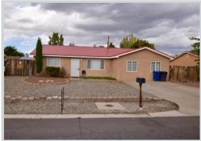
Listing Comp 2 2725 Desert Garden Ln Sw View Front