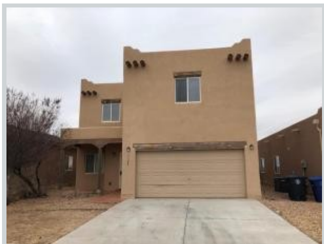
Sold Comp 3 3320 Mata Ortiz Dr Sw View Front