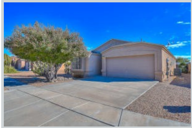
Listing Comp 3 3200 Mata Ortiz Dr Sw View Front