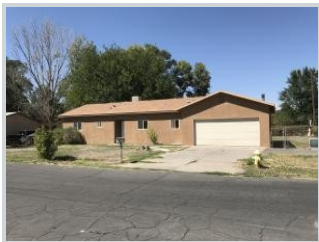
Listing Comp 1 4513 Sun Valley Dr Sw