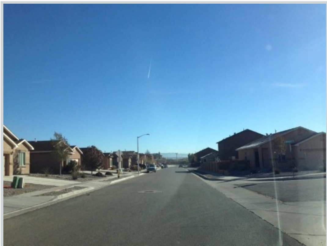
Subject 3125 Caliber Rd Sw

Address 3125 Caliber Road Sw, Albuquerque, NM 87121 Loan Number 36542 Suggested List $165,000 Suggested Repaired $165,000 Sale $162,000