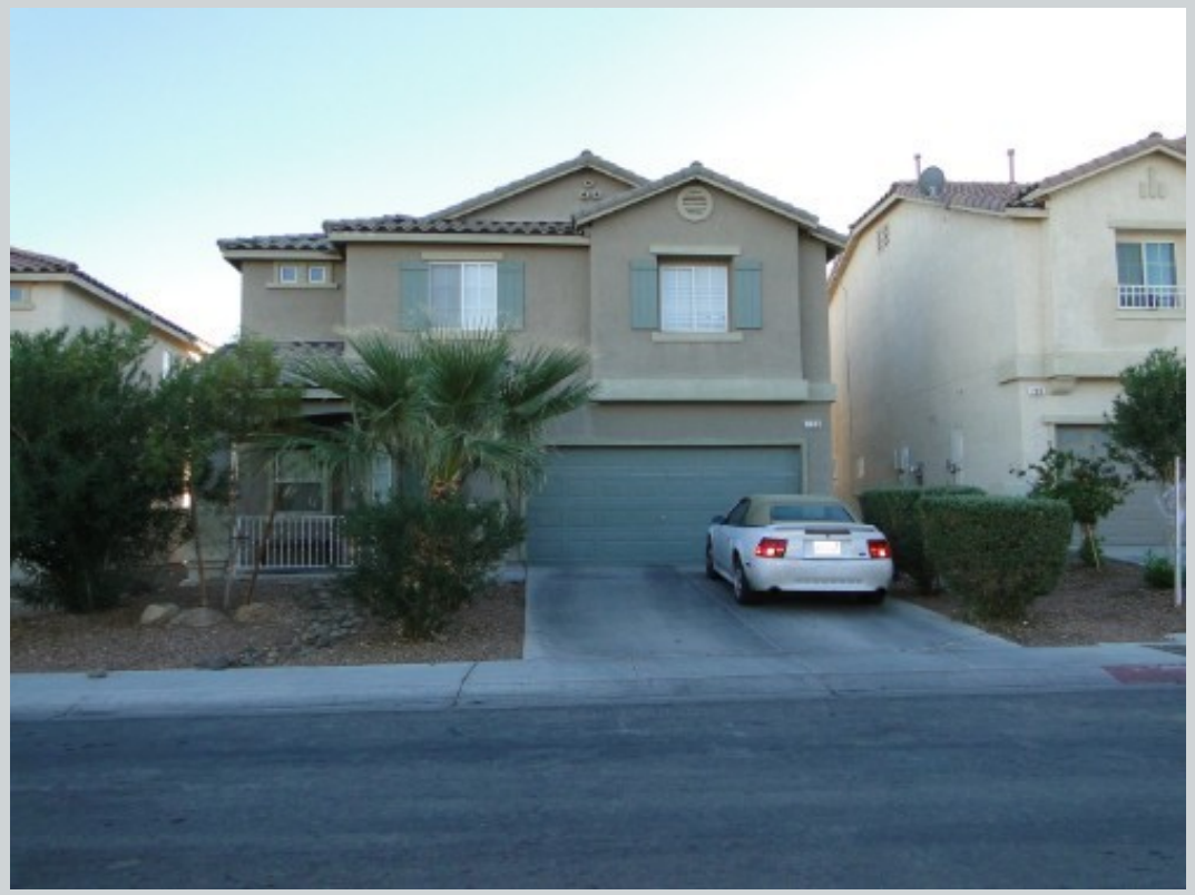
Subject 713 Cowboy Cross Ave