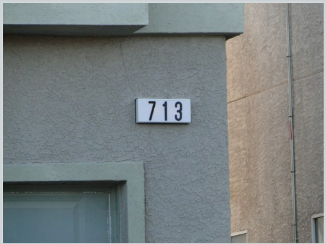
Subject 713 Cowboy Cross Ave