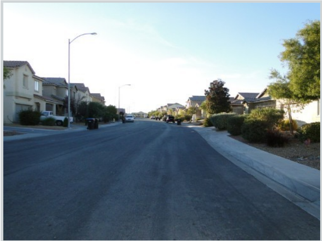
Subject 713 Cowboy Cross Ave