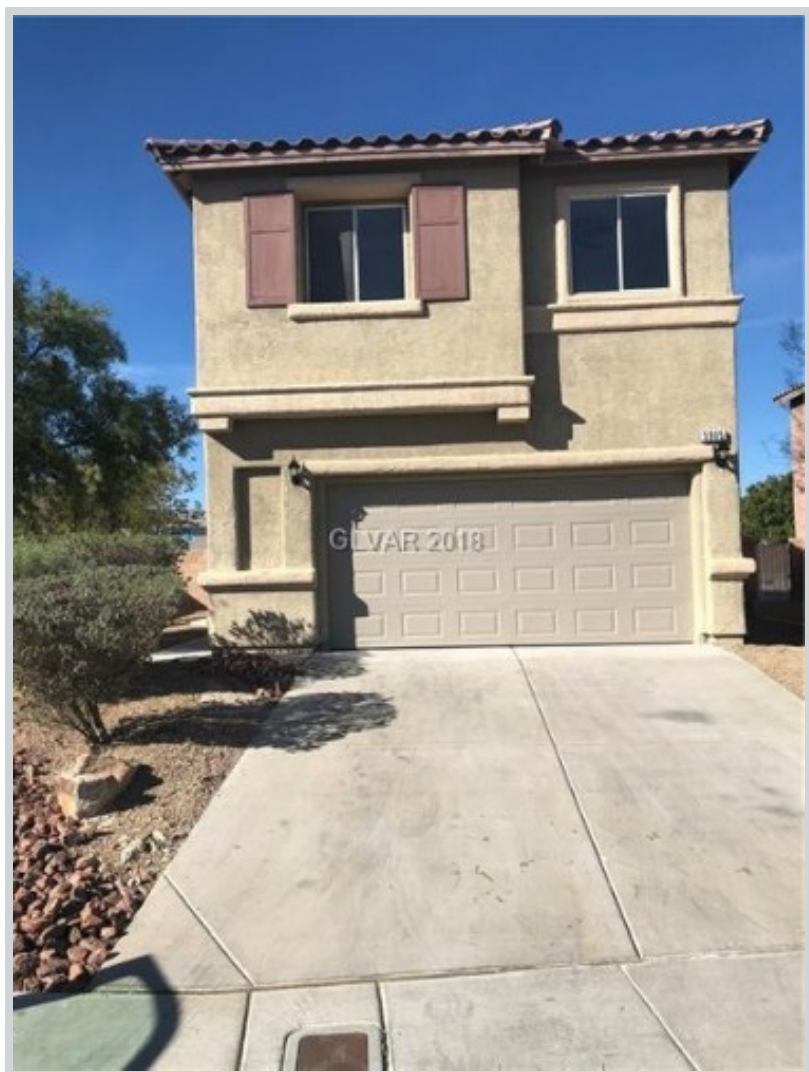
Listing Comp 3