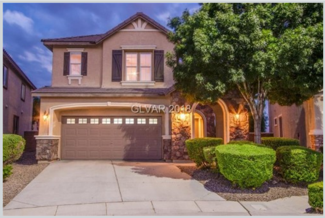
Sold Comp 3