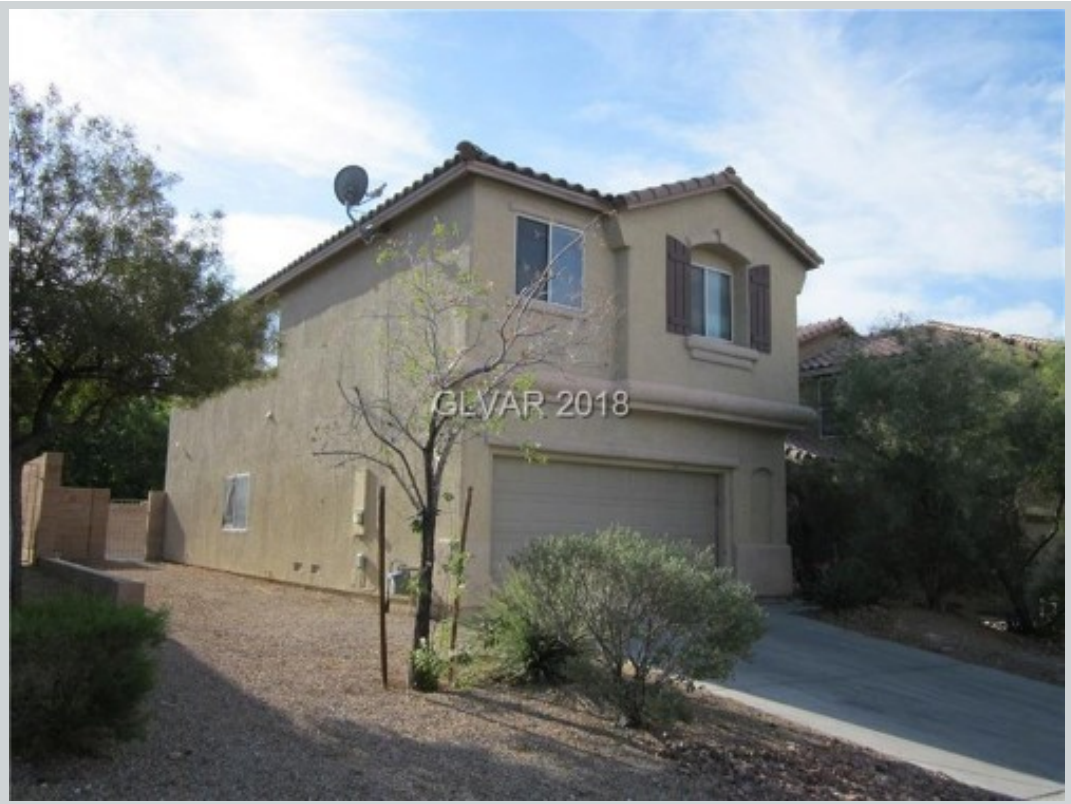
Sold Comp 2