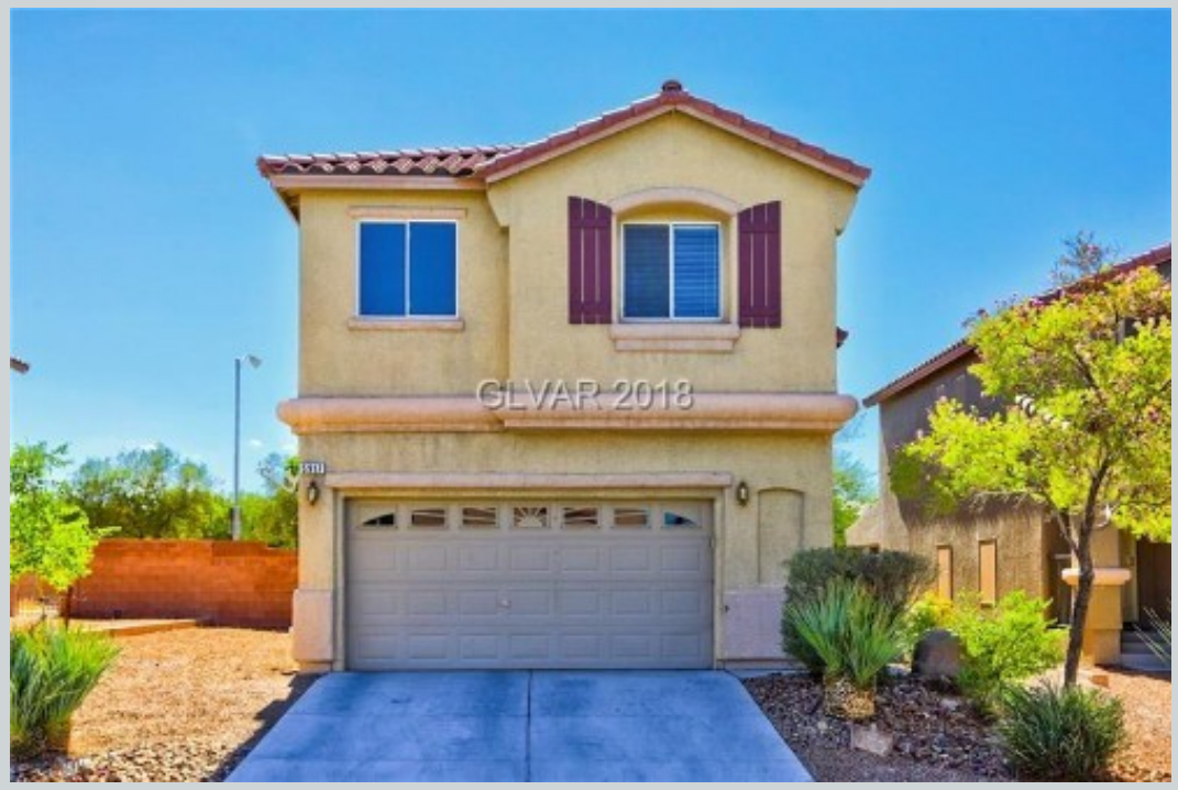
Sold Comp 1