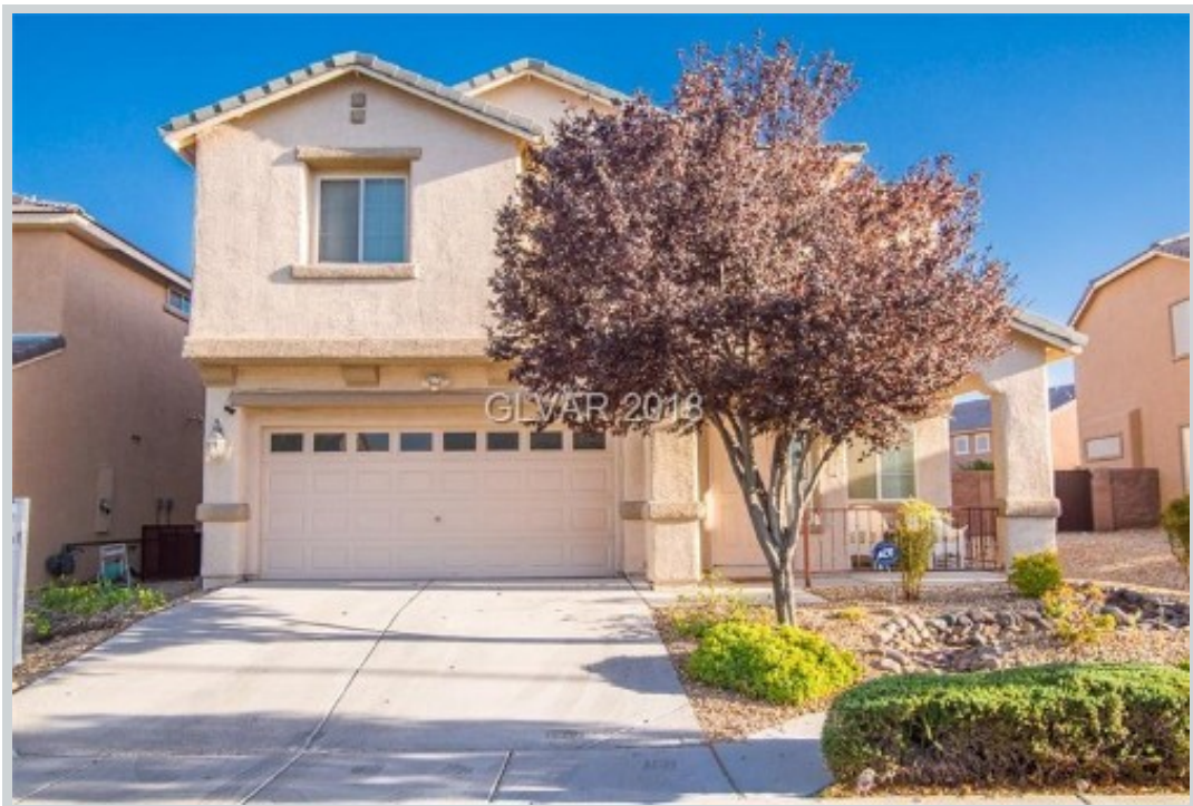
Listing Comp 2