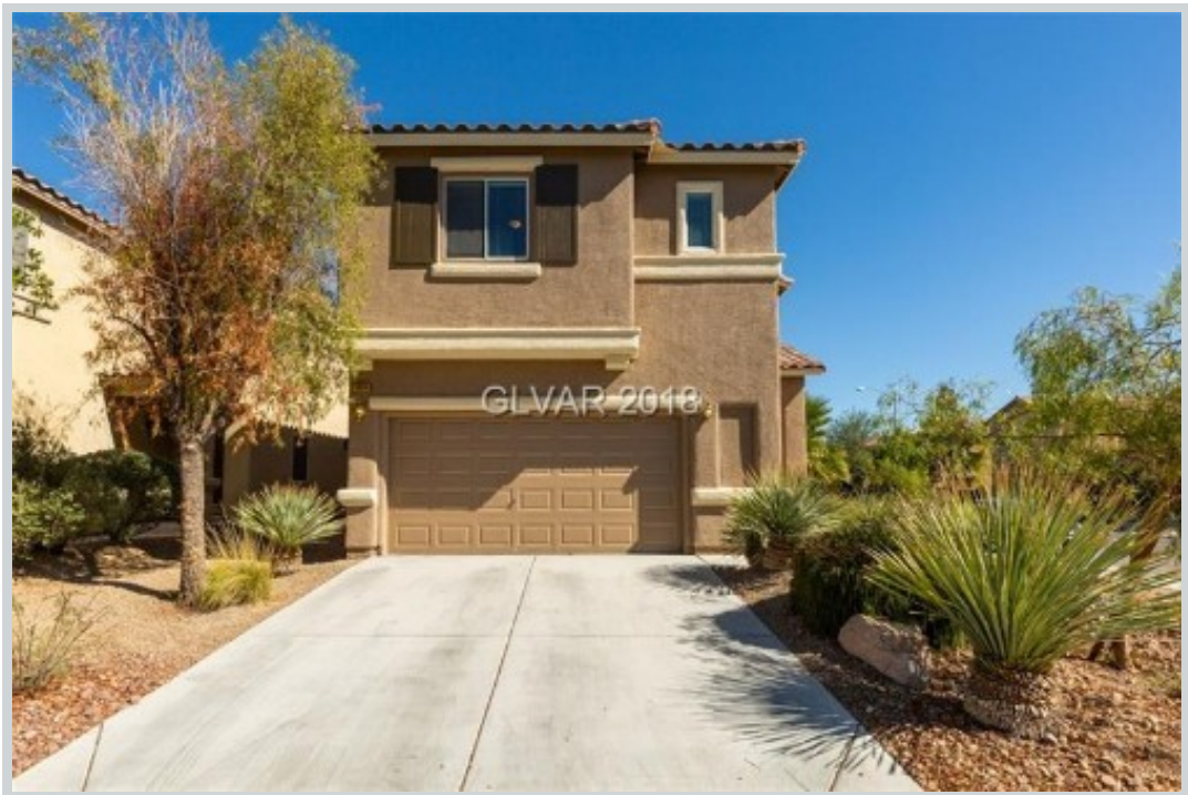
Listing Comp 1