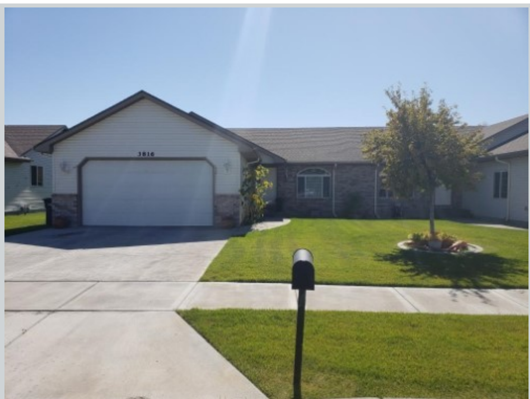
Listing Comp 3 3816 John Adams Parkway