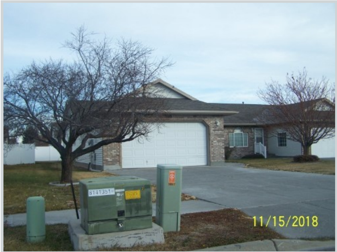
Subject 3079 Stoneridge Cir