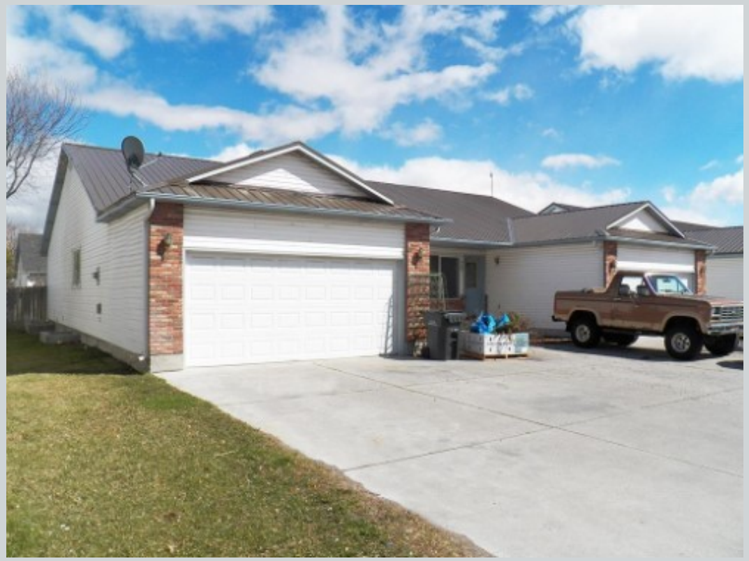
Sold Comp 1 710 N Woodruff Ave