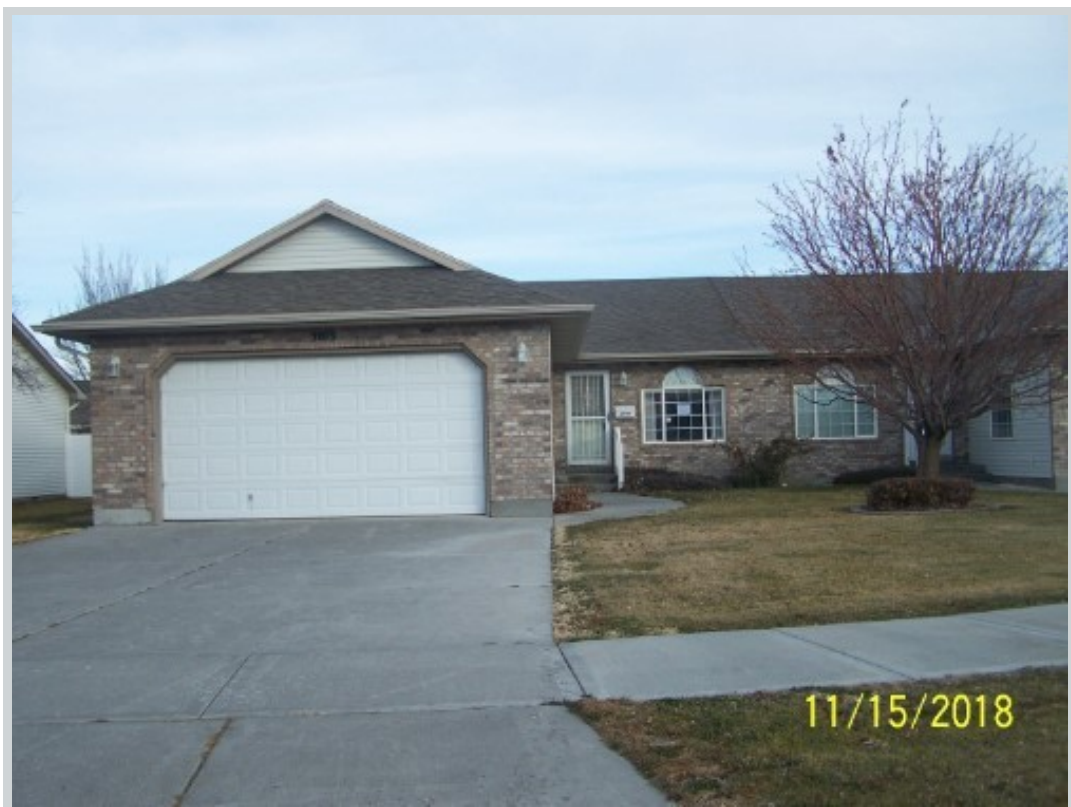
Subject 3079 Stoneridge Cir