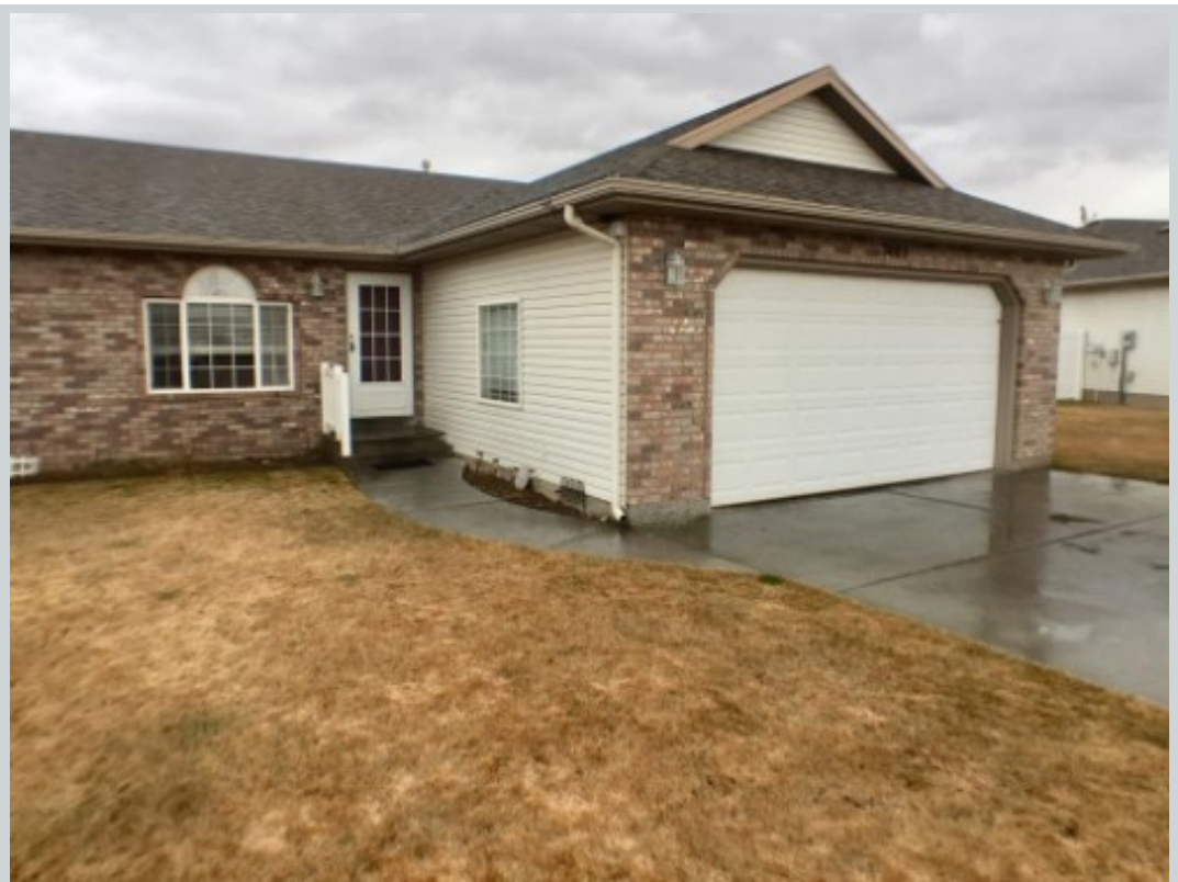
Sold Comp 2 3085 E Hearthstone Circle