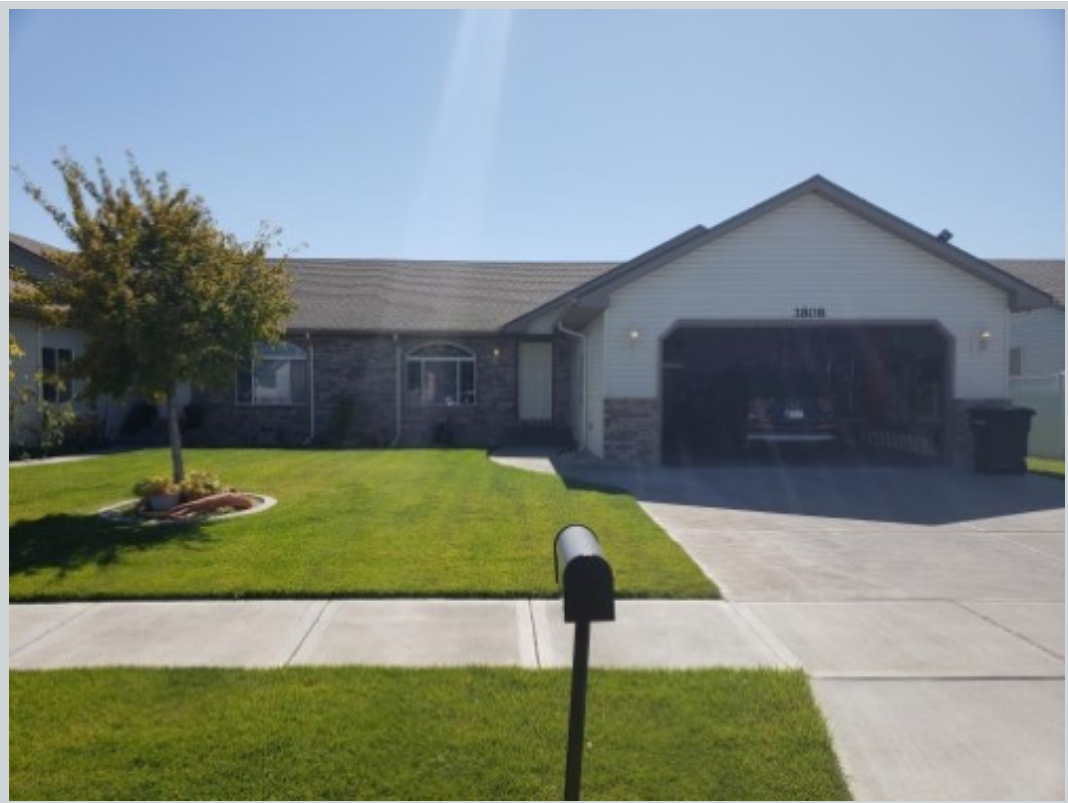
Listing Comp 2 3808 John Adams Parkway