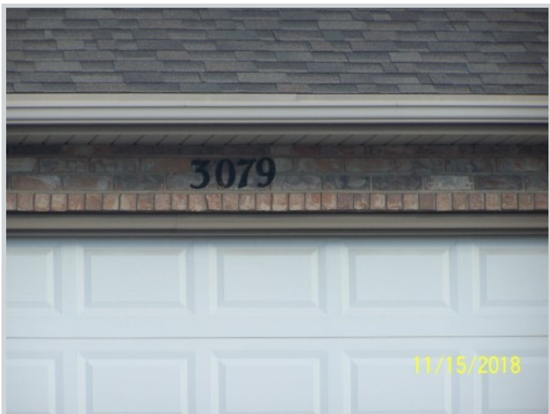
Subject 3079 Stoneridge Cir