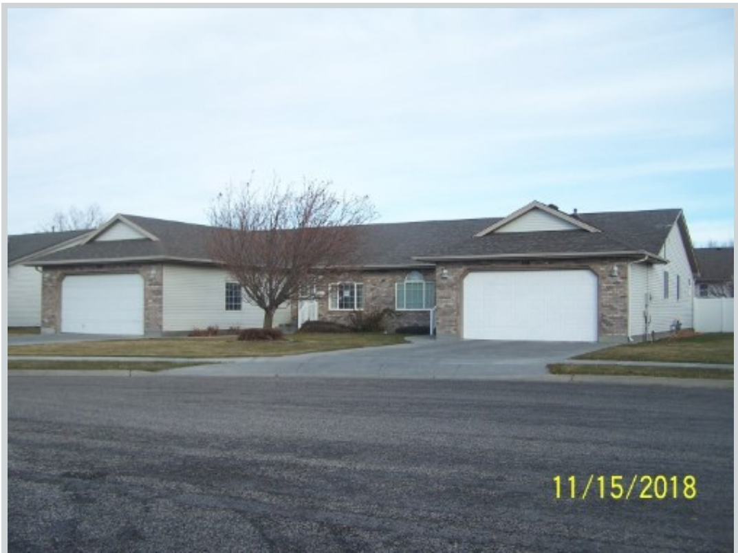
Subject 3079 Stoneridge Cir