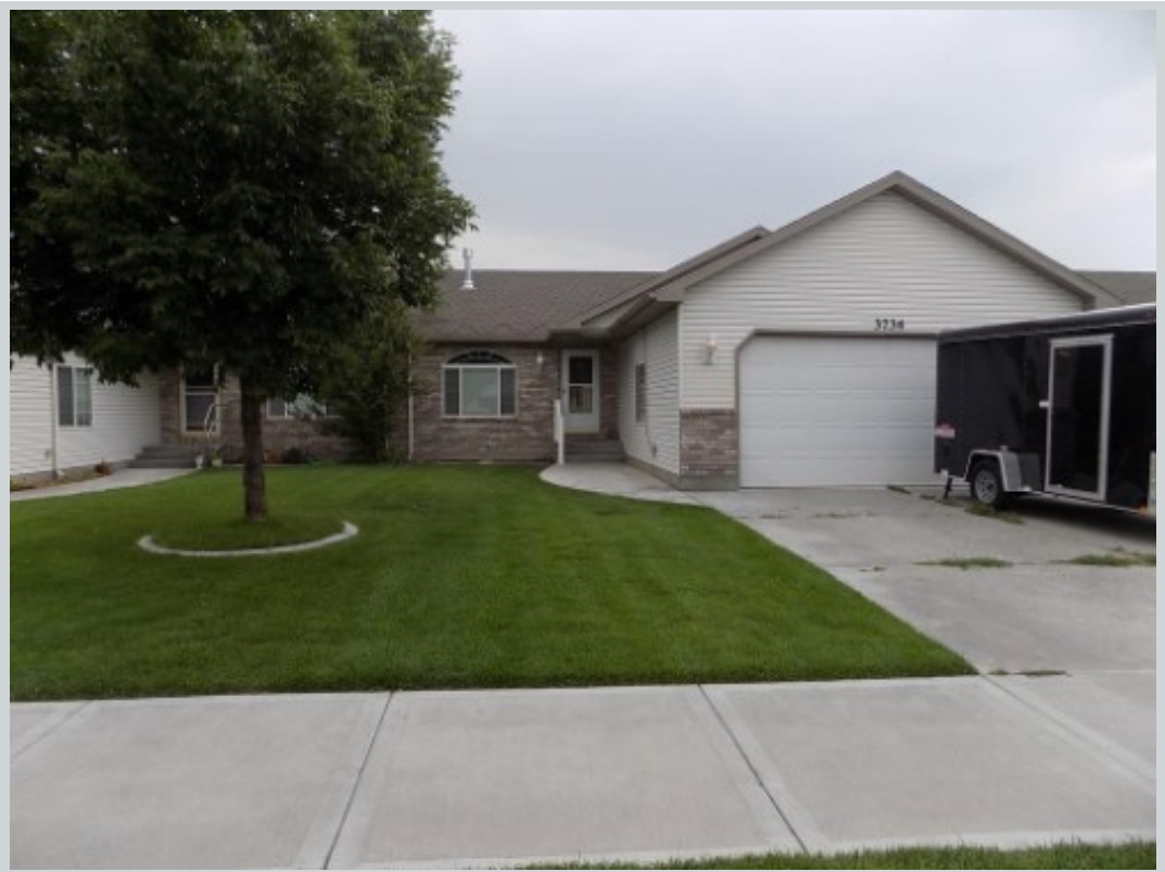
Sold Comp 3 3734 E John Adams Parkway