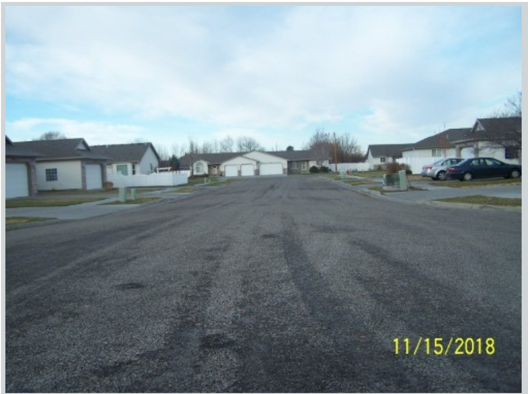
Subject 3079 Stoneridge Cir

Address 3079 Stoneridge Circle, Ammon, ID 83406 Loan Number 36545 Suggested List $165,000 Suggested Repaired $165,000 Sale $160,000