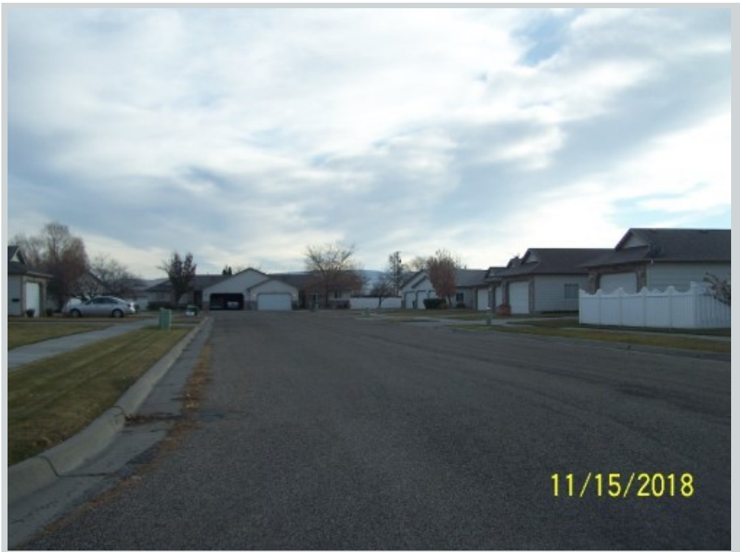
Subject 3079 Stoneridge Cir