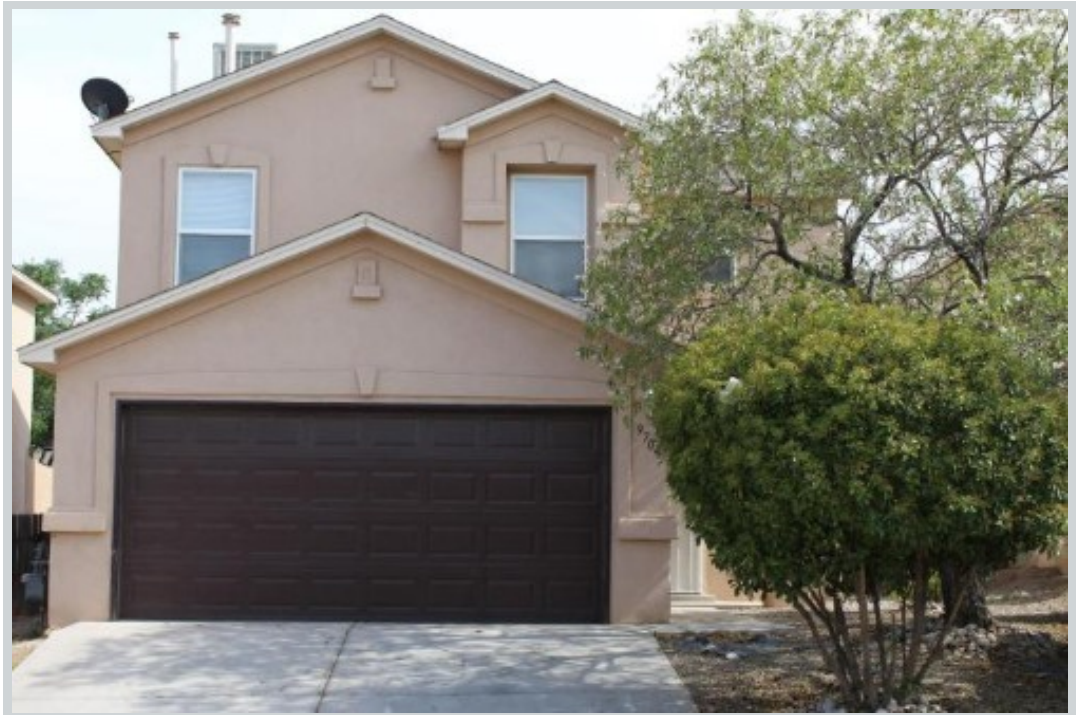
Sold Comp 1 9704 Desert Mesa Rd Sw View Front