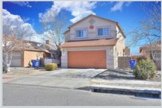
Sold Comp 2 444 Evening Fire St Sw View Front