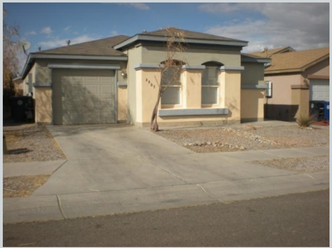
Sold Comp 3 8905 Dakota Ridge Rd Sw