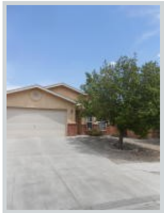
Listing Comp 2 9509 Tristani Rd Sw View Front