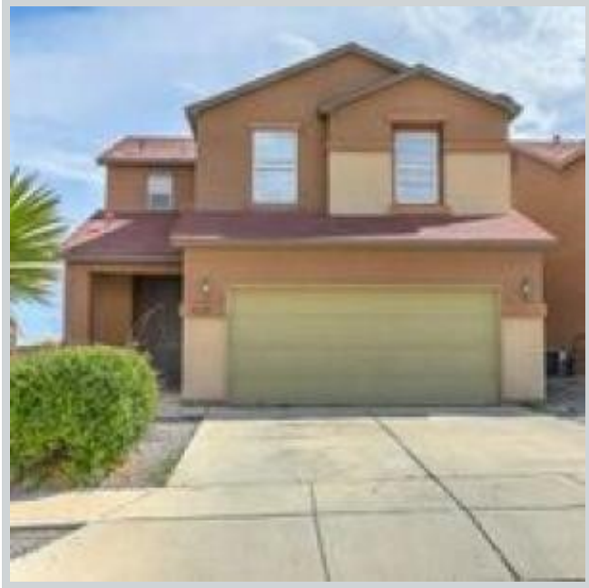
Listing Comp 3 8628 Tradewind Rd Nw View Front