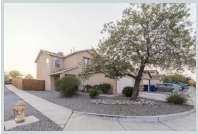
Listing Comp 1 439 Desert Rock Dr Sw View Front