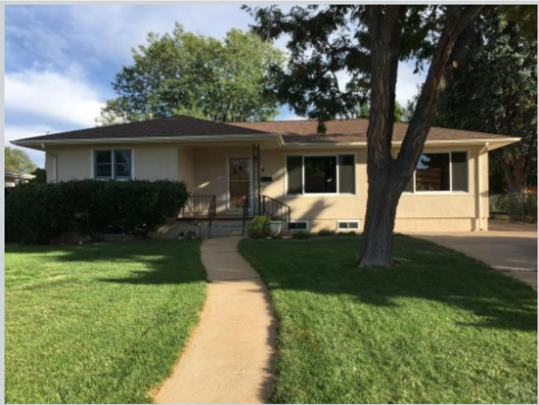
Listing Comp 3 38 Duke