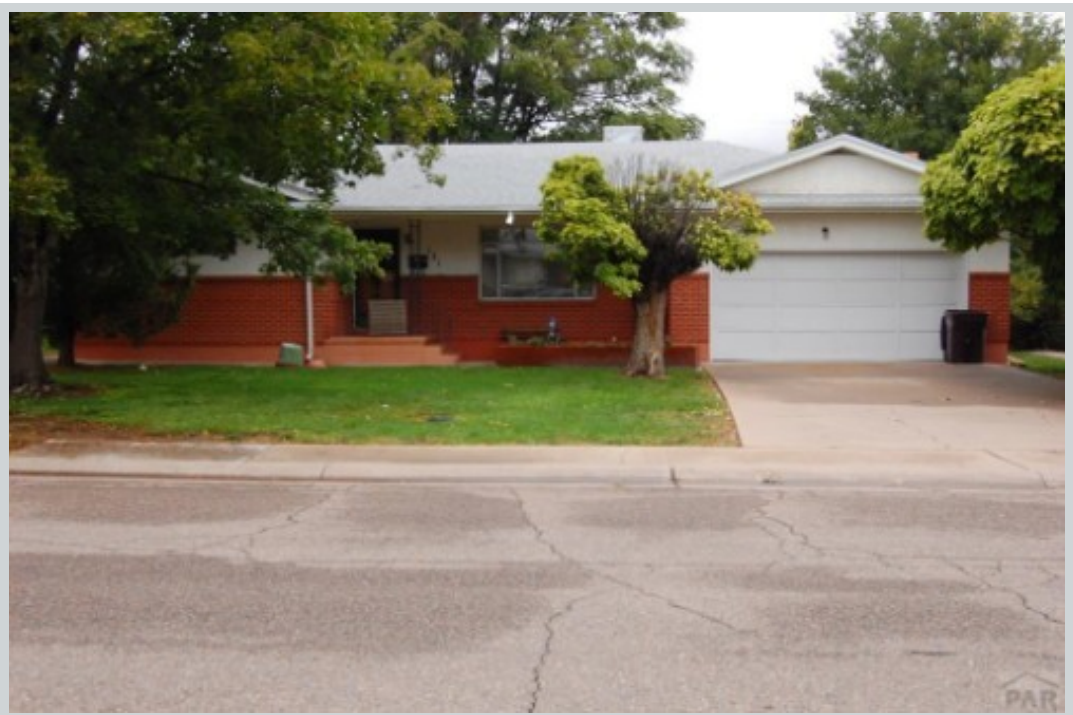
Listing Comp 2 131 Baylor