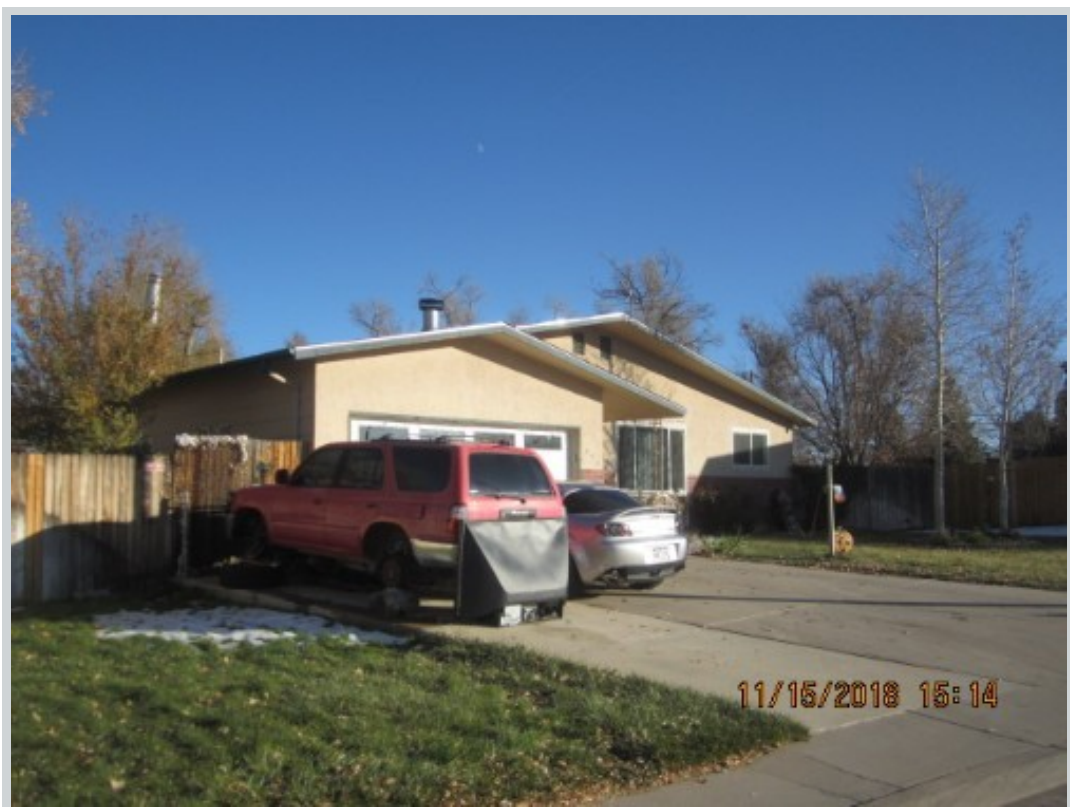
Subject 820 Alpine Ave