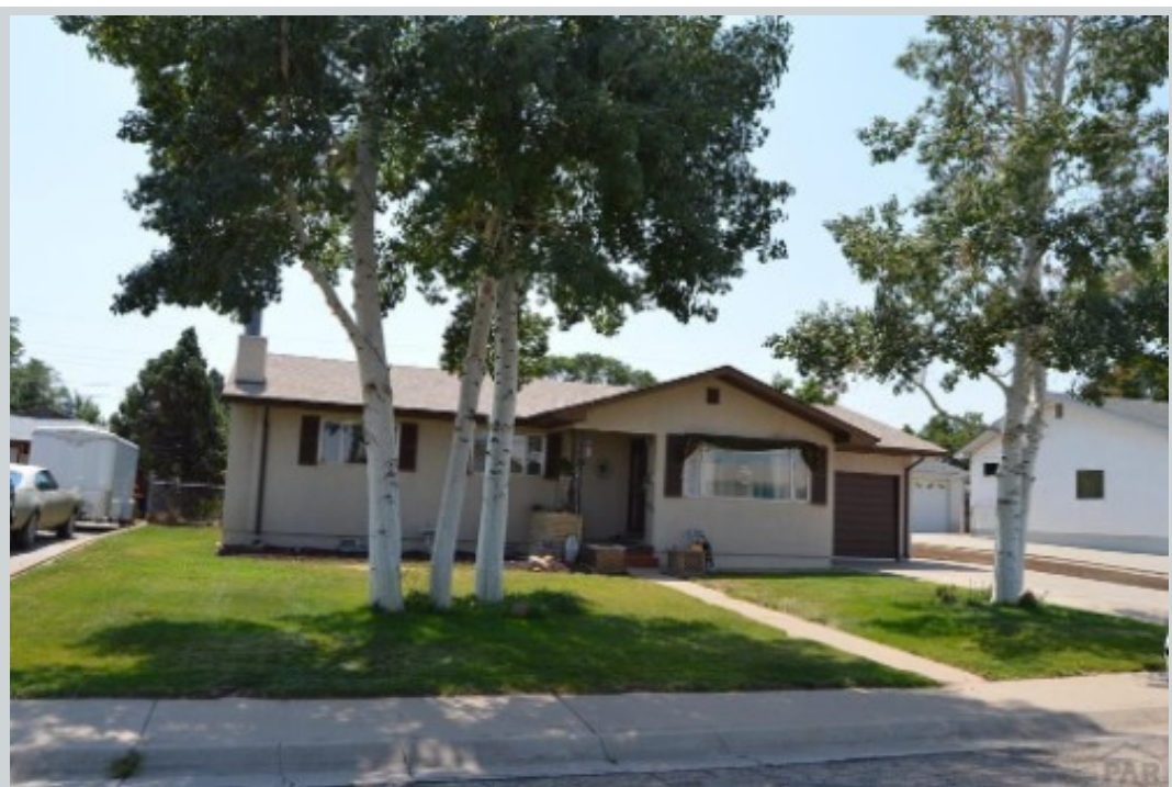
Sold Comp 3 76 Drake