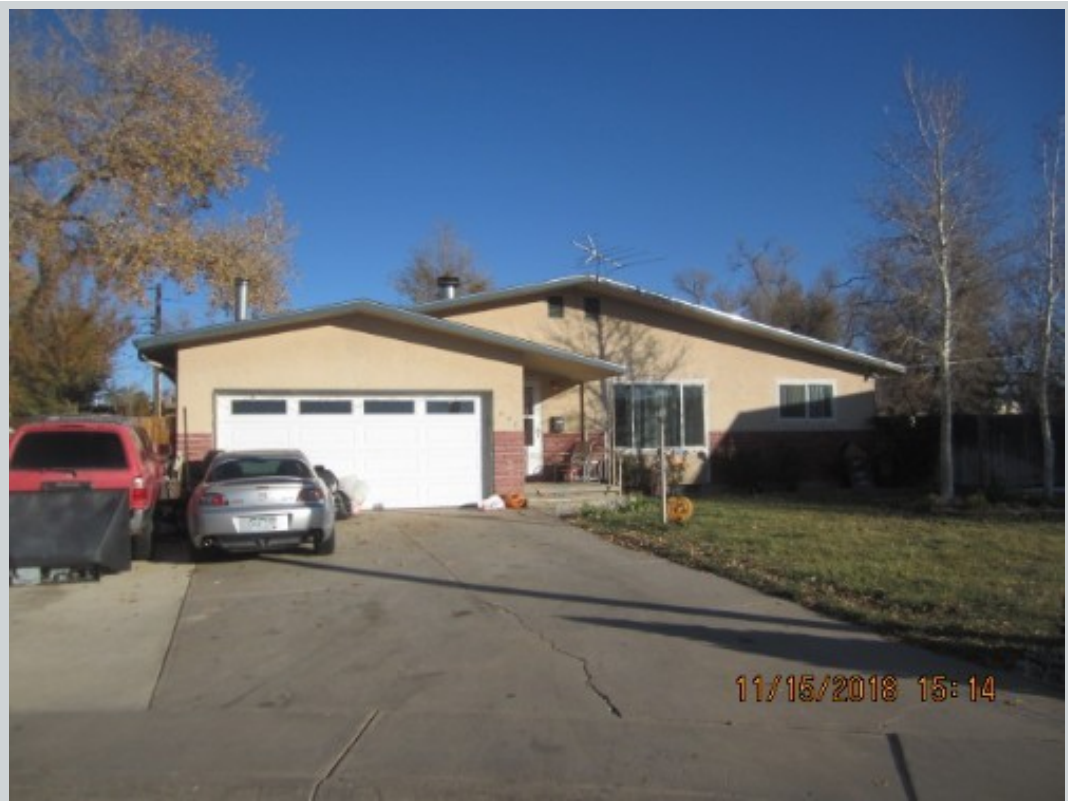
Subject 820 Alpine Ave