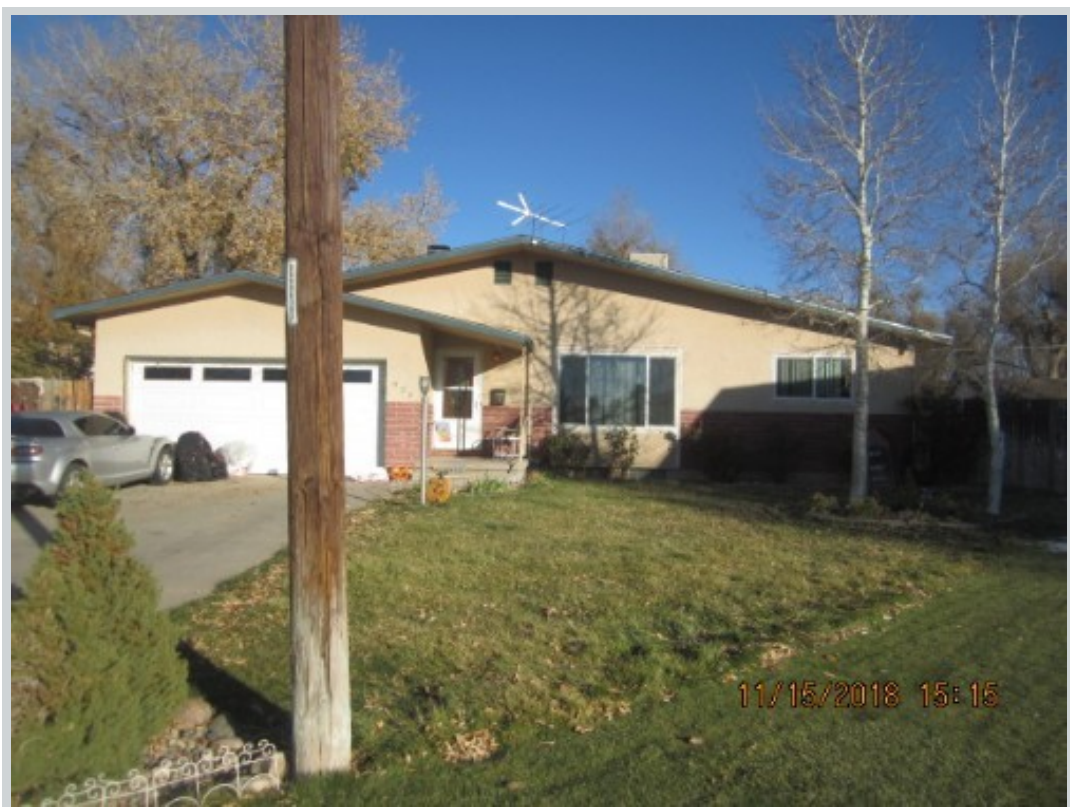
Subject 820 Alpine Ave

Address 820 Alpine Avenue, Pueblo, CO 81005 Loan Number 36555 Suggested List $197,900 Suggested Repaired $197,900 Sale $195,000