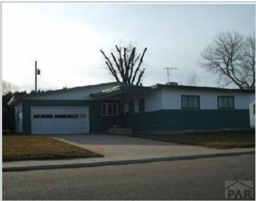
Sold Comp 1 72 Baylor