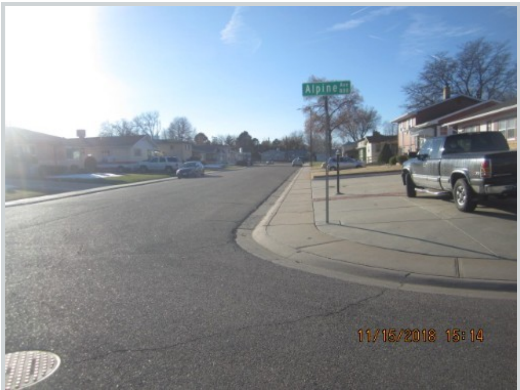
Subject 820 Alpine Ave