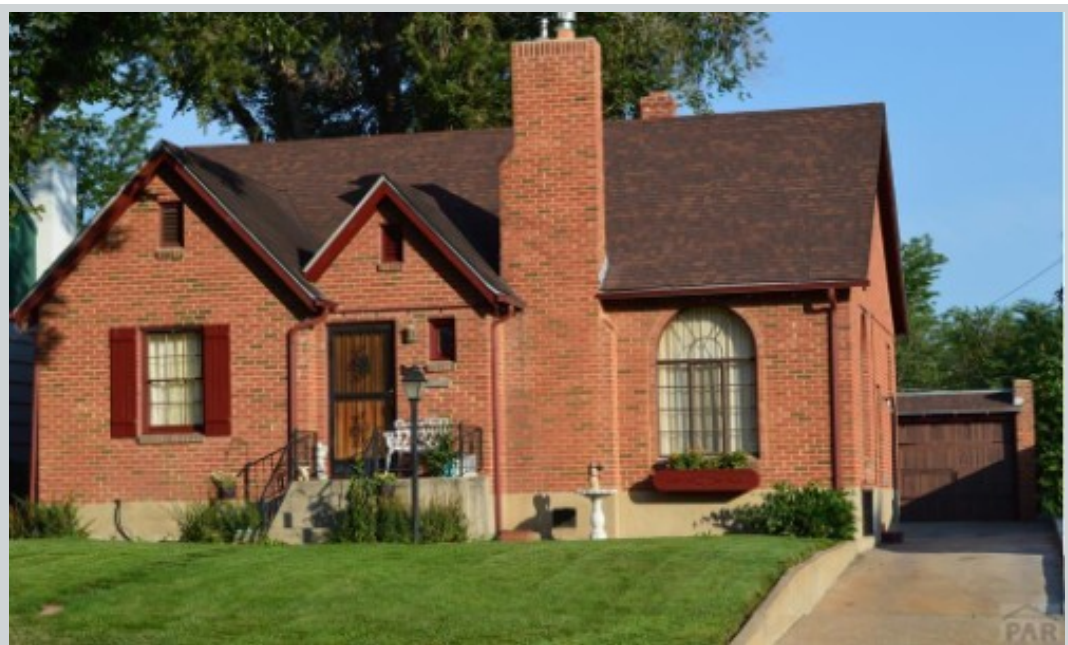
Sold Comp 2 515 Tyler

Address 820 Alpine Avenue, Pueblo, CO 81005 Loan Number 36555 Suggested List $197,900 Suggested Repaired $197,900 Sale $195,000