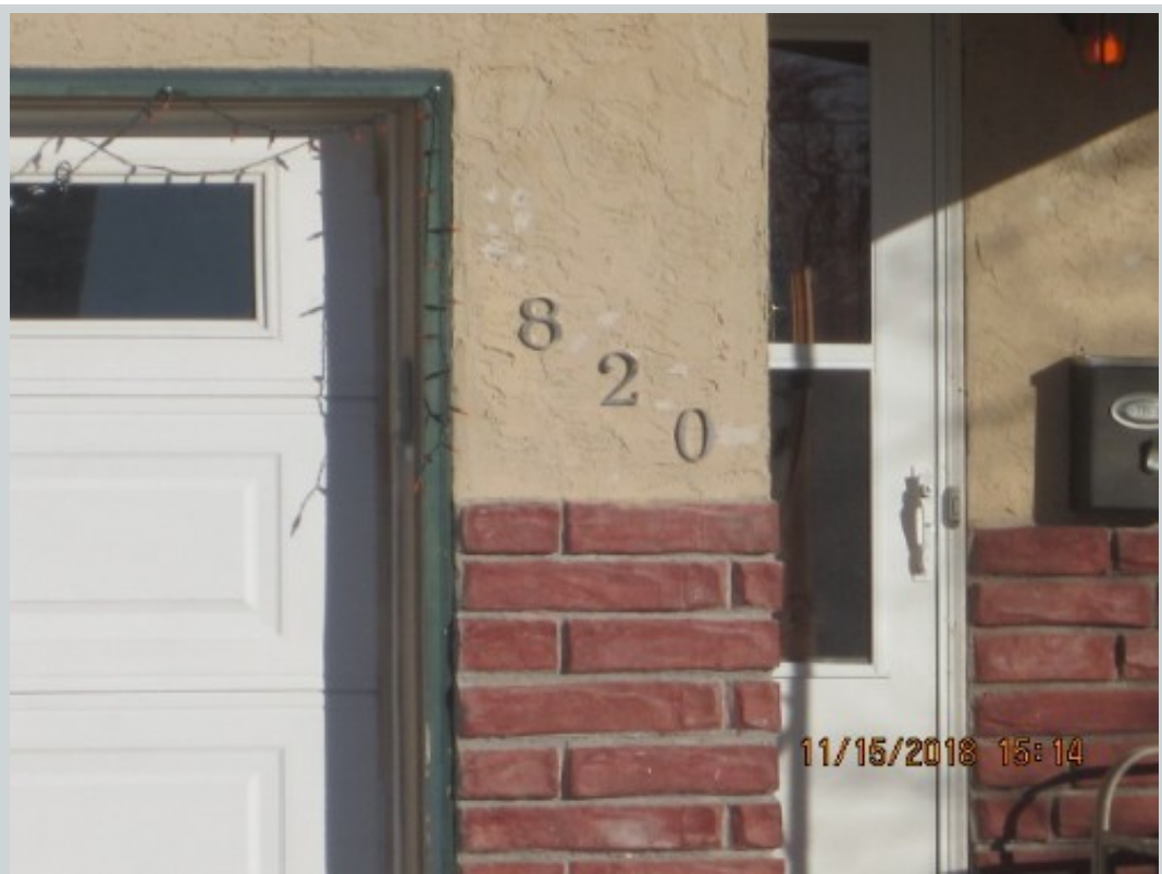
Subject 820 Alpine Ave