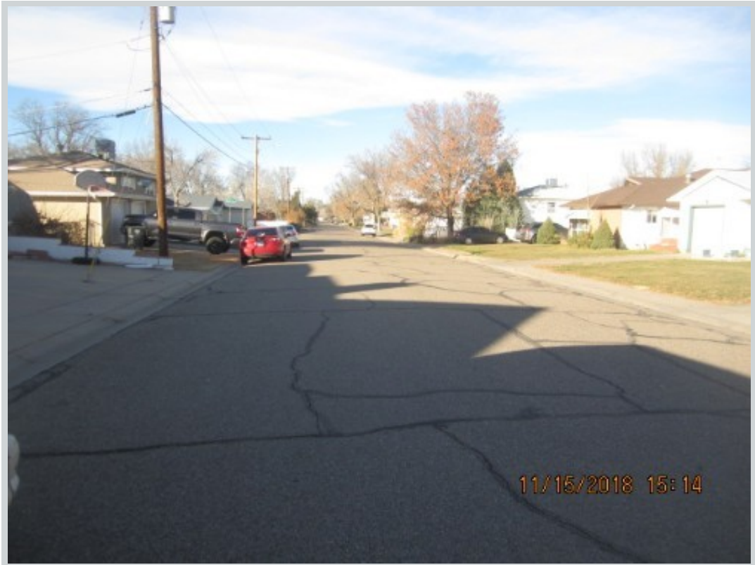
Subject 820 Alpine Ave