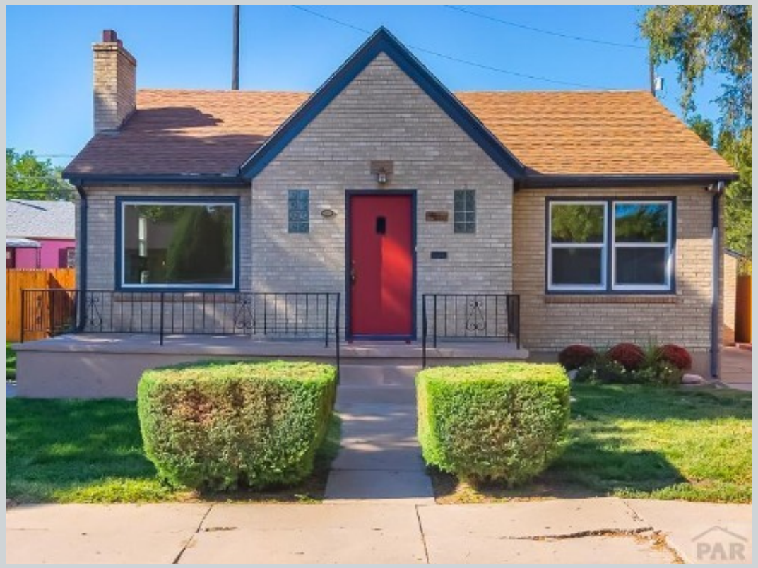
Listing Comp 1 102 W Adams