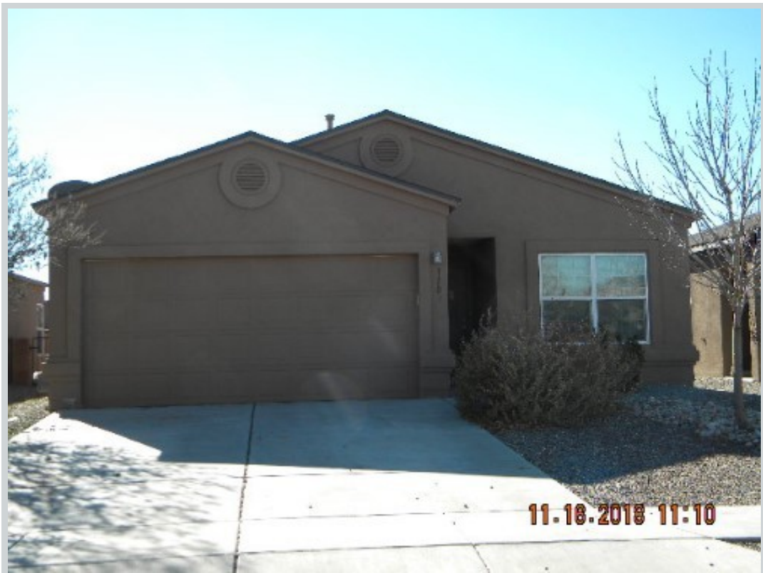
Subject 1102 Desert Sunflower Dr Ne