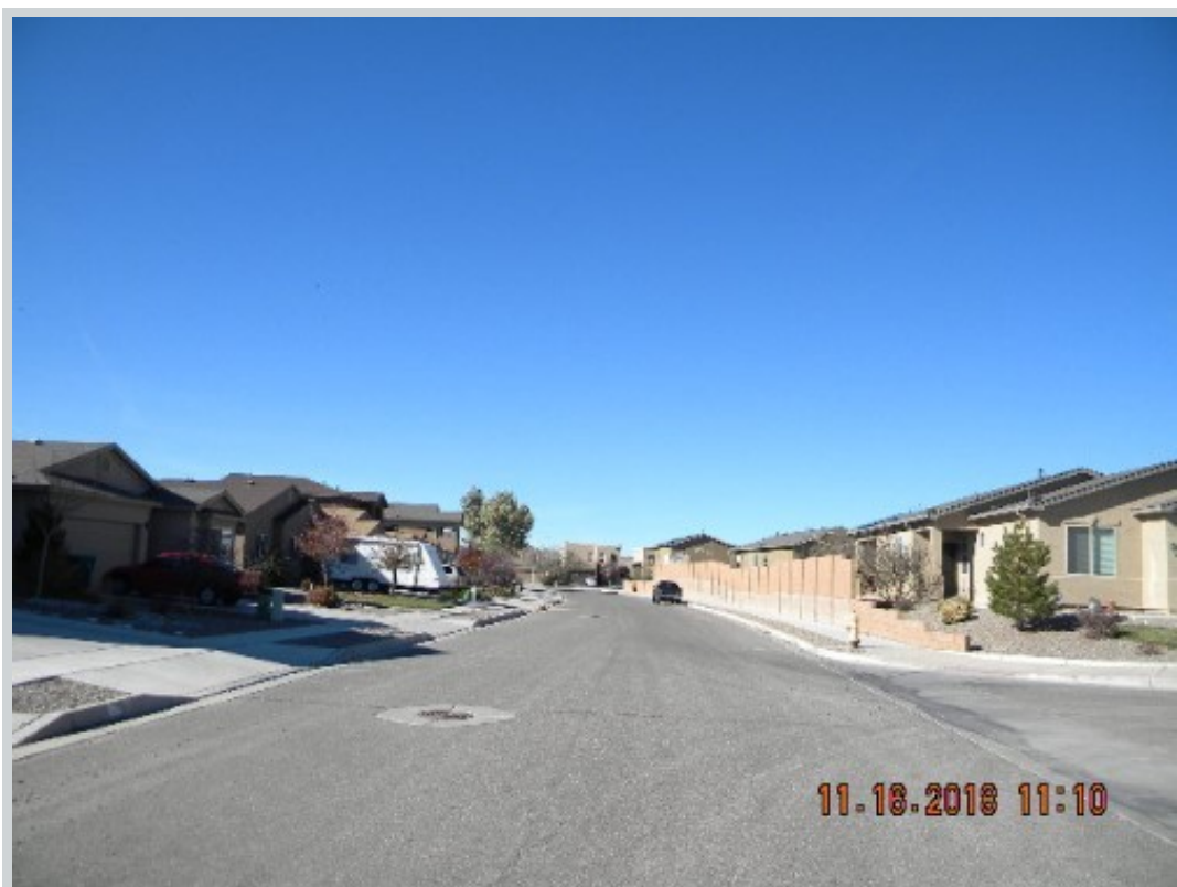
Subject 1102 Desert Sunflower Dr Ne View Street Comment "Street – West"