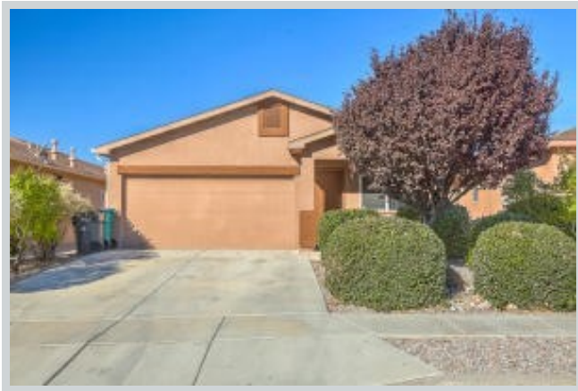
Listing Comp 1 3707 Ocotillo Dr Ne View Front

Address 1102 Desert Sunflower Drive, Rio Rancho, NM 87144 Loan Number 36563 Suggested List $148,000 Suggested Repaired $148,000 Sale $145,000