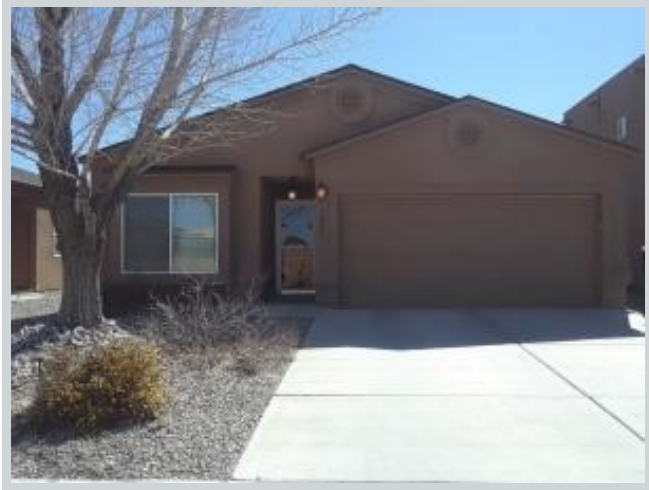
Sold Comp 2 1006 Desert Sunflower Dr Ne View Front