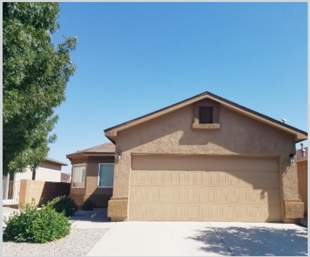
Sold Comp 1 3760 Clear Creek Rd Ne