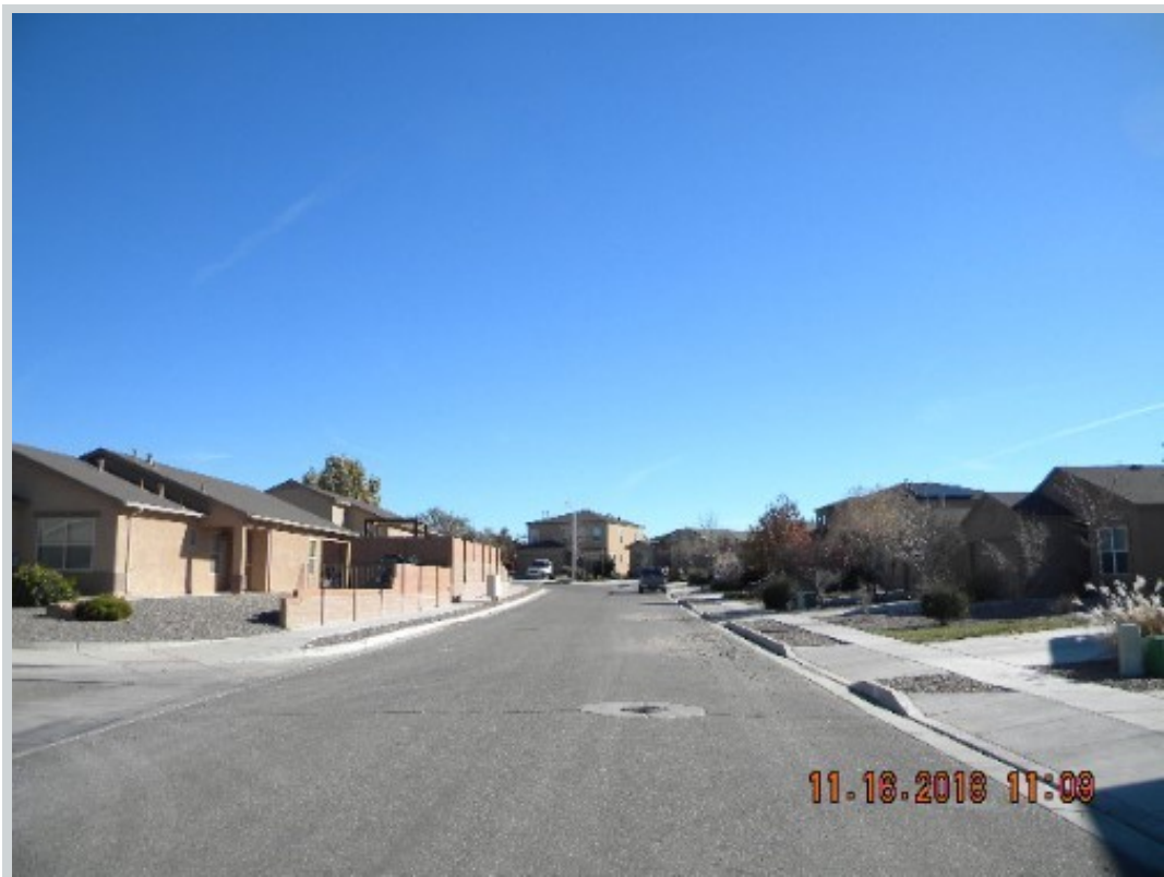
Subject 1102 Desert Sunflower Dr Ne View Street Comment "Street – East"

Address 1102 Desert Sunflower Drive, Rio Rancho, NM 87144 Loan Number 36563 Suggested List $148,000 Suggested Repaired $148,000 Sale $145,000