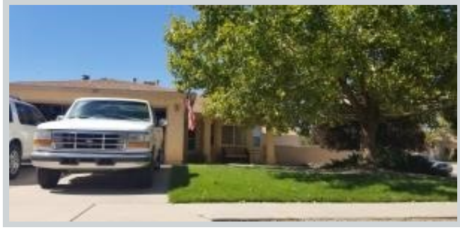
Listing Comp 3 3105 Mason Meadows Dr Ne View Front