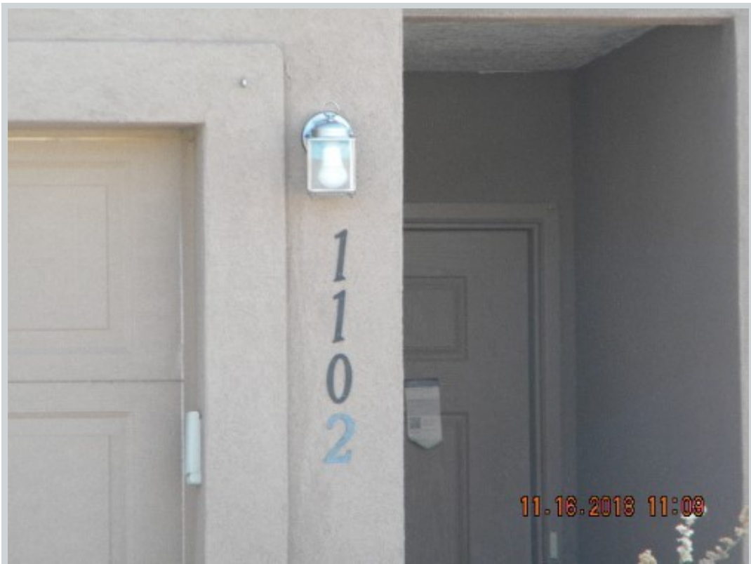
Subject 1102 Desert Sunflower Dr Ne