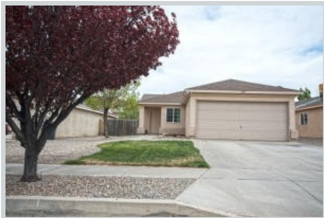
Listing Comp 2 604 Valley Meadows Dr Ne View Front