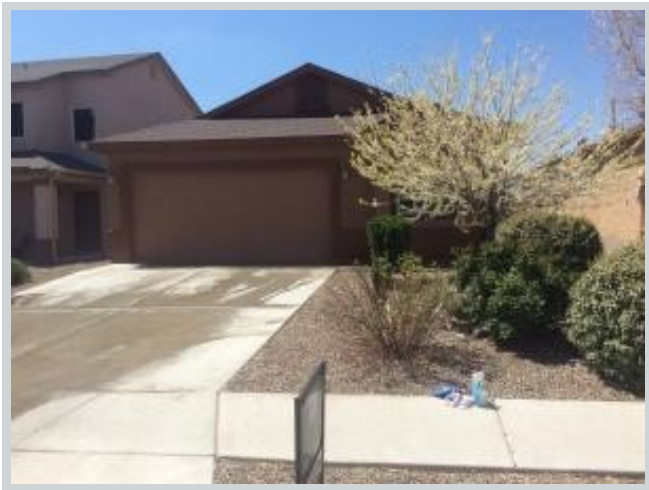
Sold Comp 3 904 Waterfall Dr Ne View Front