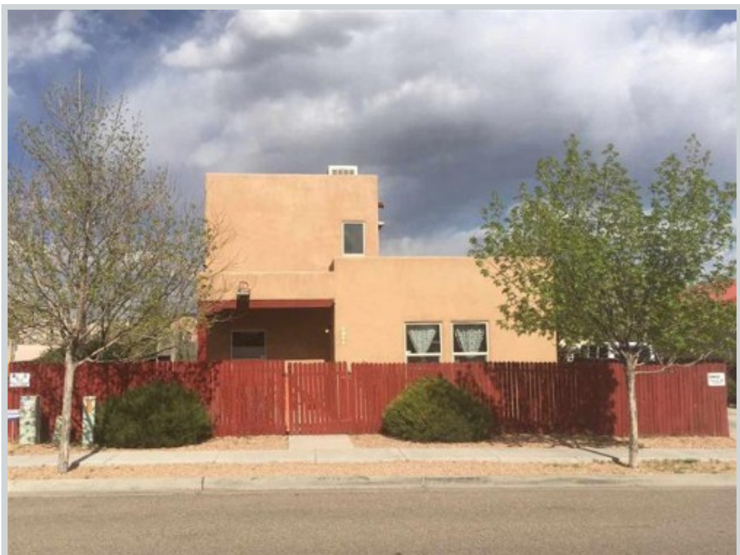
Sold Comp 1 4741 Vista Del Sol View Front