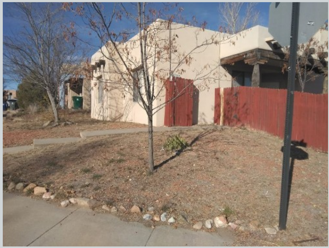
Subject 4037 Los Milagros