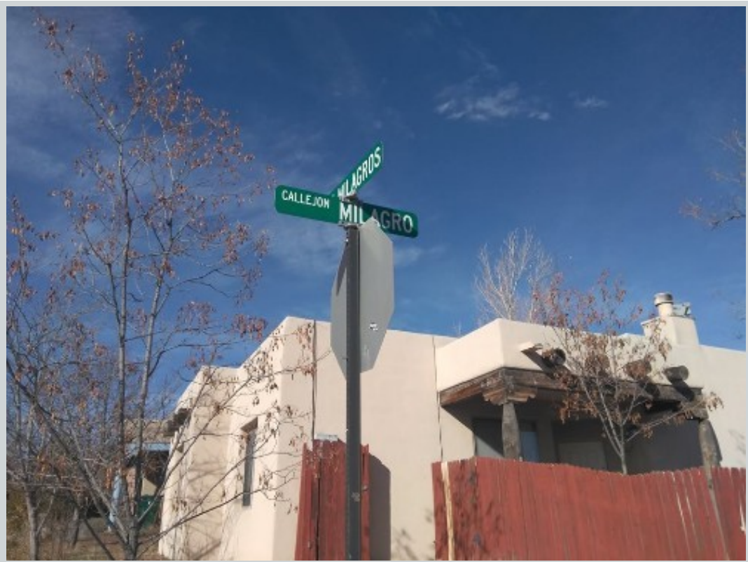
Subject 4037 Los Milagros