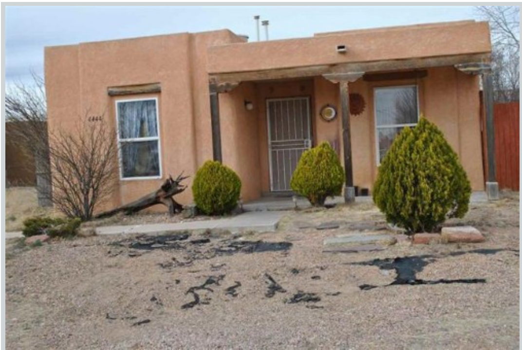
Listing Comp 3 7133 Calle Jenah View Front

Address 4037 Los Milagros, Santa Fe, NM 87507 Loan Number 36565 Suggested List $245,000 Suggested Repaired $245,000 Sale $240,000