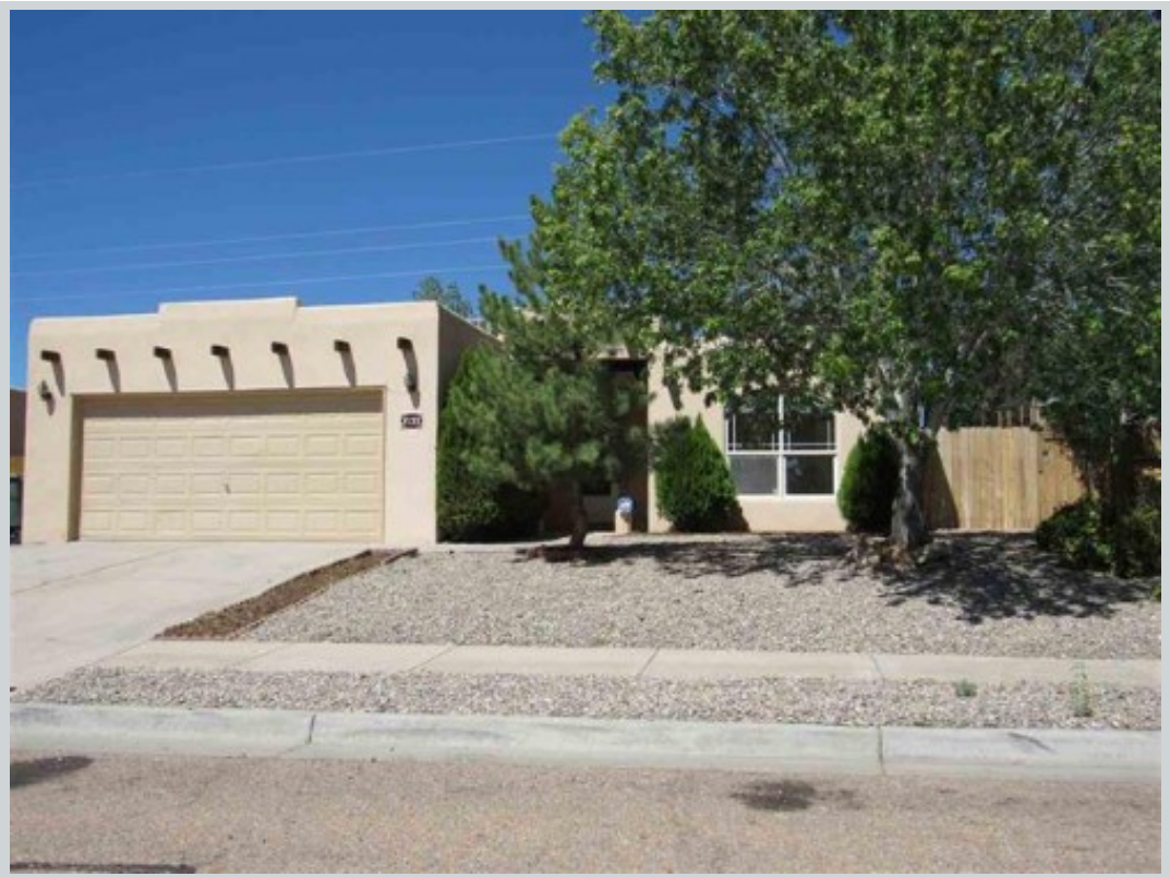
Listing Comp 3 7133 Calle Jenah