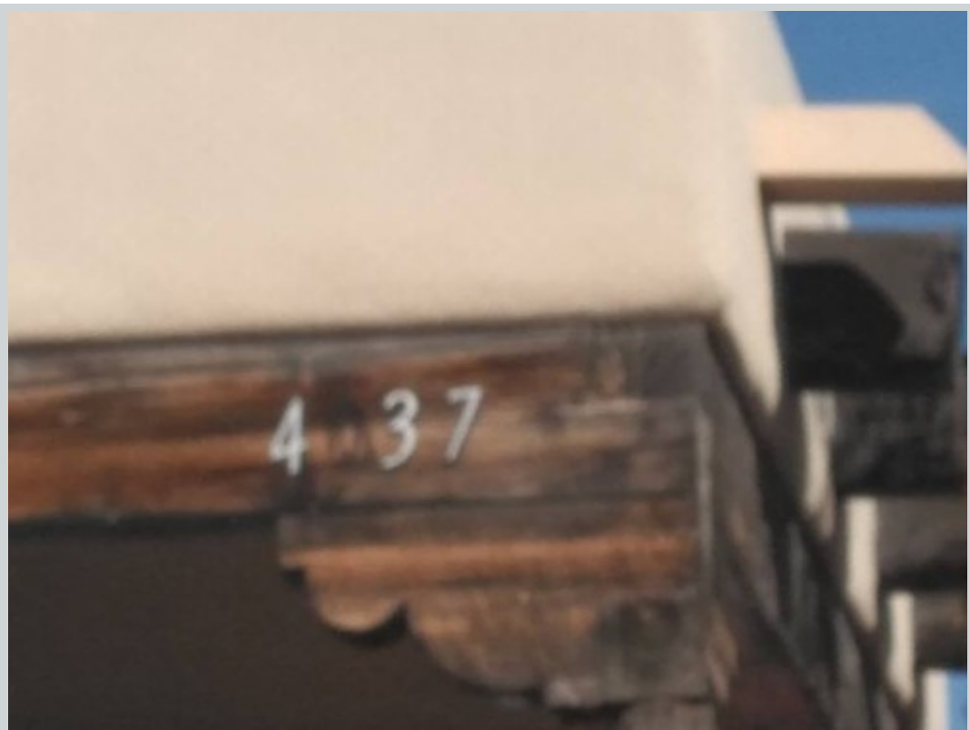
Subject 4037 Los Milagros