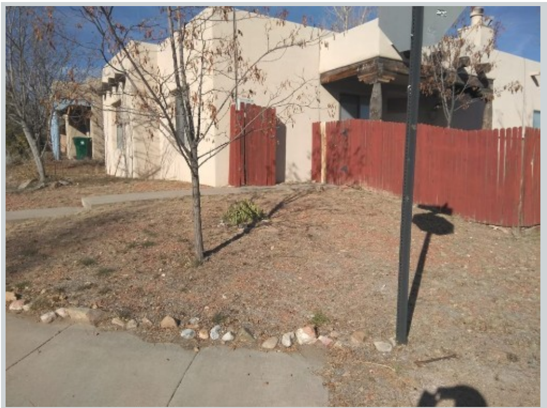
Subject 4037 Los Milagros