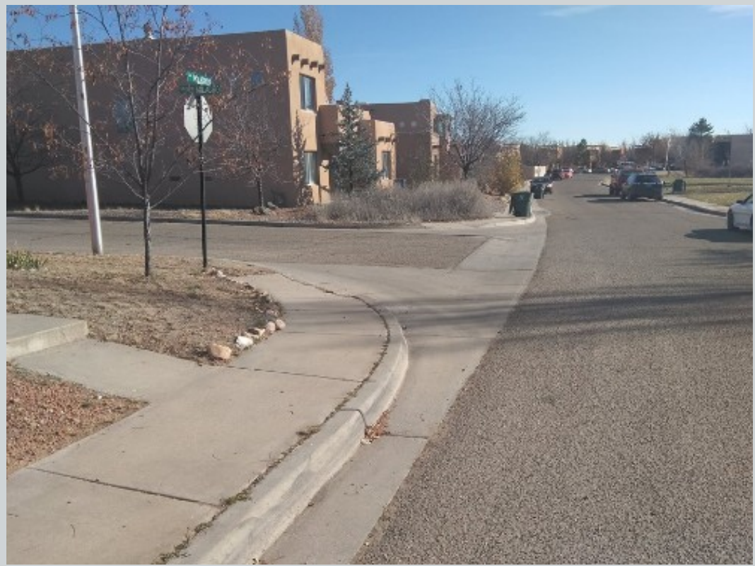
Subject 4037 Los Milagros