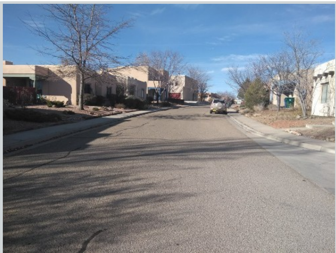
Subject 4037 Los Milagros