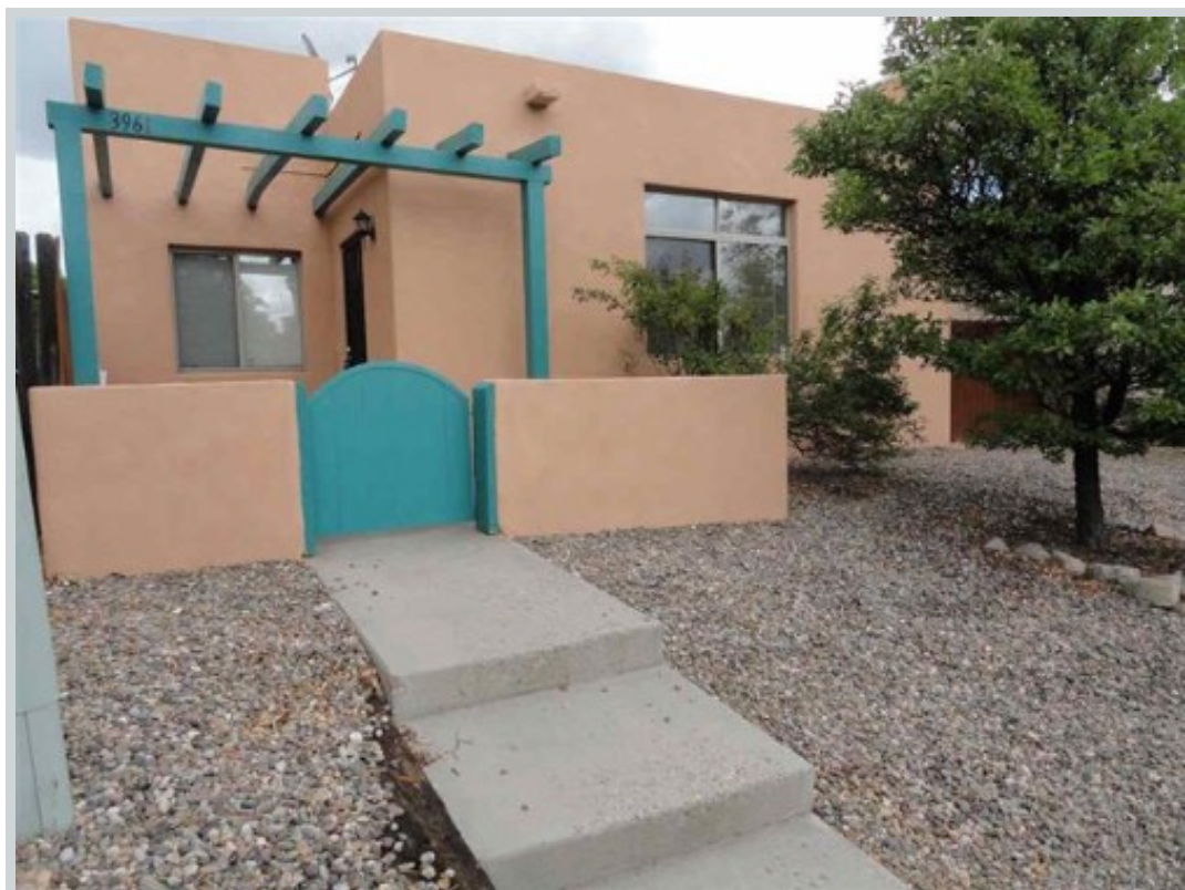
Sold Comp 3 3961 Los Milagros