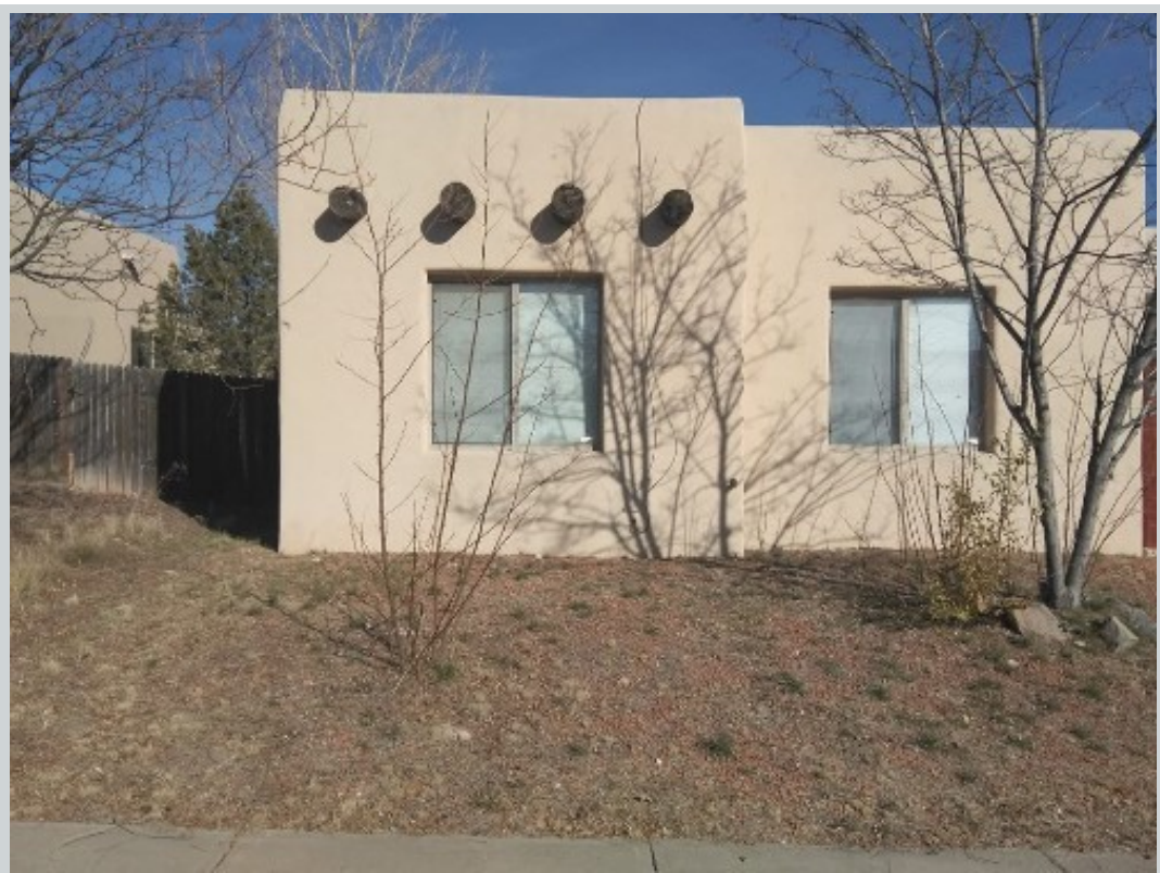
Subject 4037 Los Milagros