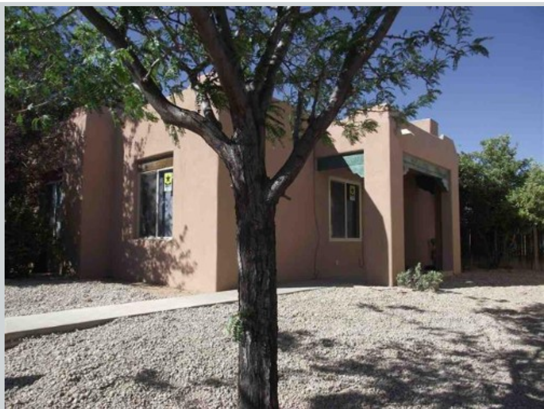
Sold Comp 2 4057 Los Milagros

Address 4037 Los Milagros, Santa Fe, NM 87507 Suggested Repaired $245,000 Sale $240,000 Loan Number 36565 Suggested List $245,000