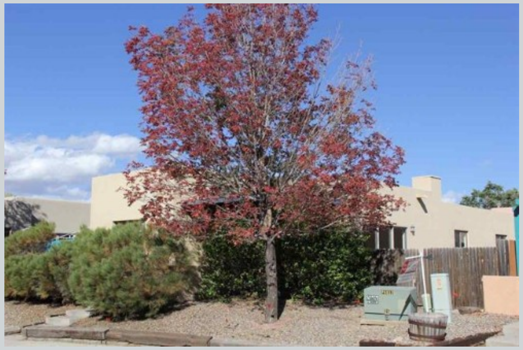
Listing Comp 1 3957 Los Milagros