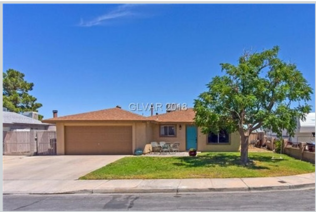
Sold Comp 1 205 Bryce Ct