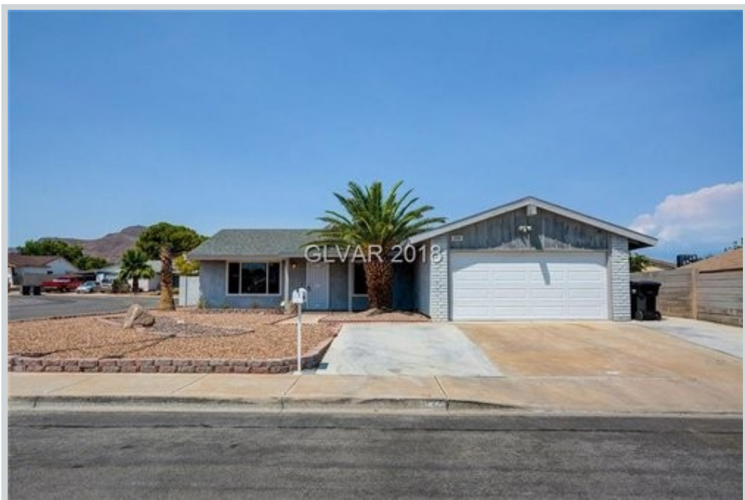
Sold Comp 3 634 Severn St