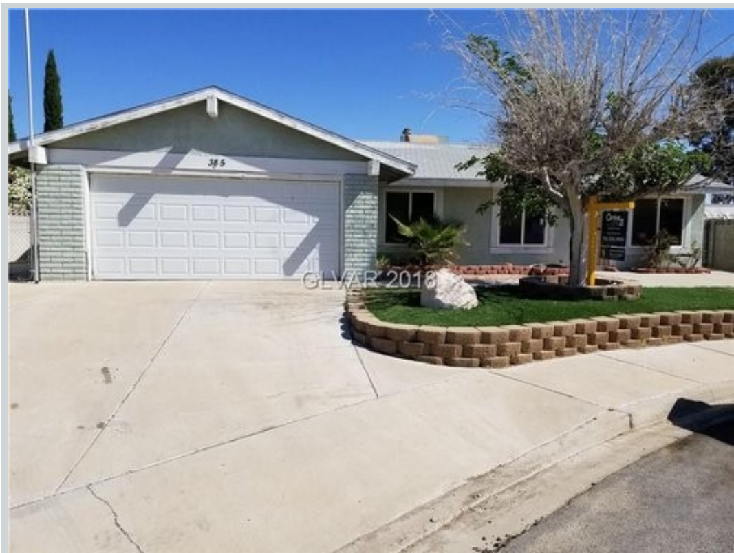
Listing Comp 2 385 Summer Creek Ct