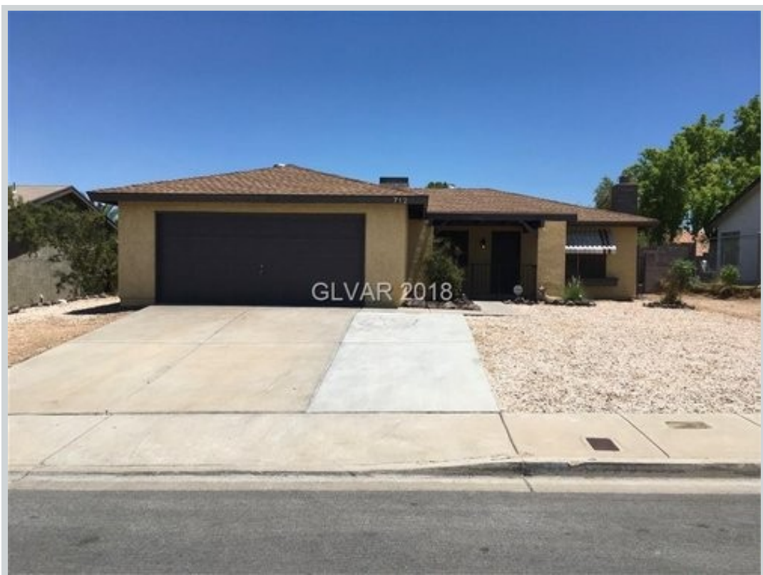
Sold Comp 2 712 Willow Ave

Address 225 Garden Court, Henderson, NV 89002 Suggested Repaired $260,000 Sale $249,000 Loan Number 36573 Suggested List $260,000