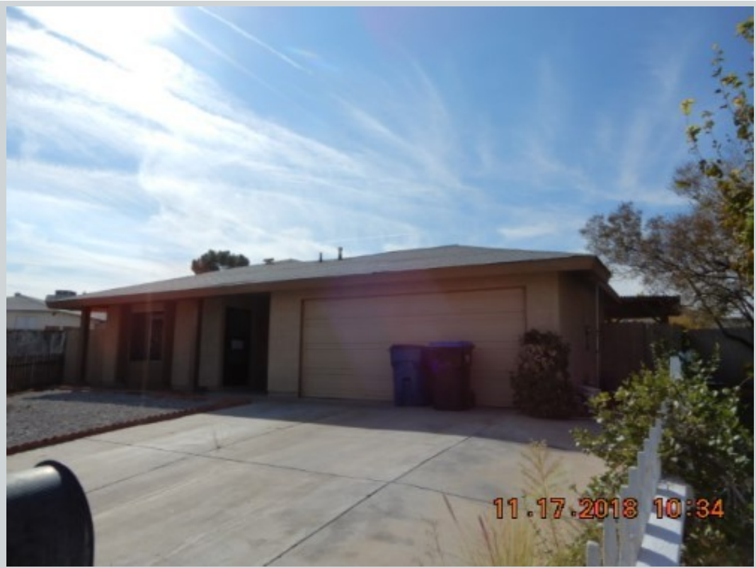
Subject 225 Garden Ct