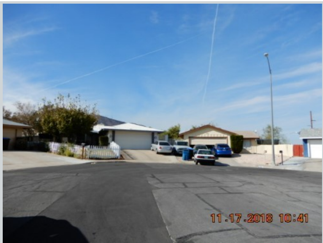
Subject 225 Garden Ct