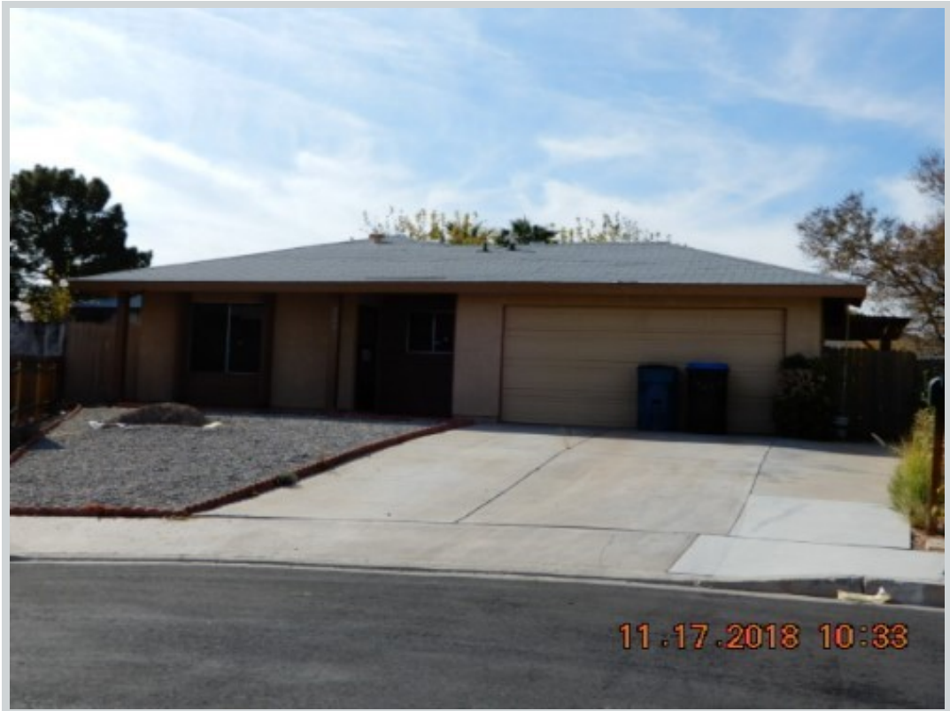
Subject 225 Garden Ct