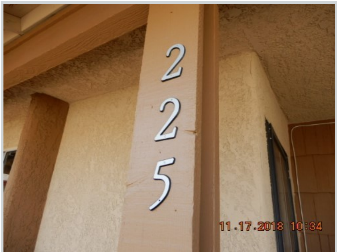
Subject 225 Garden Ct