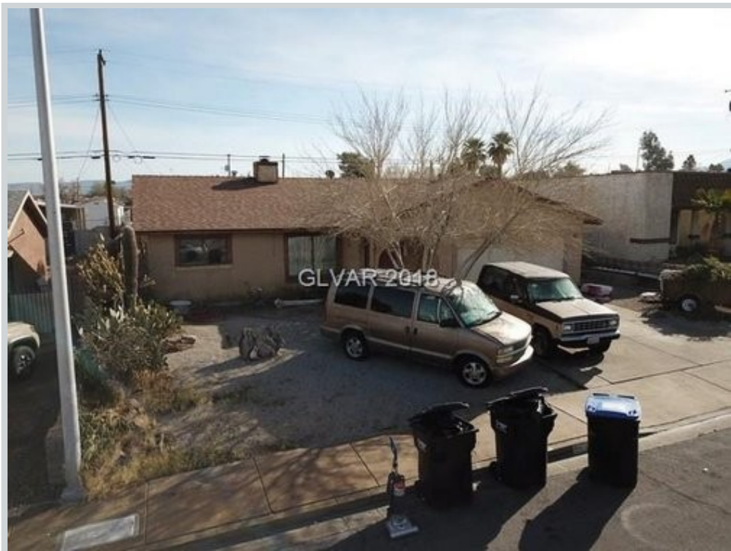
Listing Comp 1 233 Bismark Way

Address 225 Garden Court, Henderson, NV 89002 Loan Number 36573 Suggested List $260,000 Suggested Repaired $260,000 Sale $249,000