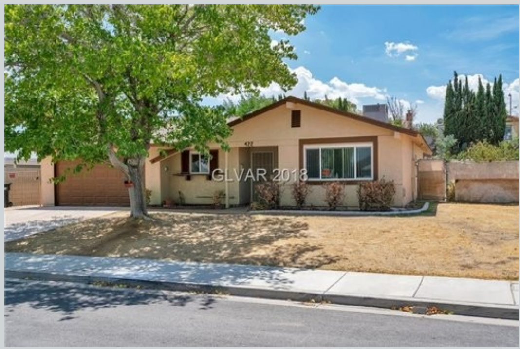
Listing Comp 3 422 Chateau Dr