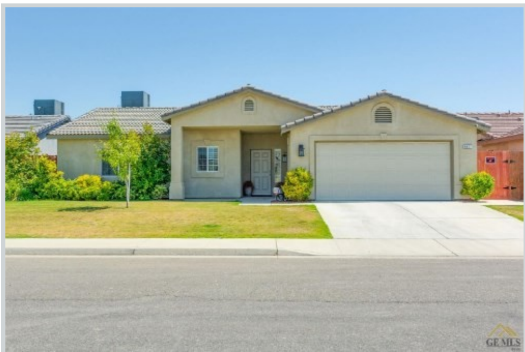
Sold Comp 2 5511 Tierra Abierta Drive