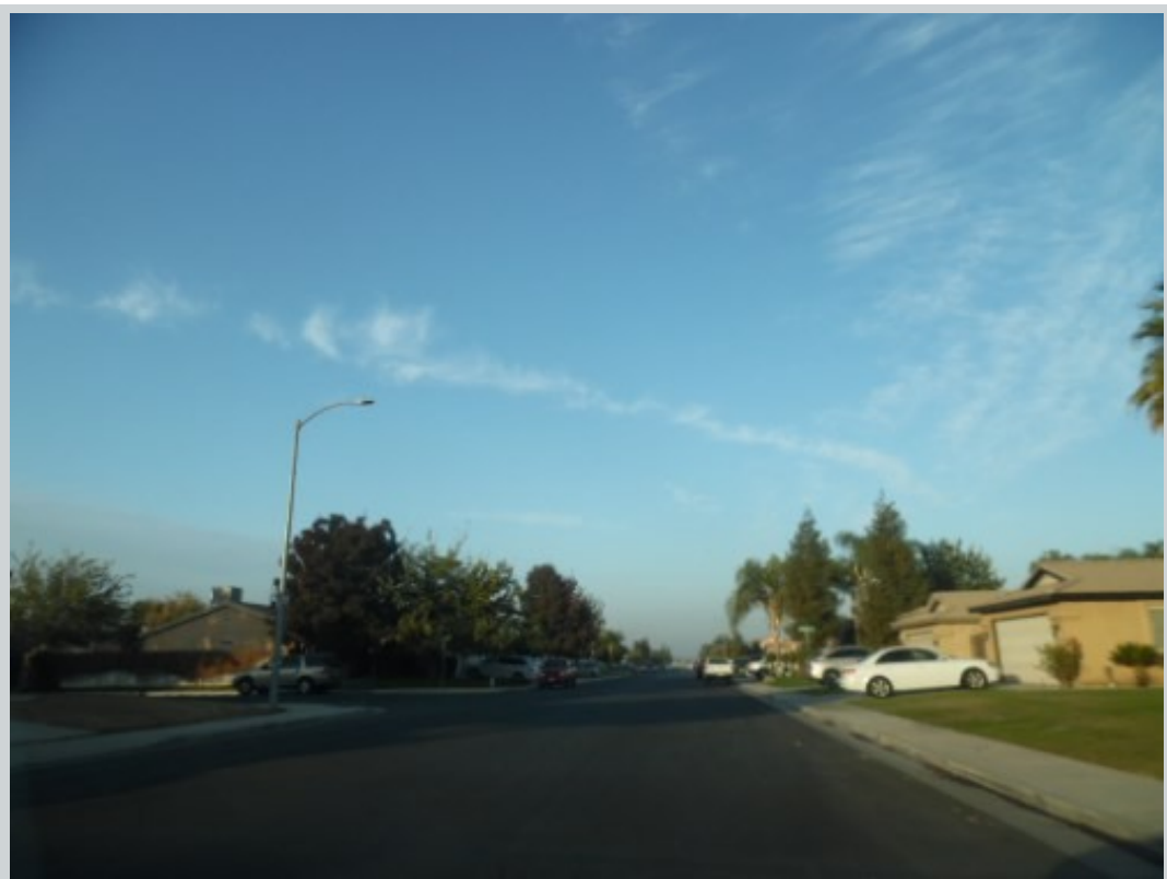
Subject 5401 Trabuco Canyon Dr