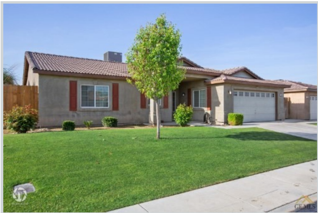
Sold Comp 1 5305 Mar Grande Drive