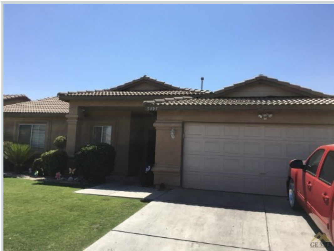
Listing Comp 2 5405 Milagro Drive