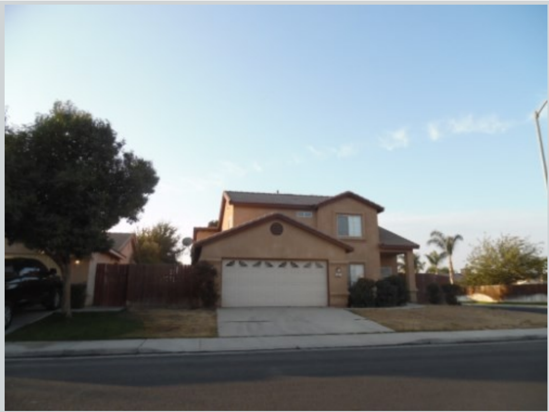
Subject 5401 Trabuco Canyon Dr