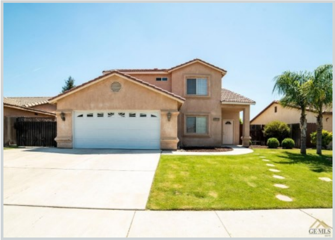
Sold Comp 3 5503 San Martinb Drive