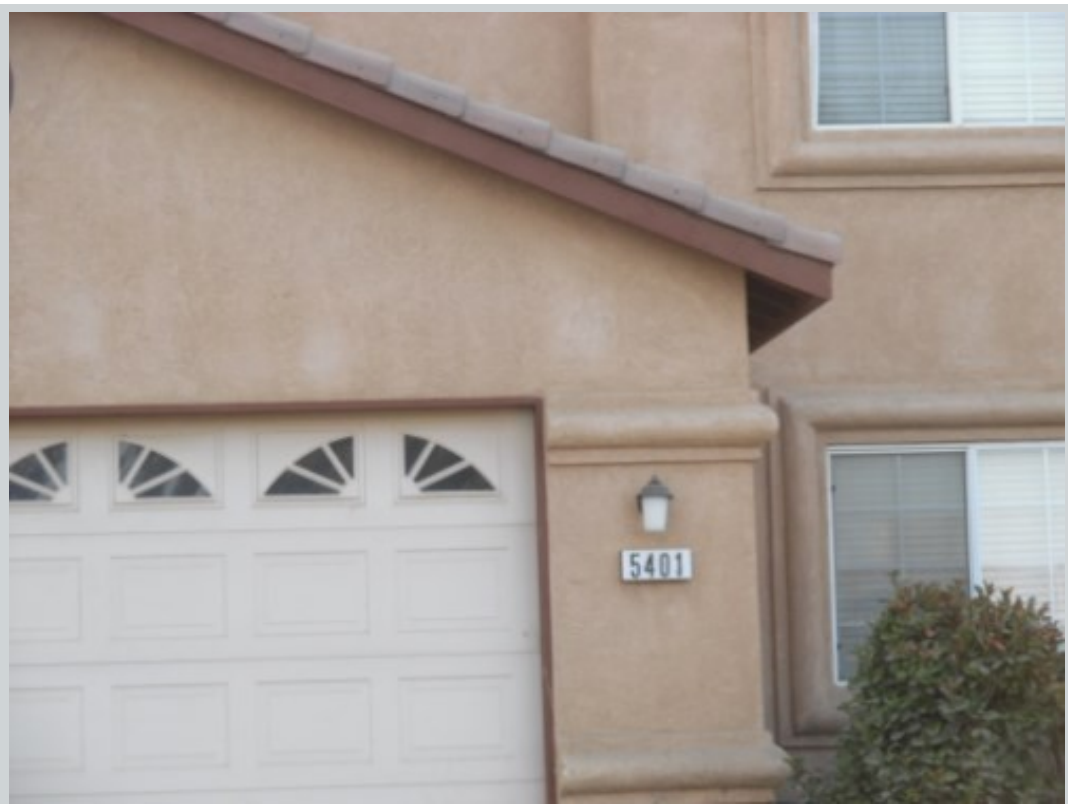
Subject 5401 Trabuco Canyon Dr