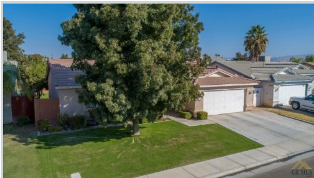
Listing Comp 3 5104 La Pinta Drive