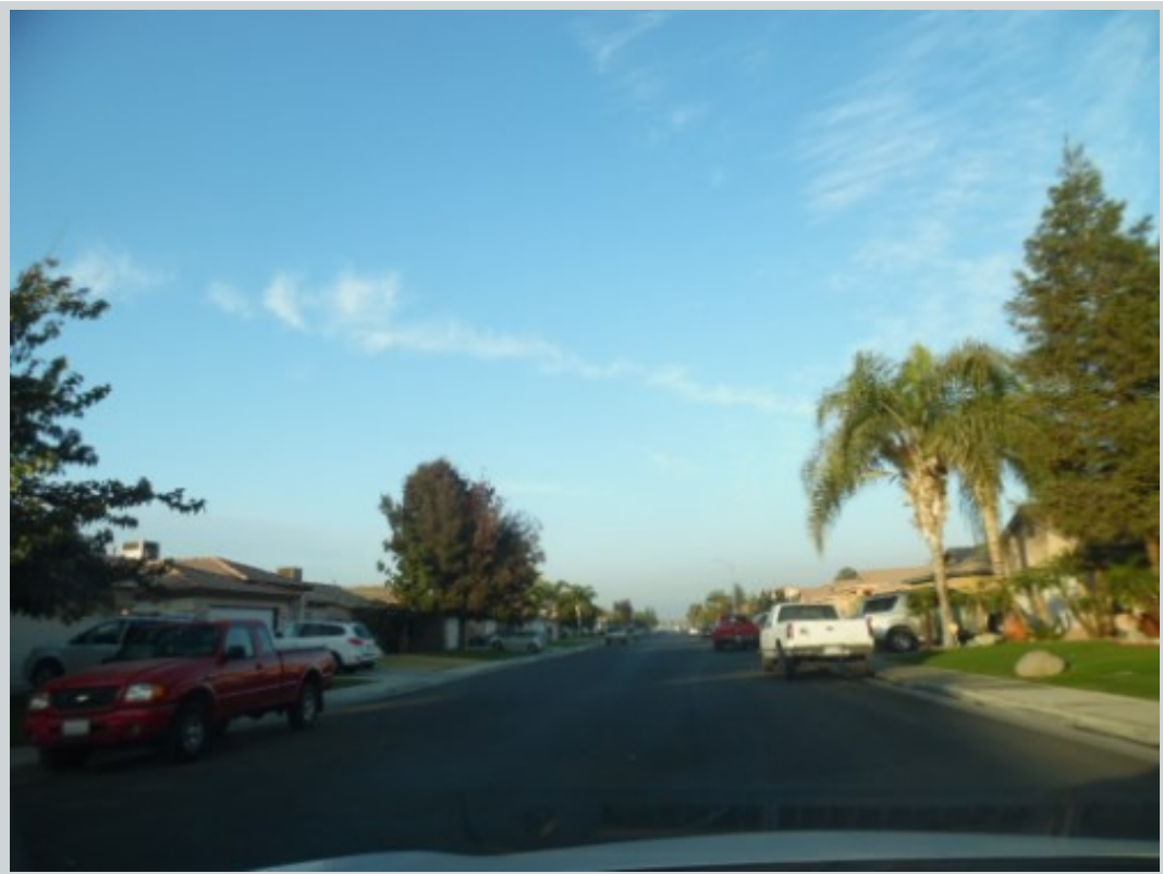
Subject 5401 Trabuco Canyon Dr