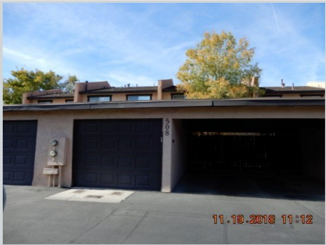
Subject 508 Starfire Ct