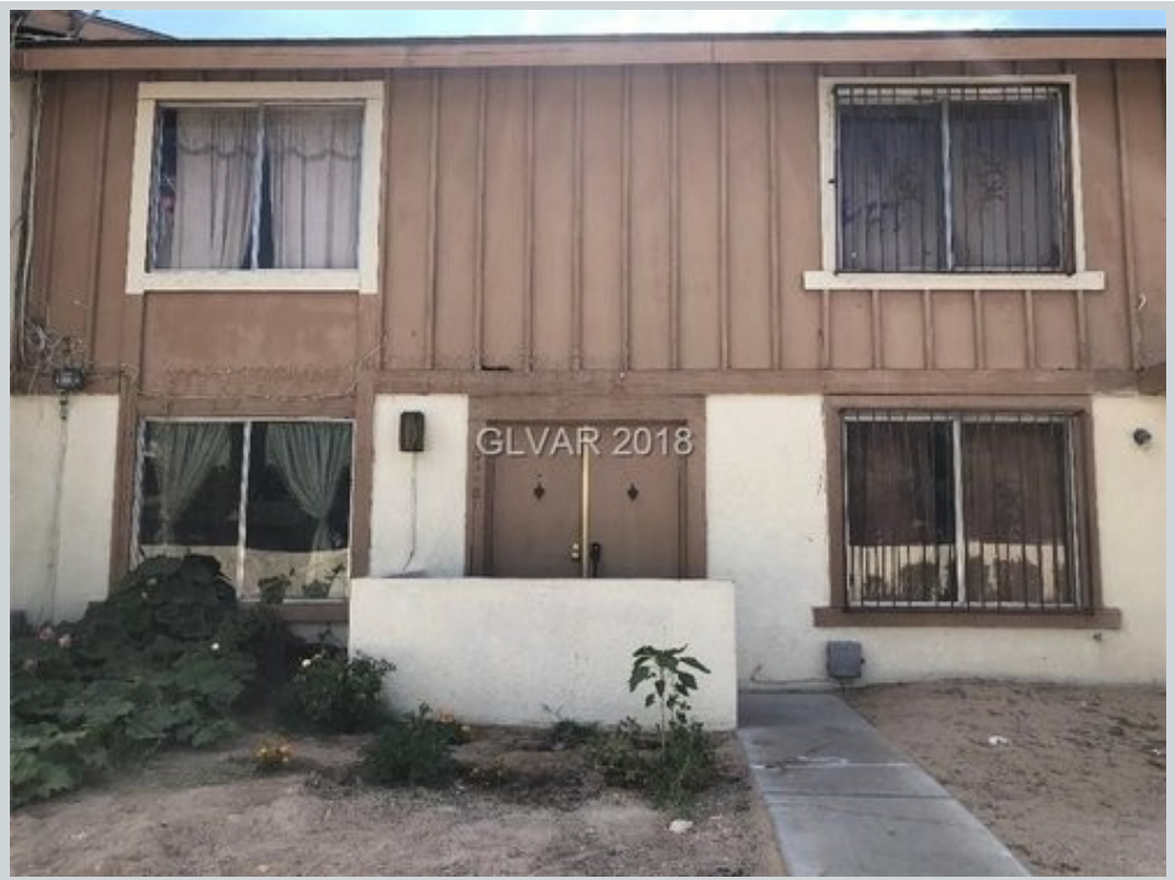
Listing Comp 2 3105 Chadford Pl