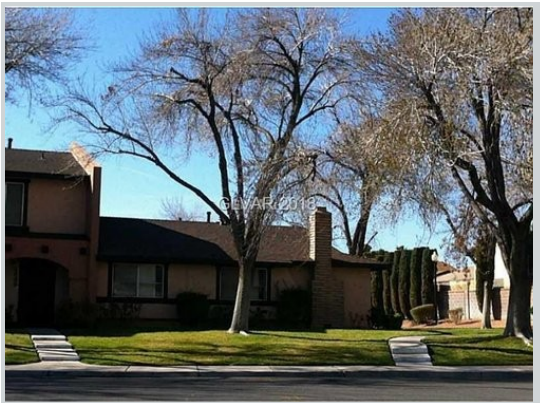
Sold Comp 2 4044 Nightengale Ct