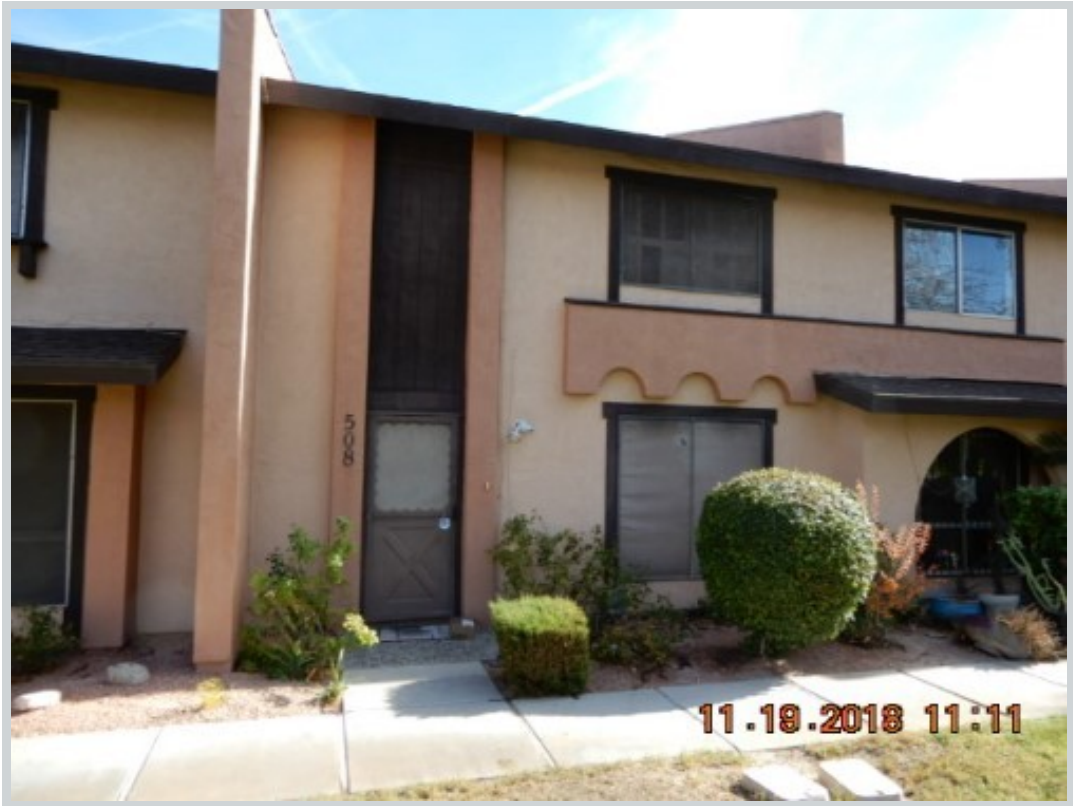
Subject 508 Starfire Ct