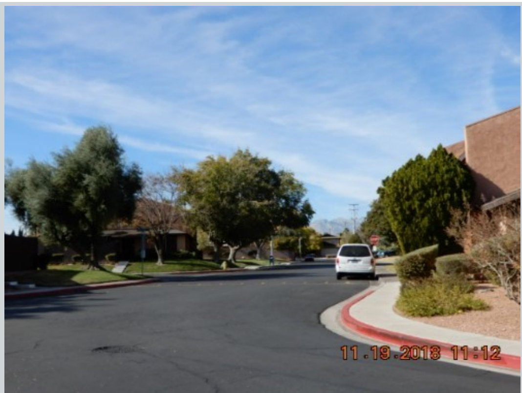
Subject 508 Starfire Ct