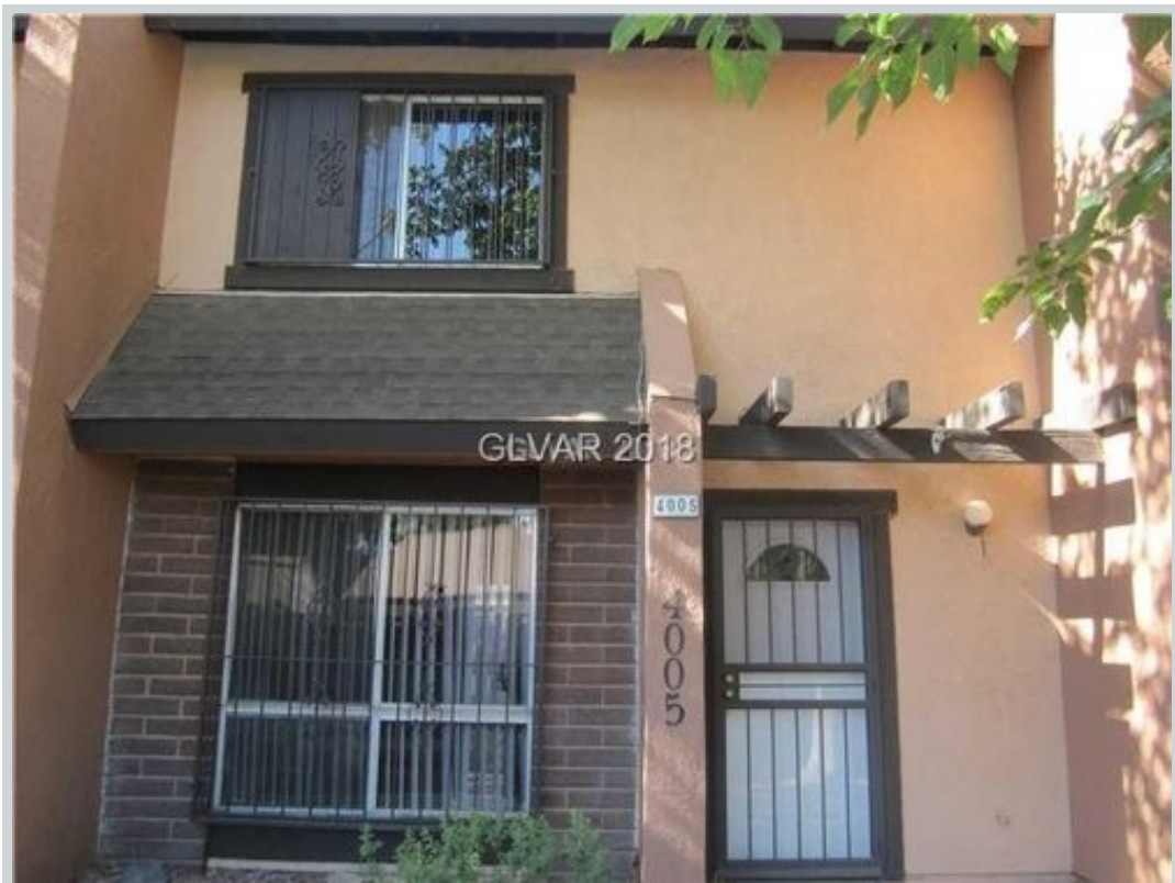
Sold Comp 1 4005 Evening Breeze Ct