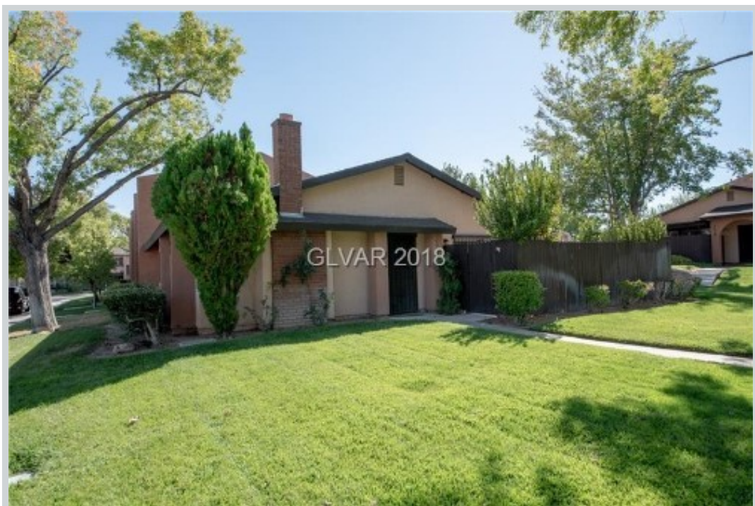
Sold Comp 3 601 Evening Breeze Dr