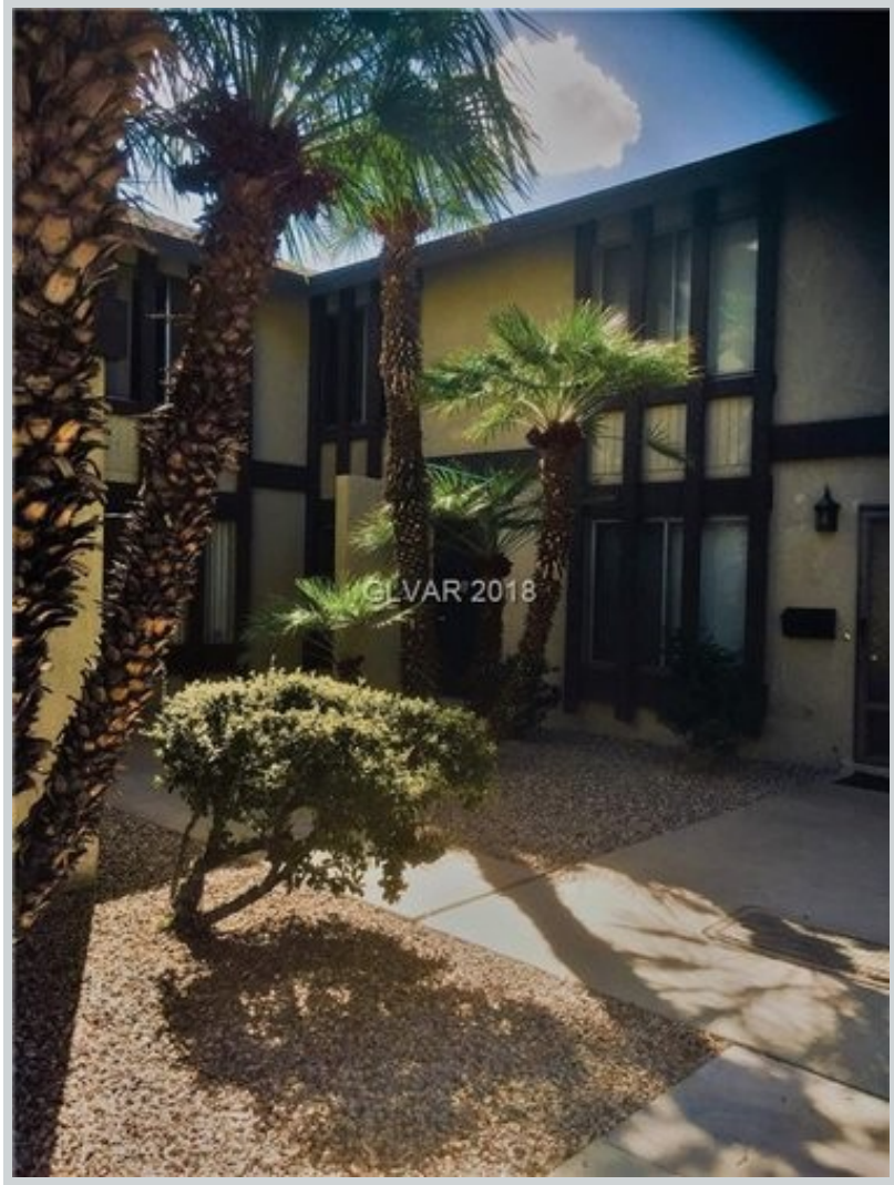
Listing Comp 1 5807 Bromley Ave