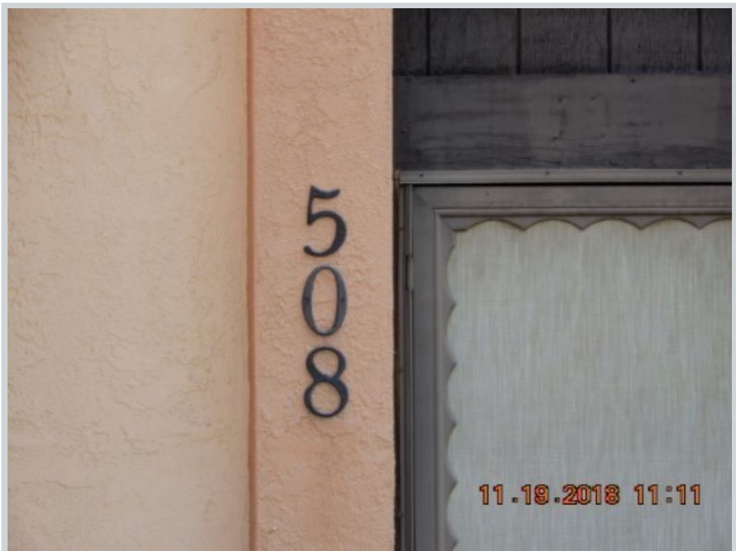
Subject 508 Starfire Ct