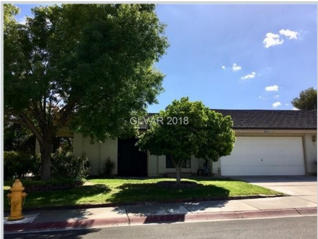
Listing Comp 3 5609 Ridgetree Ave

Address 508 Starfire Court, Las Vegas, NV 89107 Loan Number 36575 Suggested List $159,900 Suggested Repaired $159,900 Sale $157,000