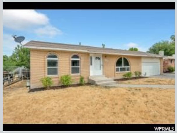
Sold Comp 1 577 N Wasatch View Other

Address 587 N 470 East, Tooele, UT 84074 Loan Number 36578 Suggested List $224,000 Suggested Repaired $224,000 Sale $224,000