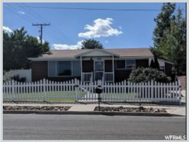
Sold Comp 2 516 E Birch View Other