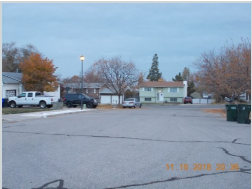
Subject 587 N 470 E