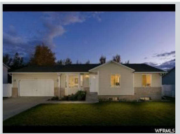
Listing Comp 3 672 E 290 N View Other