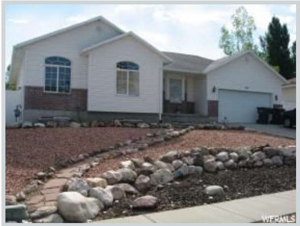
Sold Comp 3 904 N 1300 E View Other

Address 587 N 470 East, Tooele, UT 84074 Loan Number 36578 Suggested List $224,000 Suggested Repaired $224,000 Sale $224,000