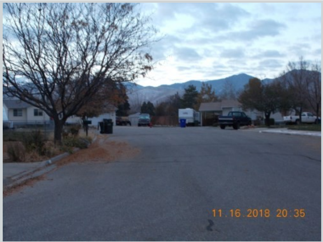
Subject 587 N 470 E

Address 587 N 470 East, Tooele, UT 84074 Loan Number 36578 Suggested List $224,000 Suggested Repaired $224,000 Sale $224,000