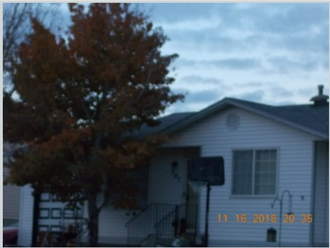
Subject 587 N 470 E

Address 587 N 470 East, Tooele, UT 84074 Loan Number 36578 Suggested List $224,000 Suggested Repaired $224,000 Sale $224,000