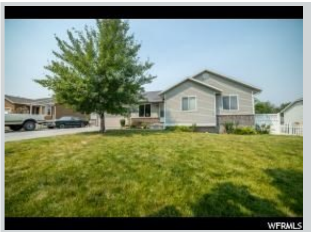
Listing Comp 2 383 N 840 E View Other

Address 587 N 470 East, Tooele, UT 84074 Loan Number 36578 Suggested List $224,000 Suggested Repaired $224,000 Sale $224,000