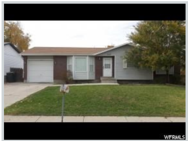
Listing Comp 1 329 N Chaplain