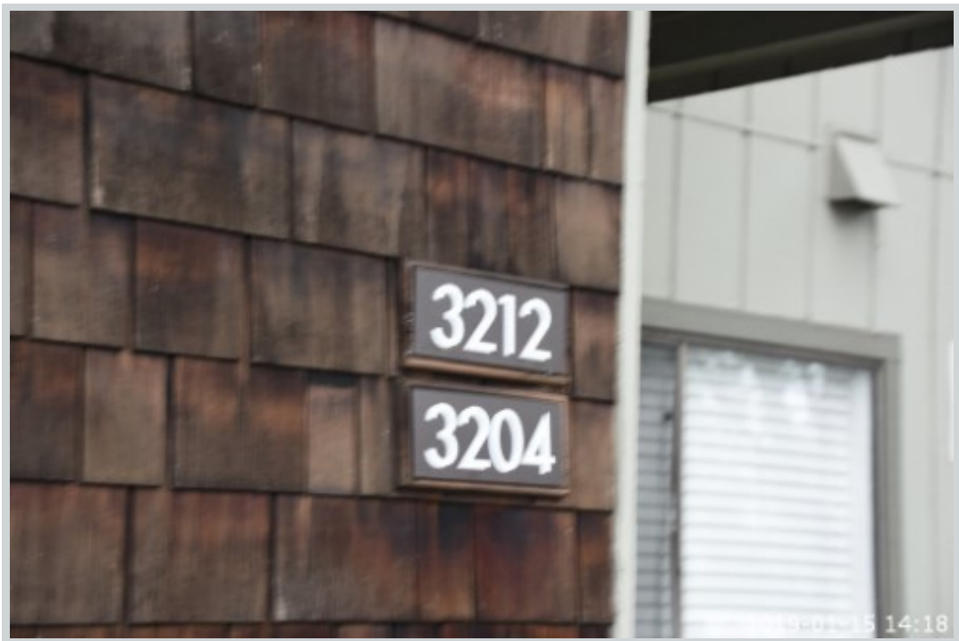
Subject 3212 La Terrace Cir