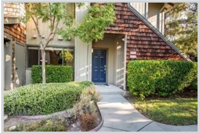
Sold Comp 2 3505 La Terrace Cir View Front