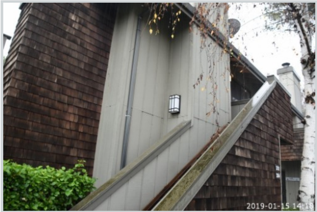
Subject 3212 La Terrace Cir