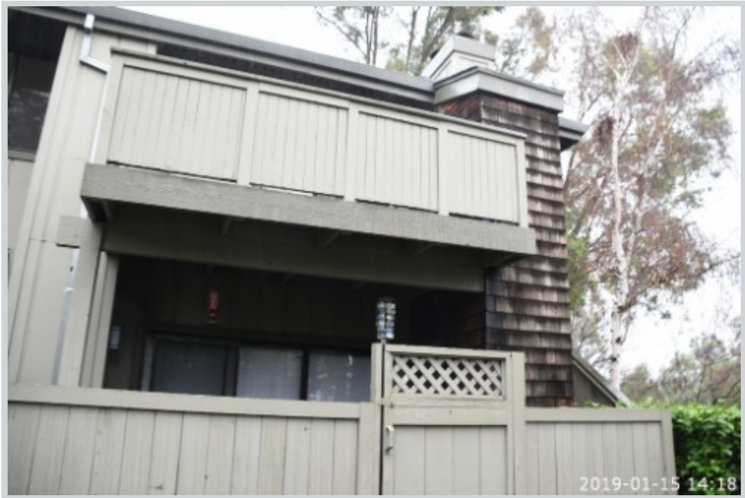
Subject 3212 La Terrace Cir