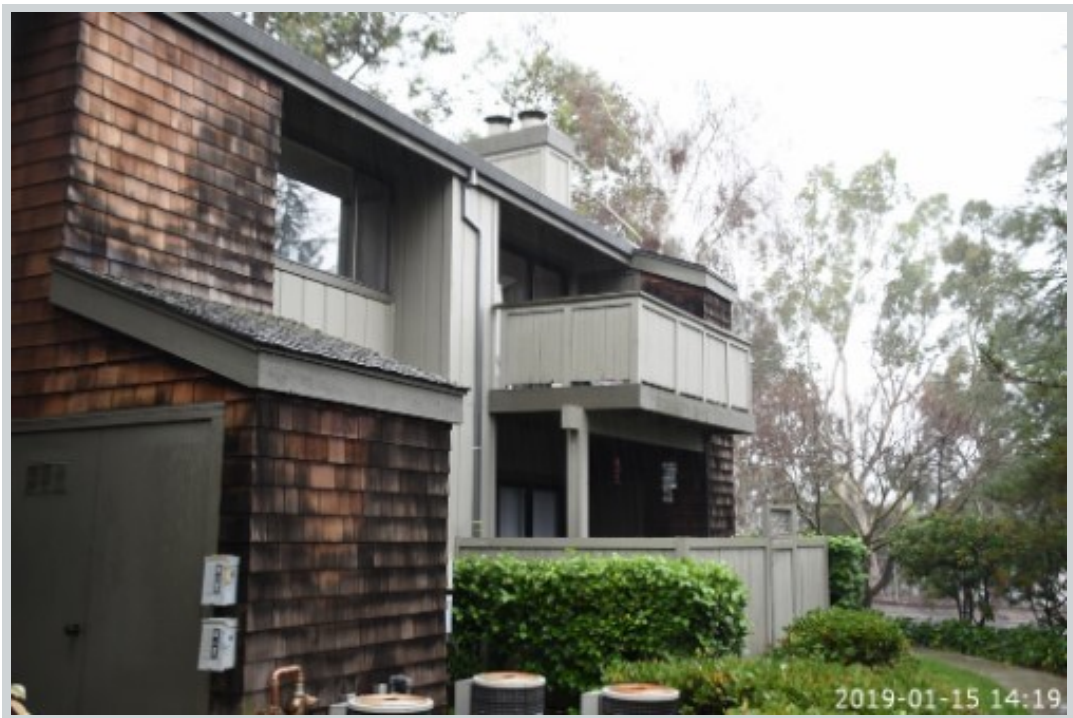
Subject 3212 La Terrace Cir