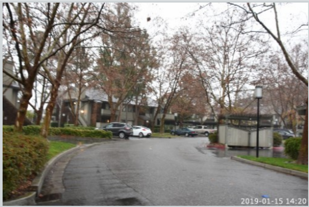
Subject 3212 La Terrace Cir