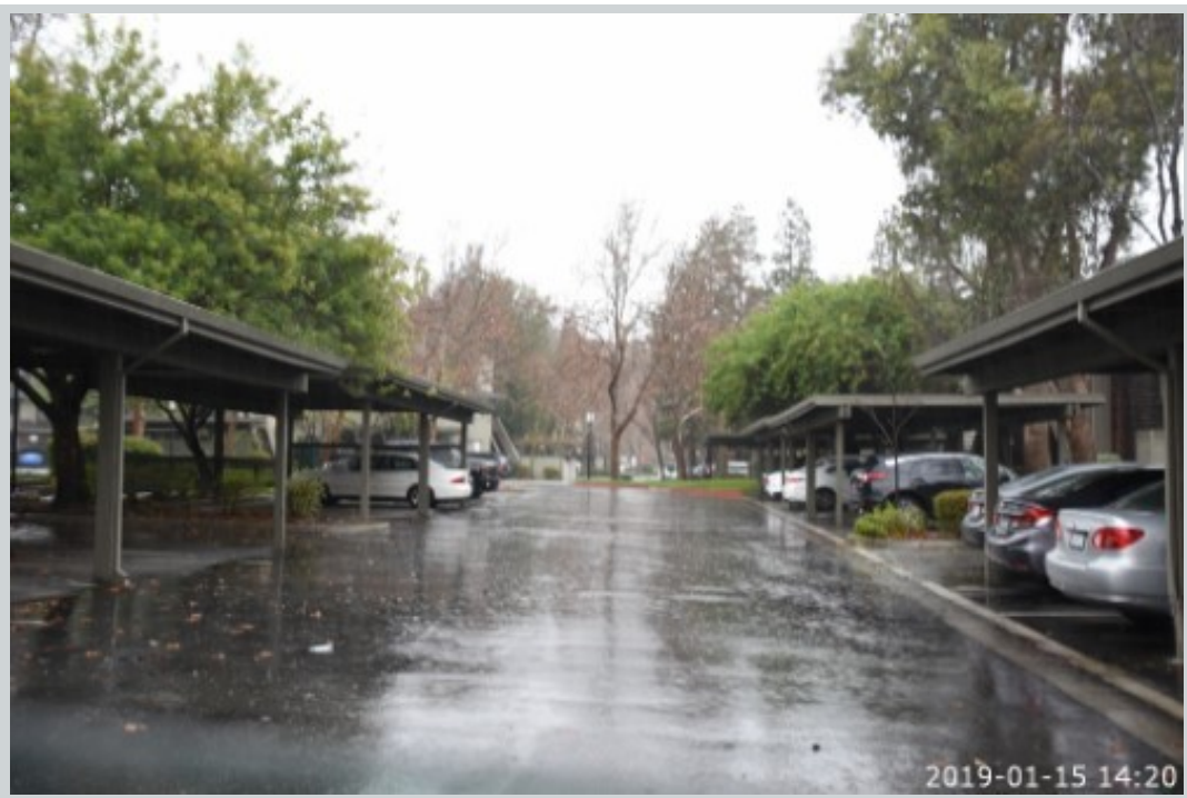
Subject 3212 La Terrace Cir