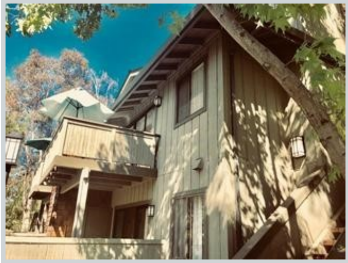
Listing Comp 3 3312 La Terrace Cir View Front