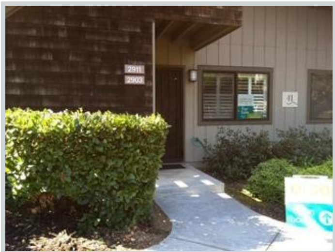
Sold Comp 1 2903 La Terrace Cir View Front