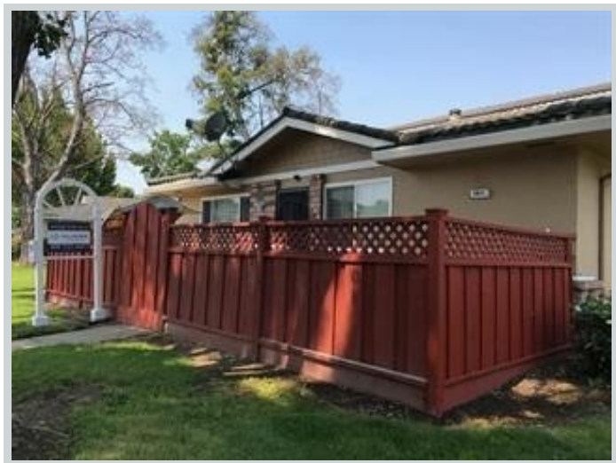
Sold Comp 3 5611 Playa Del Rey 1 View Front