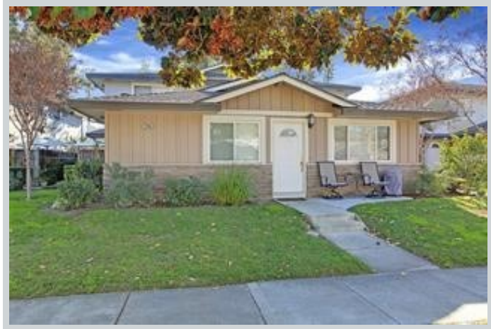
Listing Comp 2 1266 Bouret Dr 4 View Front