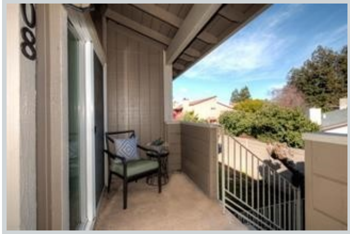
Listing Comp 1 4970 Cherry Ave 208 View Front