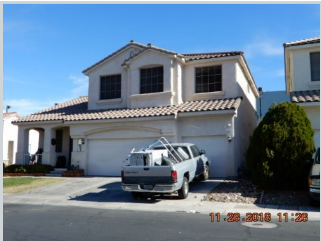
Subject 9012 Galena Crossing St