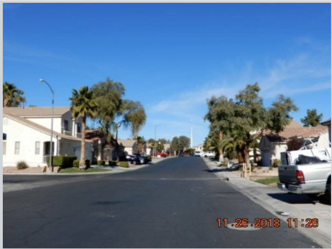
Subject 9012 Galena Crossing St