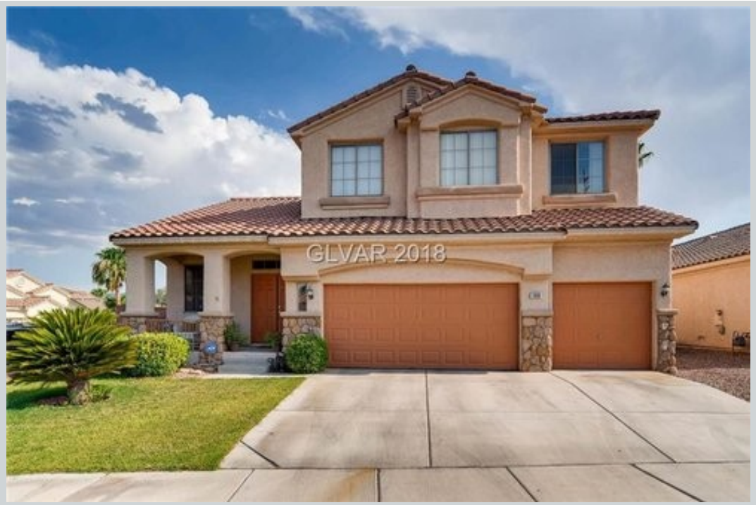
Sold Comp 3 1899 Tremolite Ave