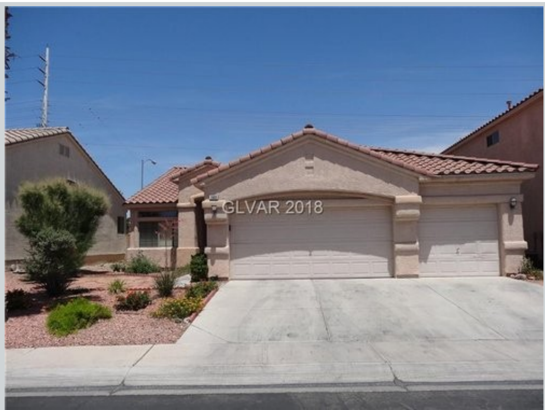
Listing Comp 1 1900 Tremolite Ave