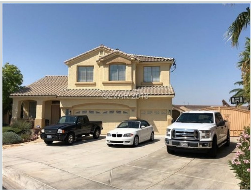
Sold Comp 2 8925 Topaz Cliff Pl