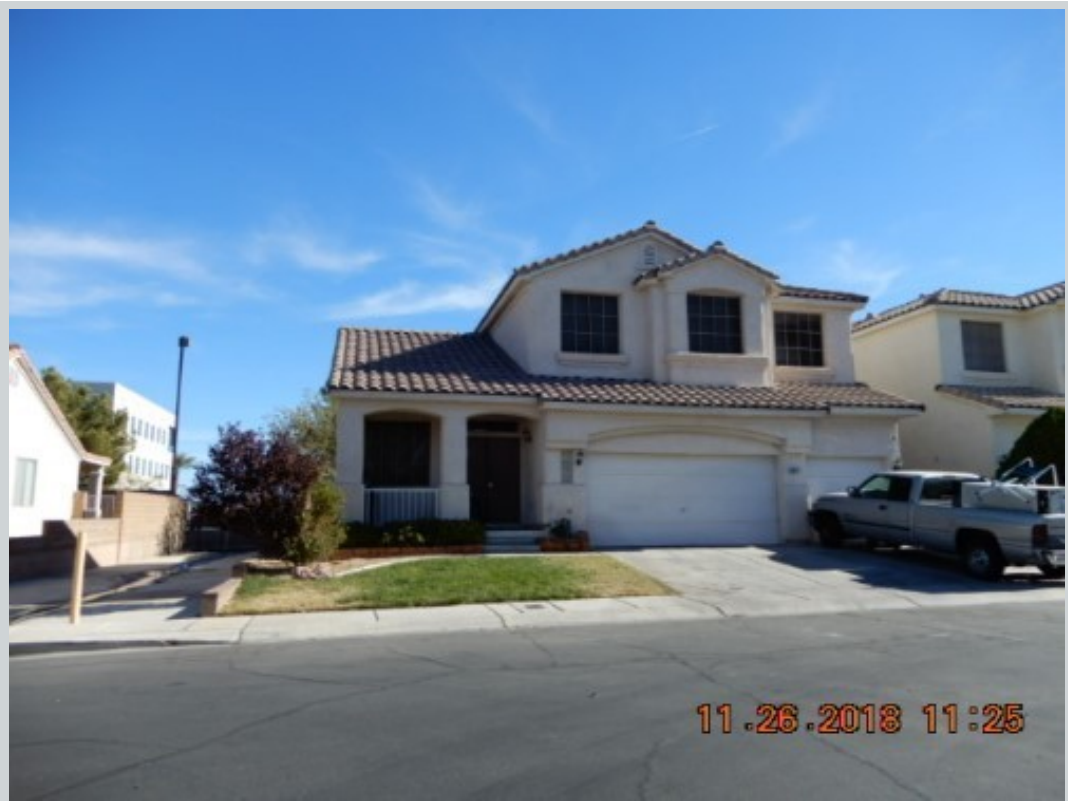
Subject 9012 Galena Crossing St