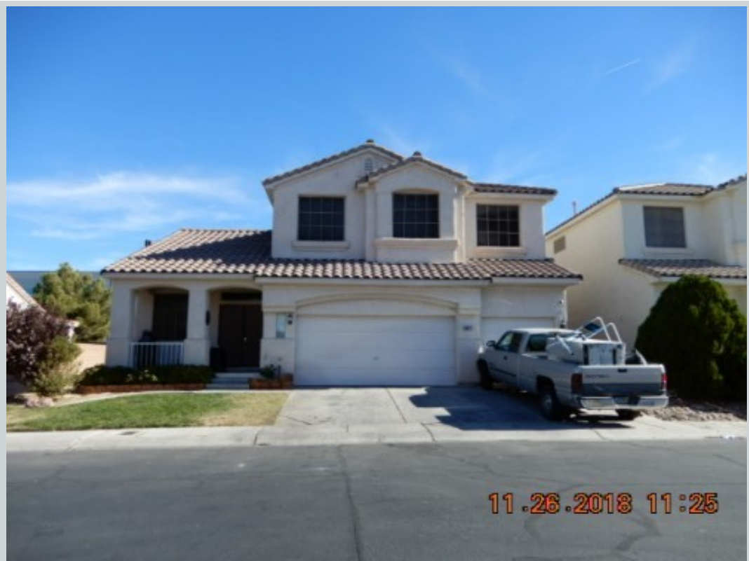
Subject 9012 Galena Crossing St