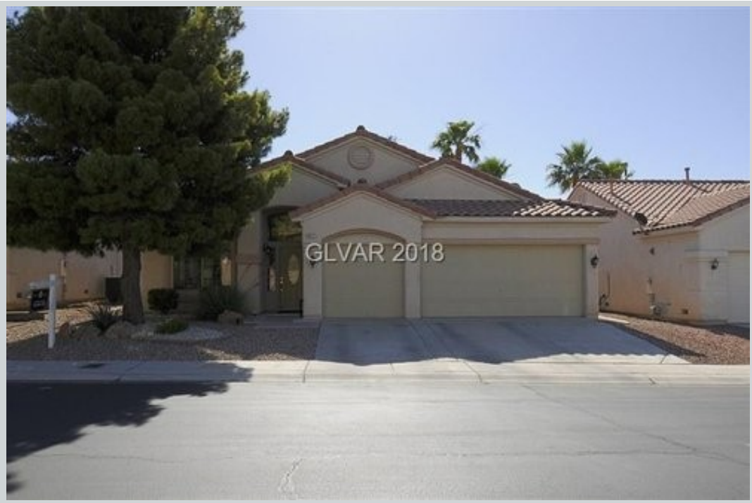
Sold Comp 1 8922 Galena Crossing St