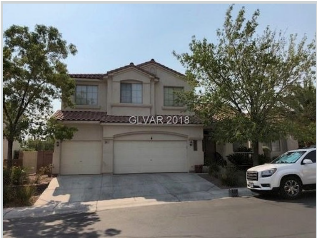
Listing Comp 2 8961 Emery Lake St