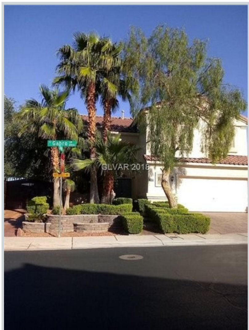
Listing Comp 3 8996 Gabro Ln