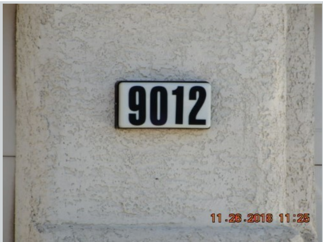
Subject 9012 Galena Crossing St