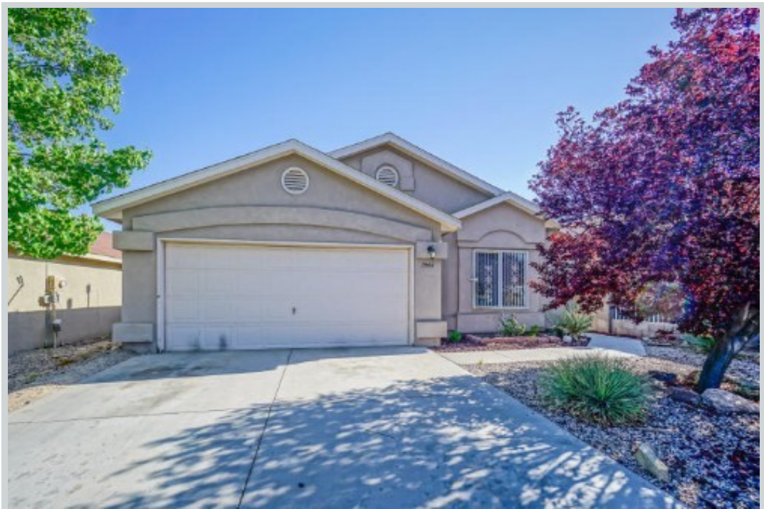
Sold Comp 2 7904 Purple Fringe Rd Sw View Front