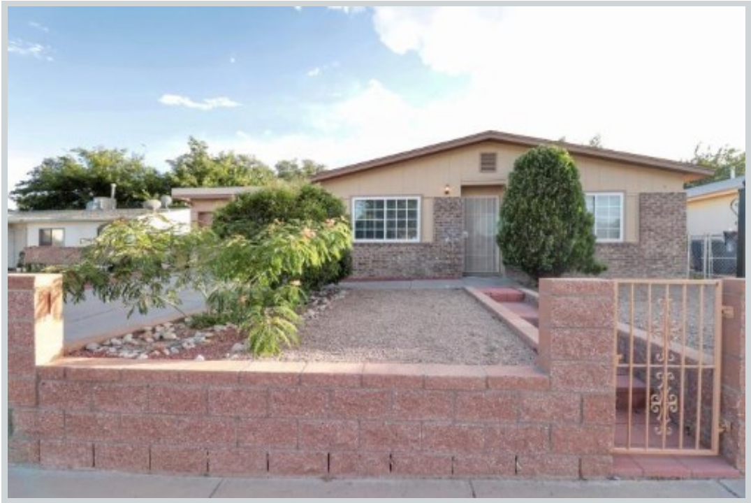
Sold Comp 3 8604 Lynette Ct Sw