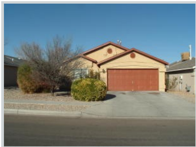
Listing Comp 1 7711 Saltbrush Rd Sw