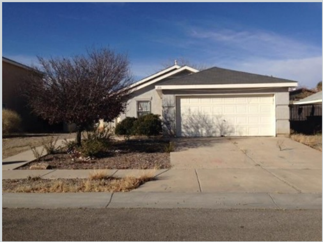
Subject 1519 Corriz Dr Sw