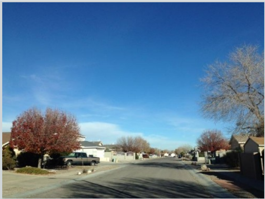
Subject 1519 Corriz Dr Sw