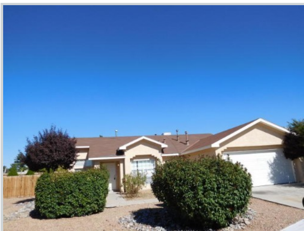
Listing Comp 3 8223 Emerald Sky Ave Sw View Front