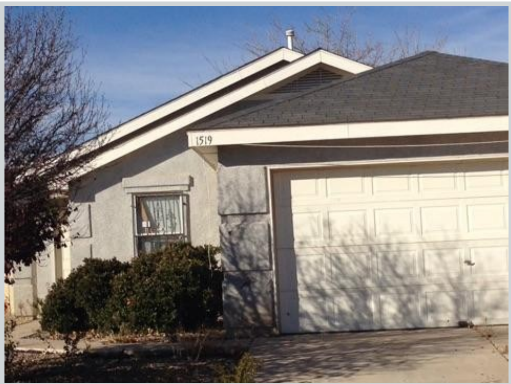
Subject 1519 Corriz Dr Sw