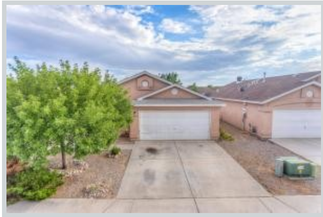
Sold Comp 1 8800 Silverado Ave Sw View Front