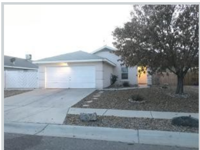
Listing Comp 2 1515 Corriz Dr Sw View Front

Address 1519 Corriz Drive Sw, Albuquerque, NM 87121 Loan Number 36605 Suggested List $140,000 Suggested Repaired $140,000 Sale $135,000