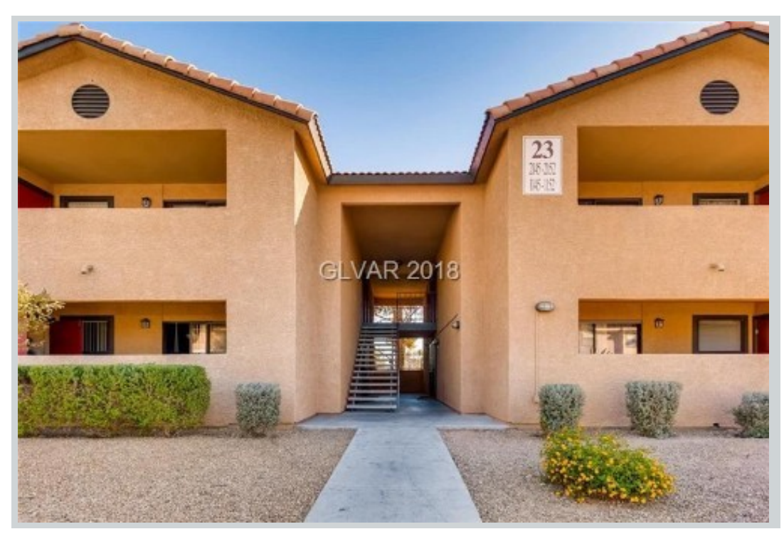
Listing Comp 1 2451 N Rainbow BI #1064