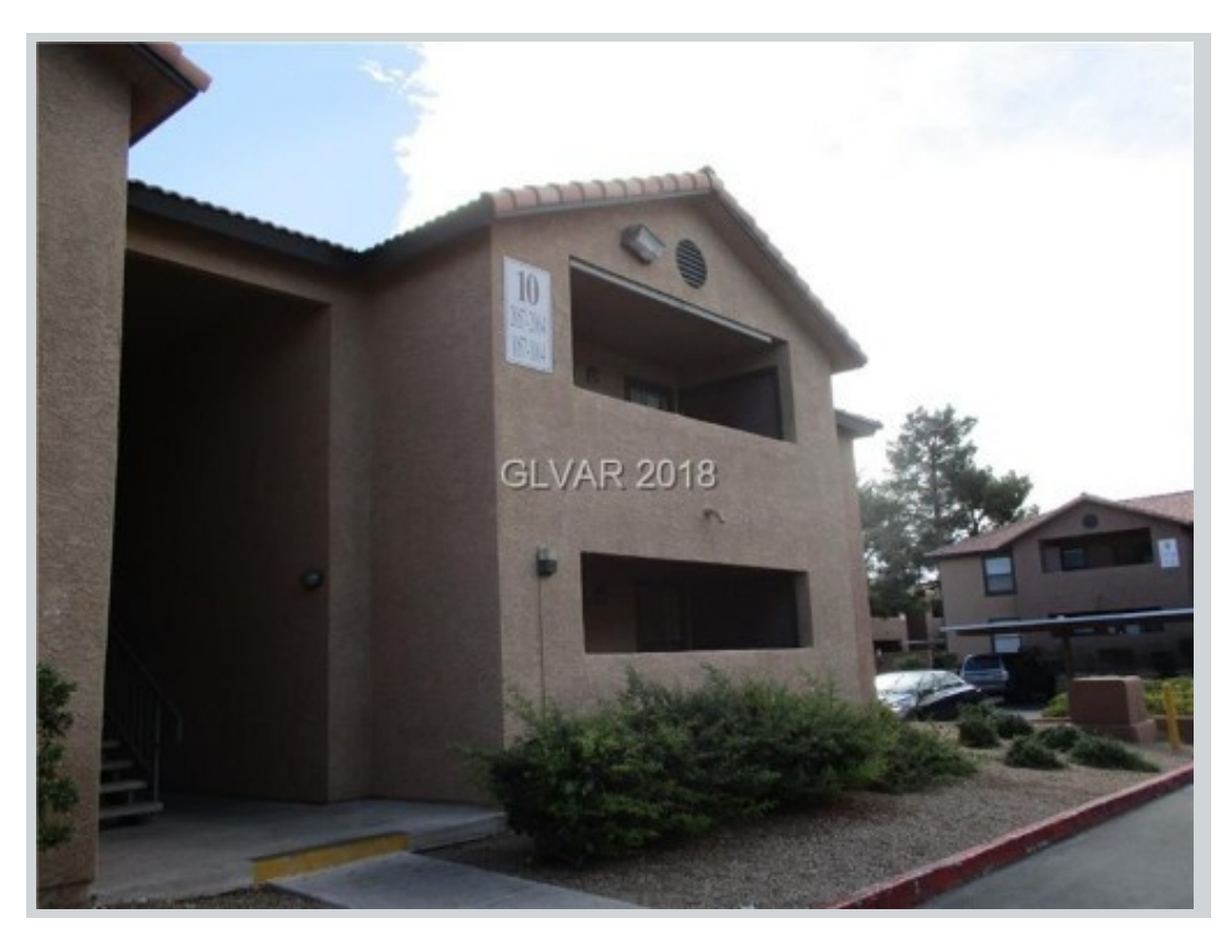
Listing Comp 2 2451 N Rainbow BI #1150

Suggested Repaired $100,000 Sale $95,000