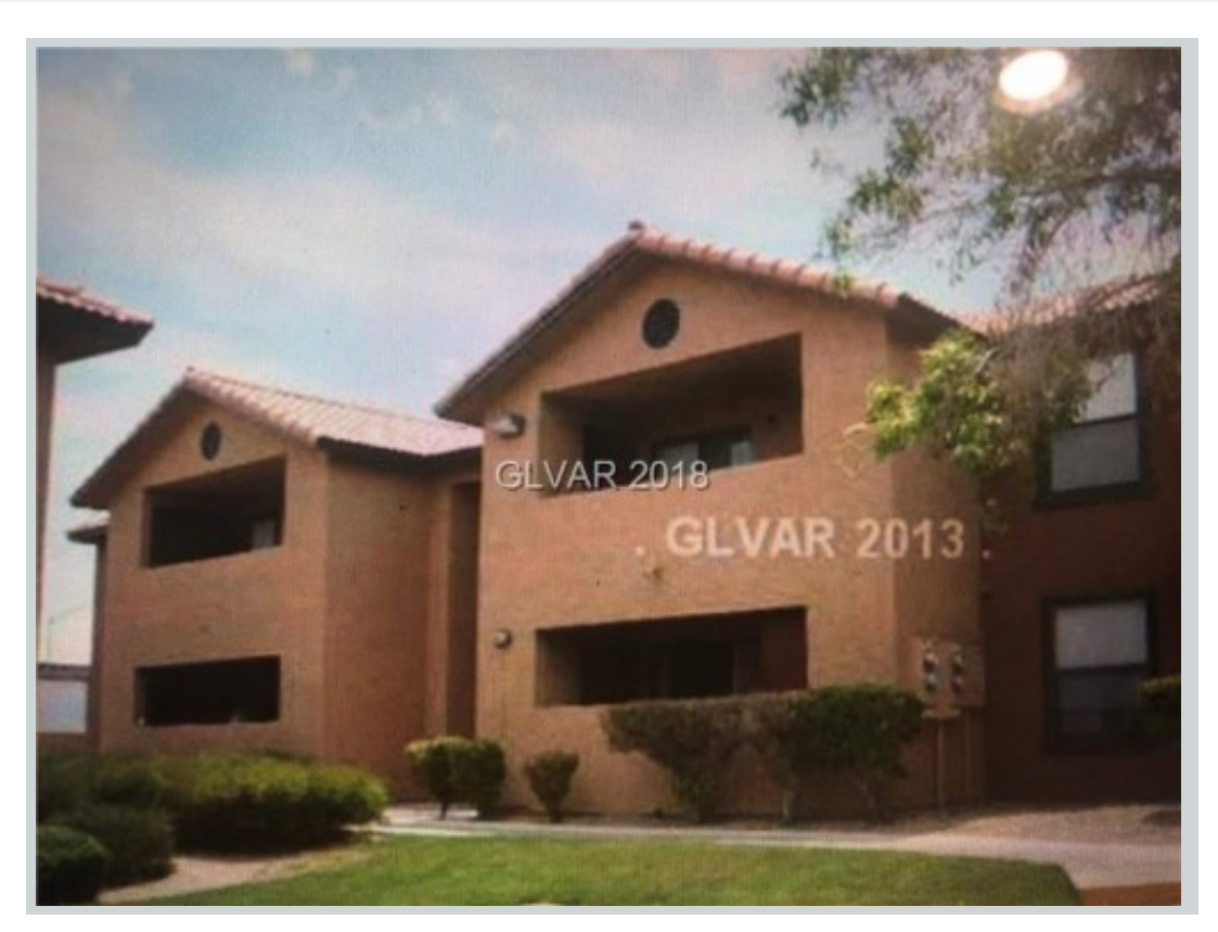
Sold Comp 3 2451 N Rainbow BI #1037

Suggested Repaired $100,000 Sale $95,000