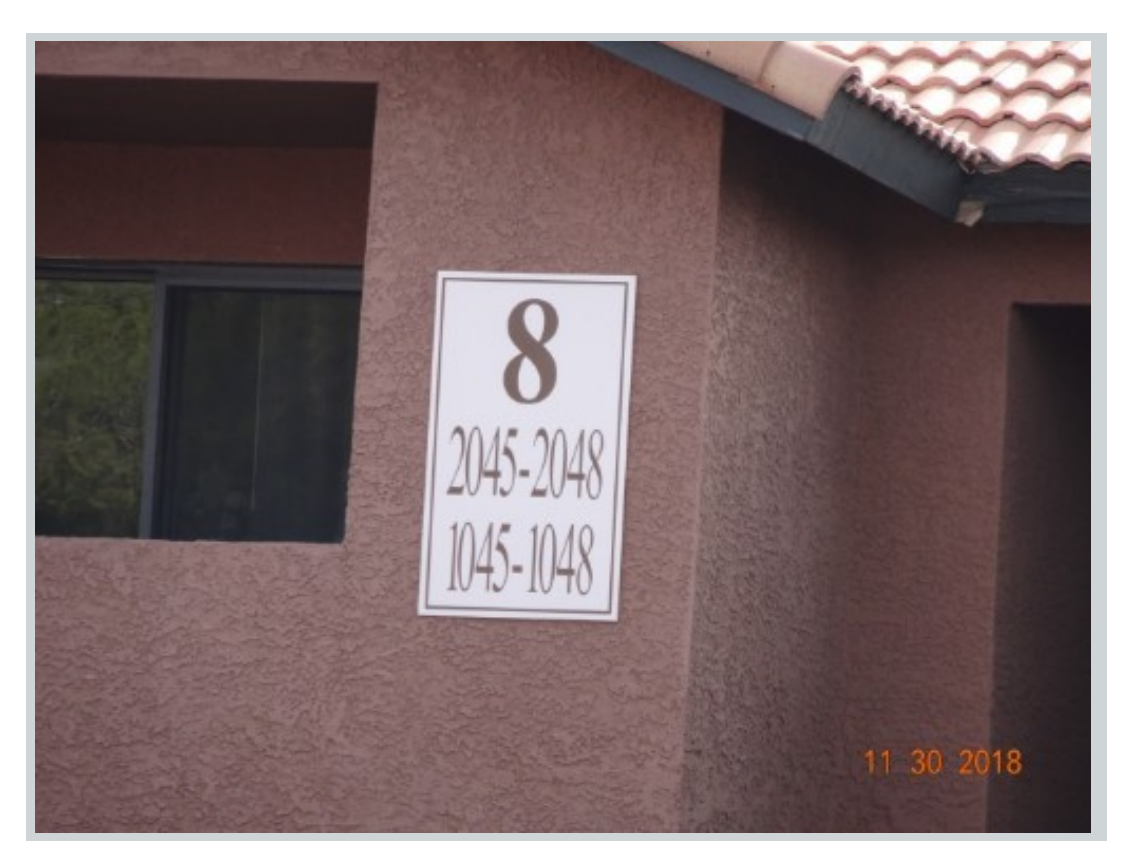
Subject 2451 N Rainbow Blvd Unit 2047