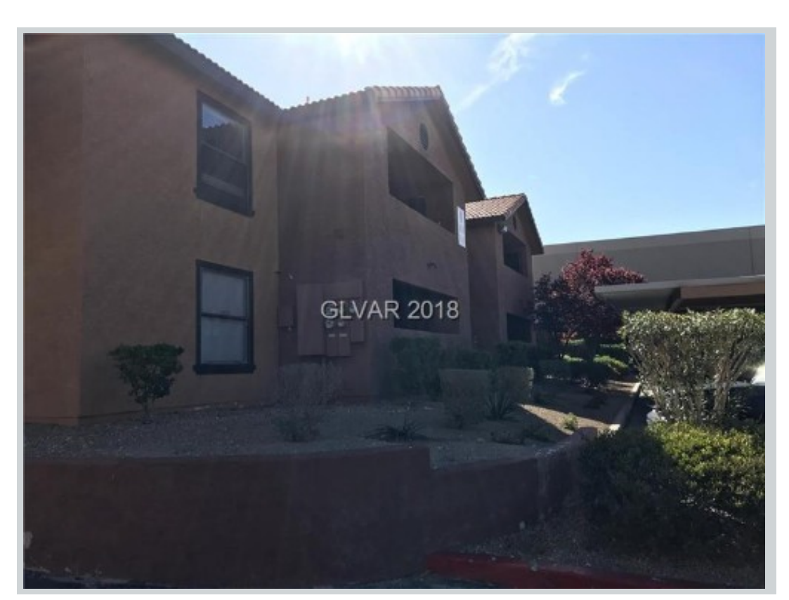
Sold Comp 2 2451 N Rainbow BI #1046