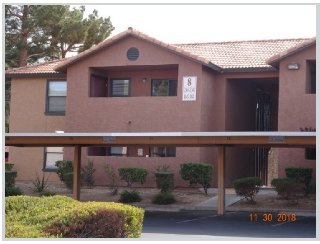
Subject 2451 N Rainbow Blvd Unit 2047