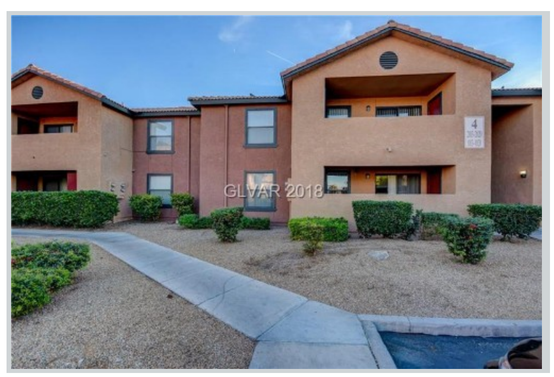
Listing Comp 3 2451 N Rainbow BI #1013