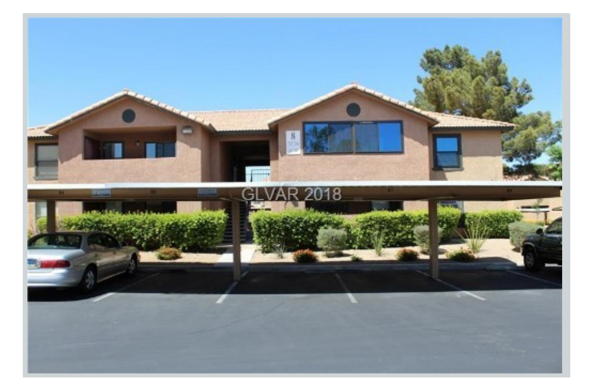
Sold Comp 1 2451 N Rainbow BI #2045