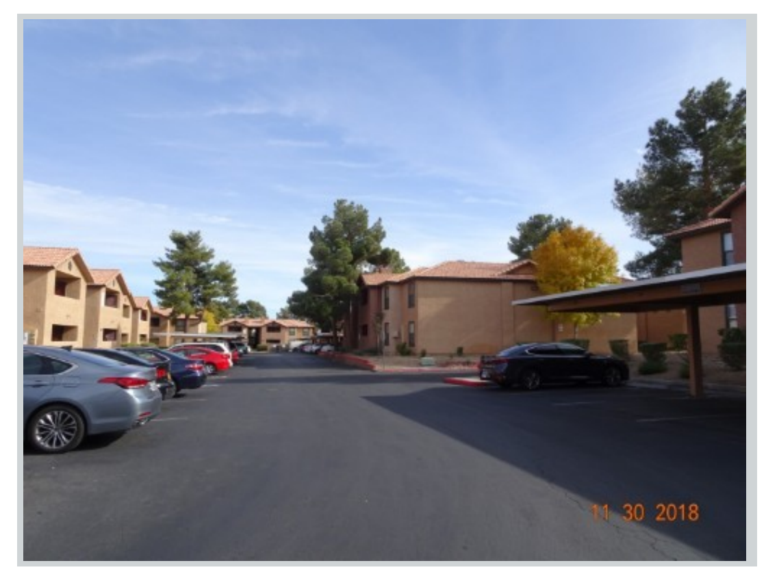
Subject 2451 N Rainbow Blvd Unit 2047

Suggested Repaired $100,000 Sale $95,000