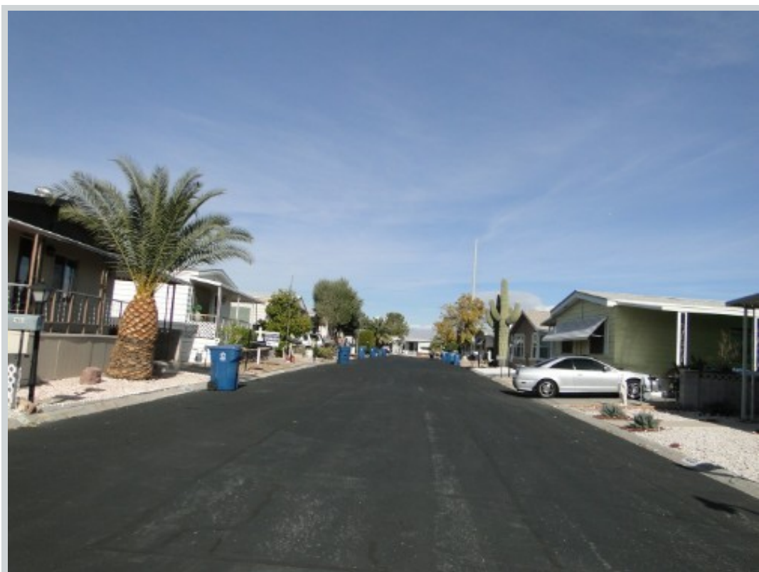
Subject 4575 Royal Ridge Ln

Address 4575 Royal Ridge Lane, Las Vegas, NV 89103 Loan Number 36620 Suggested List $123,000 Suggested Repaired $123,000 Sale $120,000