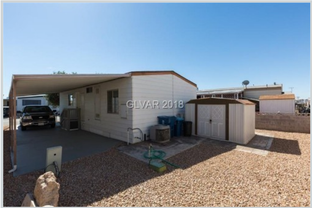
Sold Comp 3