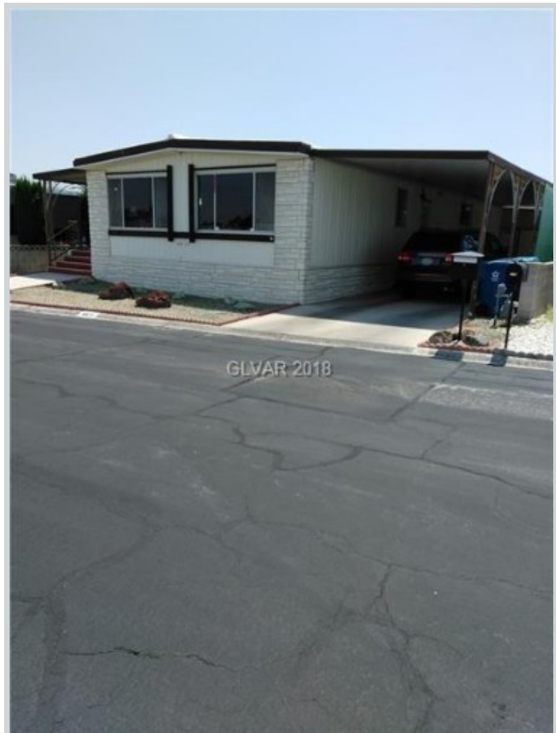
Listing Comp 3