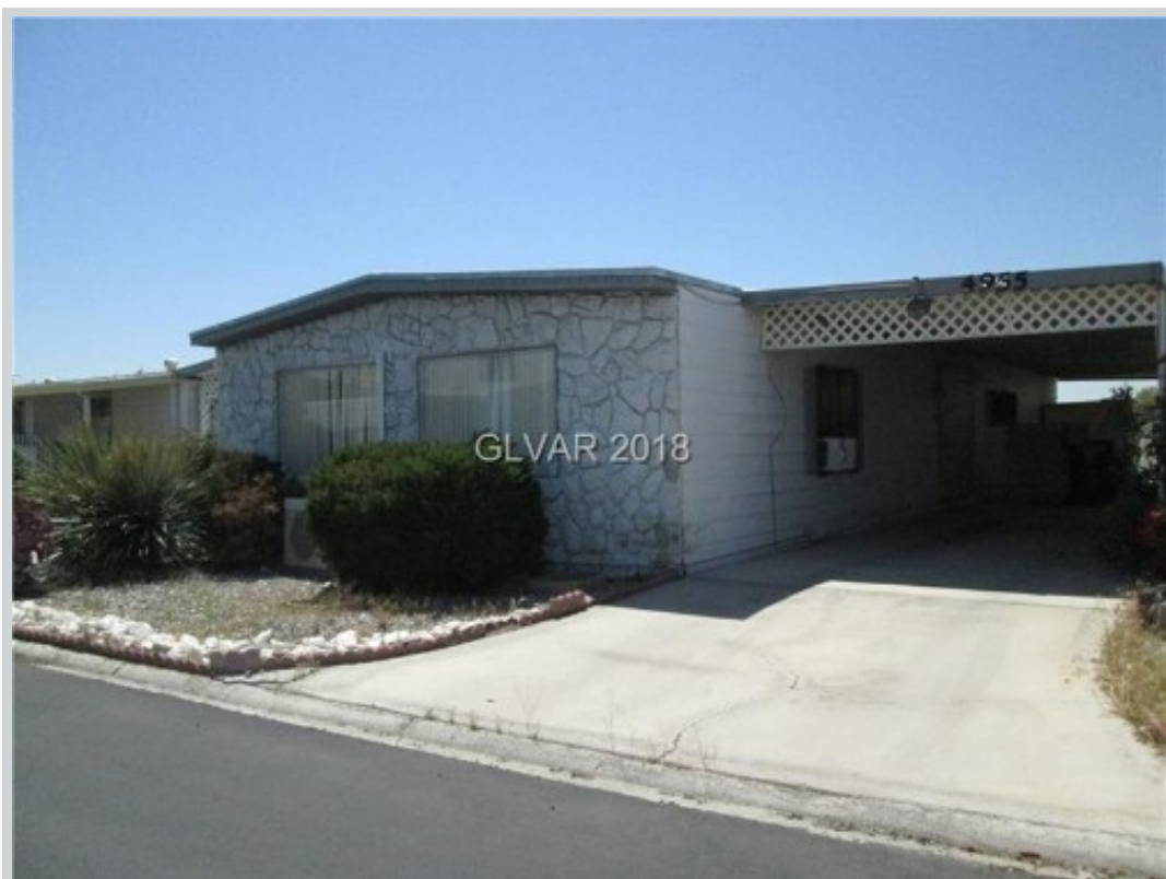
Sold Comp 1

Address 4575 Royal Ridge Lane, Las Vegas, NV 89103 Loan Number 36620 Suggested List $123,000 Suggested Repaired $123,000 Sale $120,000