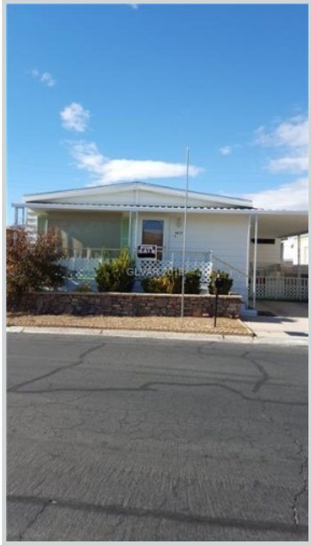
Listing Comp 2