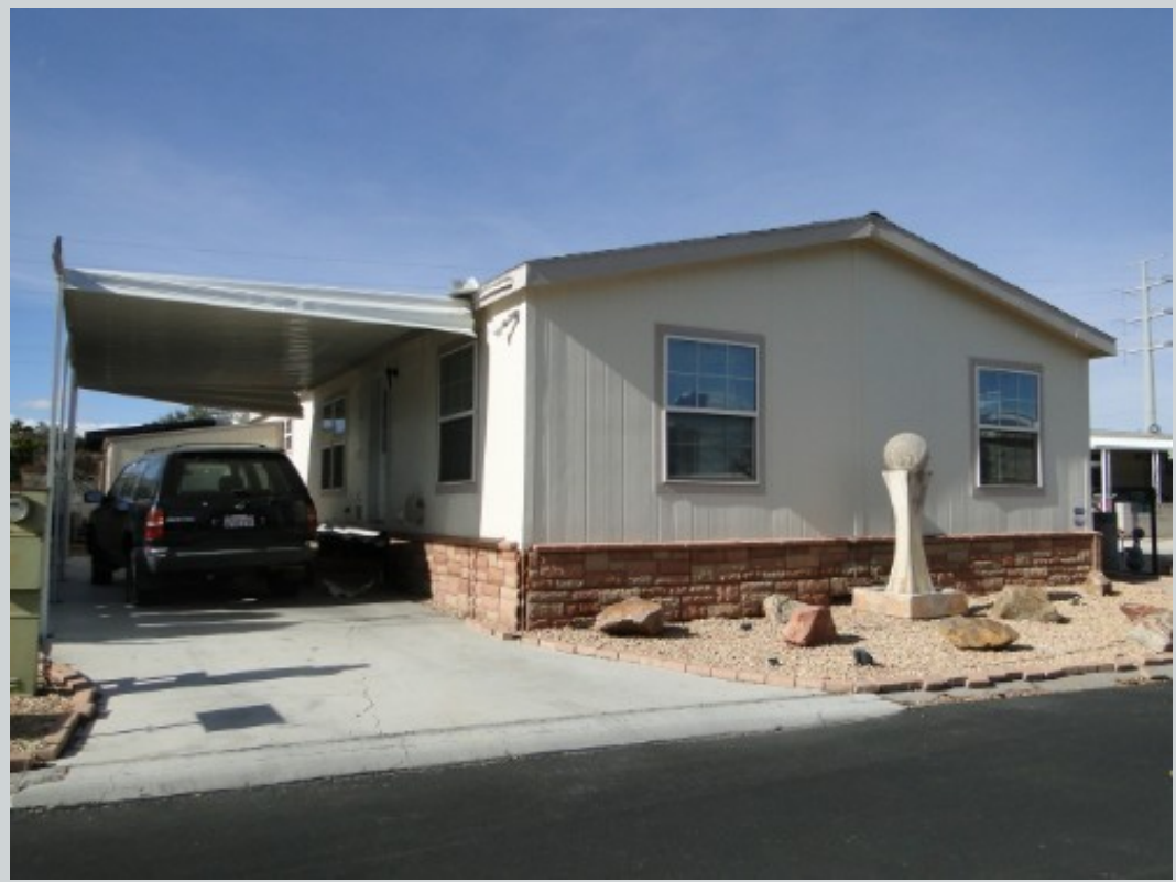
Subject 4575 Royal Ridge Ln