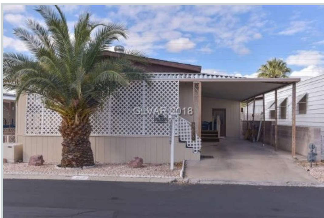
Sold Comp 2