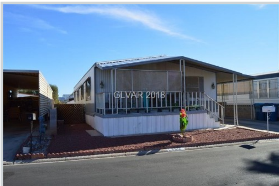
Listing Comp 1