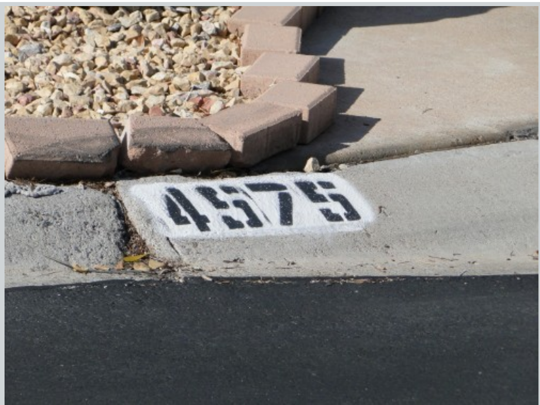
Subject 4575 Royal Ridge Ln