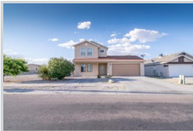
Listing Comp 3 8523 Stony Creek Rd Sw View Front