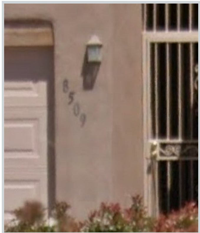
Subject 8509 Zydecko Ave Sw