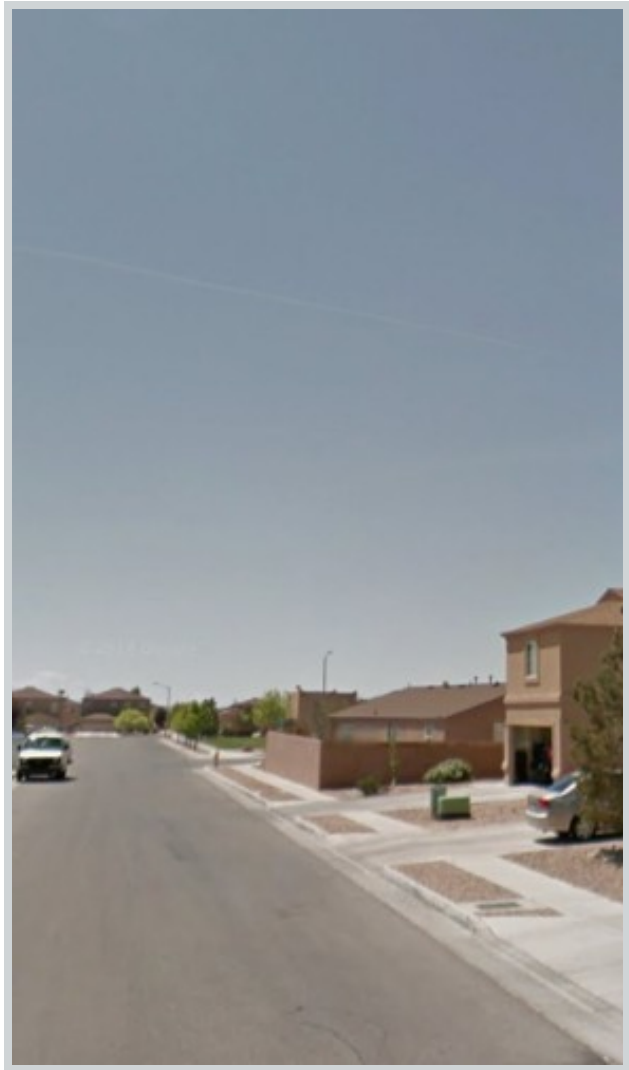
Subject 8509 Zydecko Ave Sw View Street