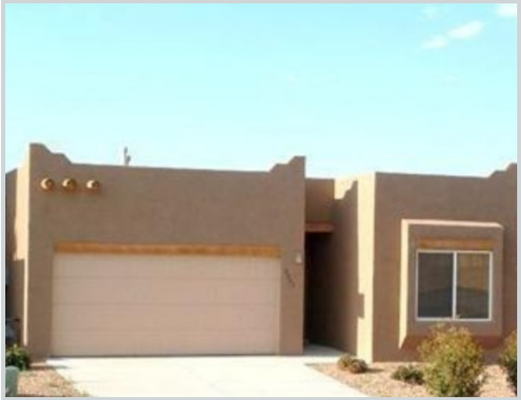
Subject 8509 Zydecko Ave Sw