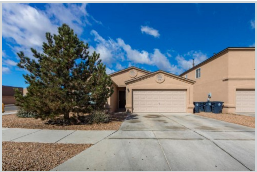
Sold Comp 2 3231 Mata Ortiz Dr Sw