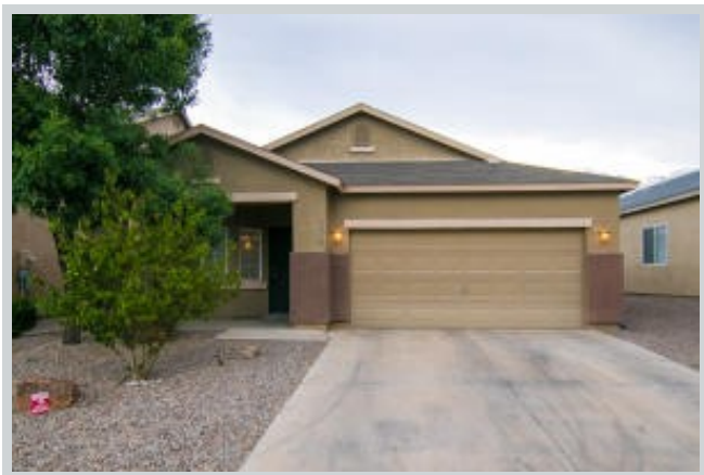
Sold Comp 3 9812 Inniskillin Ave Sw View Front