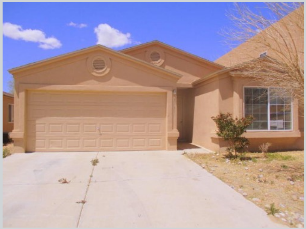
Sold Comp 1 3135 El Caballero Dr Sw