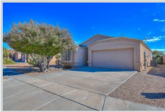
Listing Comp 2 3200 Mata Ortiz Dr Sw View Front