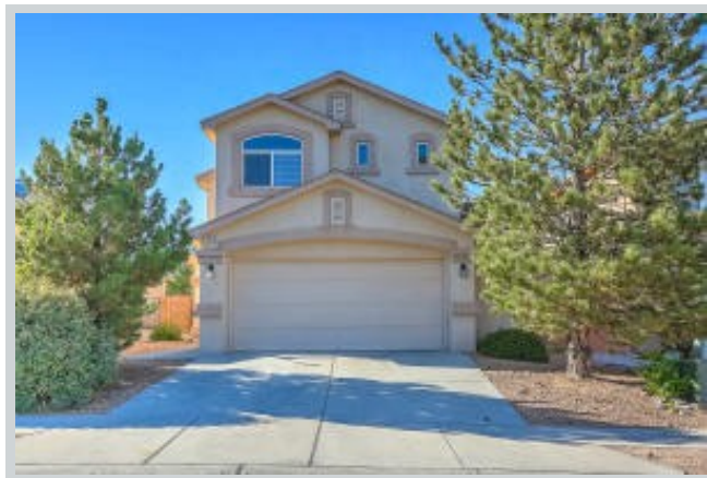
Listing Comp 1 9115 Indigo Sky Trl Sw View Front