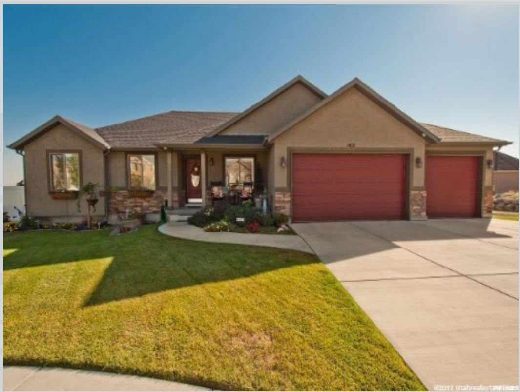
Sold Comp 1