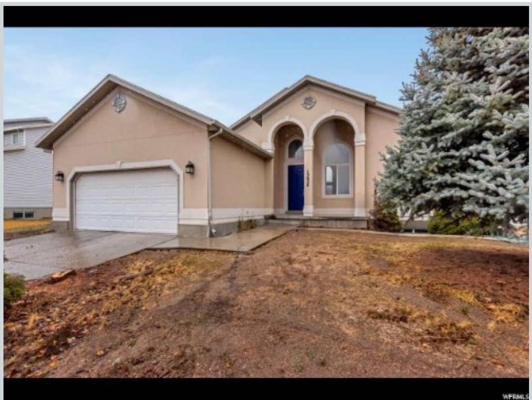
Listing Comp 2 13624 Eglantina Dr