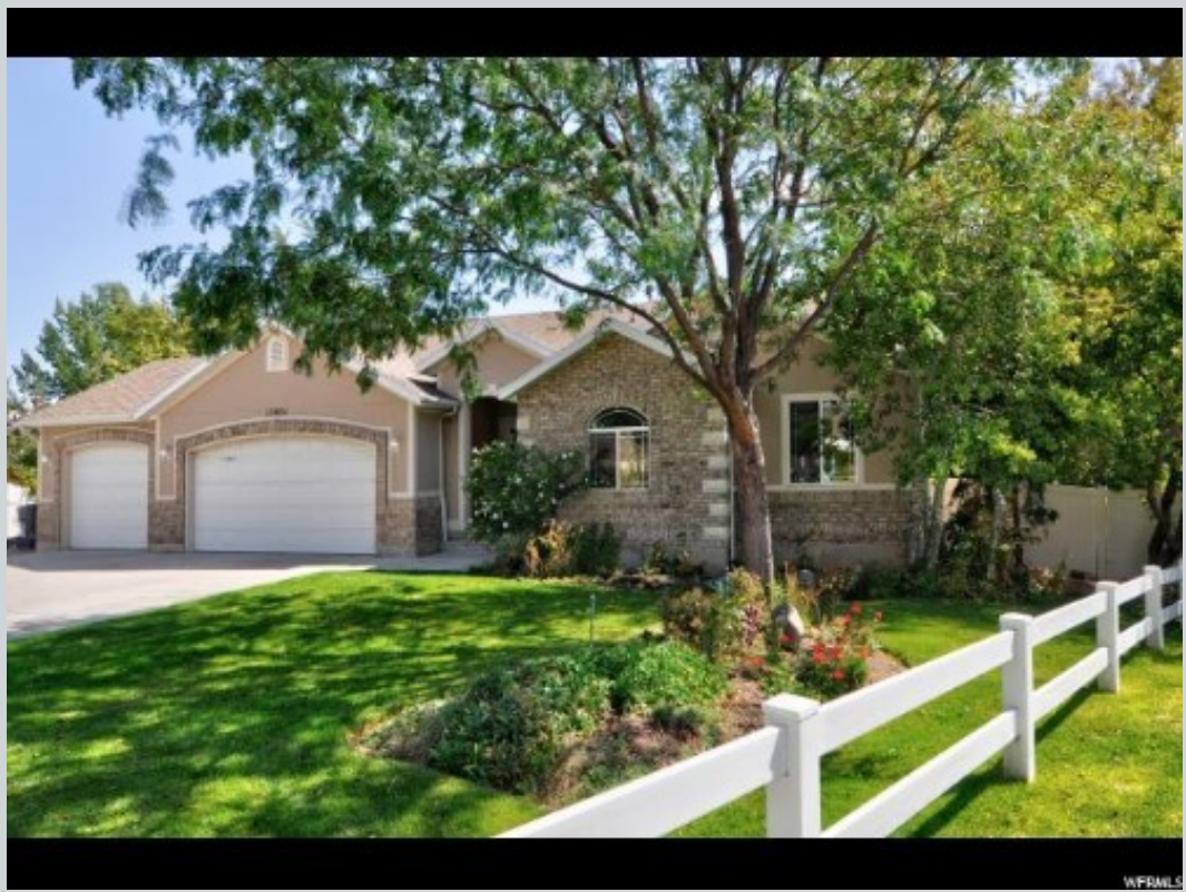
Listing Comp 3 13851 April Moon Cv