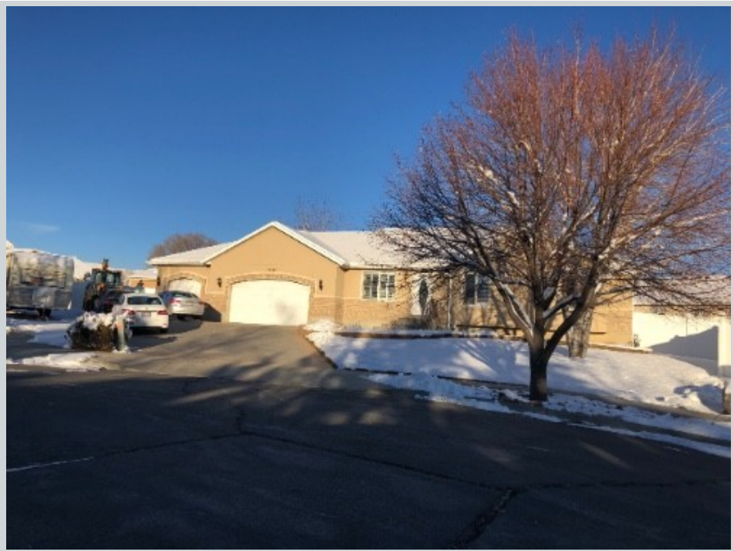
Subject 13852 S April Moon Cv