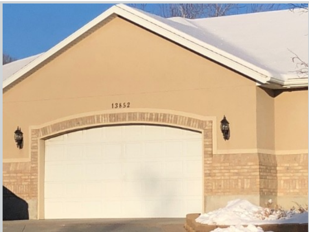
Subject 13852 S April Moon Cv