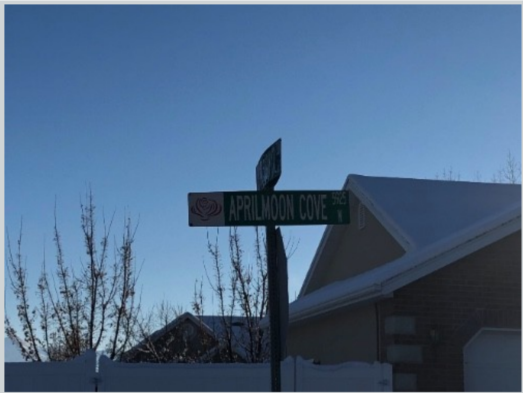
Subject 13852 S April Moon Cv