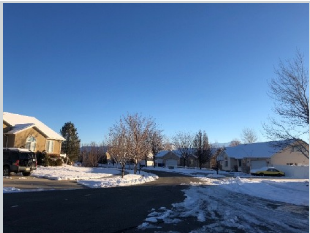
Subject 13852 S April Moon Cv