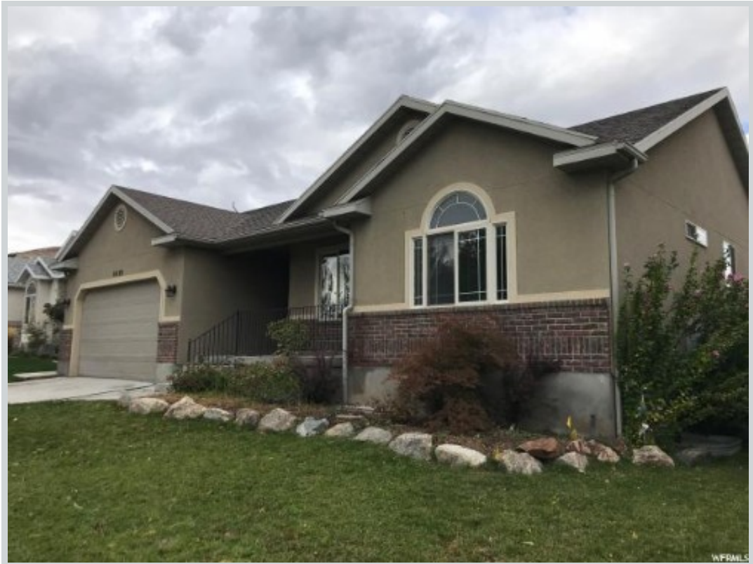
Listing Comp 1 14128 Crown Rose