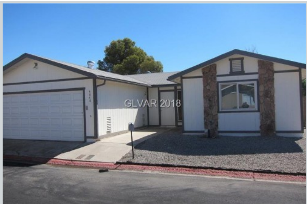
Listing Comp 1 4848 Val Verde Ct