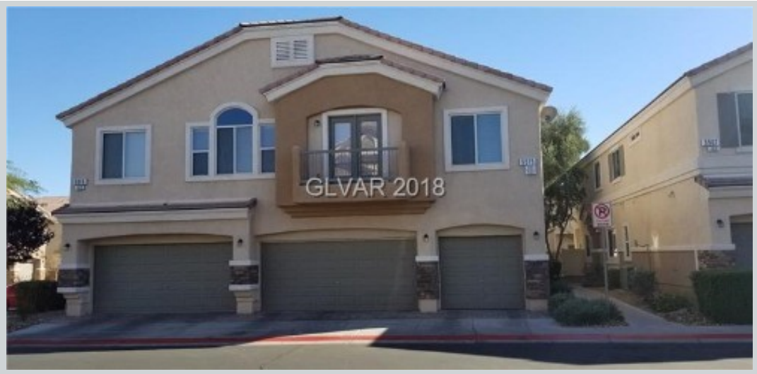
Listing Comp 2 5519 Big Red Ct #101