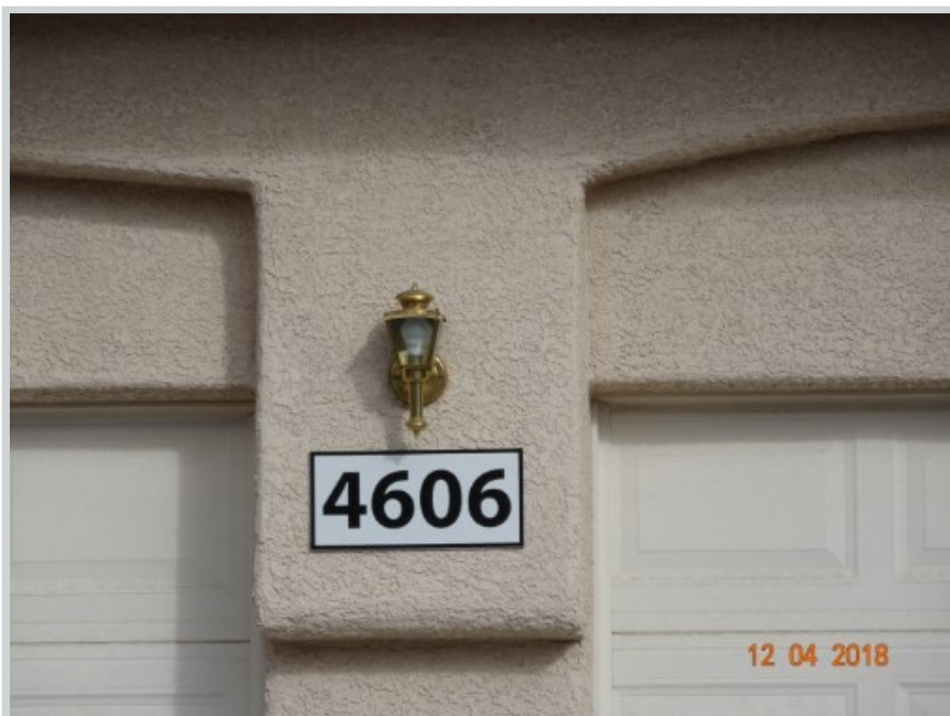
Subject 4606 Jokers Wild Ct Unit 102