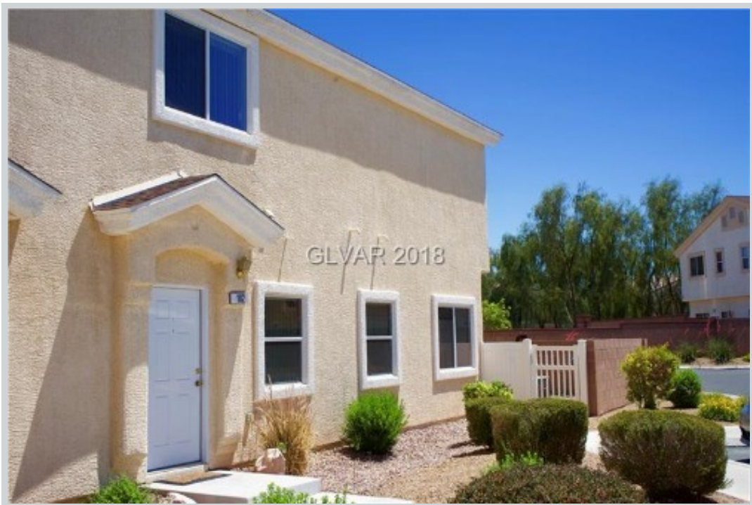
Sold Comp 1 5509 Stacked Chips Rd #102