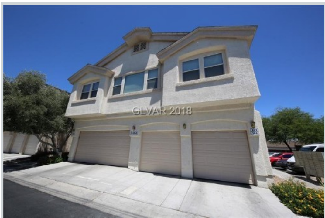
Sold Comp 2 5552 Jackpot Winner Ln #102