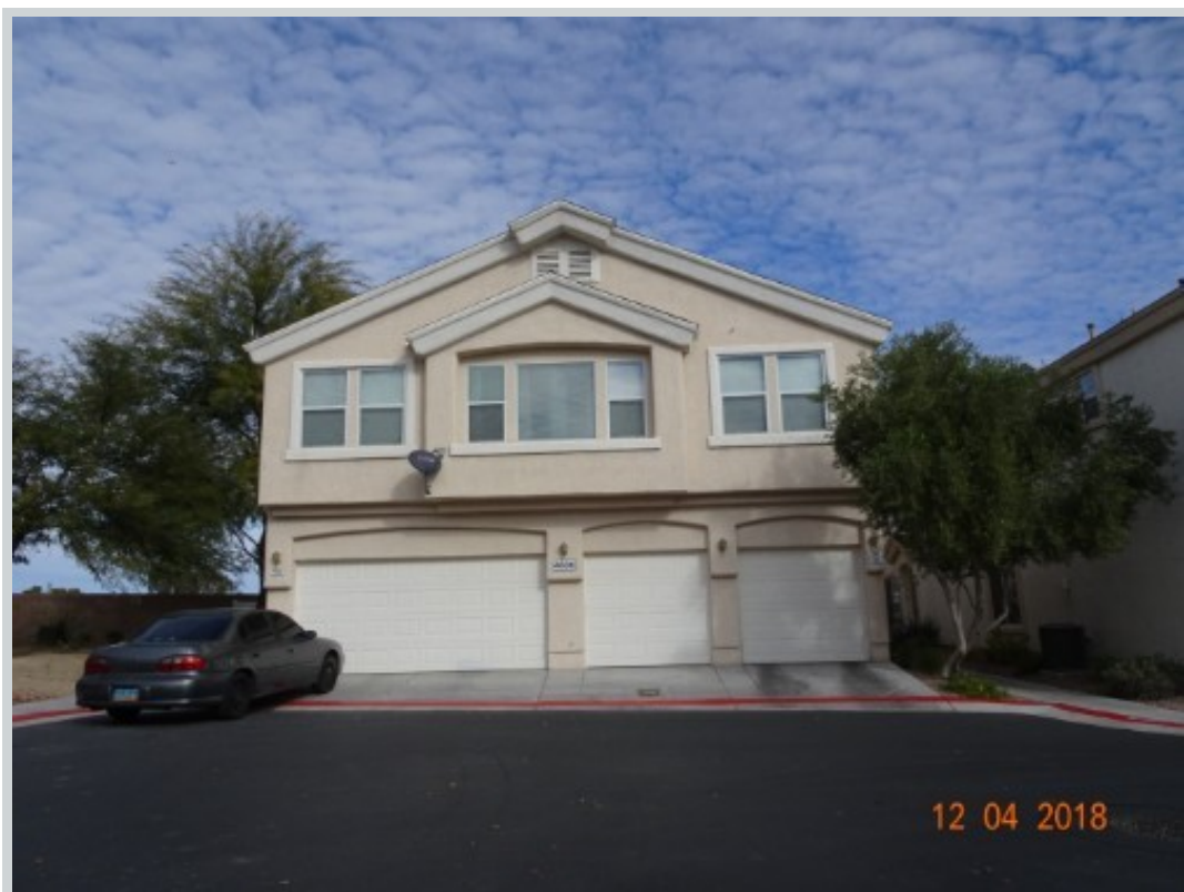
Subject 4606 Jokers Wild Ct Unit 102