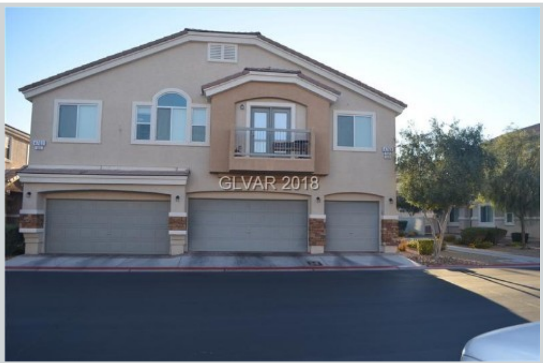
Listing Comp 3 4763 Straight Flush Dr #102