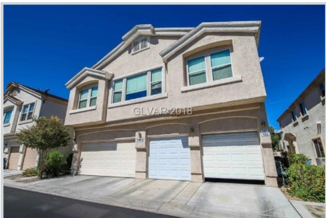
Sold Comp 3 5464 Stacked Chips Rd #102