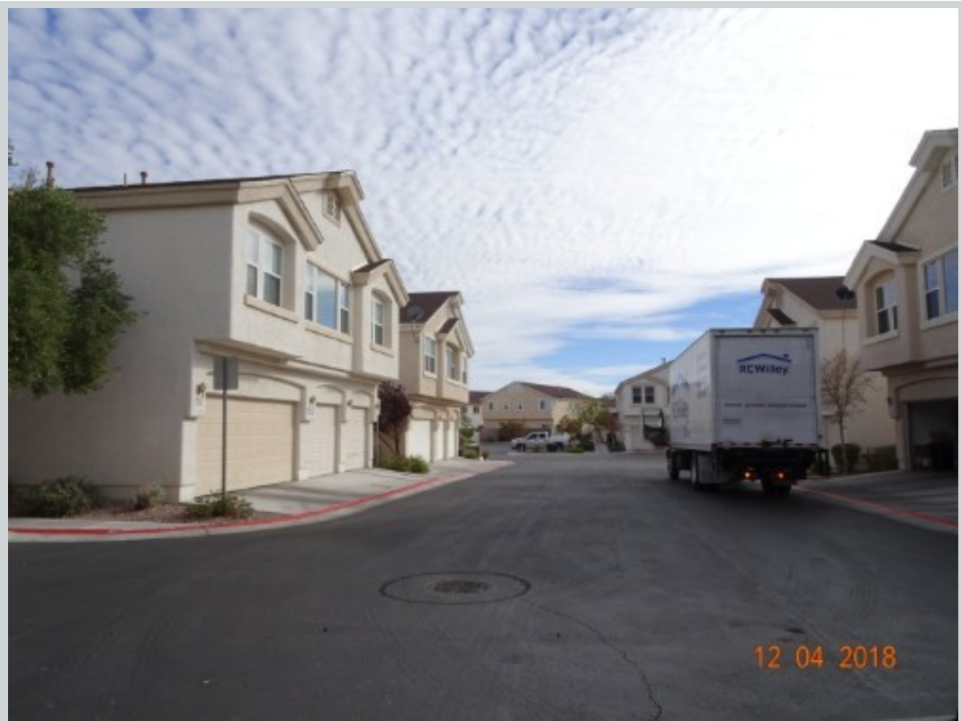
Subject 4606 Jokers Wild Ct Unit 102