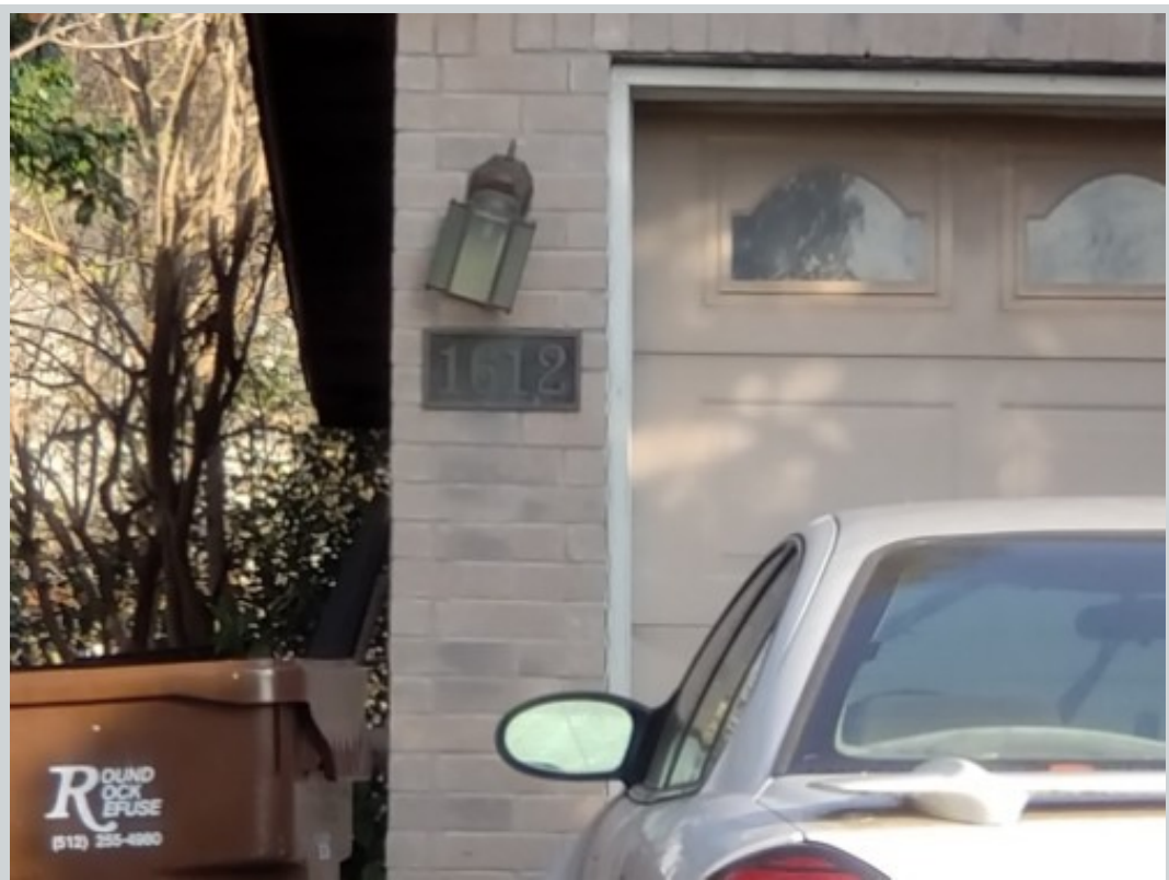
Subject 1612 Sylvia Ln