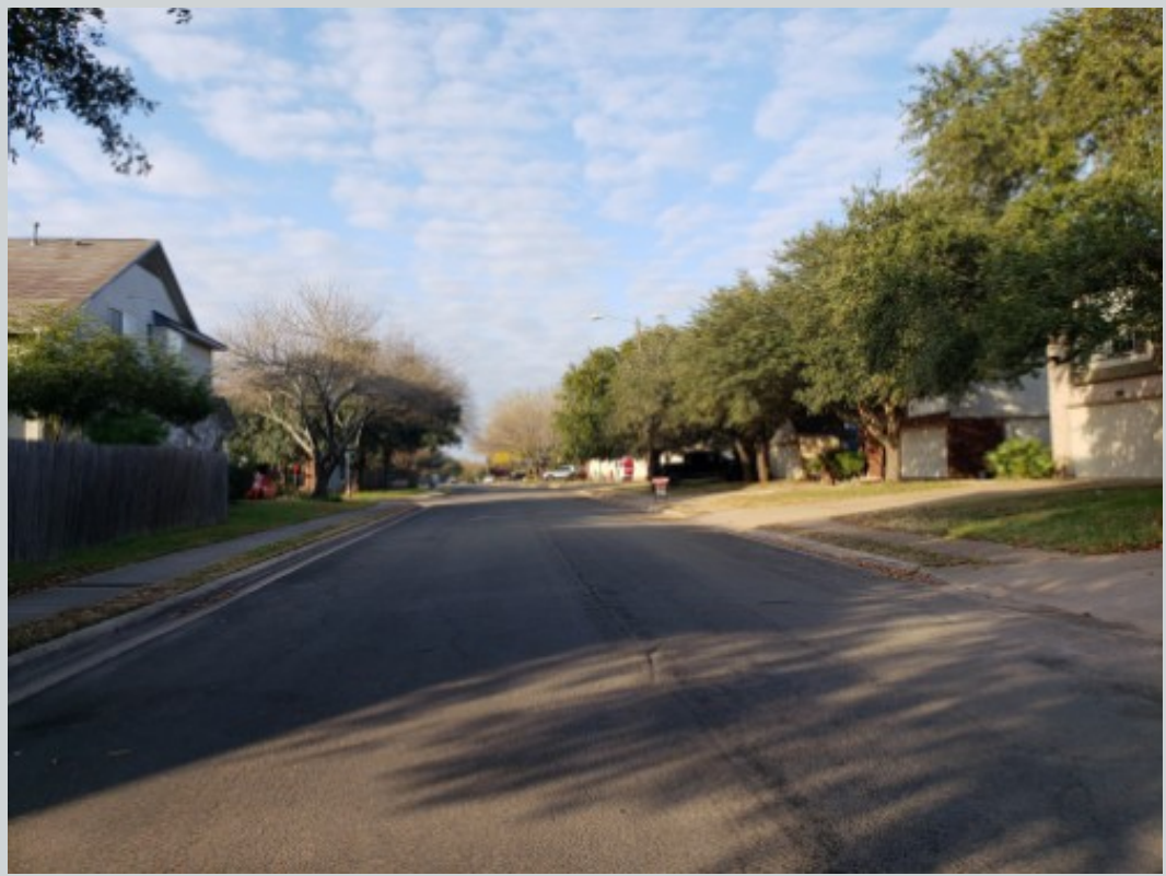
Subject 1612 Sylvia Ln