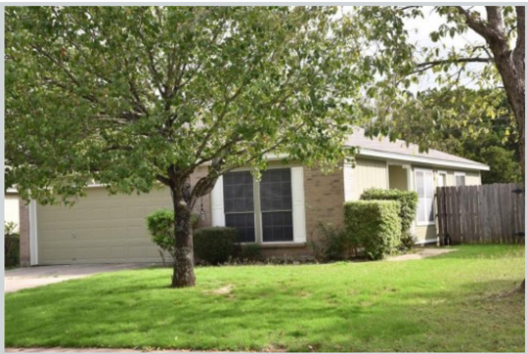
Listing Comp 3 1501 Hollow Tree Blvd