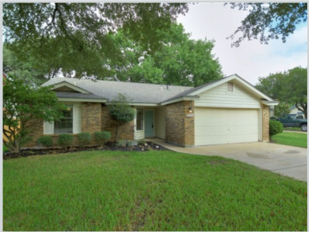
Sold Comp 3 1712 Brokenshoe Dr