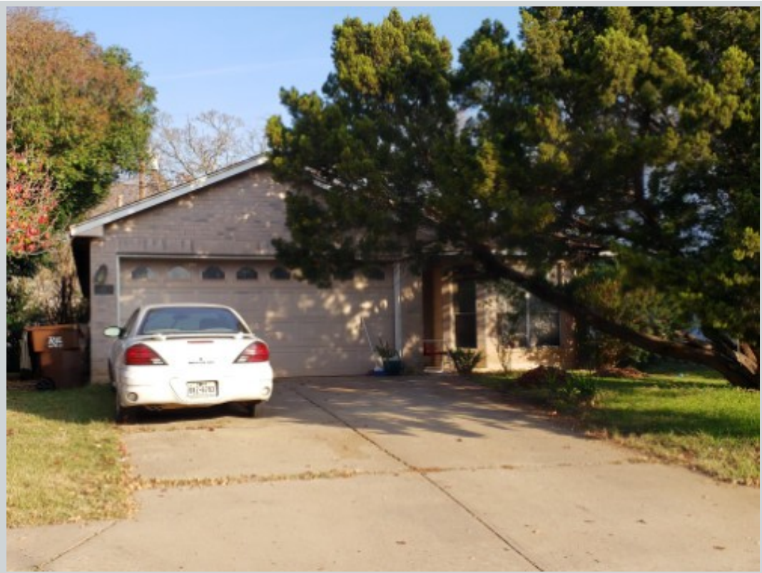
Subject 1612 Sylvia Ln