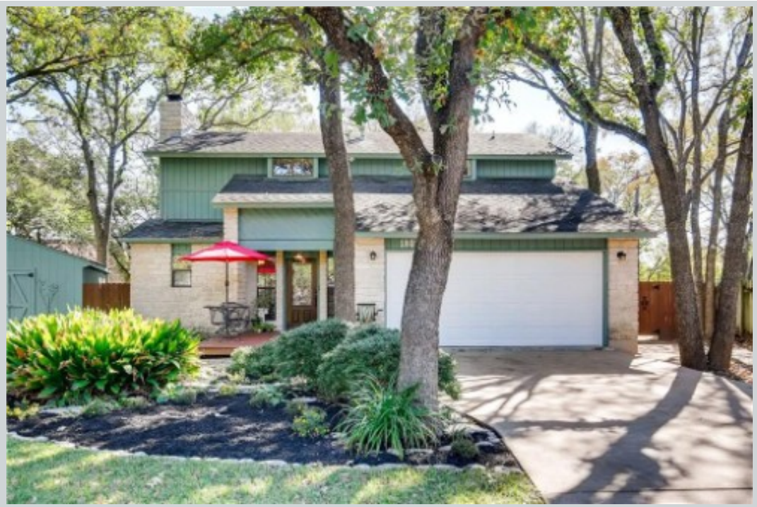
Listing Comp 2 1803 Stagecoach Trl