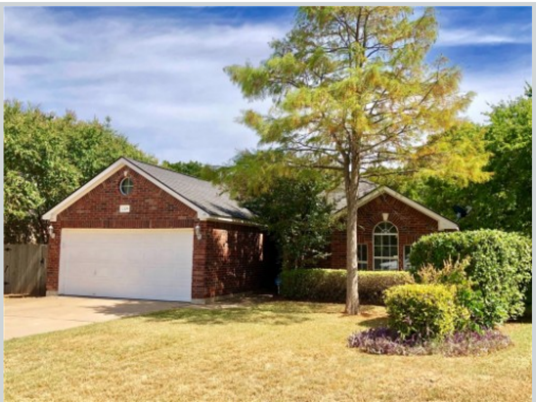
Sold Comp 2 2209 Grove Dr