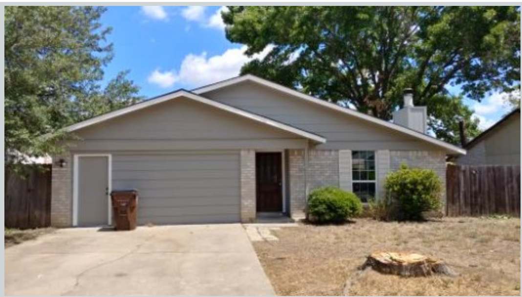
Listing Comp 1 1802 Cameo Dr