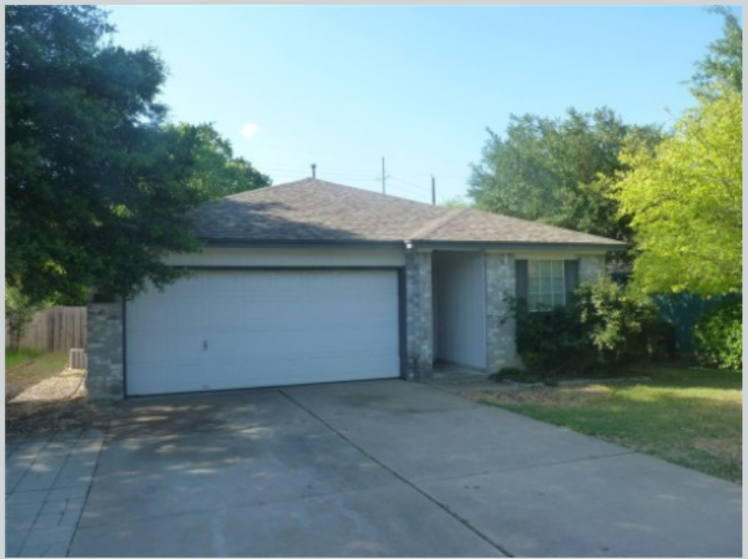
Sold Comp 1 1402 Somerset Dr