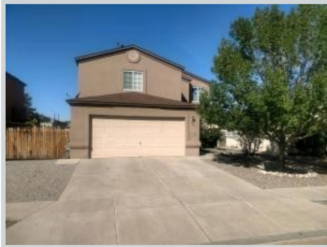
Listing Comp 2 519 Whispering St Sw View Front