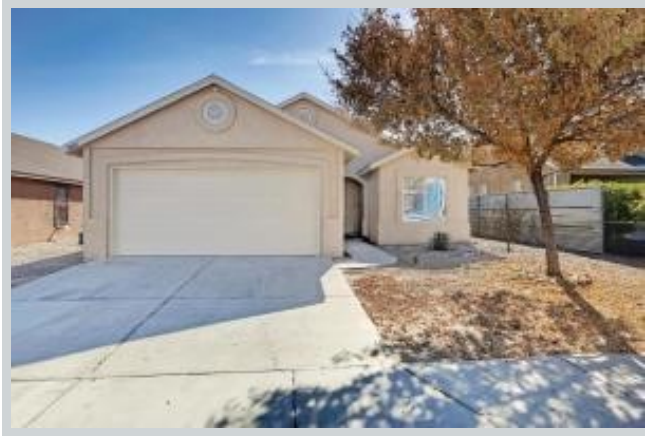
Listing Comp 1 8808 Templeton Ave Sw View Front