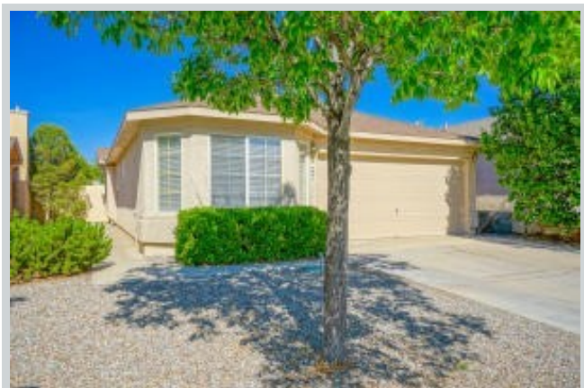
Sold Comp 3 627 Vista Luna Ln Sw View Front