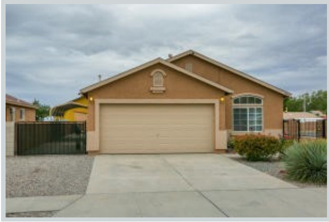
Listing Comp 3 9312 Libro Iluminado Ct Sw View Front