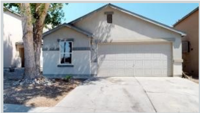
Sold Comp 1 8915 Round Rock Rd Sw View Front