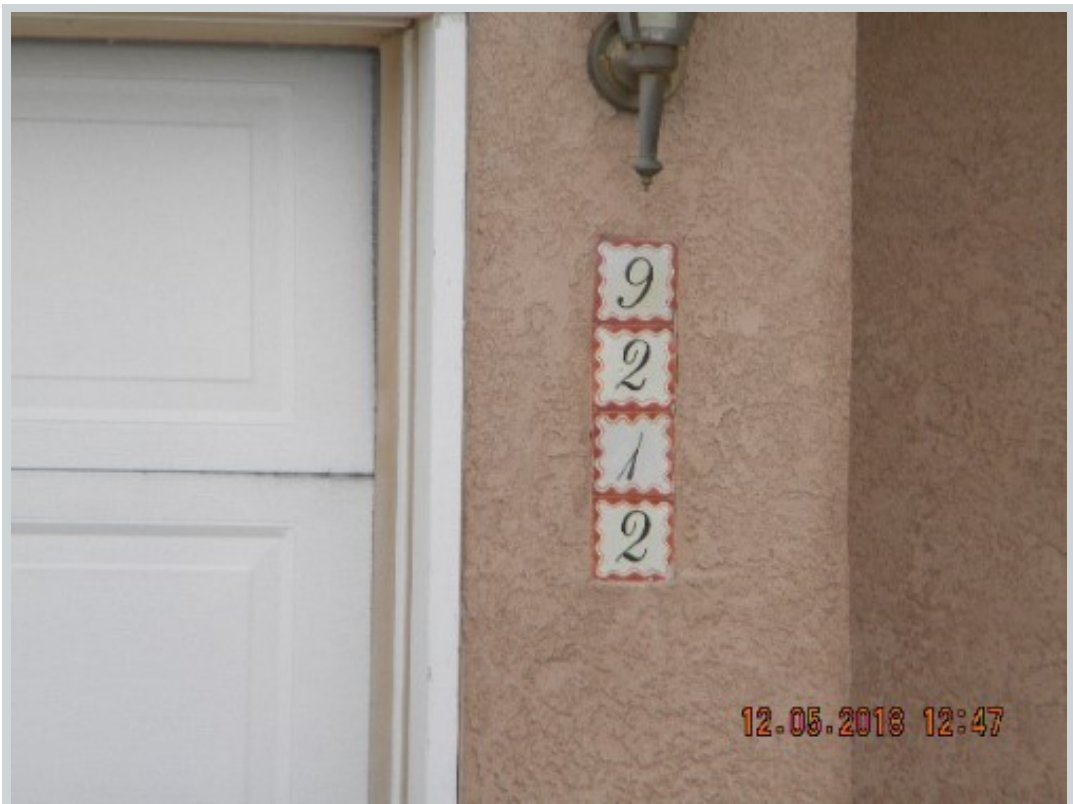
Subject 9212 Eiffel Ave Sw