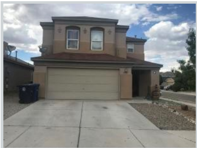
Sold Comp 2 8909 Round Rock Rd Sw View Front

Address 9212 Eiffel Avenue Sw, Albuquerque, NM 87121 Loan Number 36642 Suggested List $165,000 Suggested Repaired $169,000 Sale $163,000