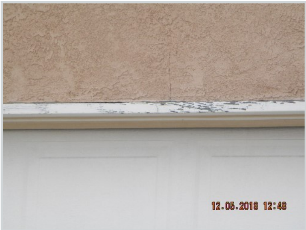
Subject 9212 Eiffel Ave Sw Comment "Exterior paint"

Address 9212 Eiffel Avenue Sw, Albuquerque, NM 87121 Loan Number 36642 Suggested List $165,000 Suggested Repaired $169,000 Sale $163,000