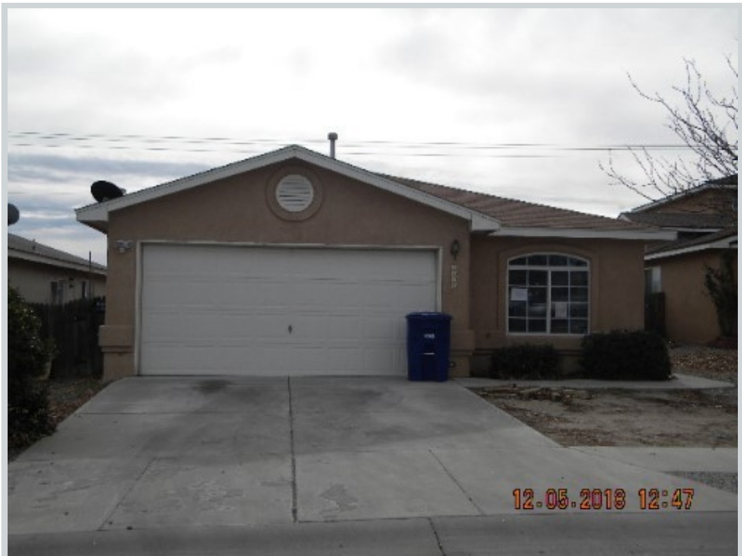
Subject 9212 Eiffel Ave Sw