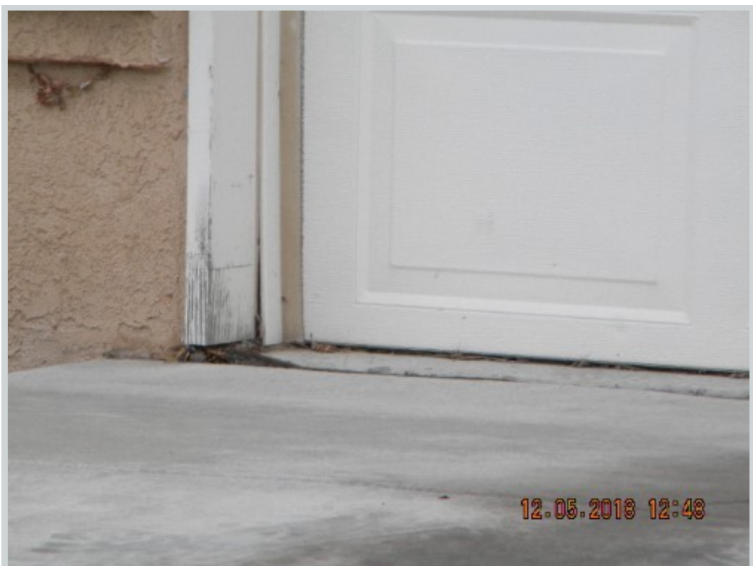
Subject 9212 Eiffel Ave Sw Comment "Exterior paint"