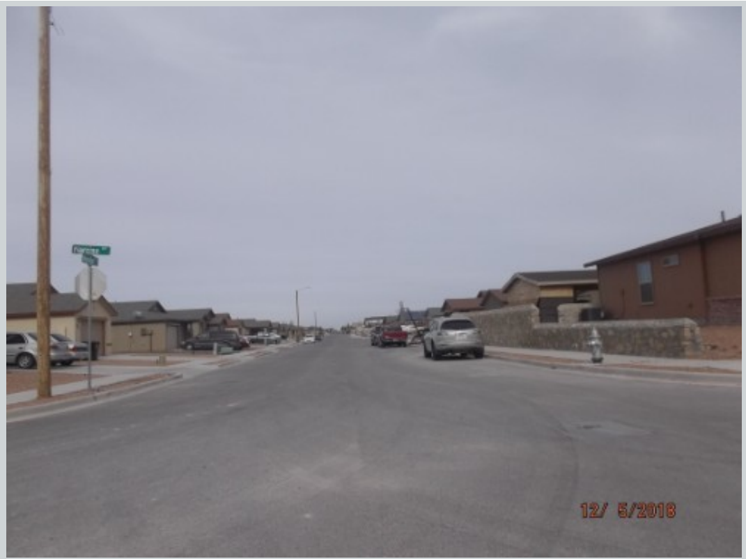
Subject 917 Maravillas St