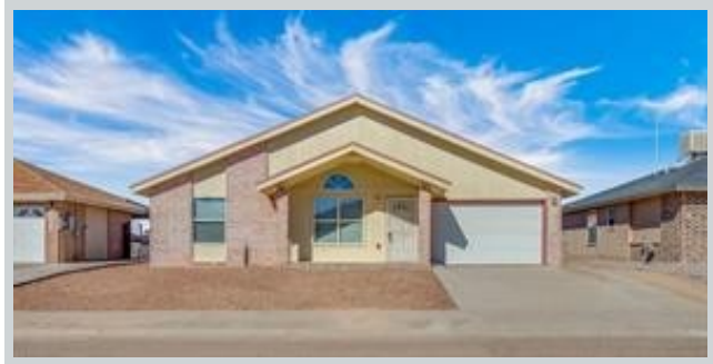
Listing Comp 3 14337 Desierto Bueno View Front