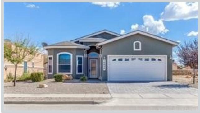
Sold Comp 3 14456 Corby