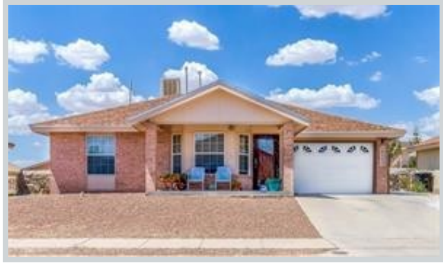
Sold Comp 1 14333 Desierto Bello View Front