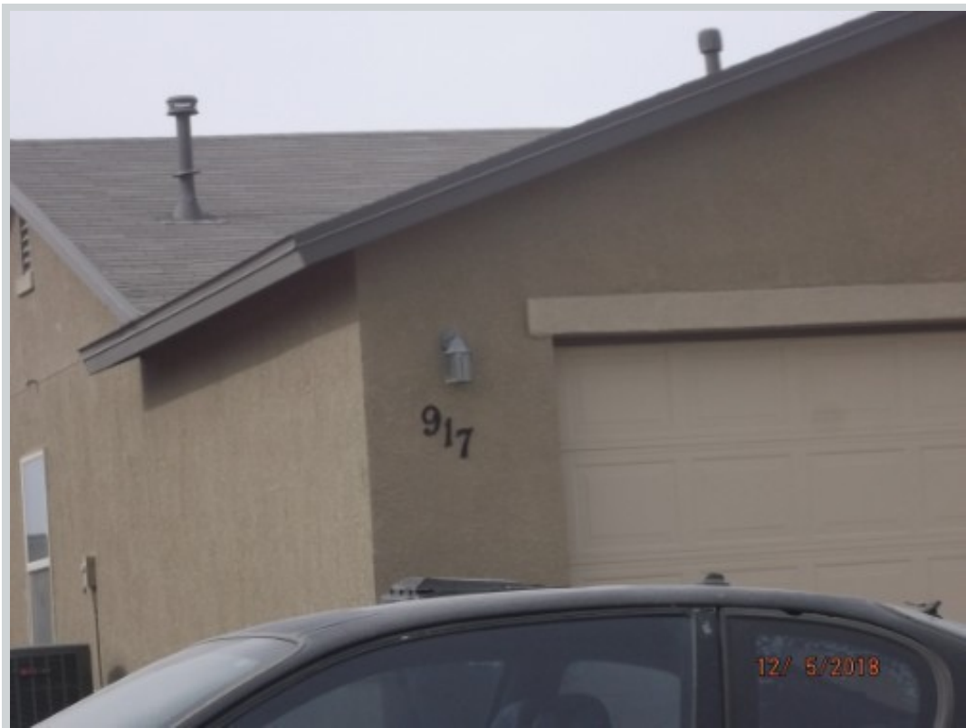
Subject 917 Maravillas St