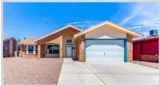
Listing Comp 2 14525 Desierto Lindo View Front