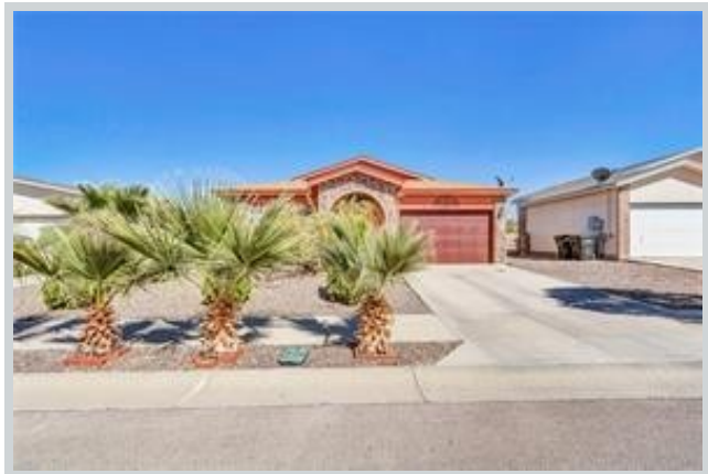
Sold Comp 2 616 Maravillas View Front