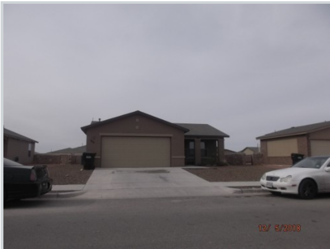
Subject 917 Maravillas St