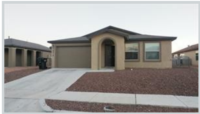
Listing Comp 1 14516 Escalera