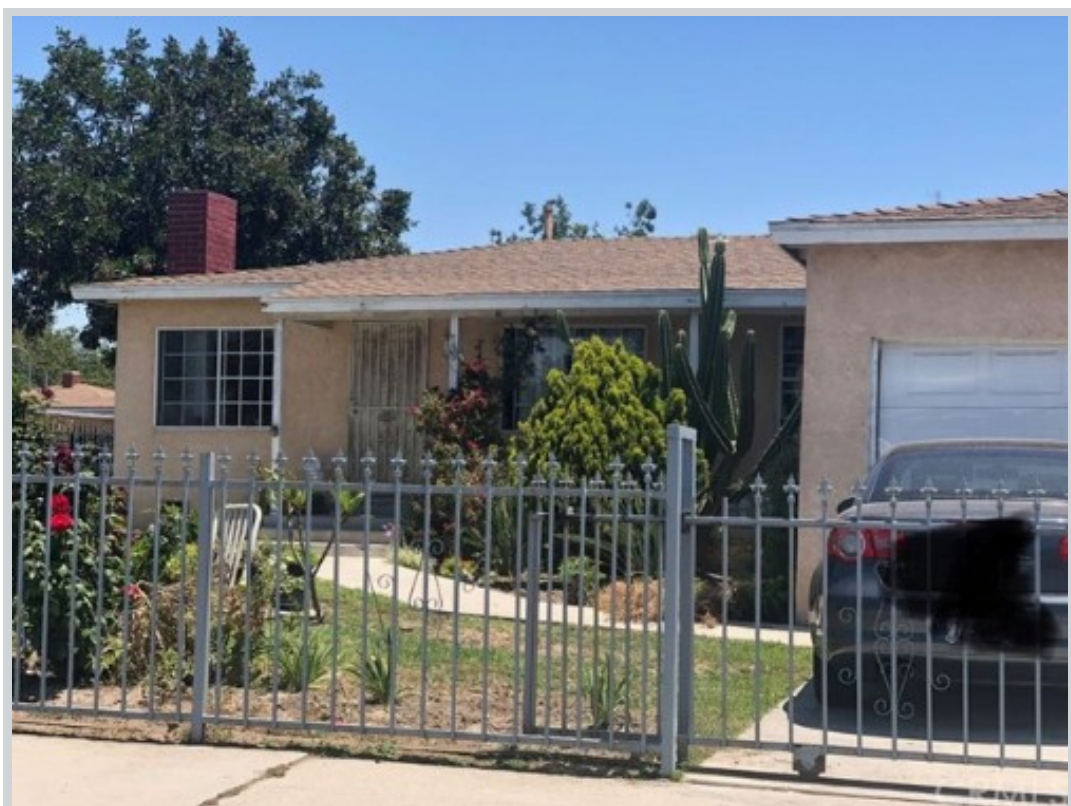
Sold Comp 1 10100 Courtney St View Front