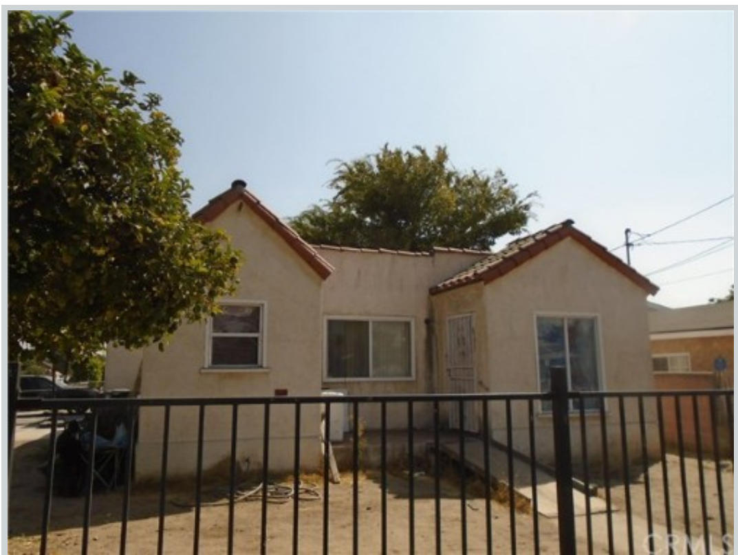
Listing Comp 2 8704 Beach St