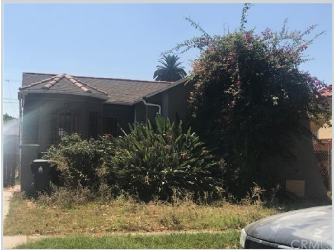
Listing Comp 1 842 E 82nd St