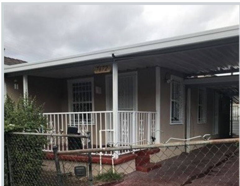
Listing Comp 3 7672 Parmelee Ave View Front

Address 8833 Mary Avenue, Los Angeles, CA 90002 Loan Number 36644 Suggested List $375,000 Suggested Repaired $375,000 Sale $365,000