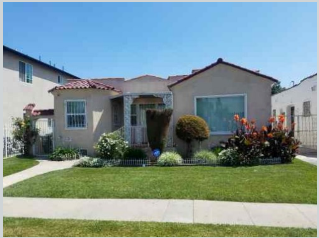
Sold Comp 2 850 E 80th St