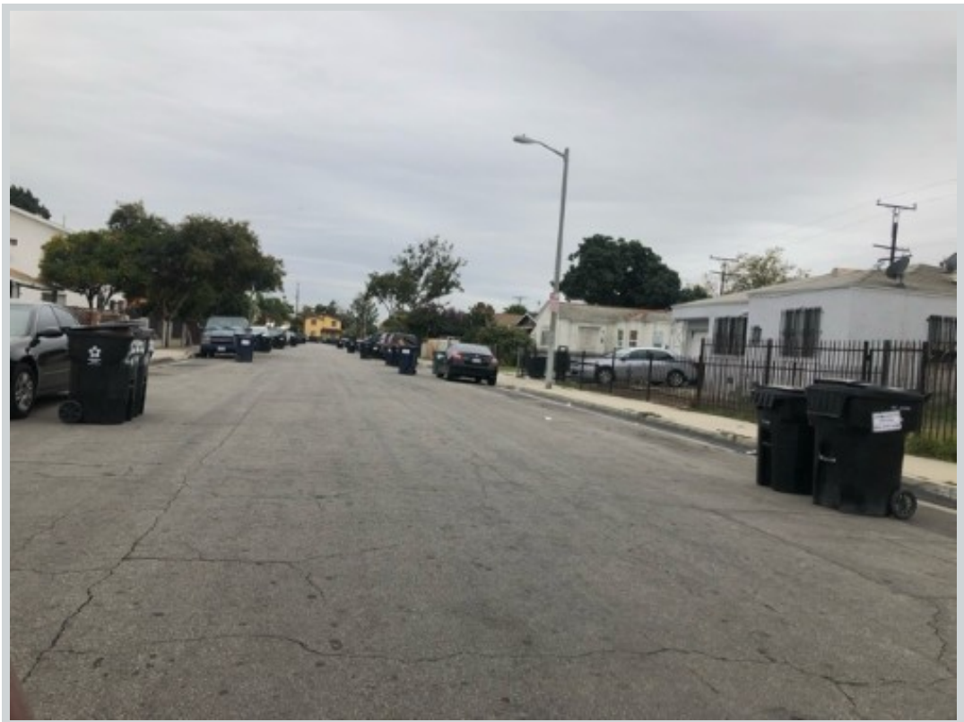
Subject 8833 Mary Ave