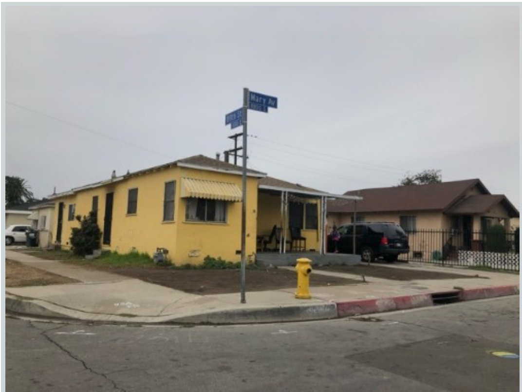
Subject 8833 Mary Ave