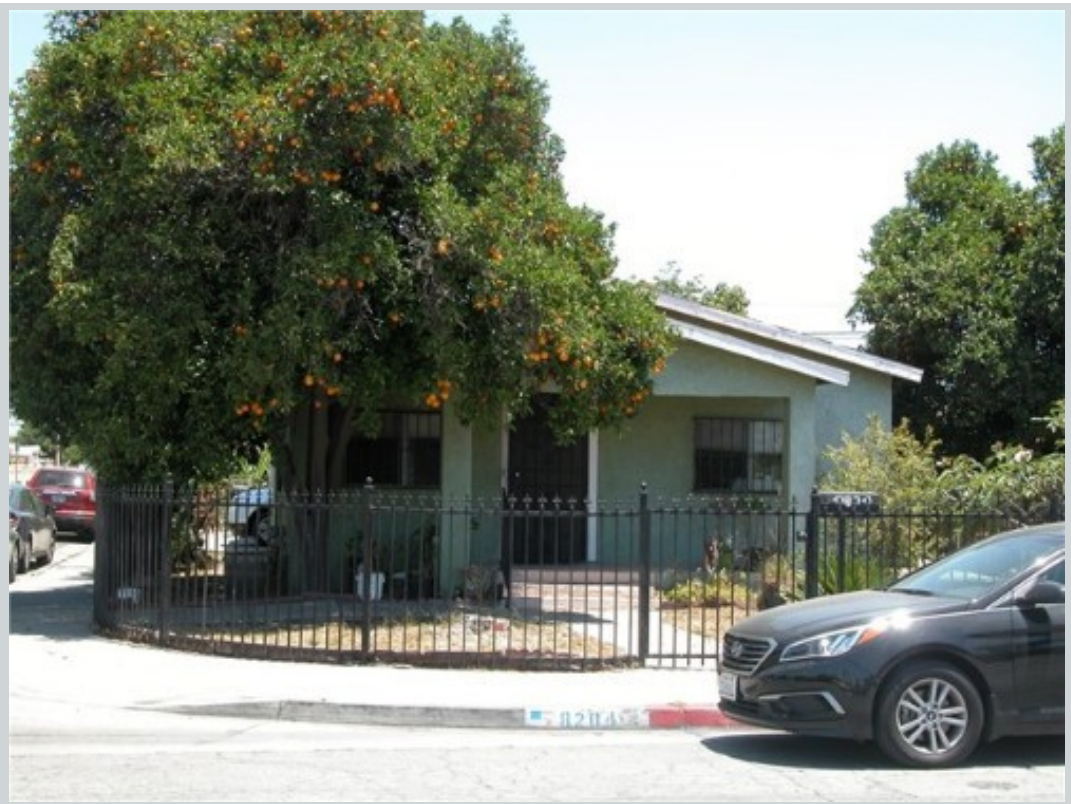
Sold Comp 3 8204 Holmes Ave