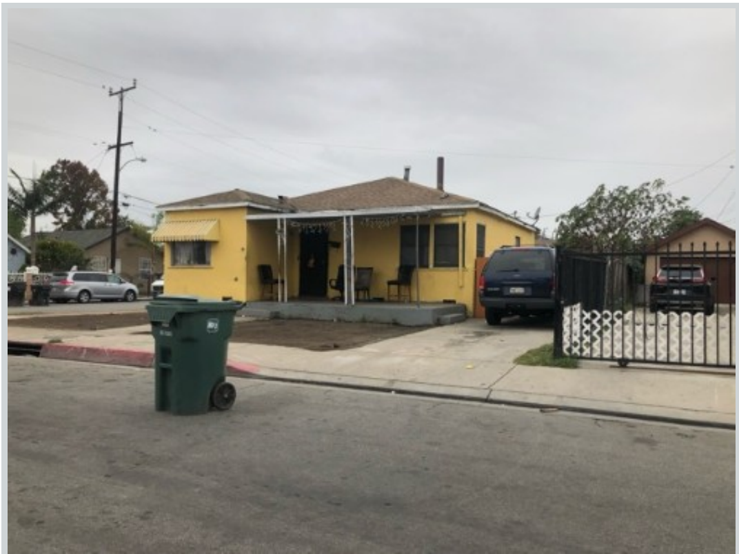
Subject 8833 Mary Ave