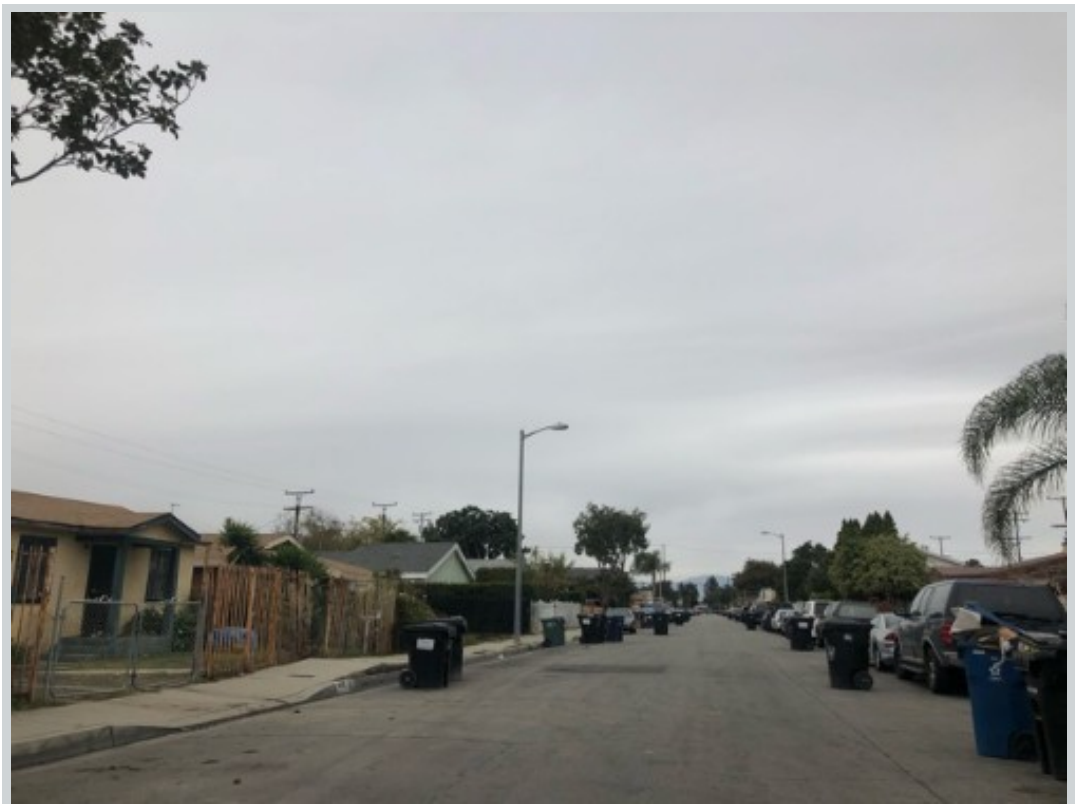
Subject 8833 Mary Ave