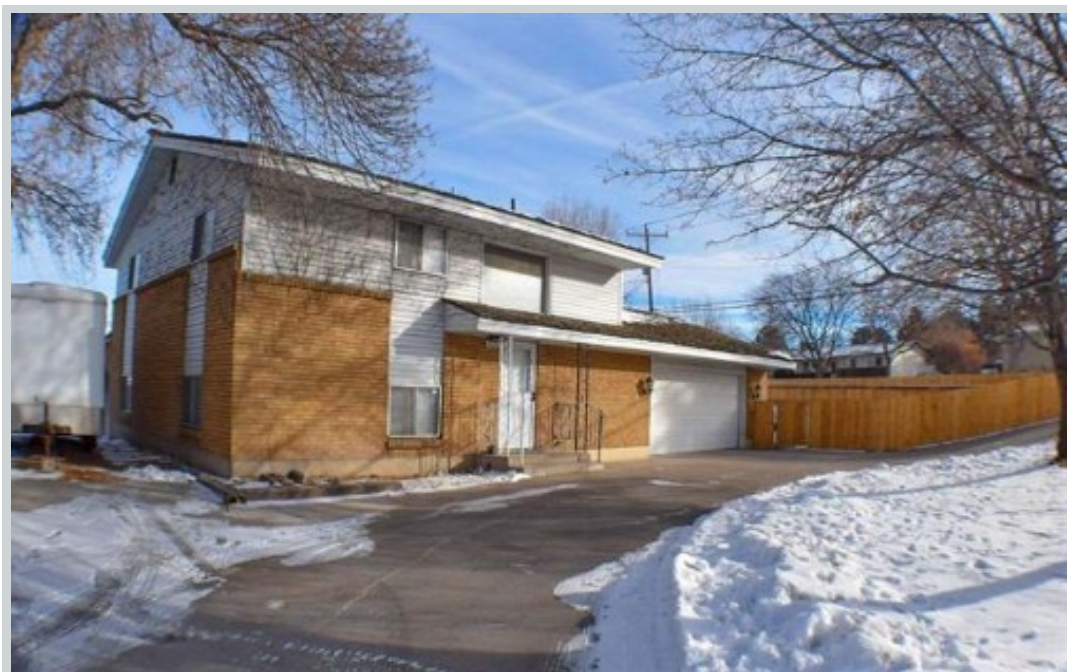
Listing Comp 1 1616 Monte Vista