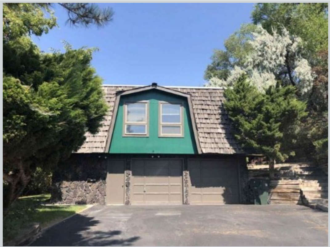
Sold Comp 3 275 Hewlett