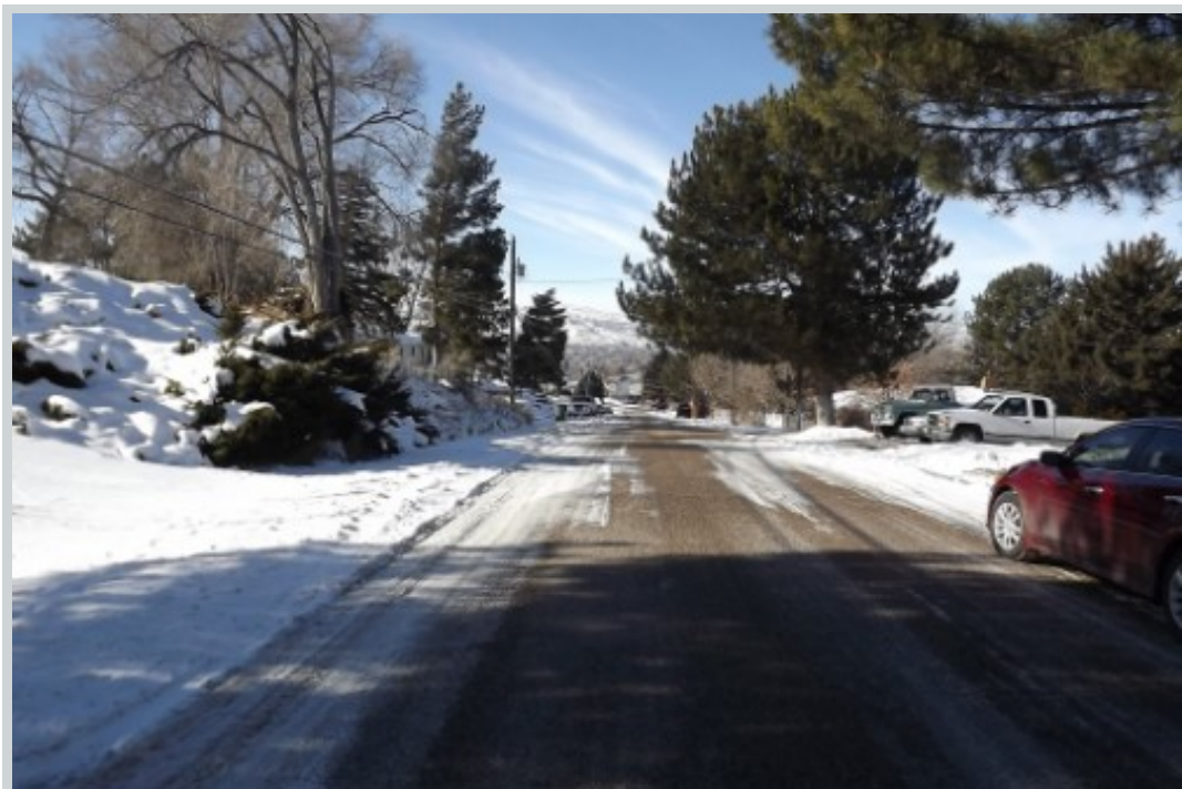
Subject 1661 Beth St

Address 1661 Beth Street, Pocatello, IDAHO 83201 Loan Number 36656 Suggested List $209,900 Suggested Repaired $209,900 Sale $205,900