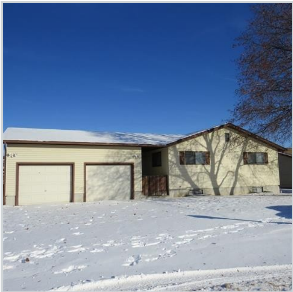
Listing Comp 3 2034 Monte Vista