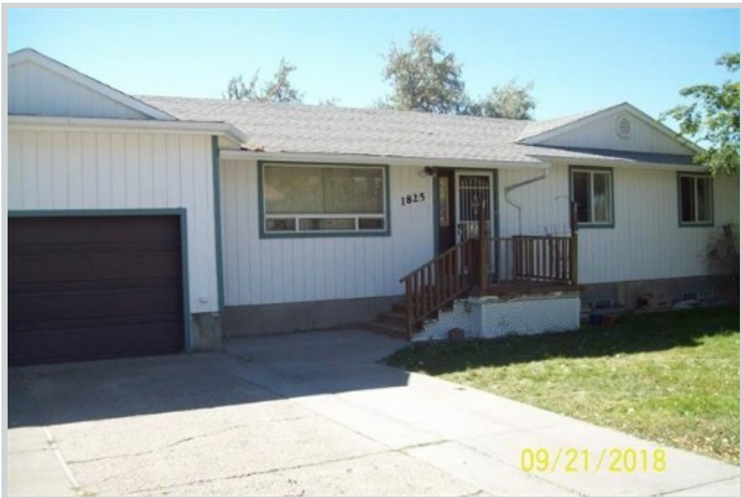
Sold Comp 1 1825 Ardella

Address 1661 Beth Street, Pocatello, IDAHO 83201 Loan Number 36656 Suggested List $209,900 Suggested Repaired $209,900 Sale $205,900