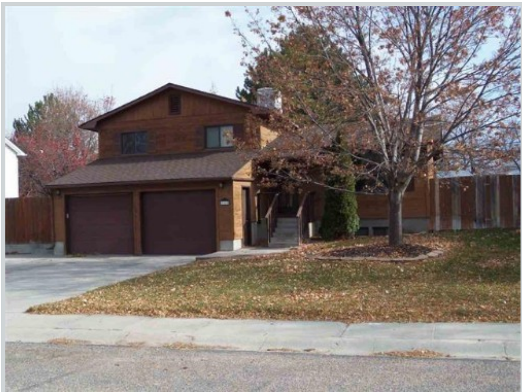
Sold Comp 2 1610 Shasta