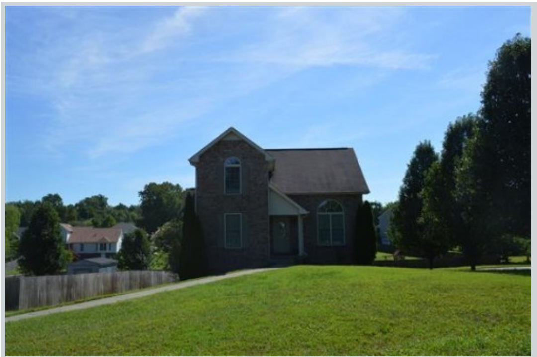
Listing Comp 2 1023 Bluejay Ln View Front Comment "Listing 2"

Address 583 Press Grove, Clarksville, TN 37043 Loan Number 36657 Suggested List $231,000 Suggested Repaired $231,000 Sale $231,000