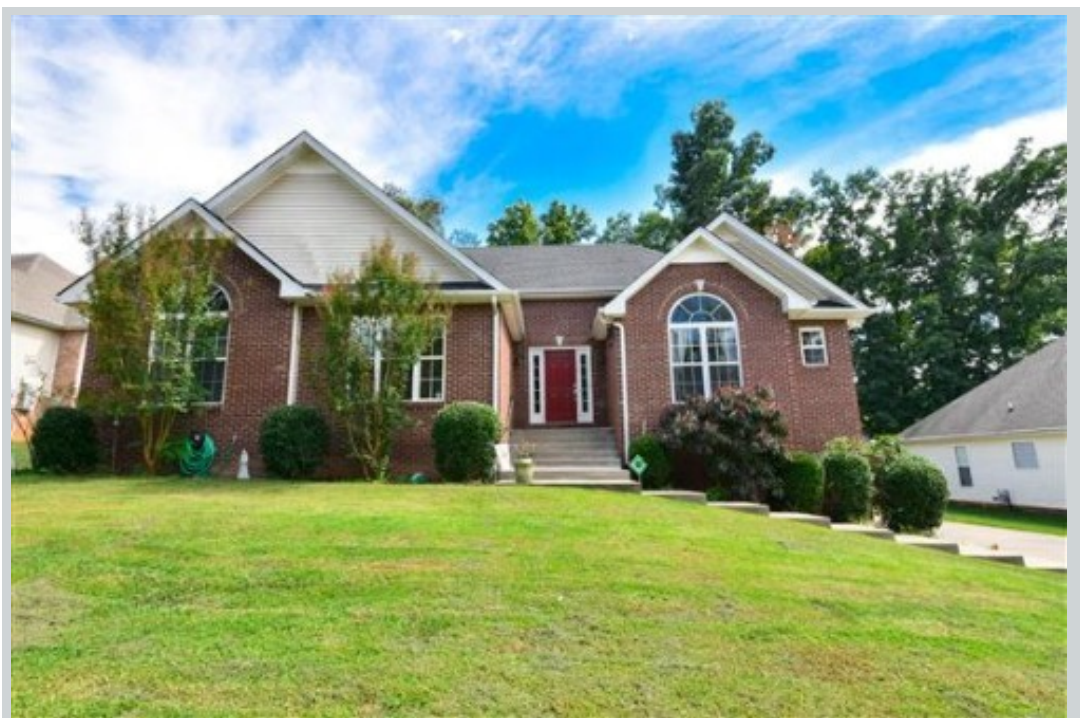
Listing Comp 3 4440 Taylor Hall Ln View Front Comment "Listing 3"