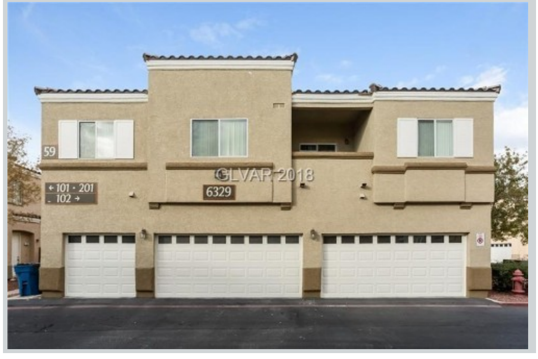
Listing Comp 1 6329 Sandy Ridge St #101