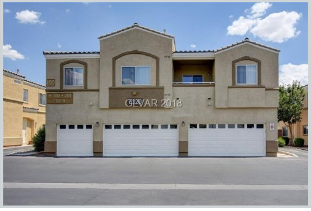
Listing Comp 3 6320 Desert Leaf St #102