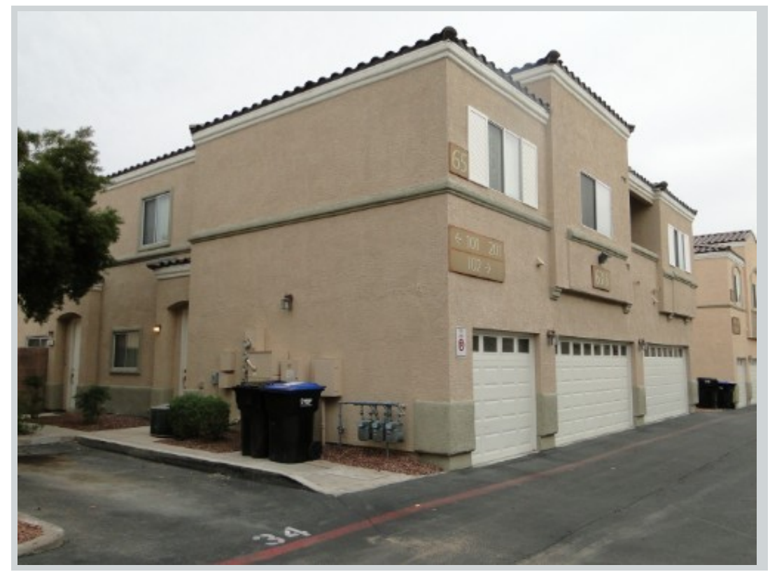
Subject 6316 Rolling Rose St Unit 101