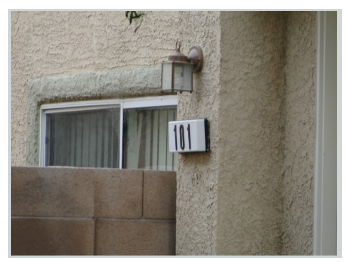
Subject 6316 Rolling Rose St Unit 101