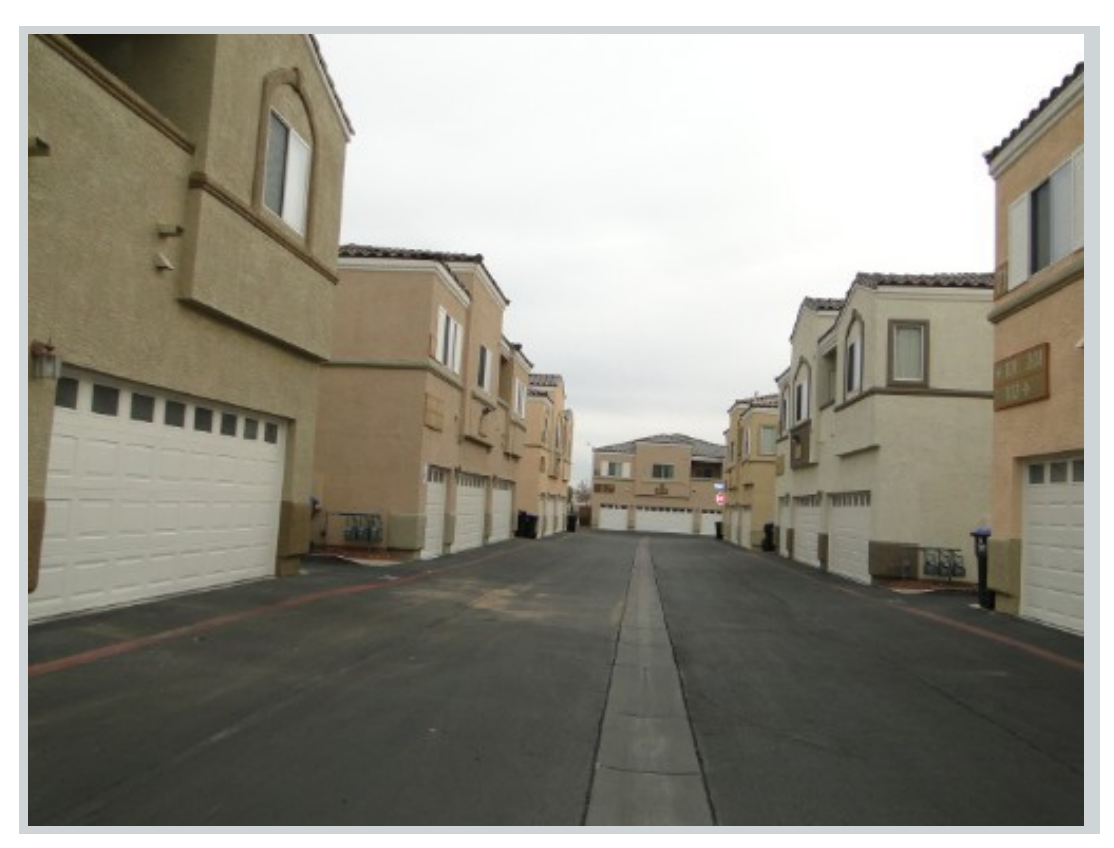
Subject 6316 Rolling Rose St Unit 101