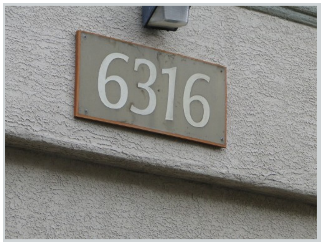
Subject 6316 Rolling Rose St Unit 101