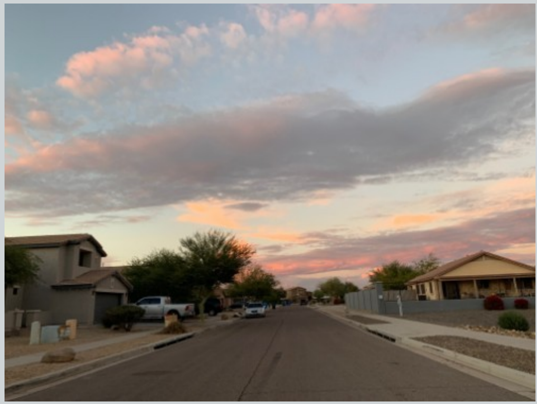
Subject 5404 S 55th Ave