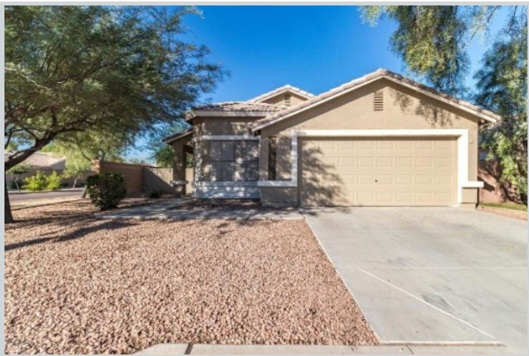
Listing Comp 3 6648 S 44th Ave