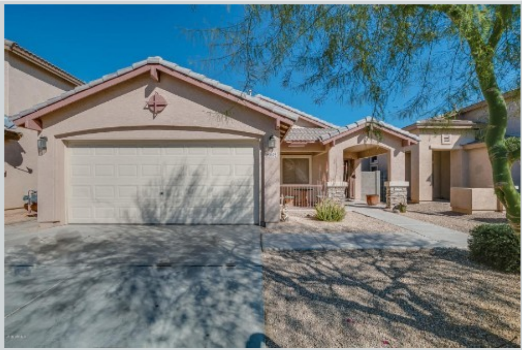
Sold Comp 1 5609 S 51st Dr