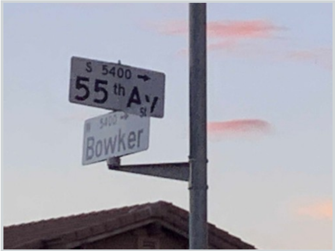
Subject 5404 S 55th Ave