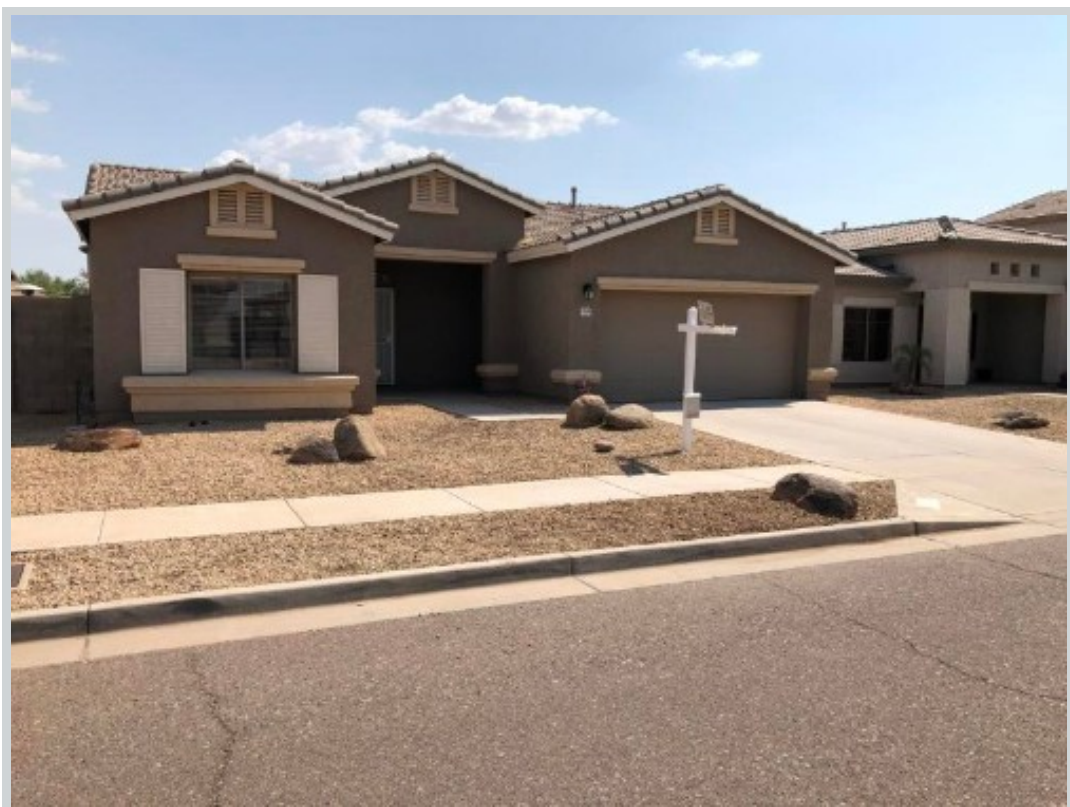
Sold Comp 3 5309 W Grenadine Rd