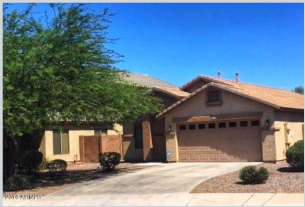
Listing Comp 2 4538 W Ellis St