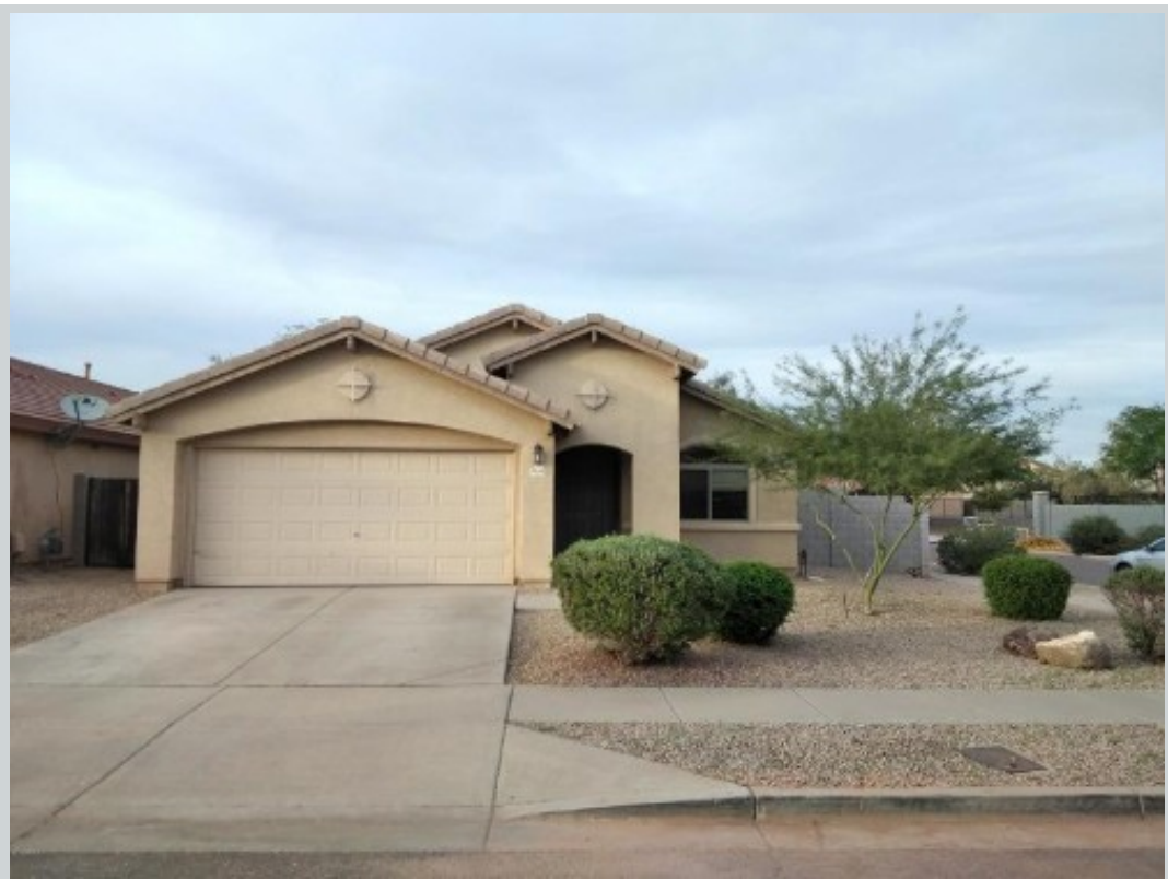
Listing Comp 1 5314 W Jessica Ln