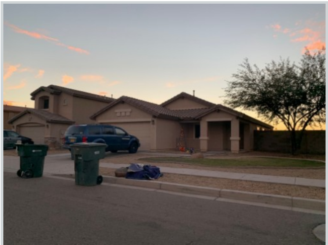
Subject 5404 S 55th Ave