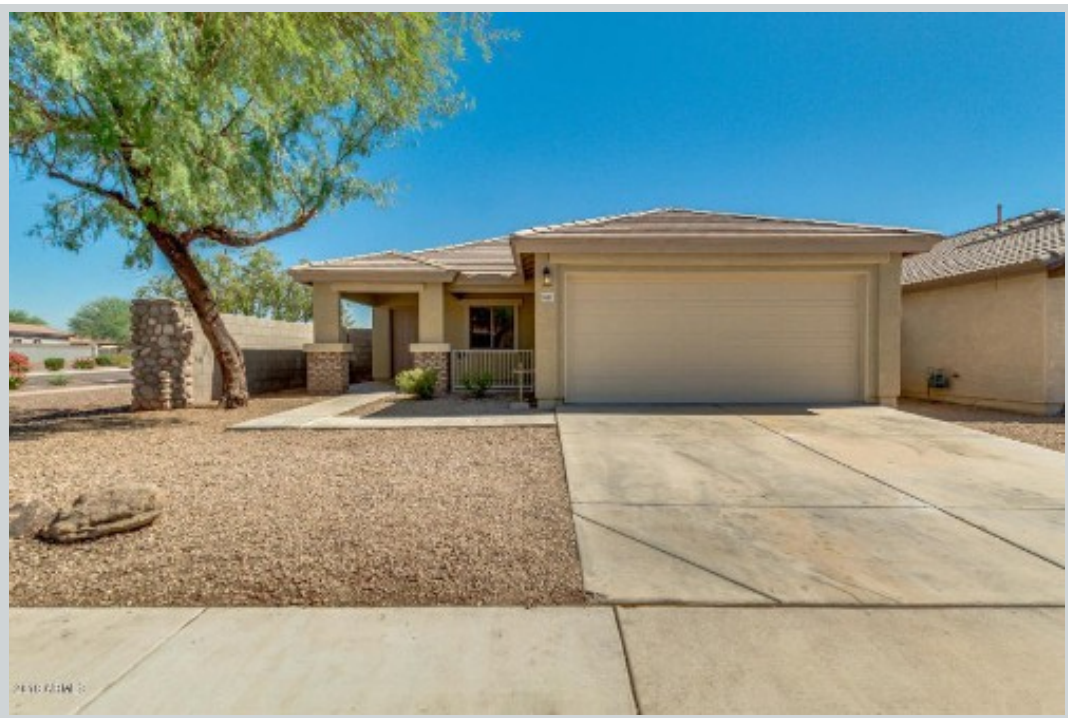
Sold Comp 2 5601 S 53rd Ave