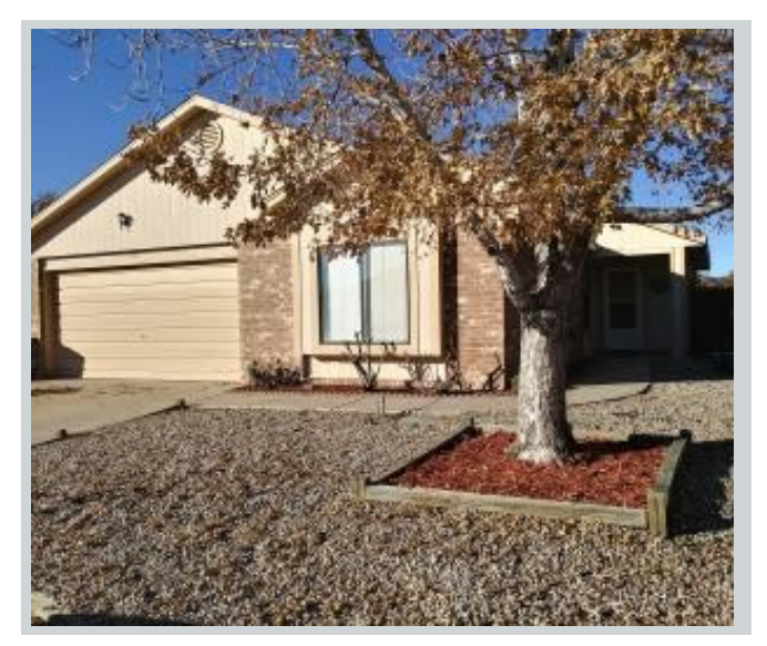
Listing Comp 2 7709 Santa Marie Ct View Front

Suggested Repaired $153,500 Sale $150,000