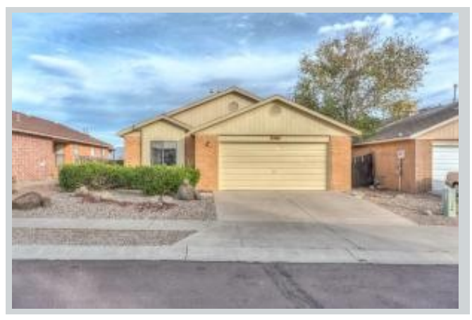
Listing Comp 3 3416 Running B Ird Ct View Front