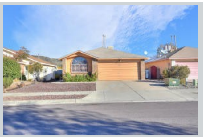
Listing Comp 1 7715 San Benito St View Front