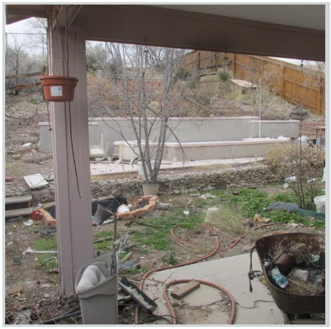
Subject 3327 Running Bird Pl Nw

Suggested Repaired $153,500 Sale $150,000