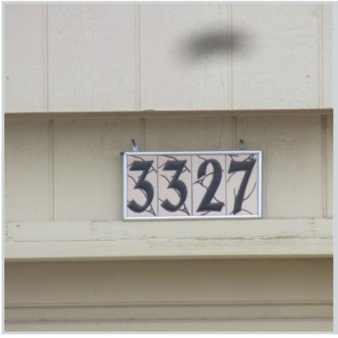
Subject 3327 Running Bird Pl Nw