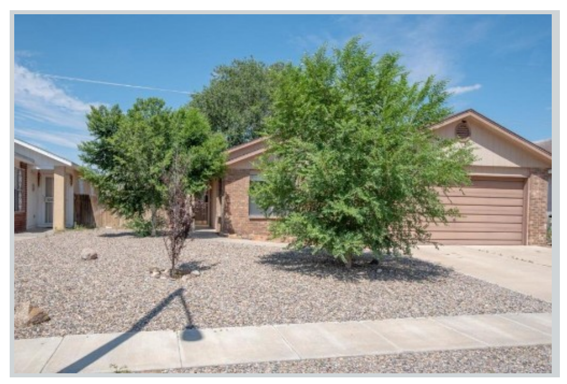
Sold Comp 1 3601 Santa Teresa St

Suggested Repaired $153,500 Sale $150,000