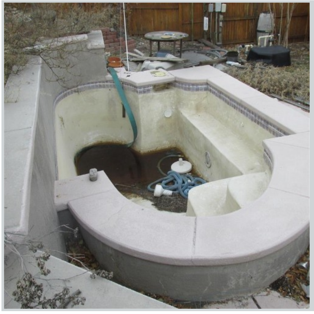
Subject 3327 Running Bird Pl Nw