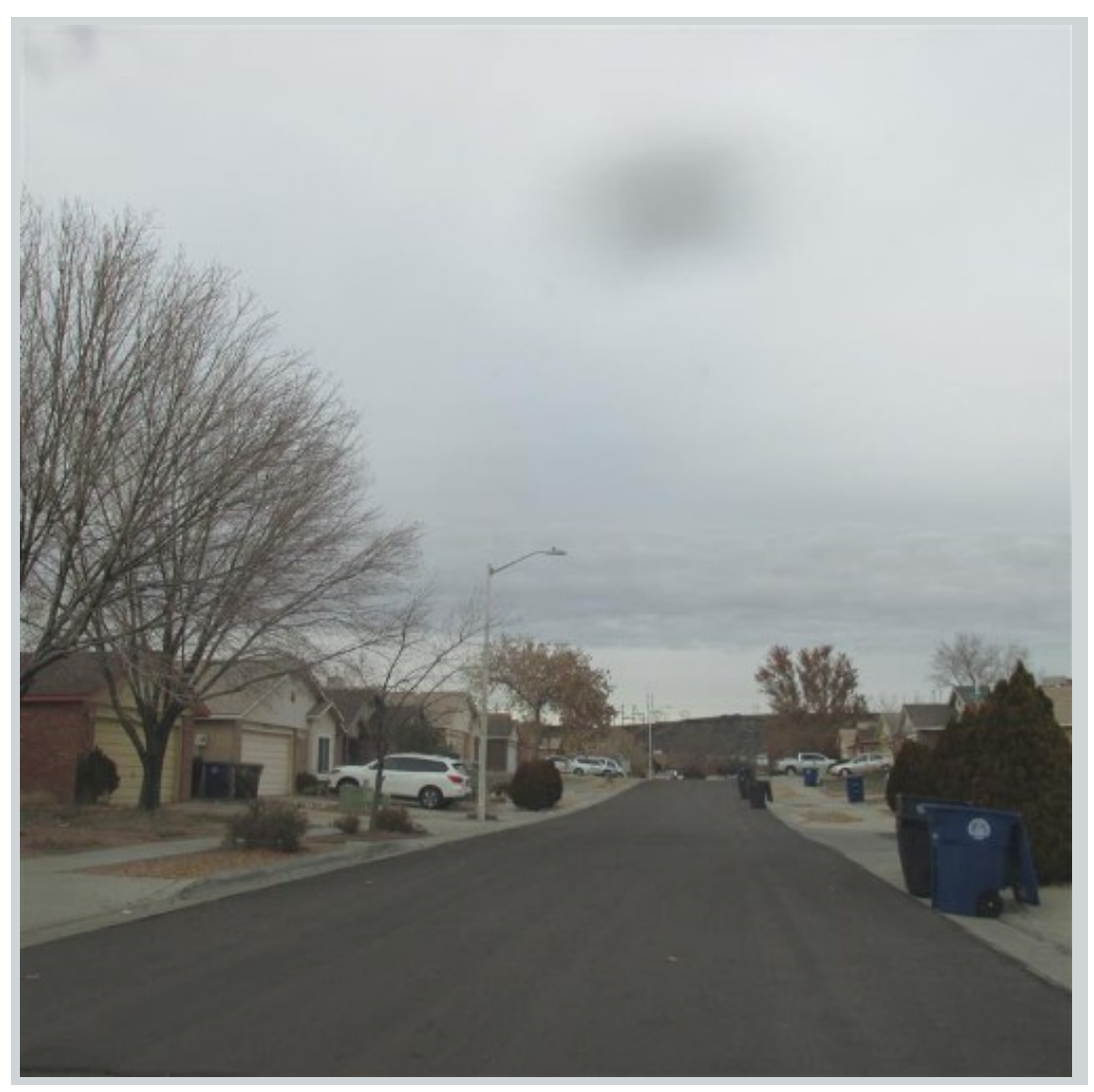
Subject 3327 Running Bird PI Nw