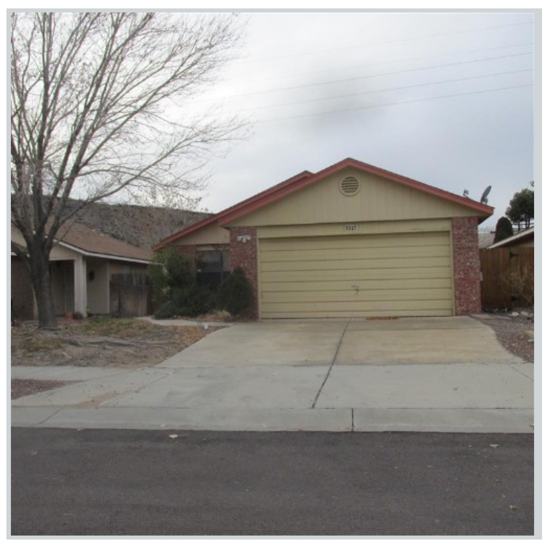
Subject 3327 Running Bird PI Nw