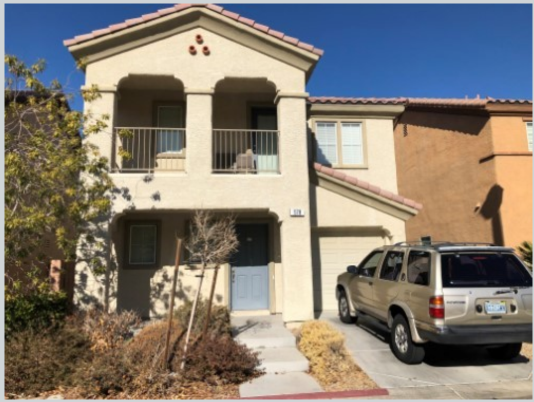
Subject 578 Brinkburn Point Ave