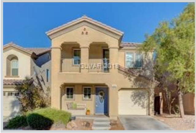
Sold Comp 2 540 Taunton St View Front