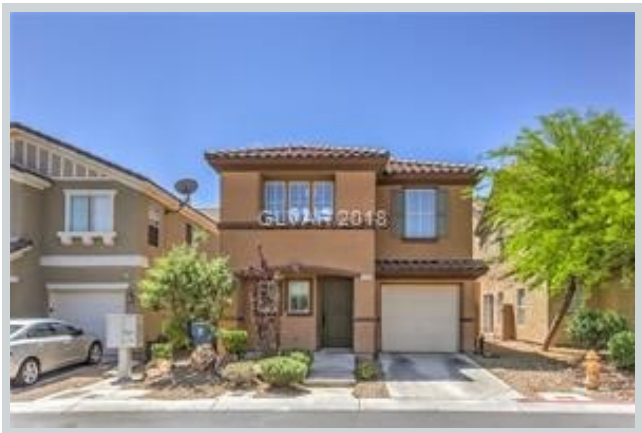
Sold Comp 1 549 Mayfair Walk Av View Front