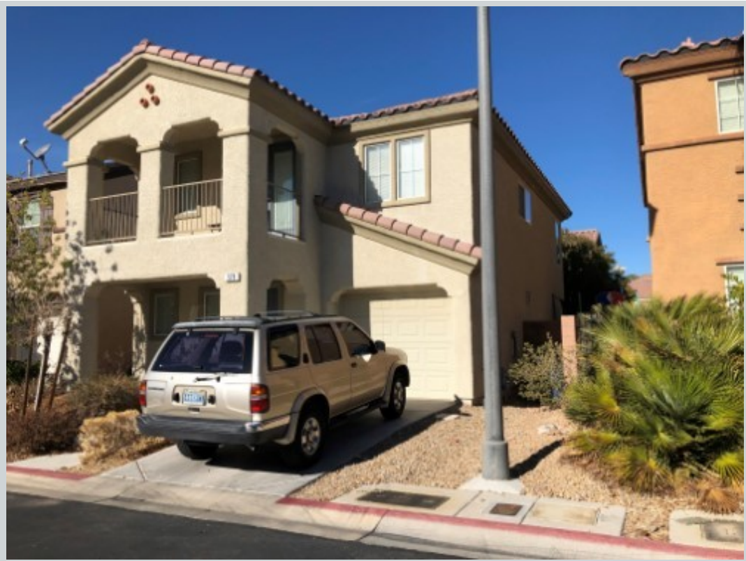
Subject 578 Brinkburn Point Ave