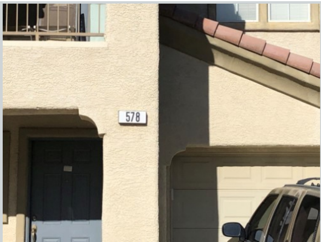
Subject 578 Brinkburn Point Ave