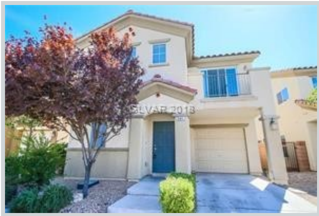
Sold Comp 3 561 Brinkburn Point Av View Front