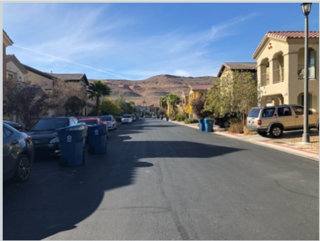
Subject 578 Brinkburn Point Ave