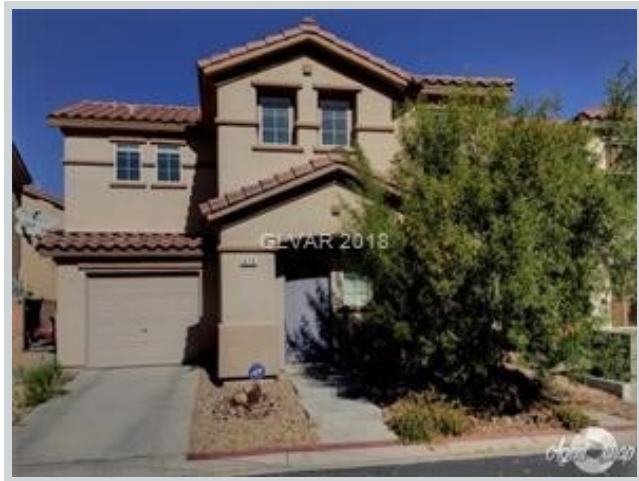
Listing Comp 1 676 Port Talbot Av View Front