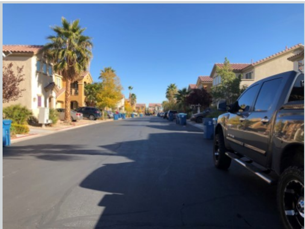
Subject 578 Brinkburn Point Ave