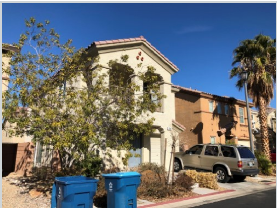
Subject 578 Brinkburn Point Ave