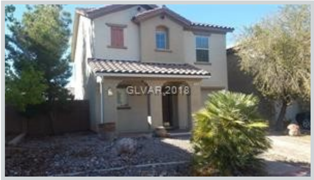
Listing Comp 3 470 Haunts Walk Av View Front

Address 578 Brinkburn Point Avenue, Las Vegas, NEVADA 89178 Loan Number 36671 Suggested List $262,000 Suggested Repaired $262,000 Sale $262,000