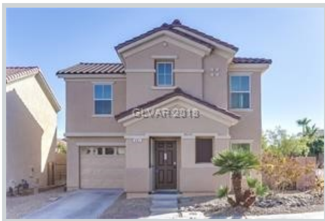
Listing Comp 2 491 Keelmans Point Av View Front