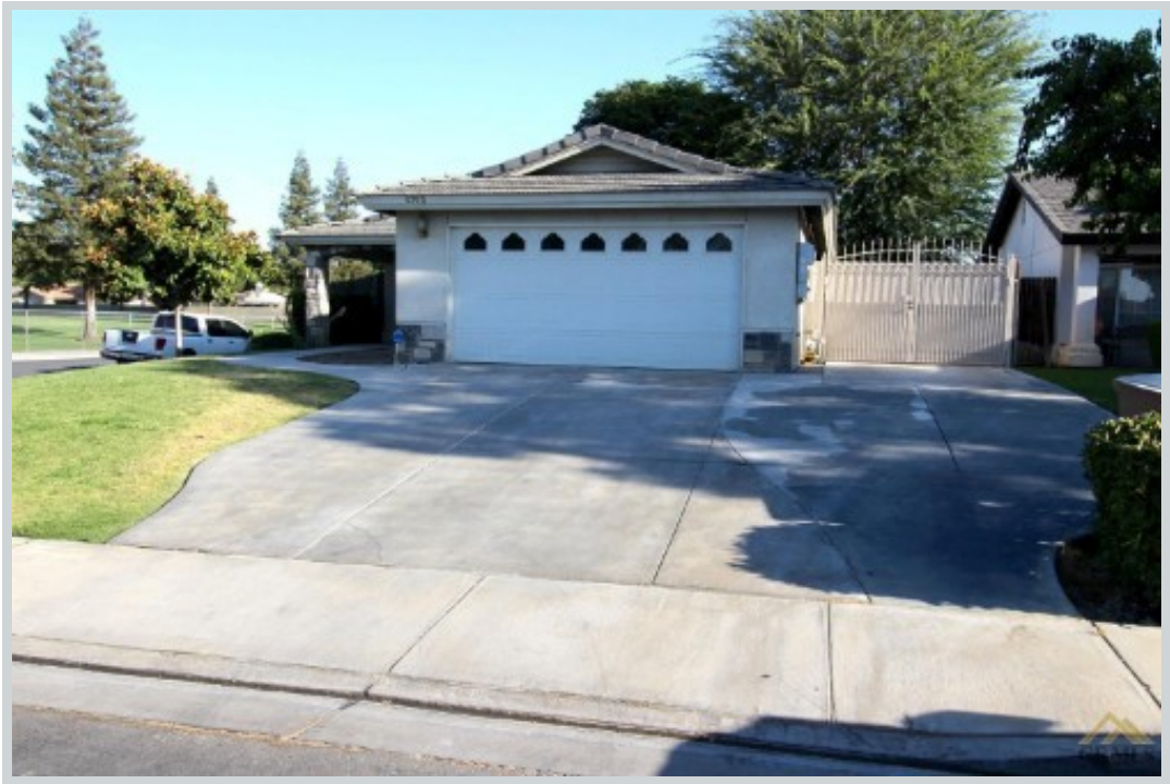
Sold Comp 3 5703 Seasons Valley Ct