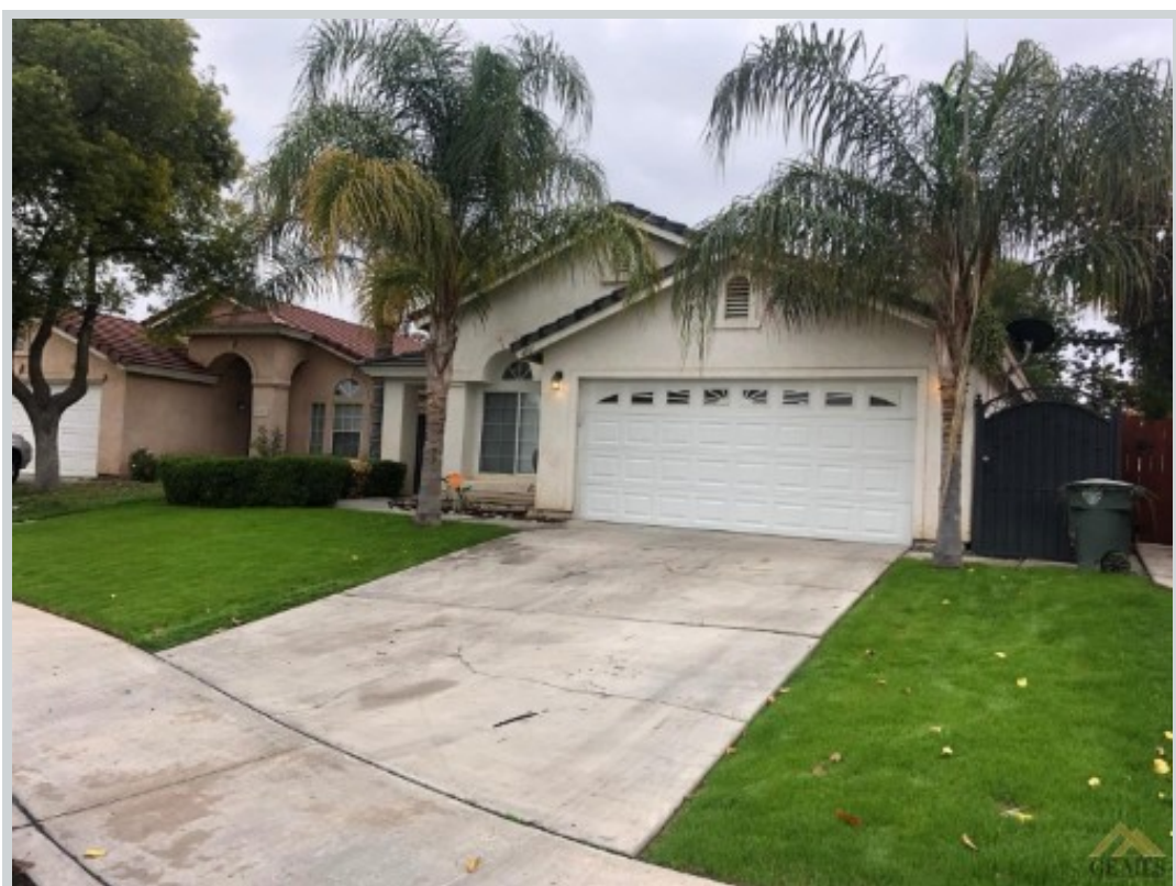
Listing Comp 1 4911 Hartwick Ct