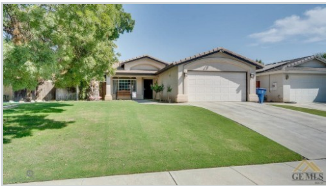
Sold Comp 2 5704 Pine Canyon Dr