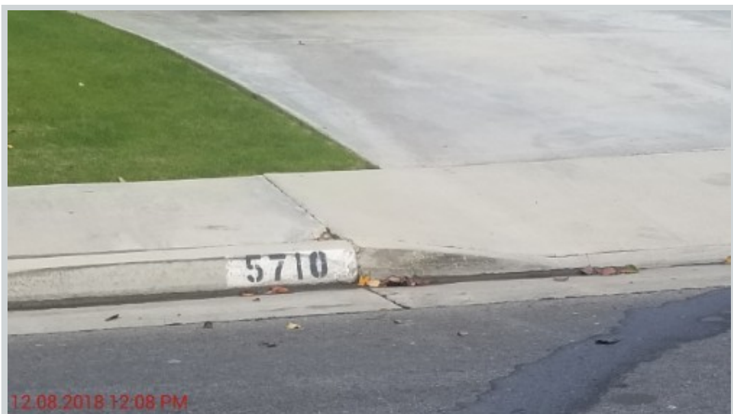
Subject 5710 Spring Blossom St