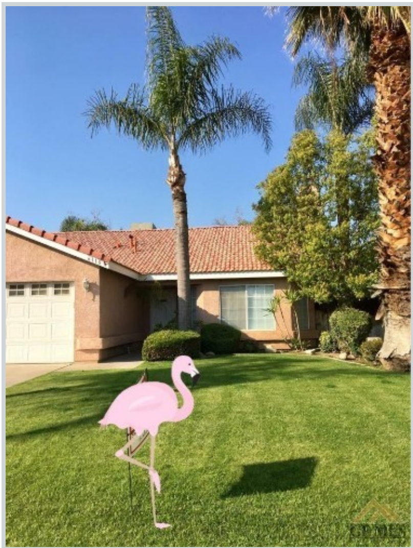
Sold Comp 1 6118 Martinique Ct