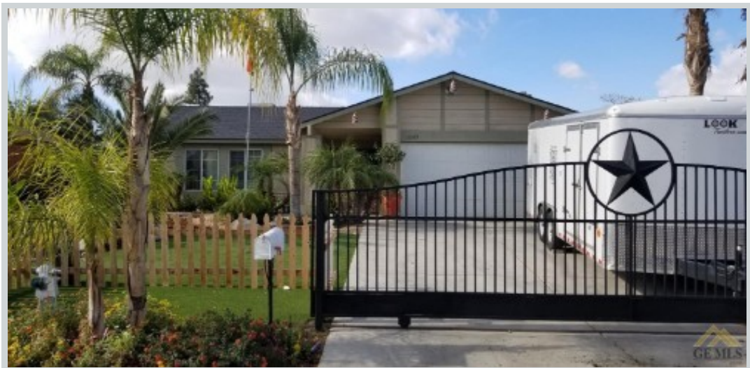
Listing Comp 2 5509 Annette St