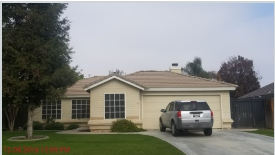
Subject 5710 Spring Blossom St