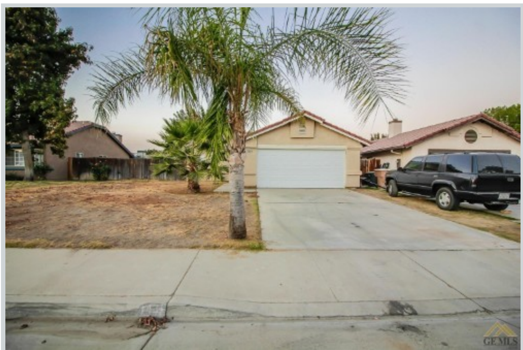
Listing Comp 3 4404 Cyclone Dr