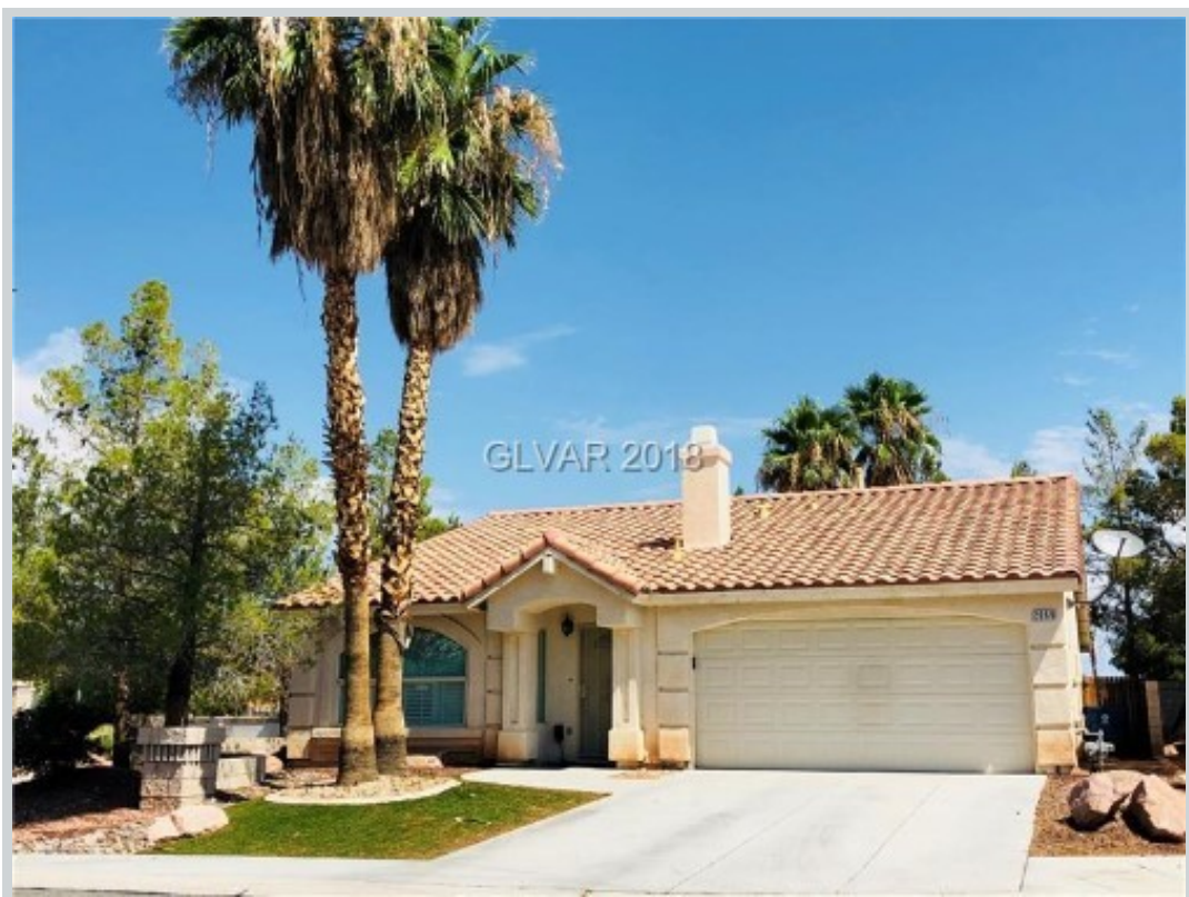
Sold Comp 1 2066 Silver Breeze Ave

Address 1704 Silver Falls Avenue, Las Vegas, NV 89123 Loan Number 36685 Suggested List $299,900 Suggested Repaired $299,900 Sale $282,000