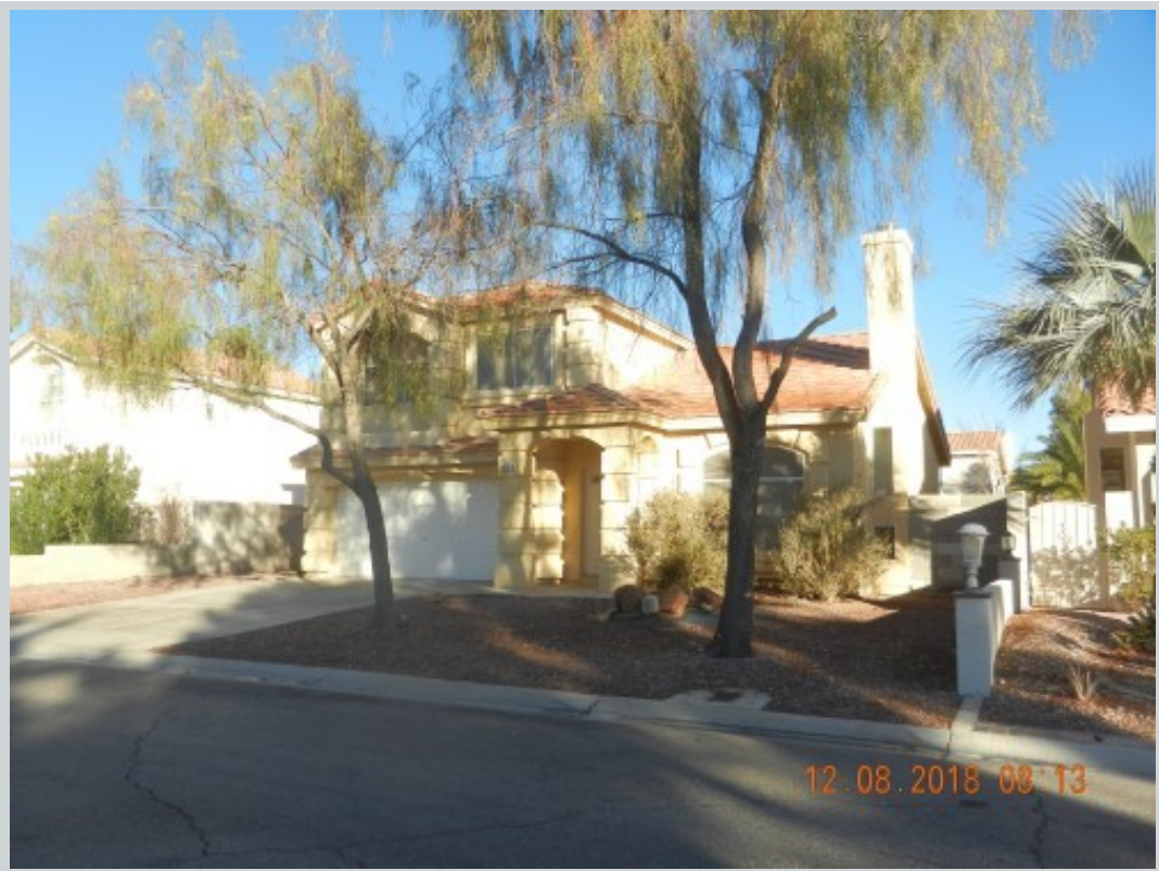
Subject 1704 Silver Falls Ave