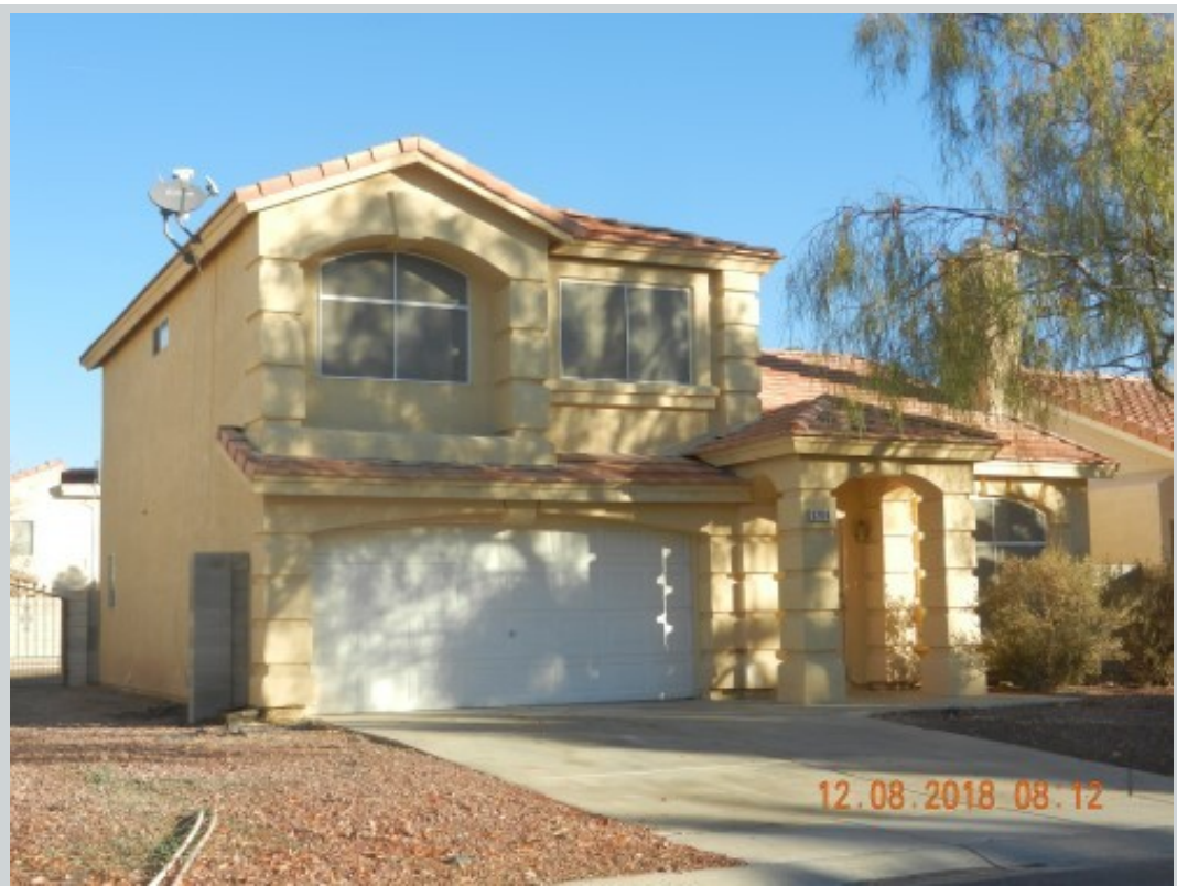
Subject 1704 Silver Falls Ave