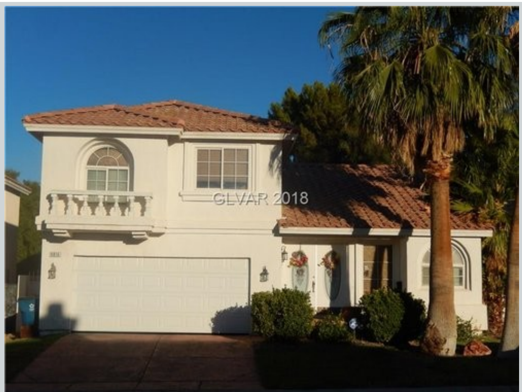
Listing Comp 1 9816 Silver Pebble St