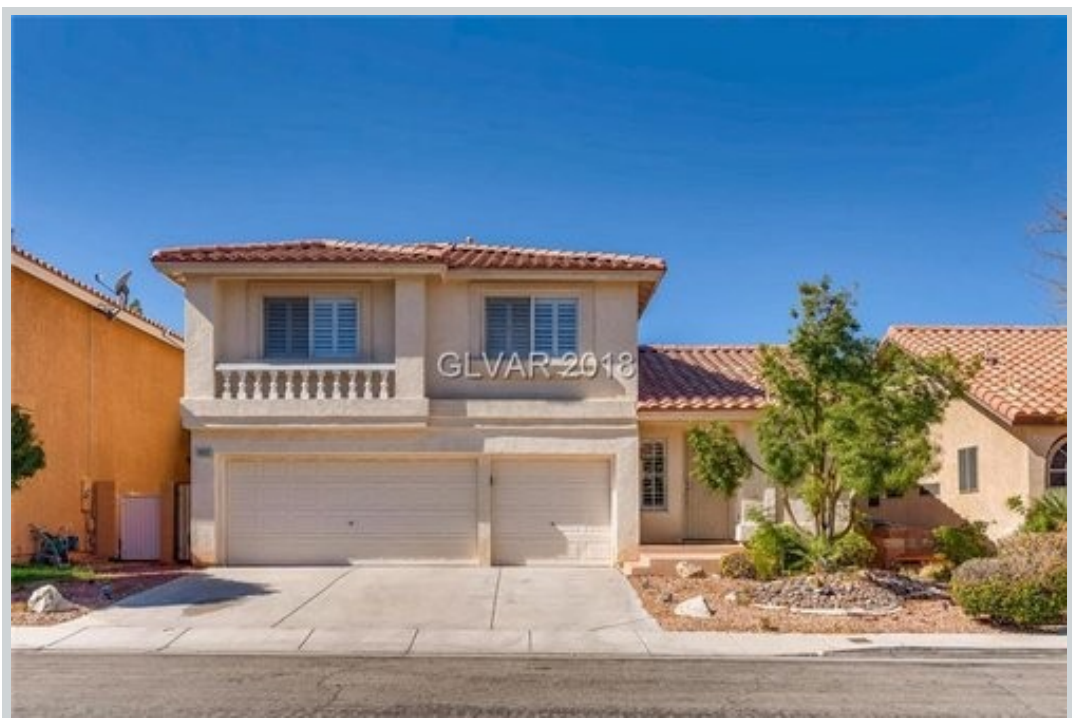
Listing Comp 3 9855 Silver Chaps Ct