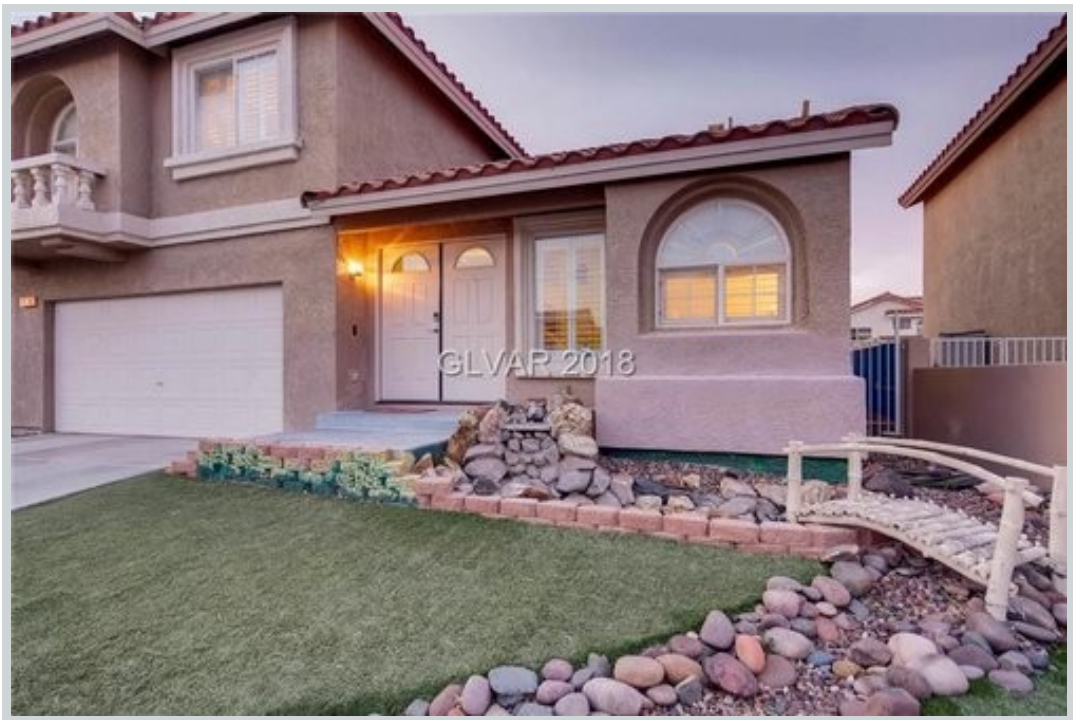
Sold Comp 3 1878 Silver Whisper Ave