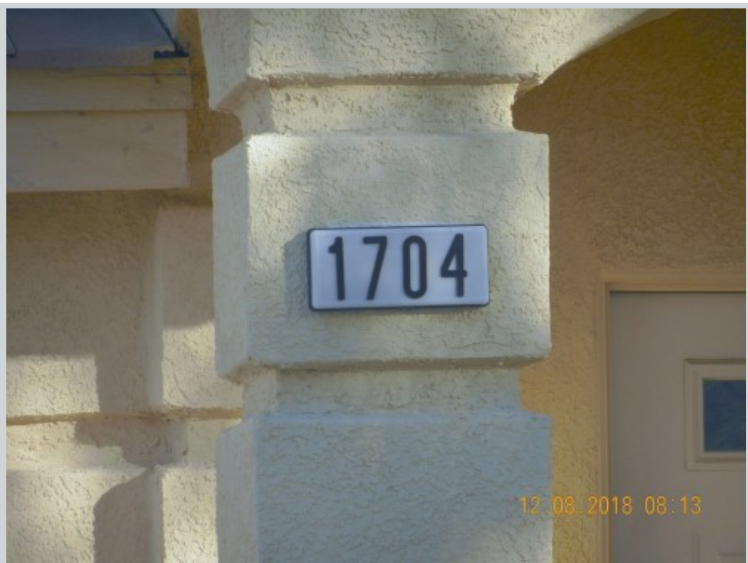
Subject 1704 Silver Falls Ave