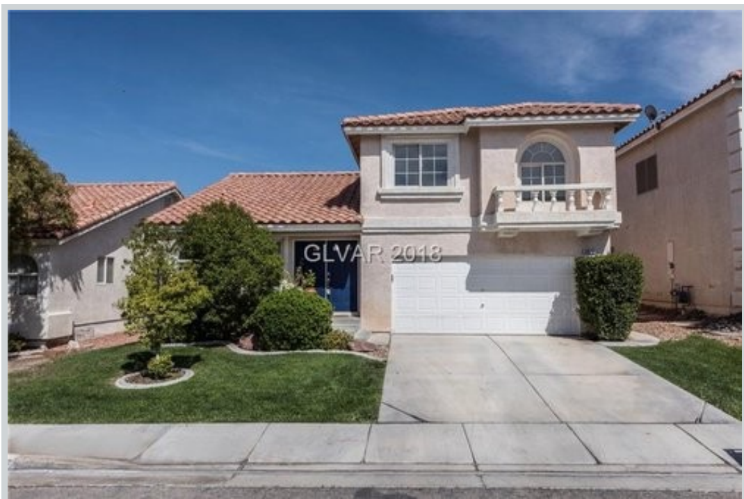
Sold Comp 2 9872 Silver Lasso St