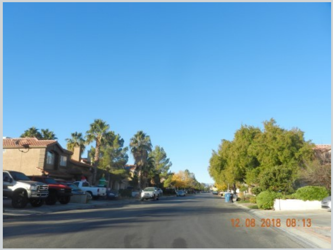
Subject 1704 Silver Falls Ave