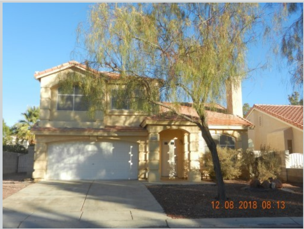
Subject 1704 Silver Falls Ave