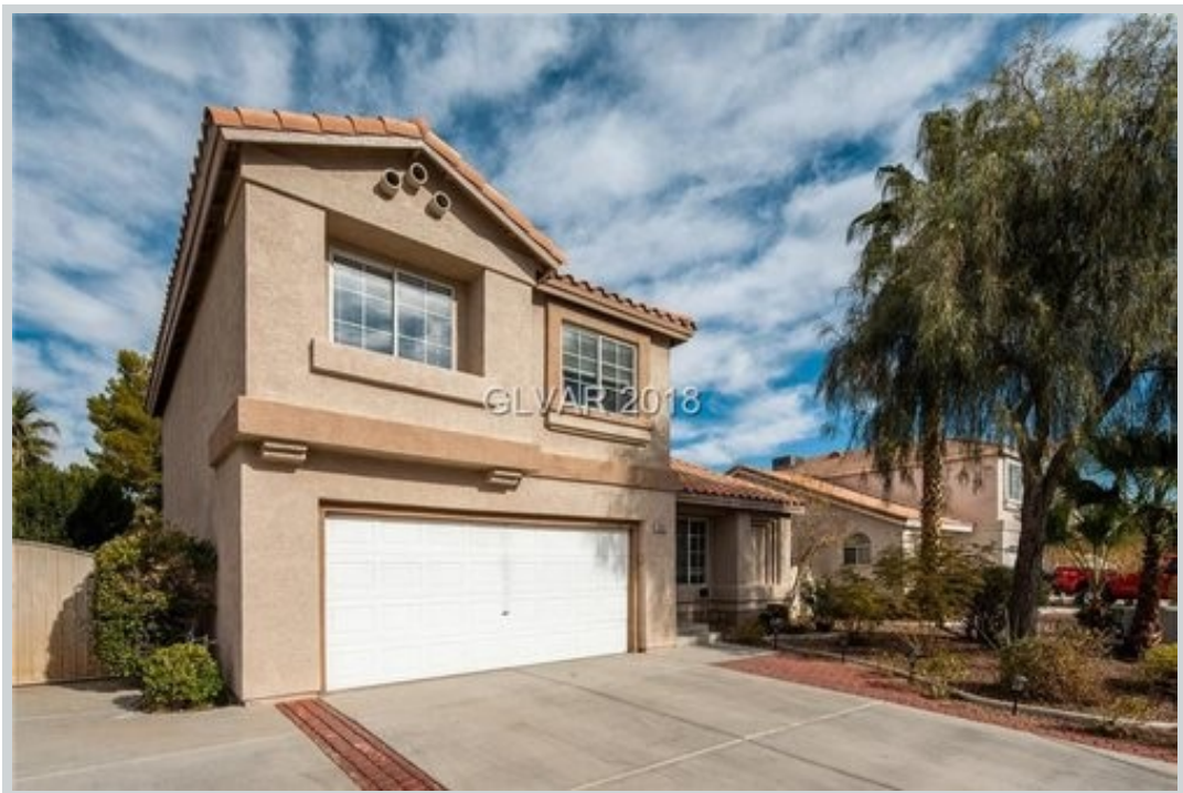
Listing Comp 2 1592 Silver Falls Ave

Address 1704 Silver Falls Avenue, Las Vegas, NV 89123 Suggested Repaired $299,900 Sale $282,000 Loan Number 36685 Suggested List $299,900