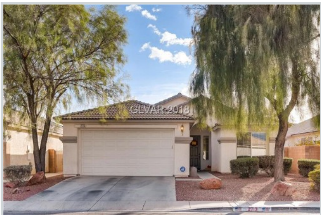
Listing Comp 1 2713 Bahama Point Ave