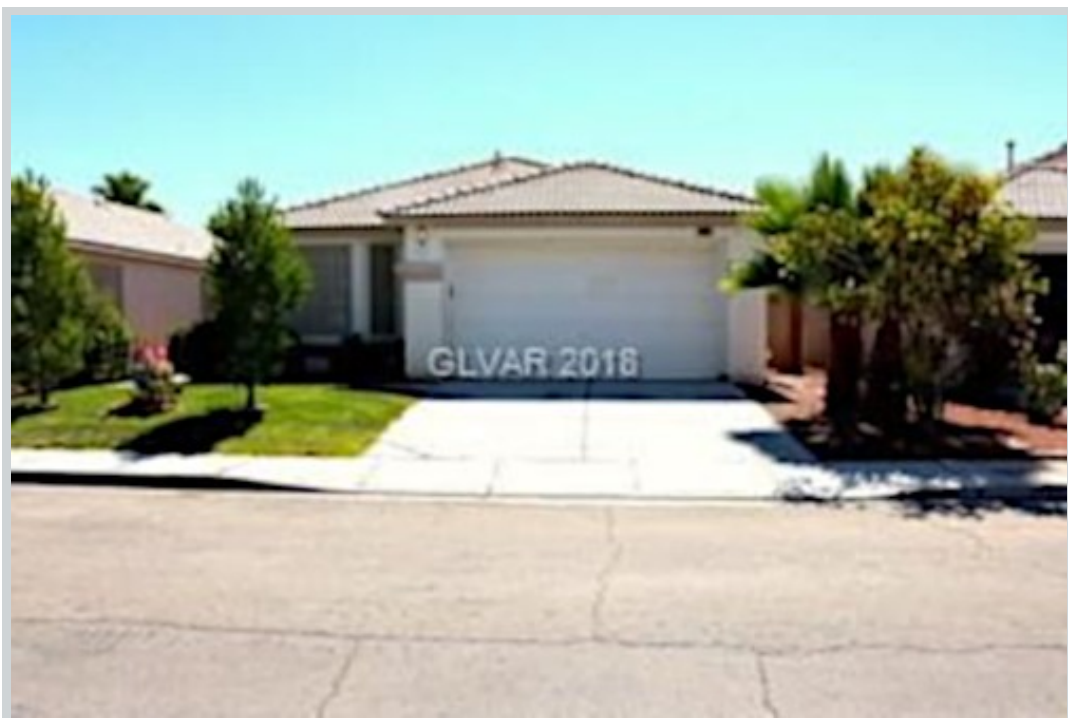
Sold Comp 3 5028 Cayman Beach St