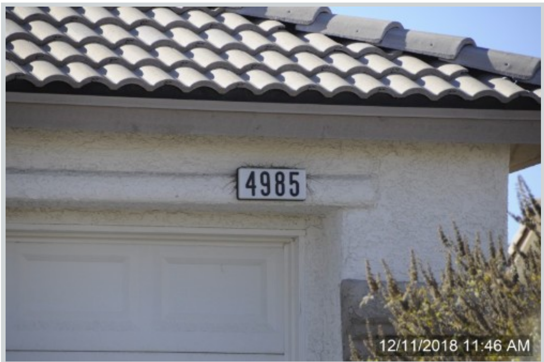
Subject 4985 Athens Bay Pl