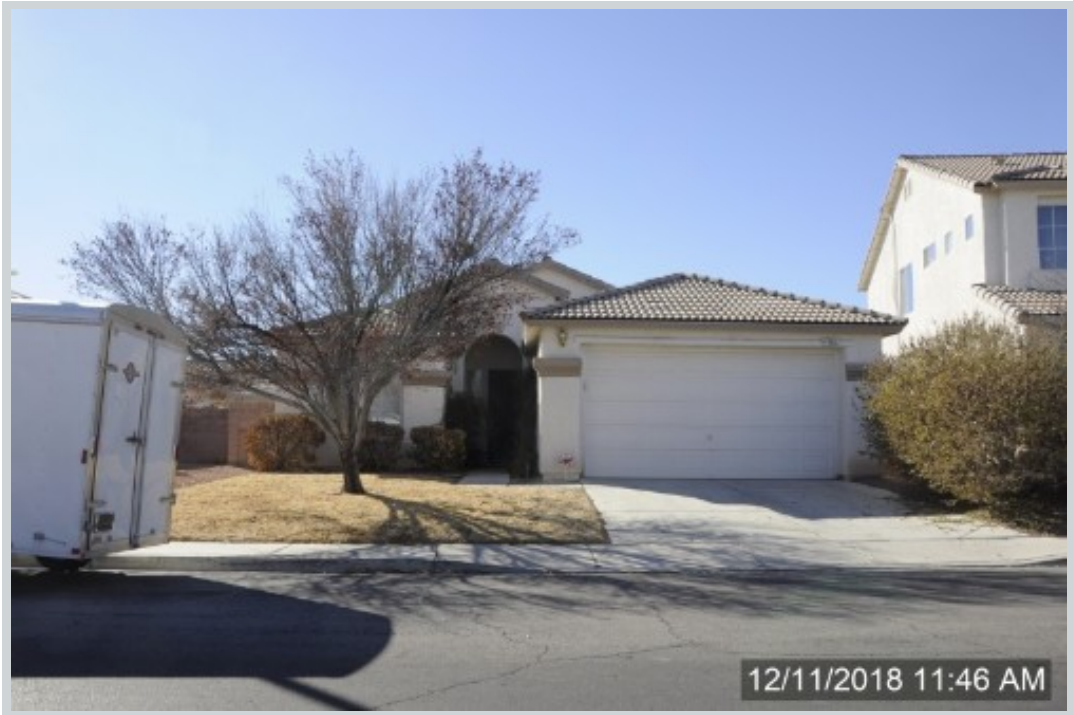
Subject 4985 Athens Bay Pl