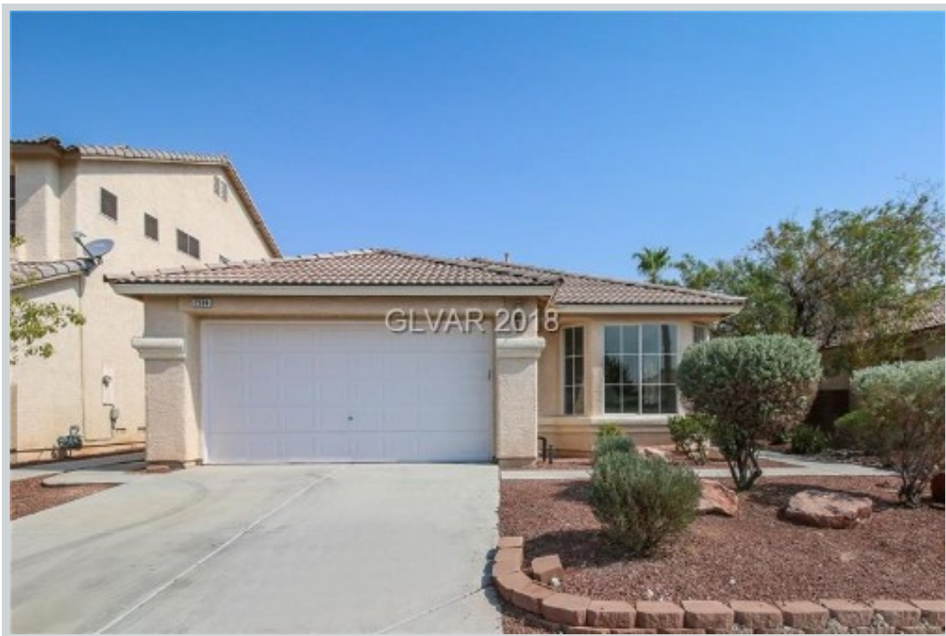
Sold Comp 2 2514 Parasail Point Ave