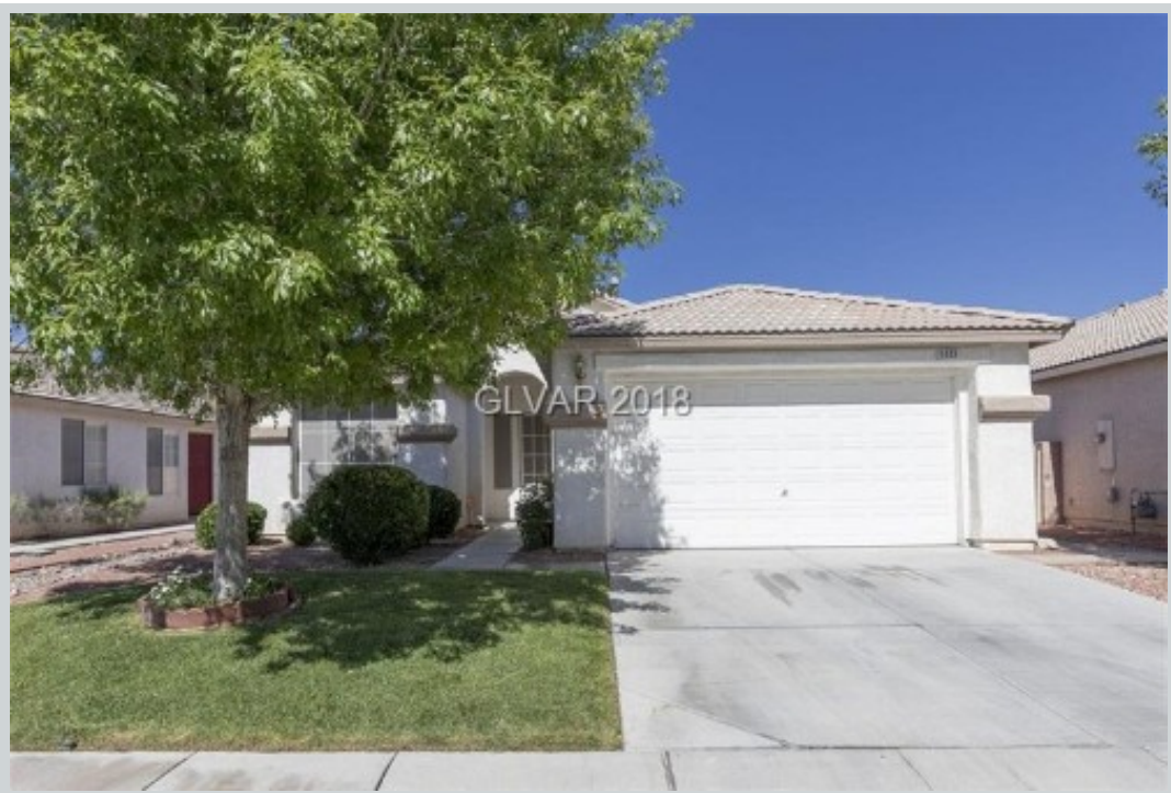
Sold Comp 1 5033 Cayman Beach St