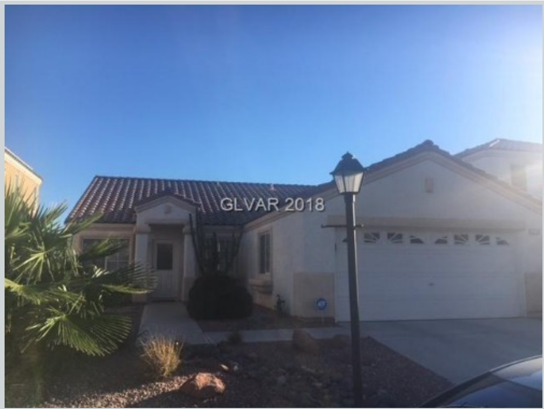
Listing Comp 3 2117 Port Antonio Ct