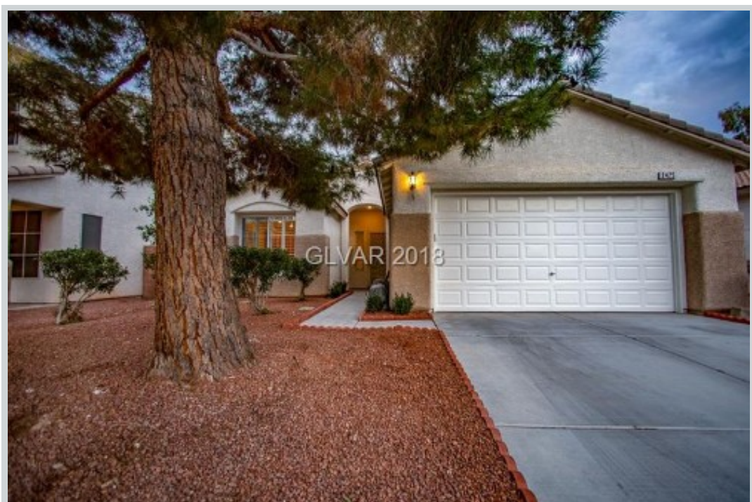
Listing Comp 2 2425 Parasail Point Ave