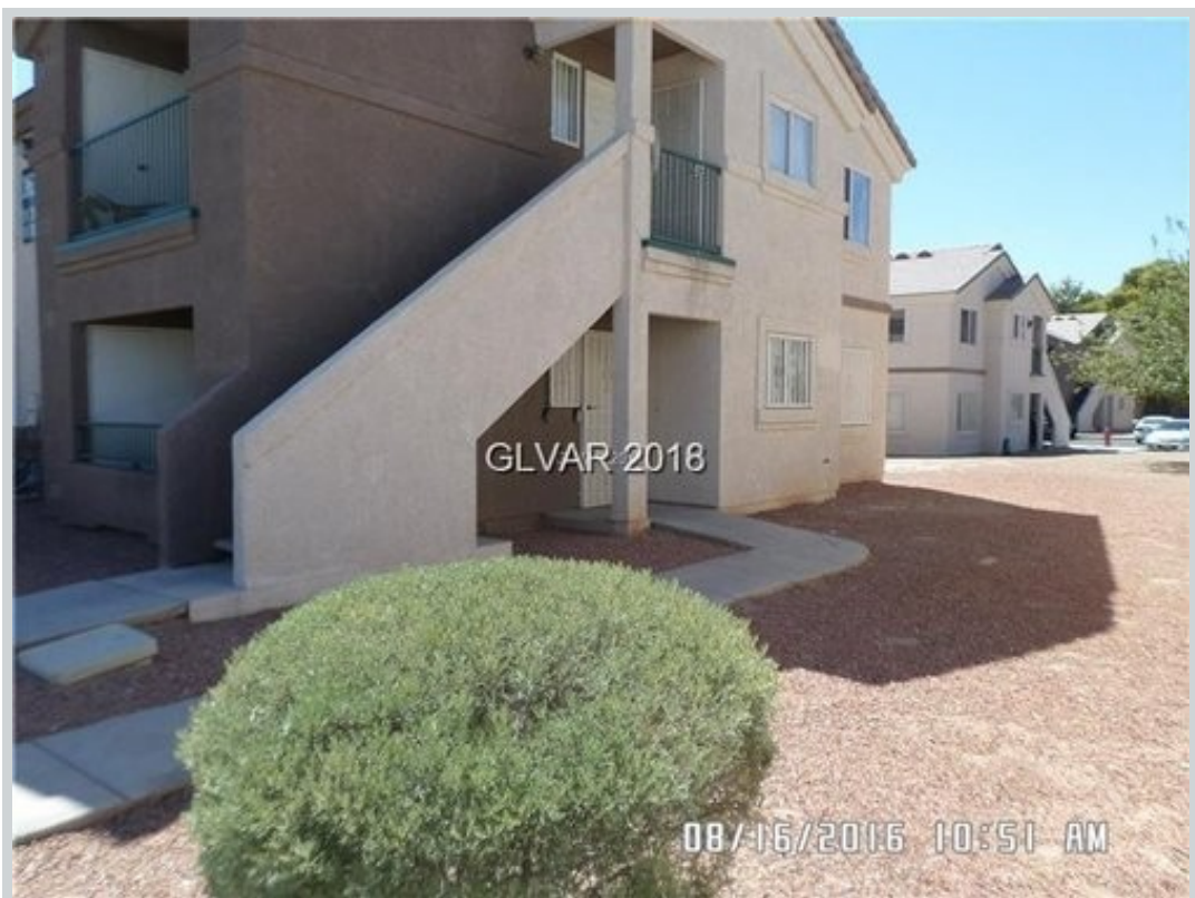
Listing Comp 3 3953 Danny Melamed Ave Unit 102 View Front