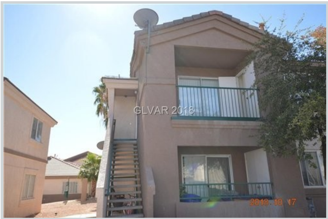
Sold Comp 3 3965 Danny Melamed Ave Unit 201