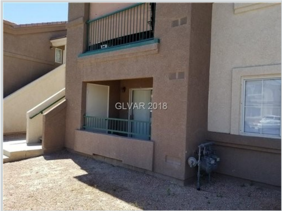
Sold Comp 1 3965 Rebecca Raiter Ave Unit 101