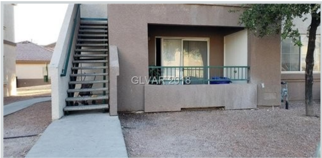
Listing Comp 2 3965 Danny Melamed Ave Unit 101 View Front

Address 1520 Ben Or Street 102, Las Vegas, NV 89110 Loan Number 36703 Suggested List $84,000 Suggested Repaired $84,000 Sale $82,000