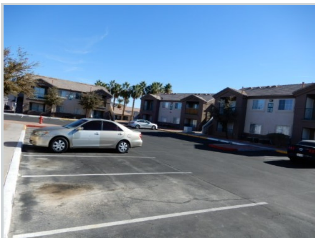
Subject 1520 Ben Or St Unit 102