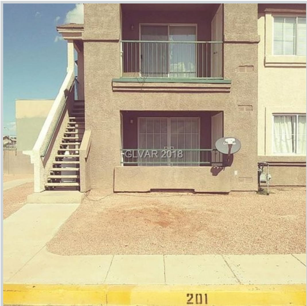
Sold Comp 2 1524 Ben Or St Unit 101