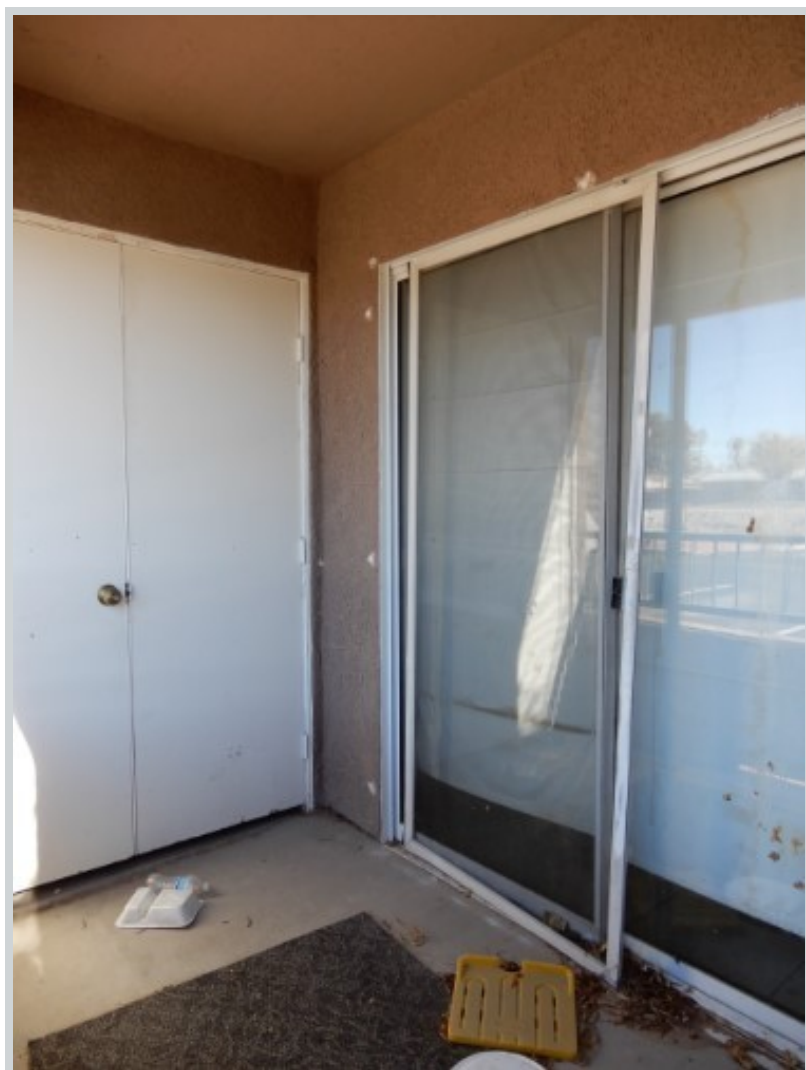
Subject 1520 Ben Or St Unit 102