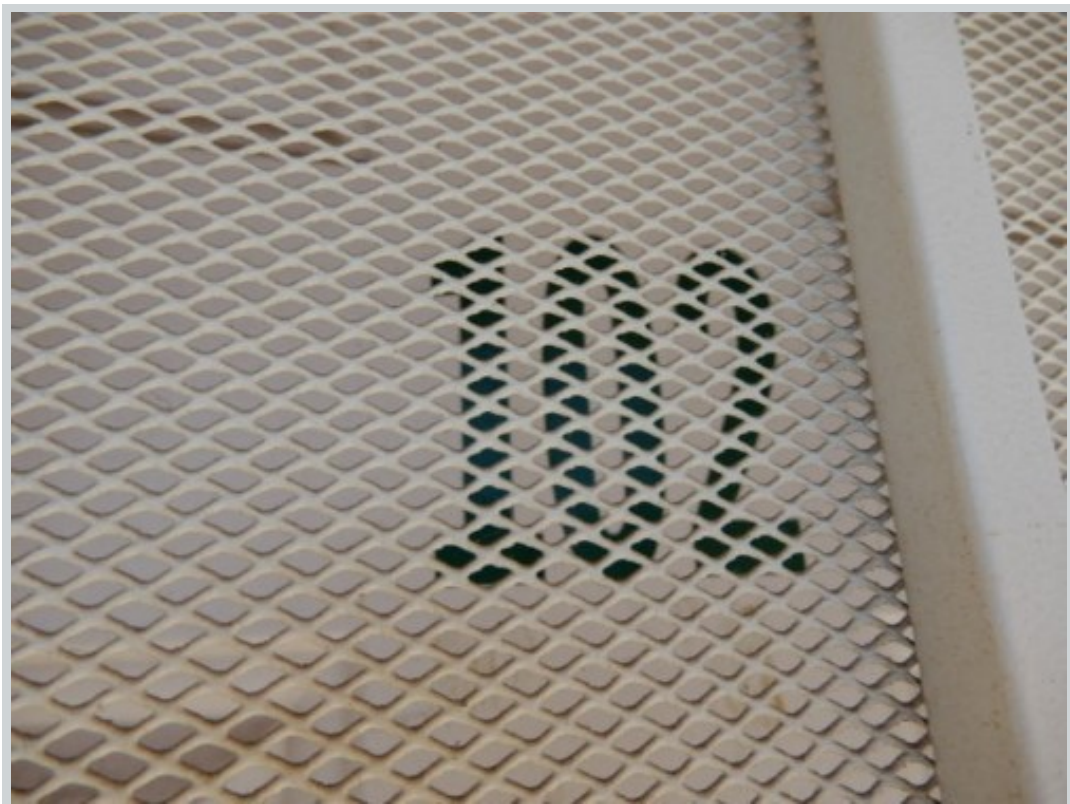
Subject 1520 Ben Or St Unit 102 View Address Verification Comment "Unit number address verification. "

Address 1520 Ben Or Street 102, Las Vegas, NV 89110 Loan Number 36703 Suggested List $84,000 Suggested Repaired $84,000 Sale $82,000