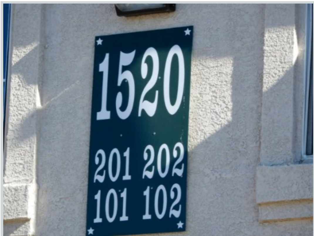
Subject 1520 Ben Or St Unit 102 View Address Verification Comment "Address verification of building. "