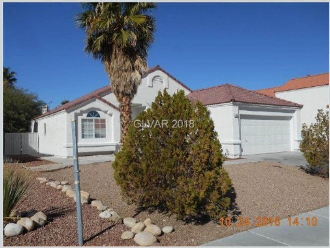
Listing Comp 3