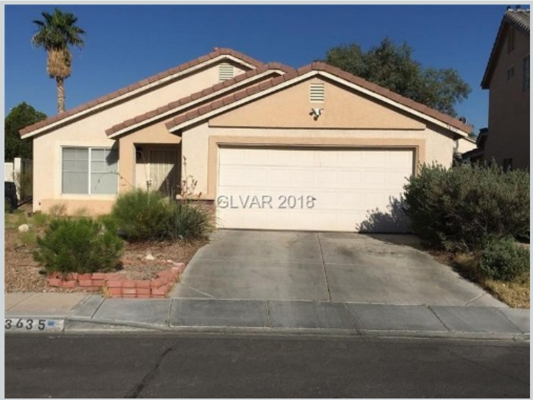
Sold Comp 3