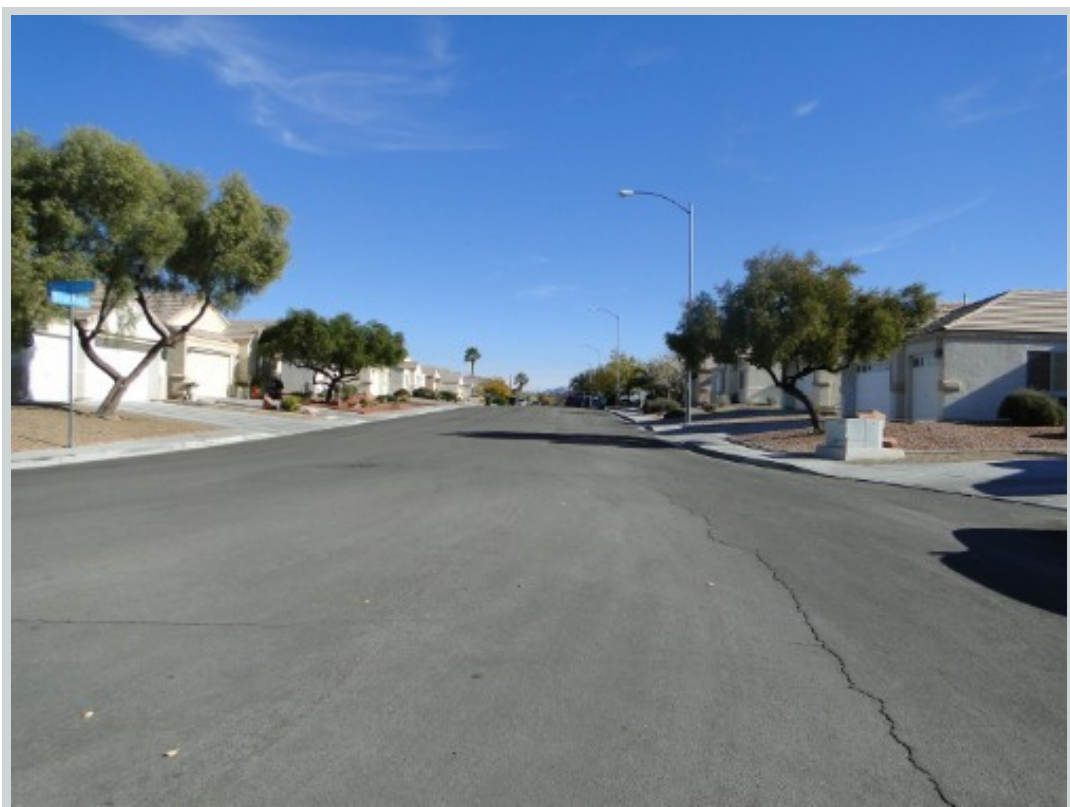
Subject 1201 Elliot Park Ave