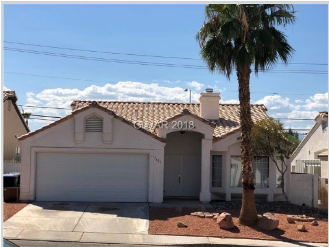
Listing Comp 2