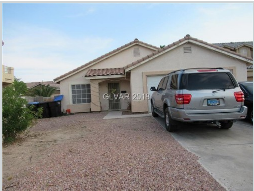
Sold Comp 1