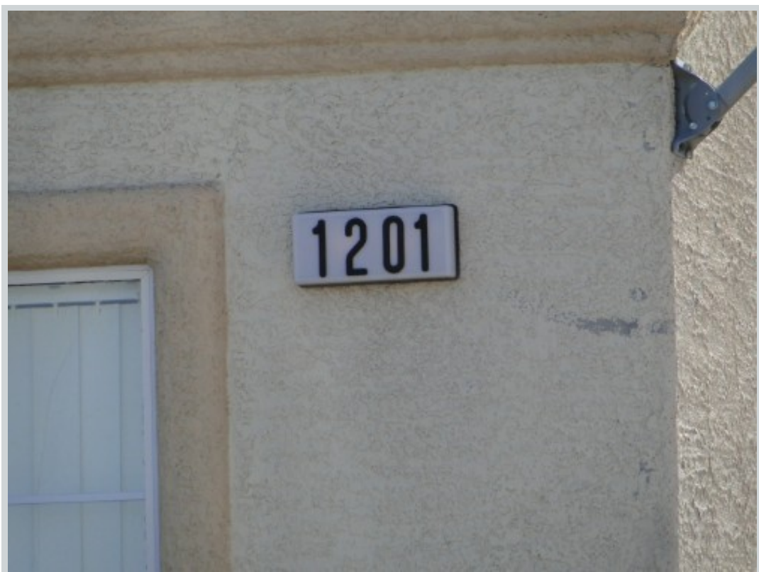
Subject 1201 Elliot Park Ave