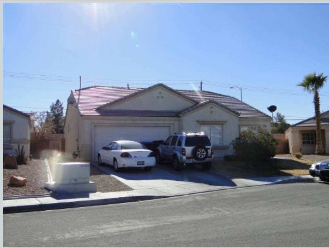
Subject 1201 Elliot Park Ave