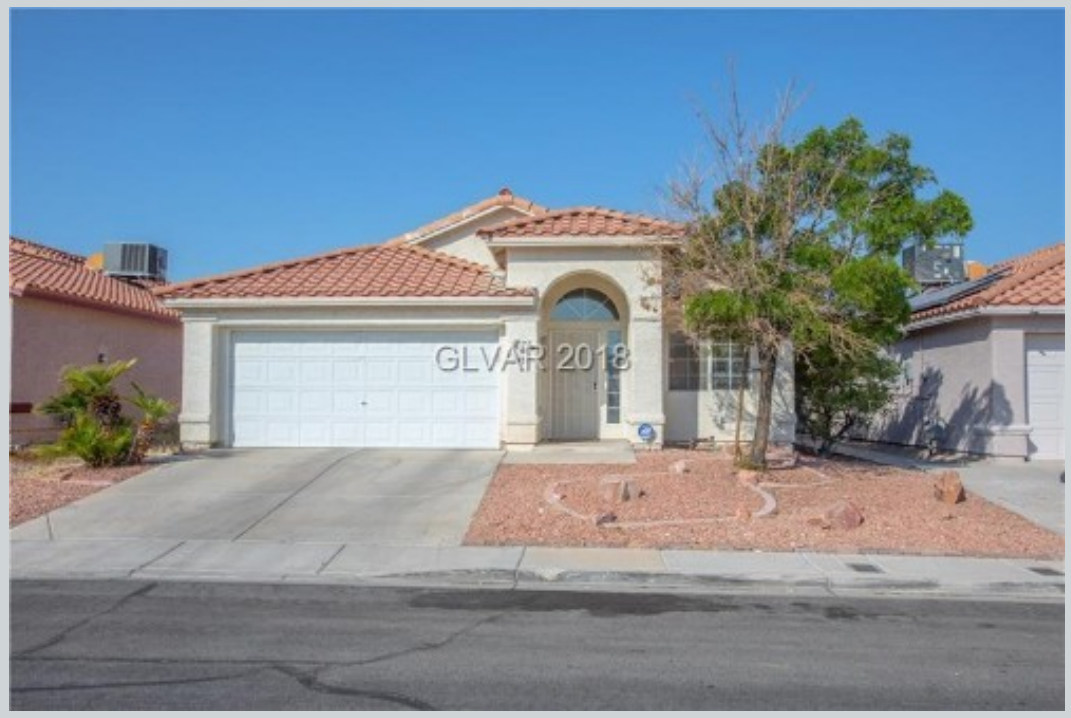
Sold Comp 2