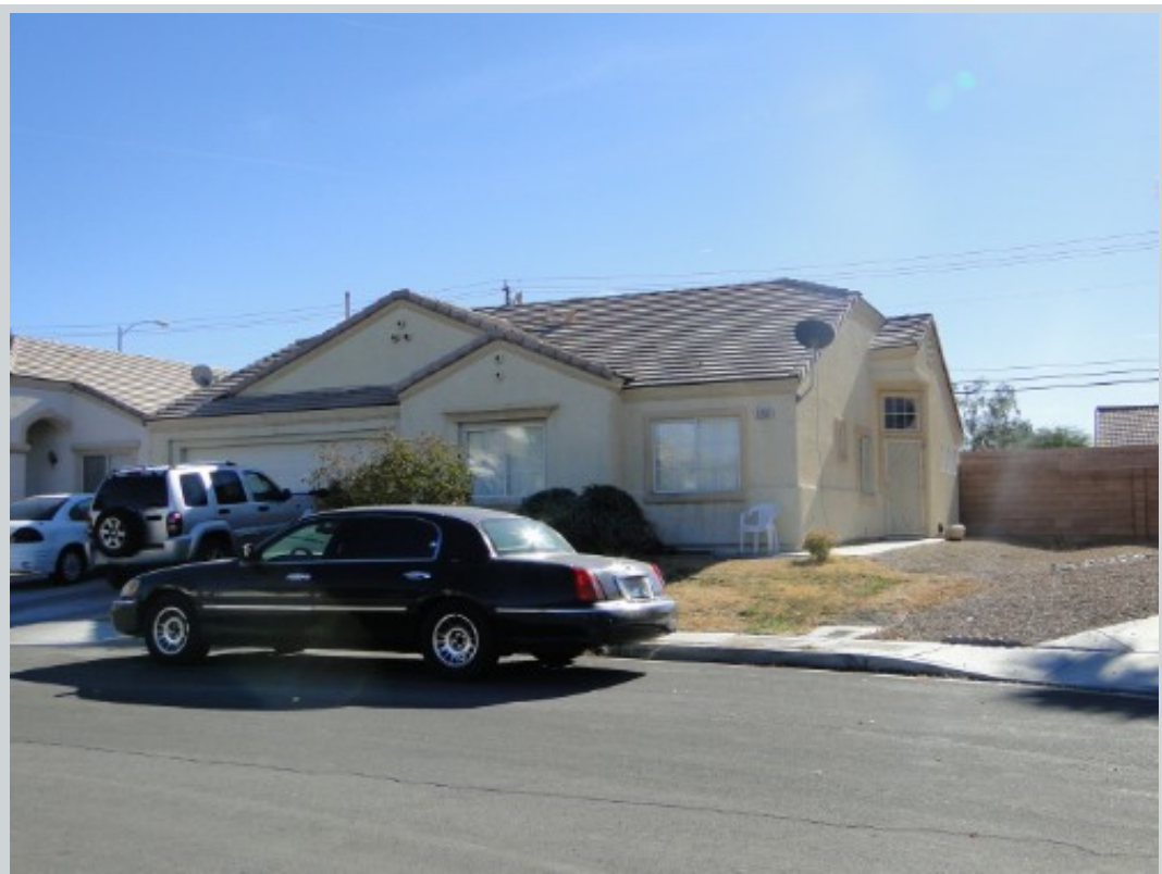
Subject 1201 Elliot Park Ave