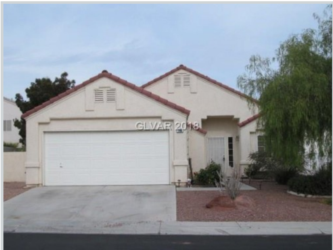
Listing Comp 1