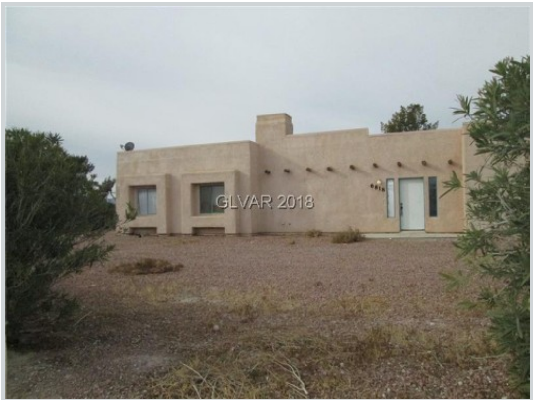
Sold Comp 1