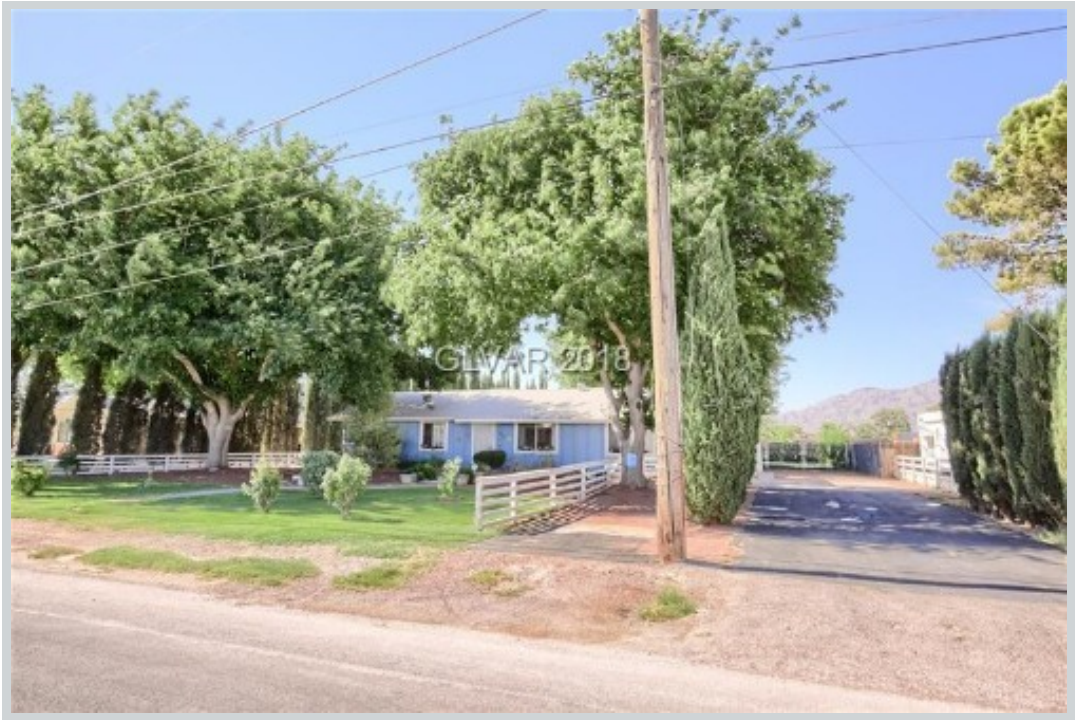
Sold Comp 2