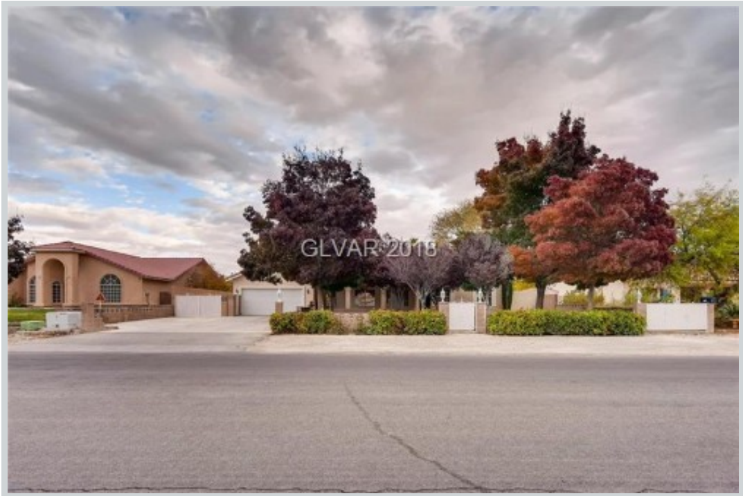
Listing Comp 3