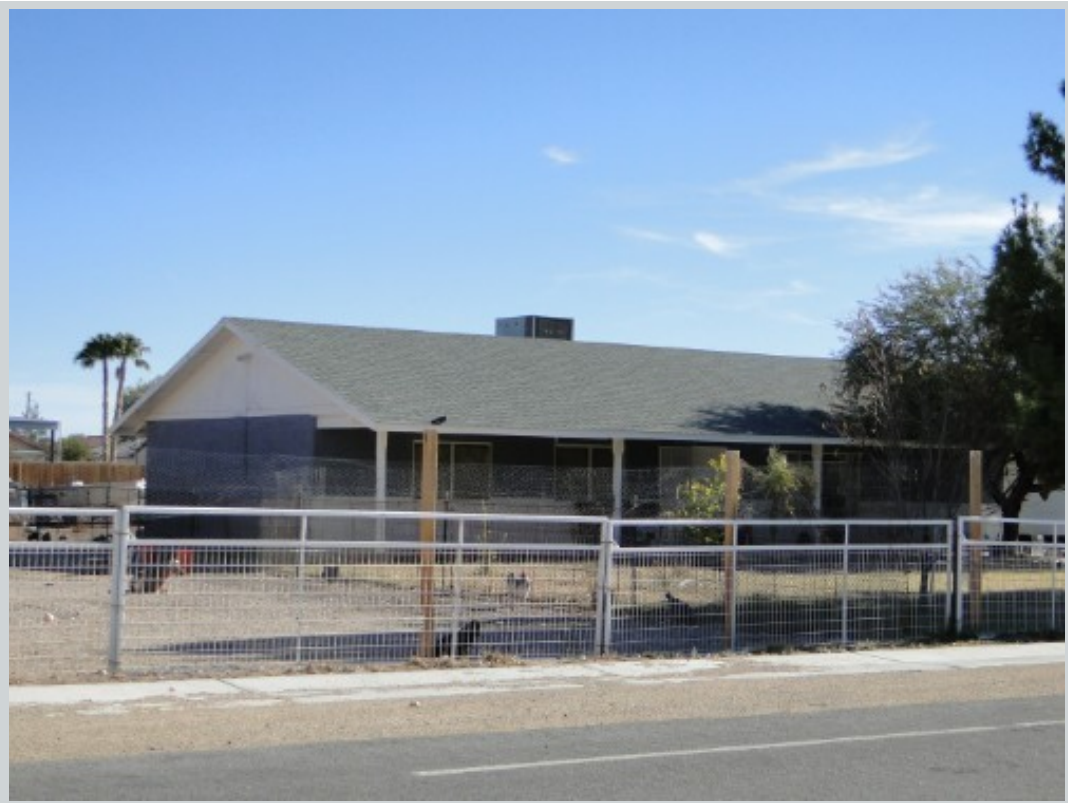
Subject 7109 Jeanette St