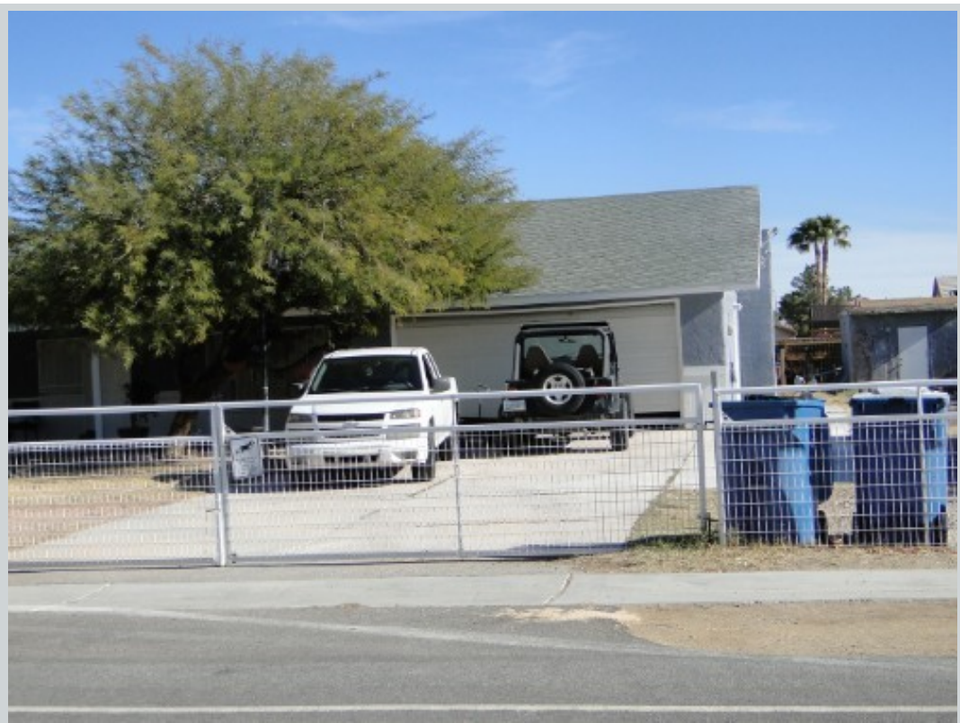
Subject 7109 Jeanette St