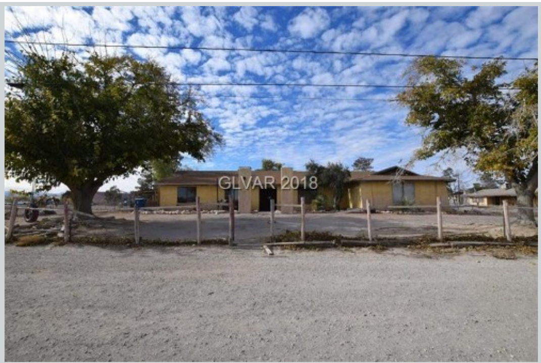
Listing Comp 2