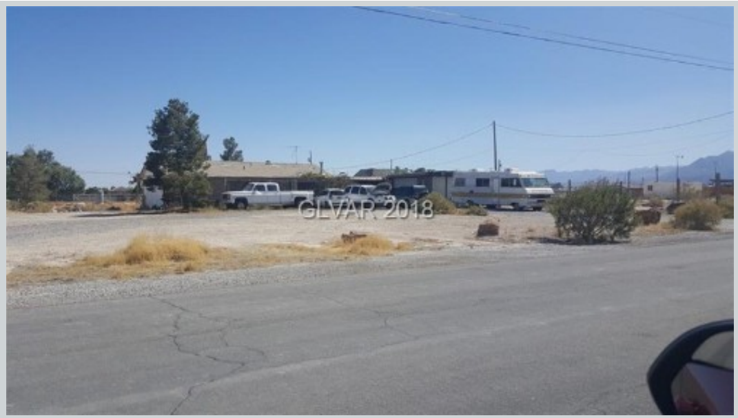
Listing Comp 1