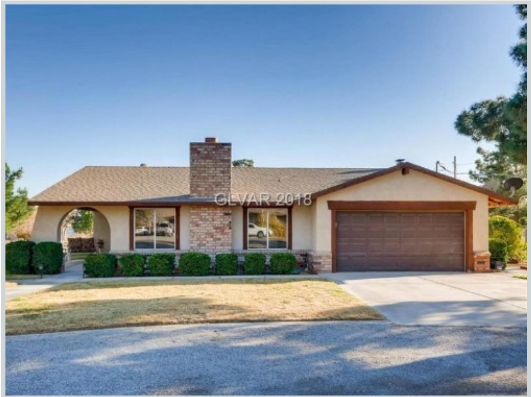
Sold Comp 3