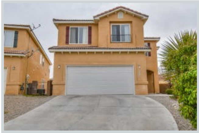
Sold Comp 2 6212 Sierra Nevada Cir Nw View Front