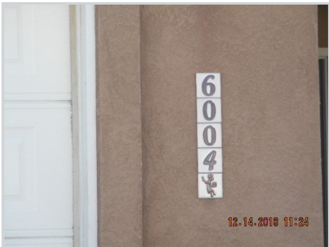
Subject 6004 Pyrenees Ct Nw