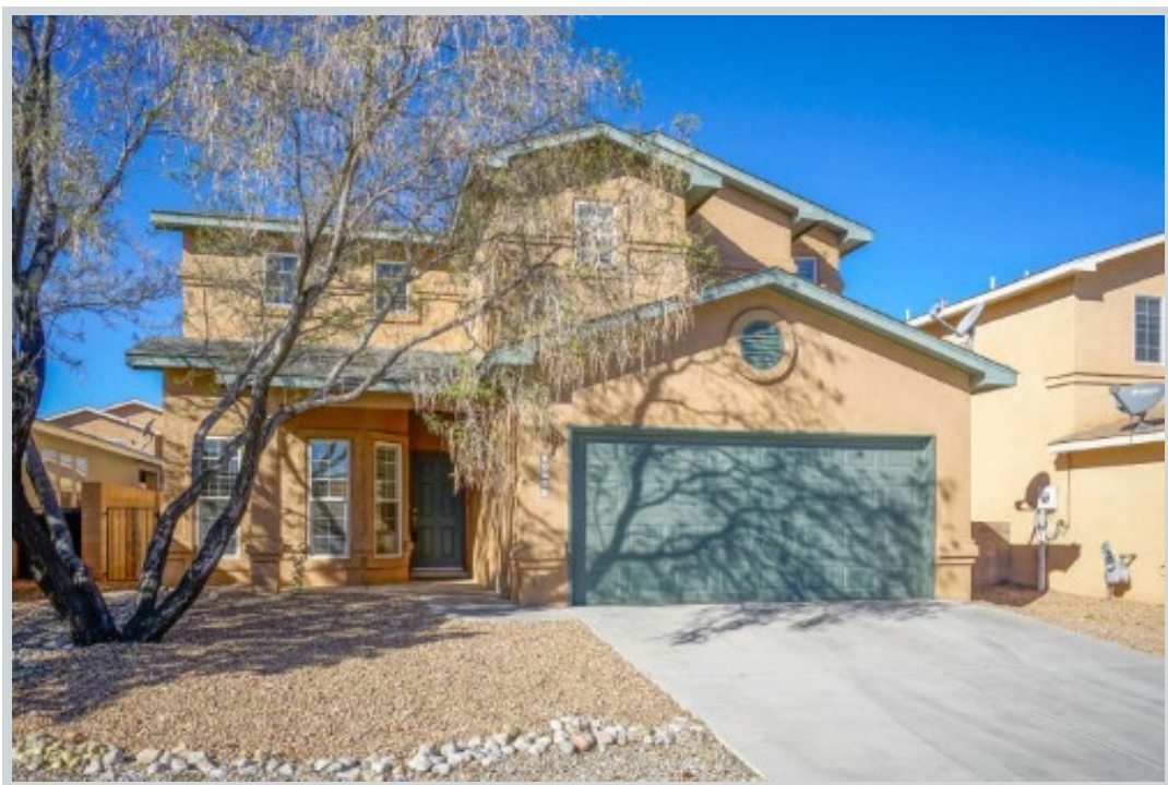
Listing Comp 2 10415 Country Manor Pl Nw View Front