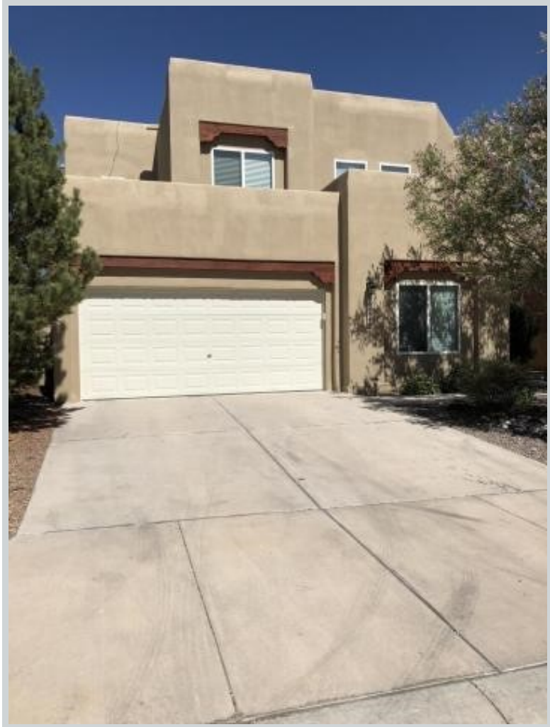
Sold Comp 3 10508 Cadiz St Nw View Front