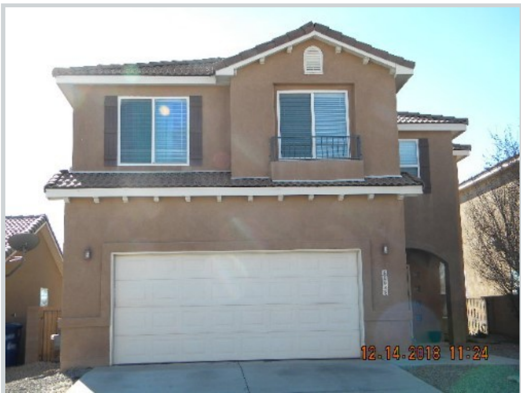
Subject 6004 Pyrenees Ct Nw