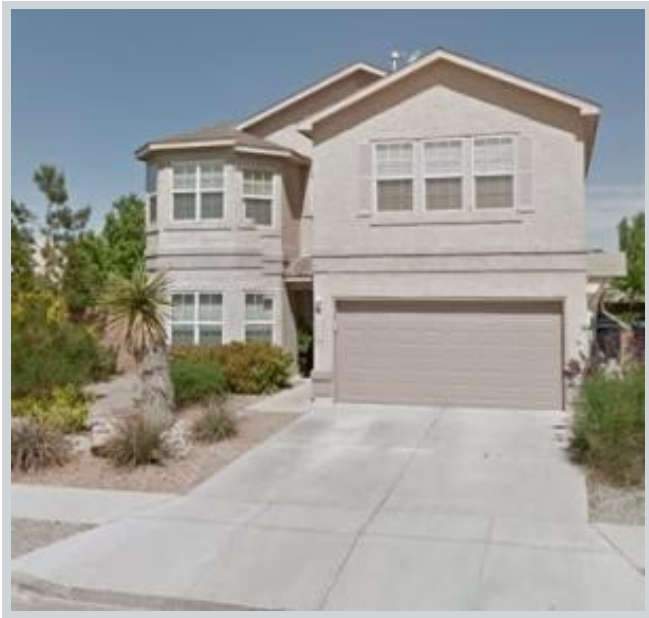
Sold Comp 1 10401 Calle Hermosa Ct Nw View Front