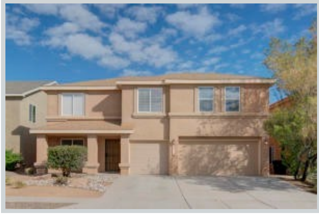
Listing Comp 3 6519 Avenida Madrid Nw View Front