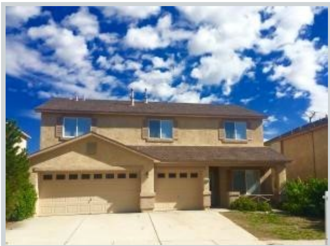
Listing Comp 1 10209 Calle Hermosa Pl Nw View Front

Address 6004 Pyrenees Court Nw, Albuquerque, NM 87114 Loan Number 36708 Suggested List $250,000 Suggested Repaired $250,000 Sale $245,000