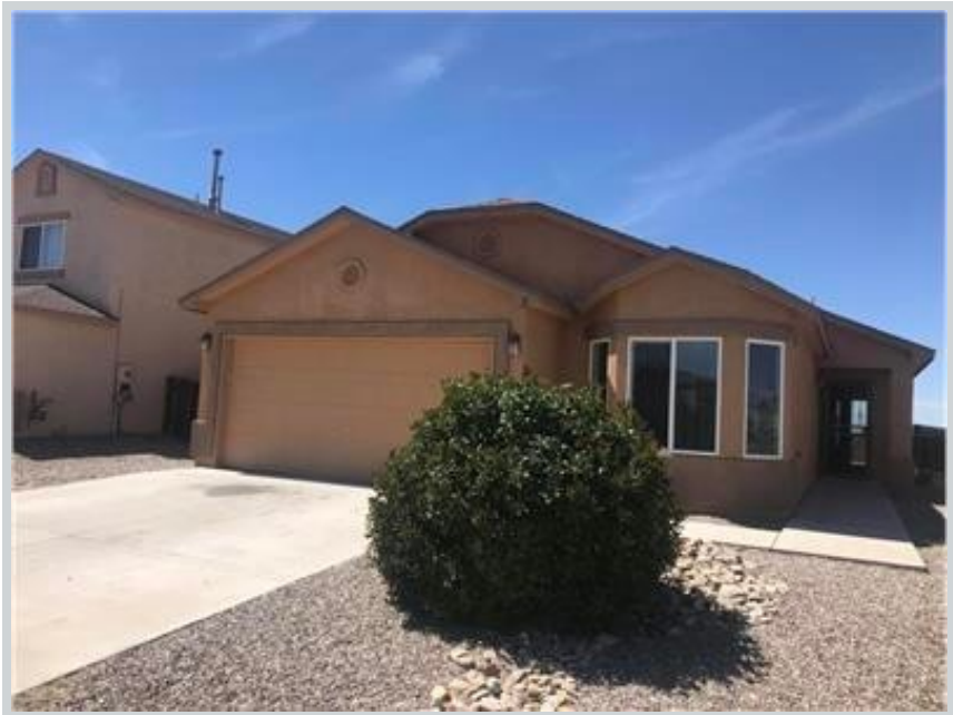
Listing Comp 3 40 Tome Vista Dr