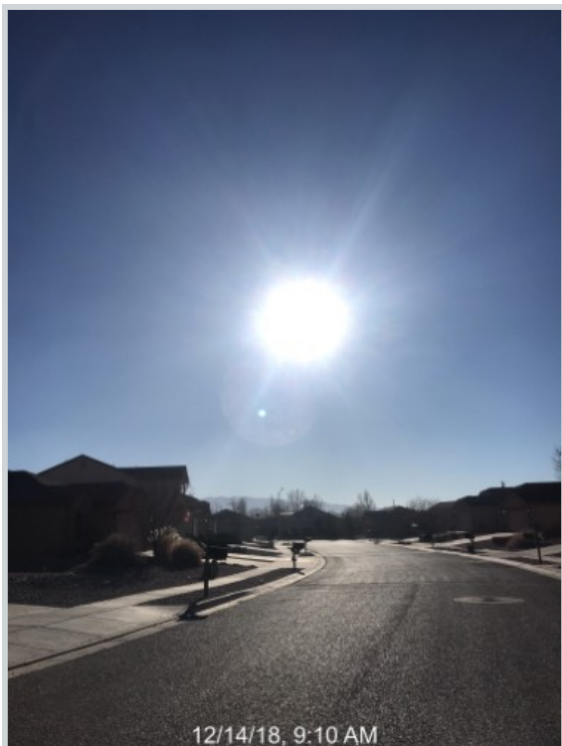
Subject 7 Tome Vista Dr View Street