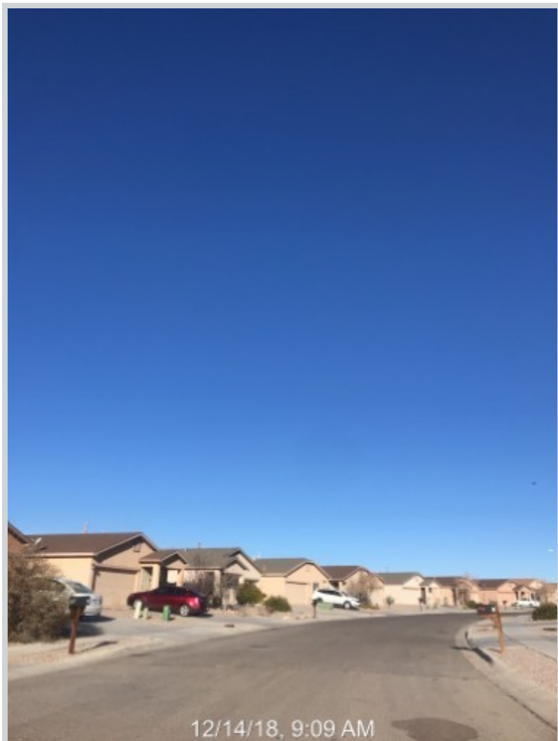
Subject 7 Tome Vista Dr View Street

Address 7 Tome Vista Drive, Los Lunas, NM 87031 Loan Number 36715 Suggested List $155,000 Suggested Repaired $155,000 Sale $150,000