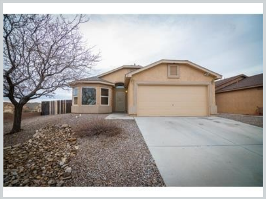
Listing Comp 1 2 Tome Vista Dr