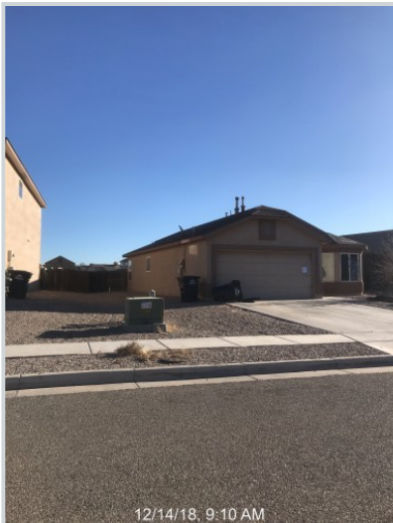
Subject 7 Tome Vista Dr