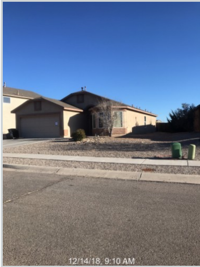
Subject 7 Tome Vista Dr