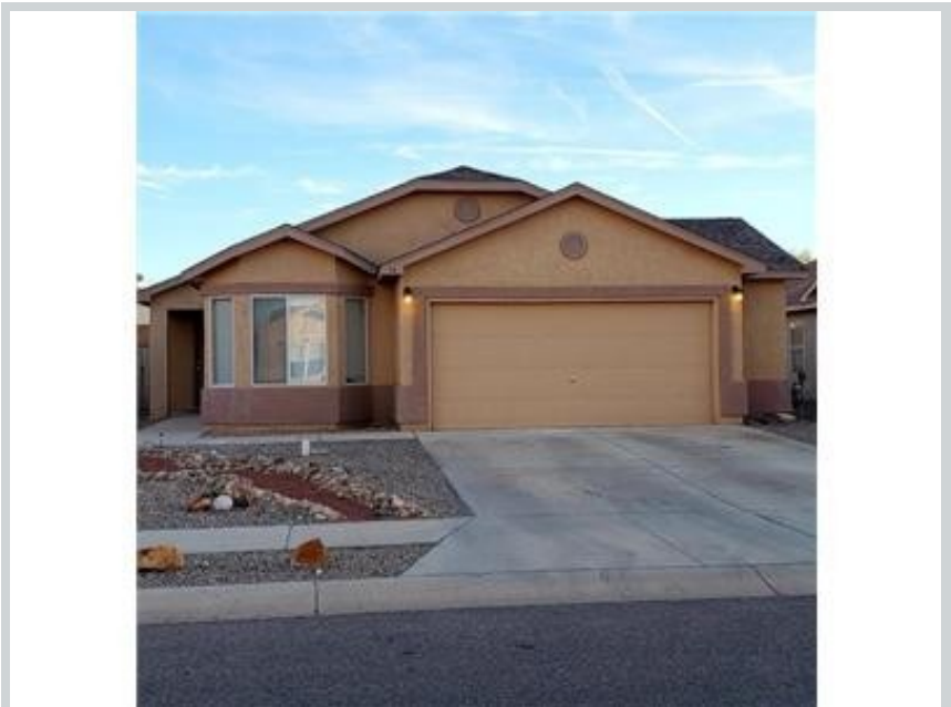
Listing Comp 2 54 Avenida Jardin