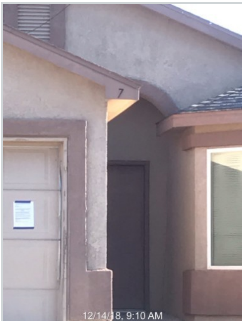
Subject 7 Tome Vista Dr