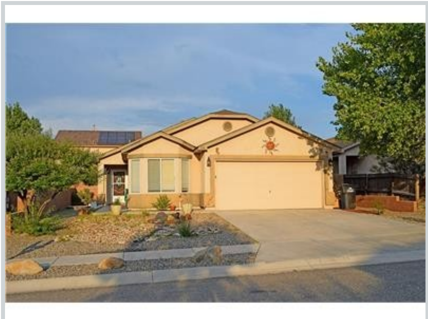
Sold Comp 1 126 Avenida Jardin