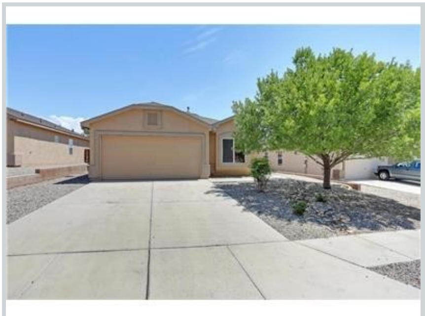
Sold Comp 3 10 Avenida Jardin