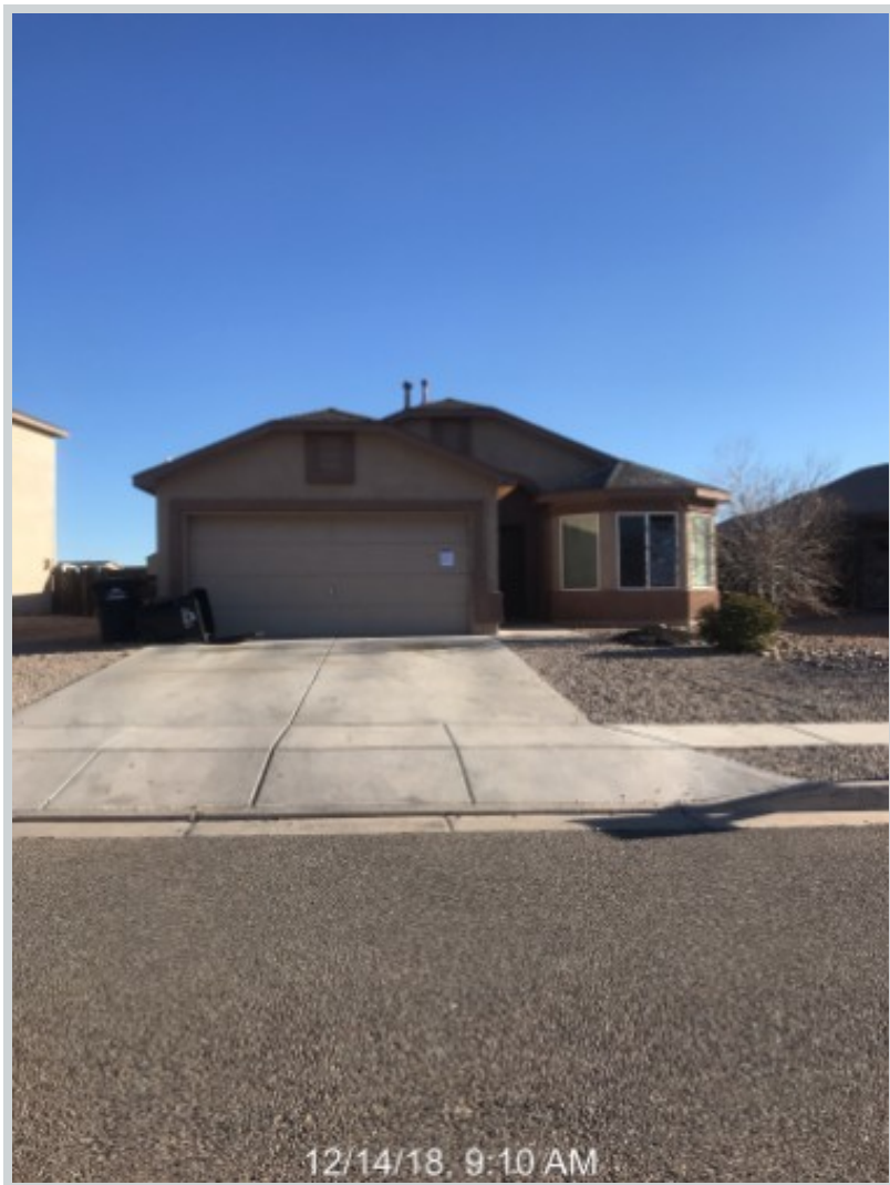
Subject 7 Tome Vista Dr