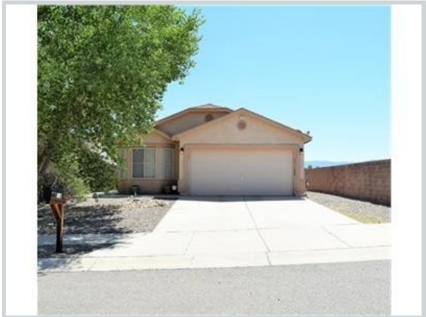
Sold Comp 2 128 Avenida Jardin