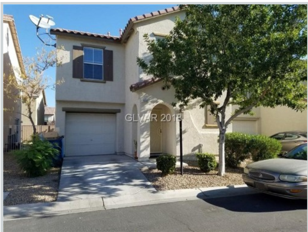
Sold Comp 2 7332 Daily Hope Av