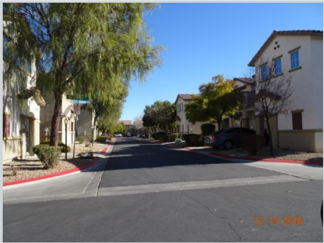
Subject 7240 Nova Ridge Ct