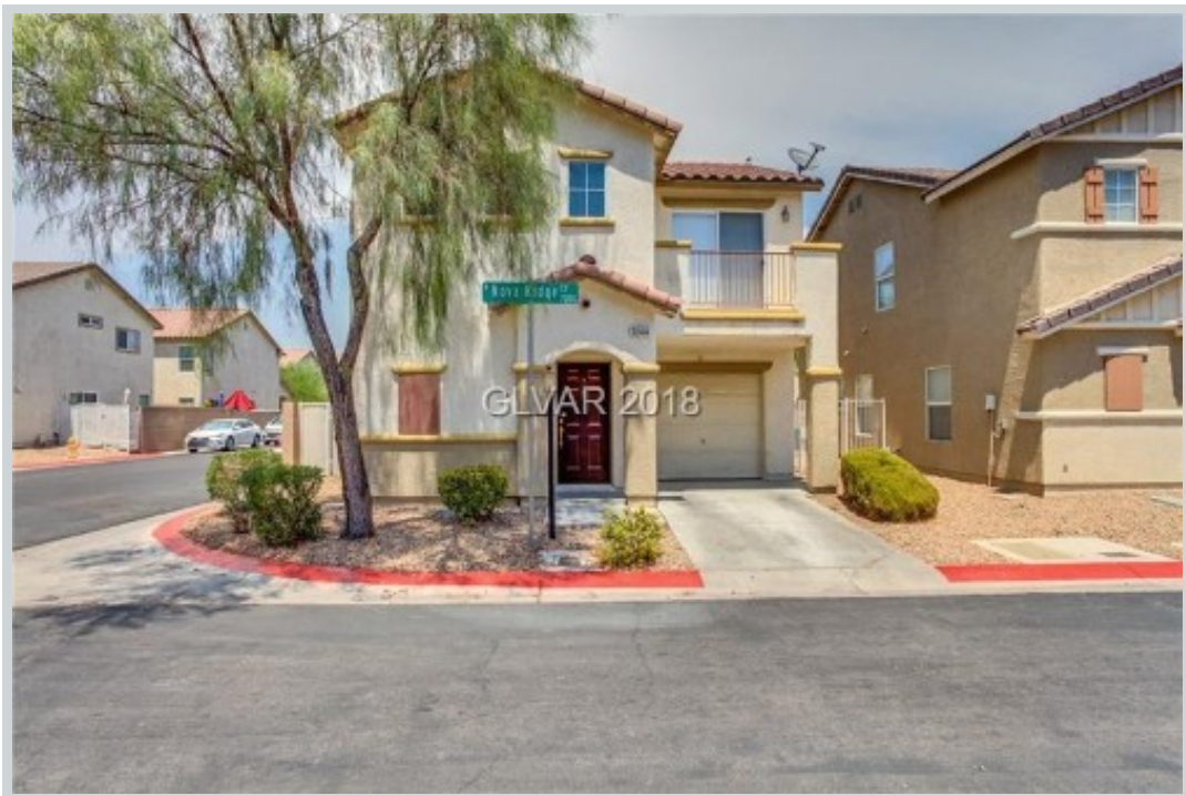
Sold Comp 1 7244 Nova Ridge Ct

Address 7240 Nova Ridge Court, Las Vegas, NV 89129 Loan Number 36738 Suggested List $215,000 Suggested Repaired $215,000 Sale $210,000