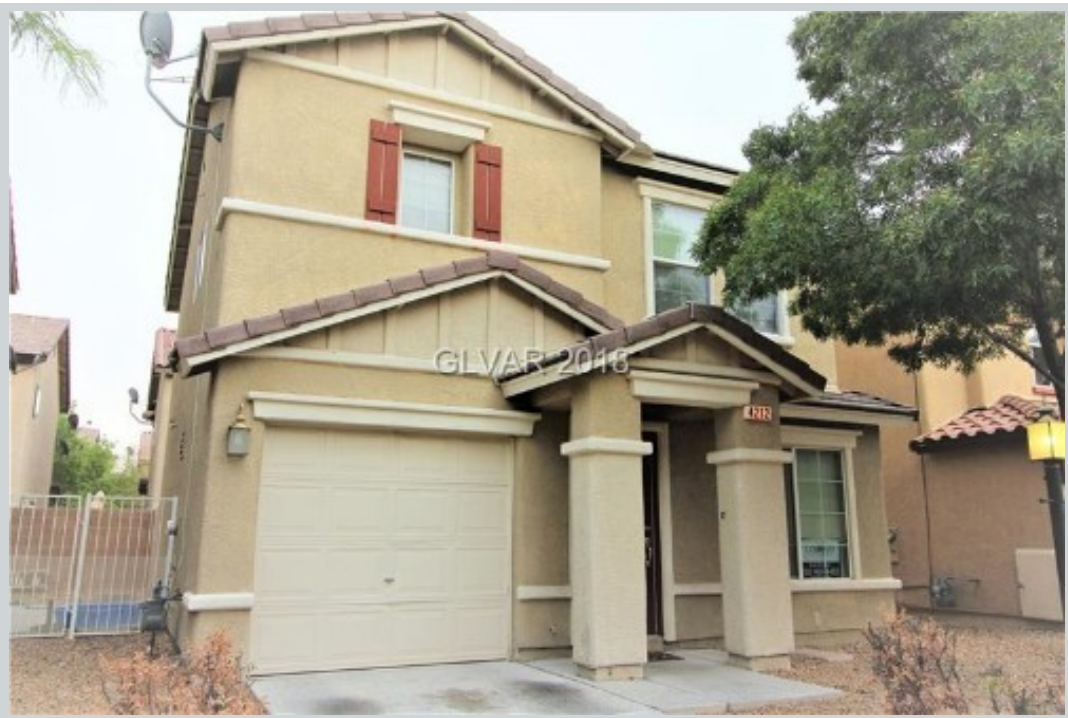
Listing Comp 1 4212 Plummer Ct