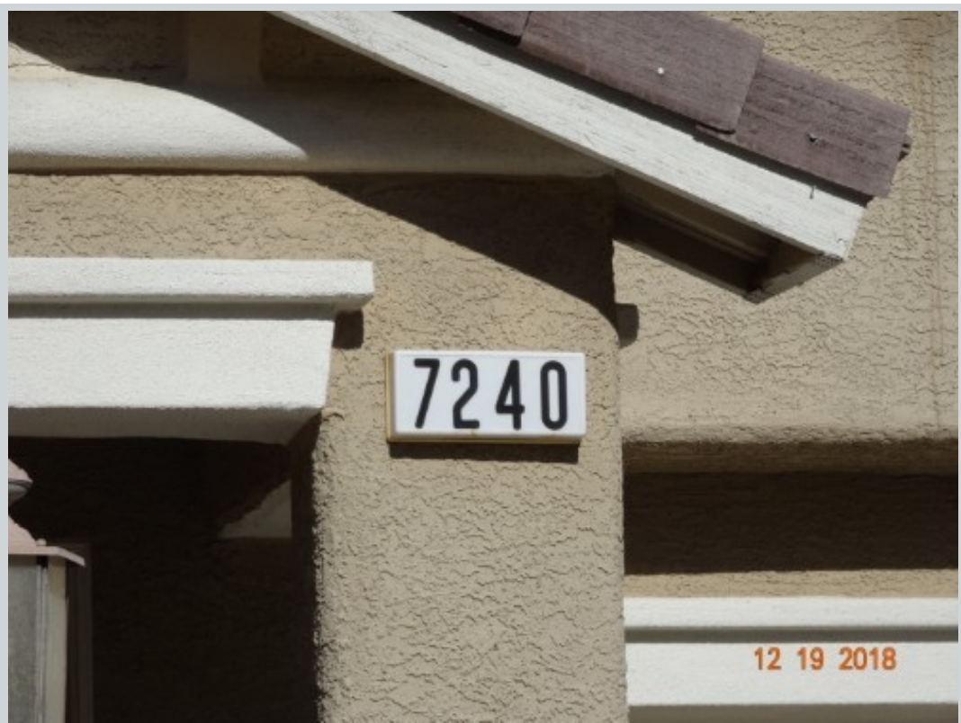
Subject 7240 Nova Ridge Ct