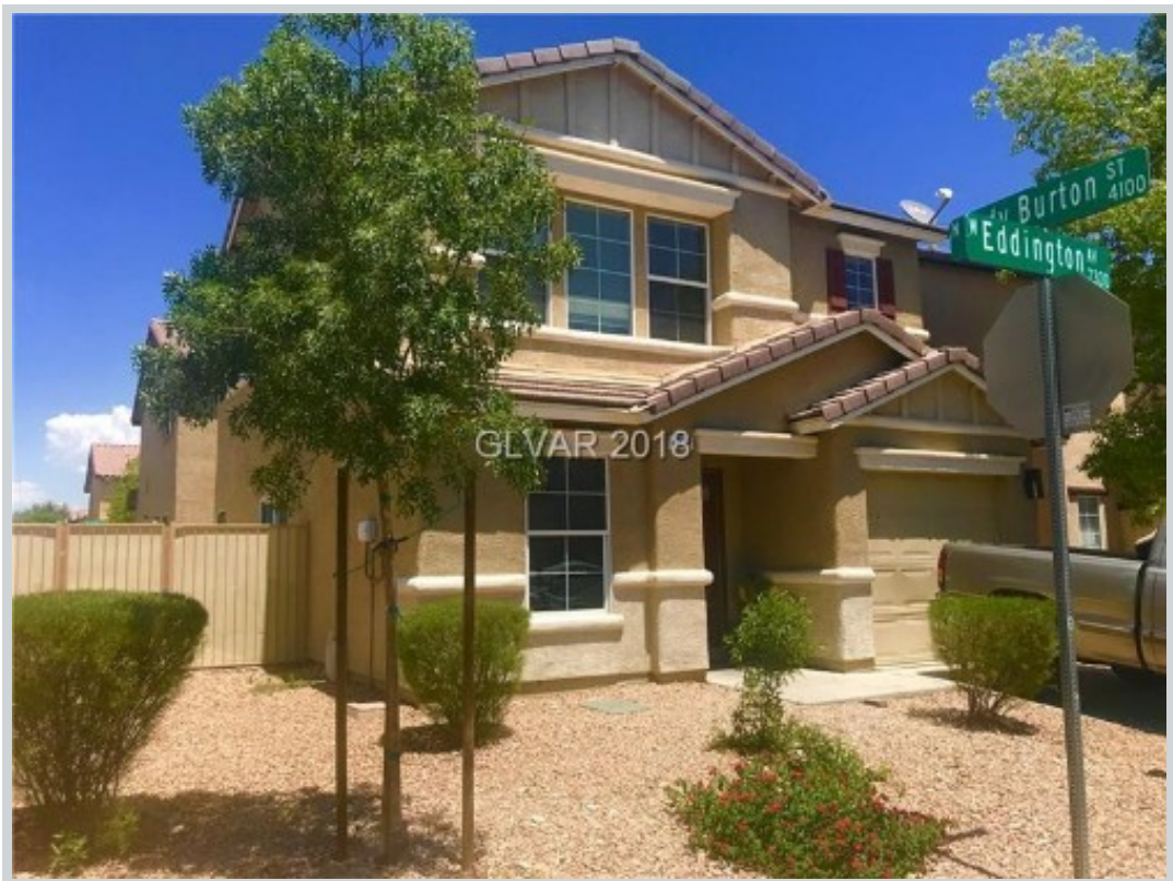
Sold Comp 3 732 Eddington Av