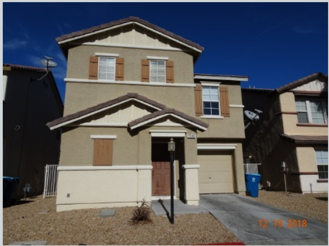
Subject 7240 Nova Ridge Ct