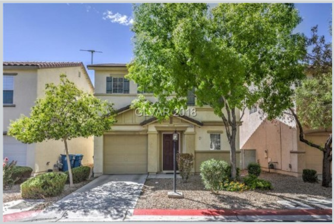
Listing Comp 3 4253 Olympic Point Dr