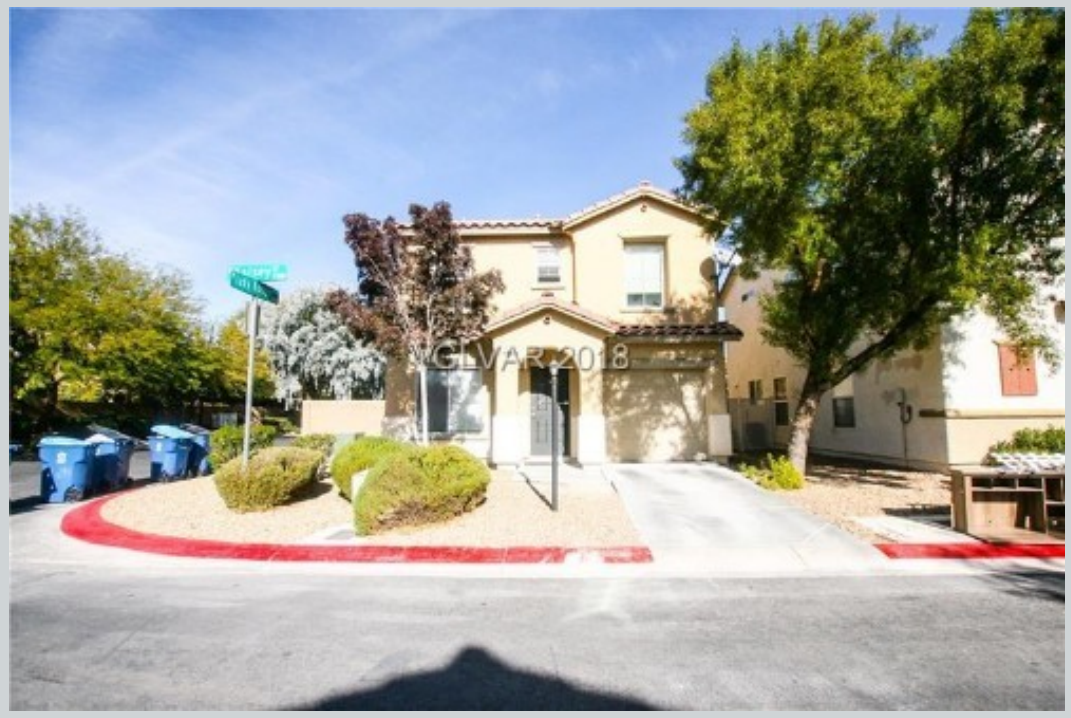
Listing Comp 2 7332 Halsey Ct