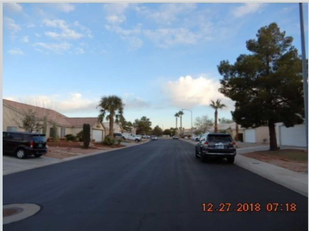
Subject 4818 Carefree Dr