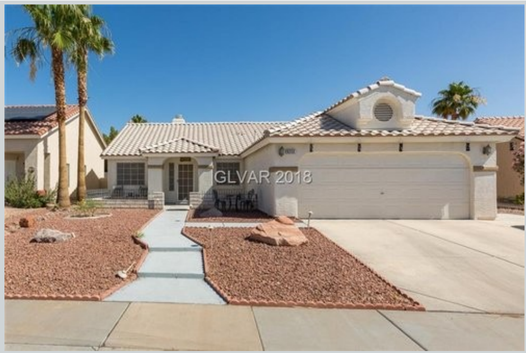
Sold Comp 1 6252 Belgium Dr