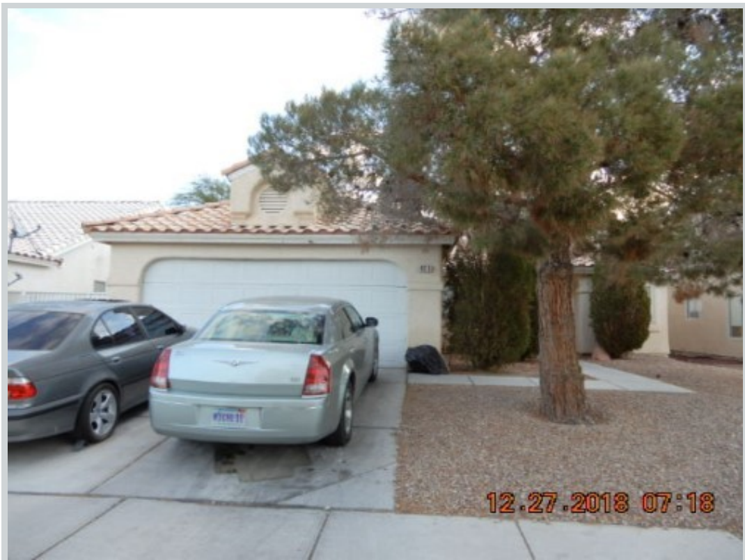
Subject 4818 Carefree Dr