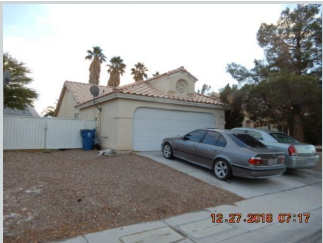
Subject 4818 Carefree Dr