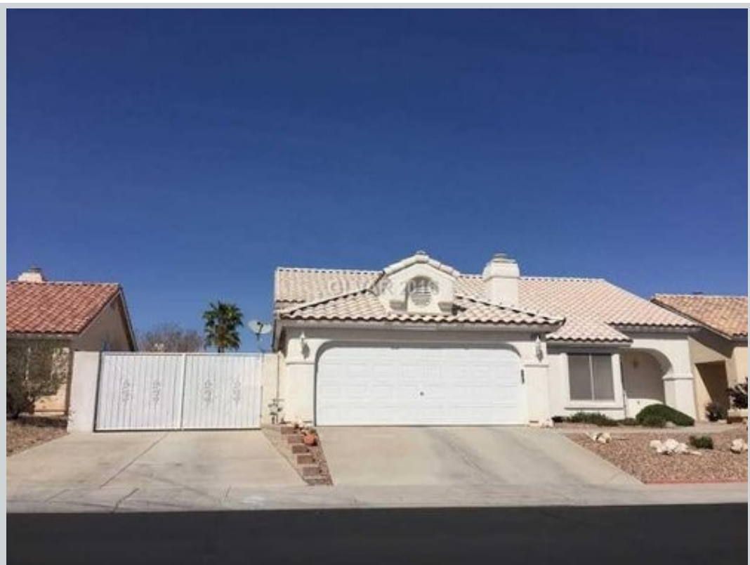
Listing Comp 1 6250 Alkaid Ave