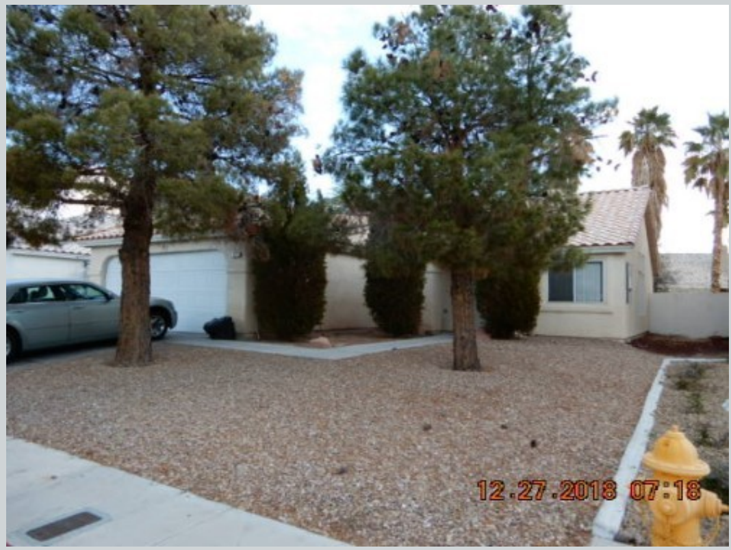
Subject 4818 Carefree Dr