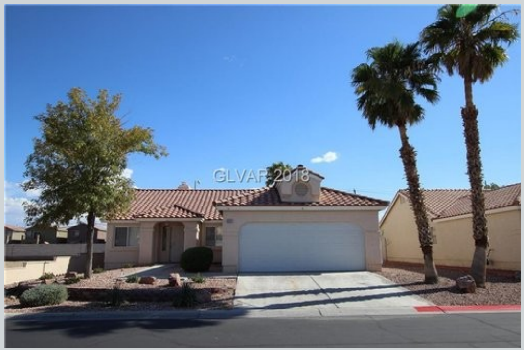
Listing Comp 2 6357 Elvido Ave