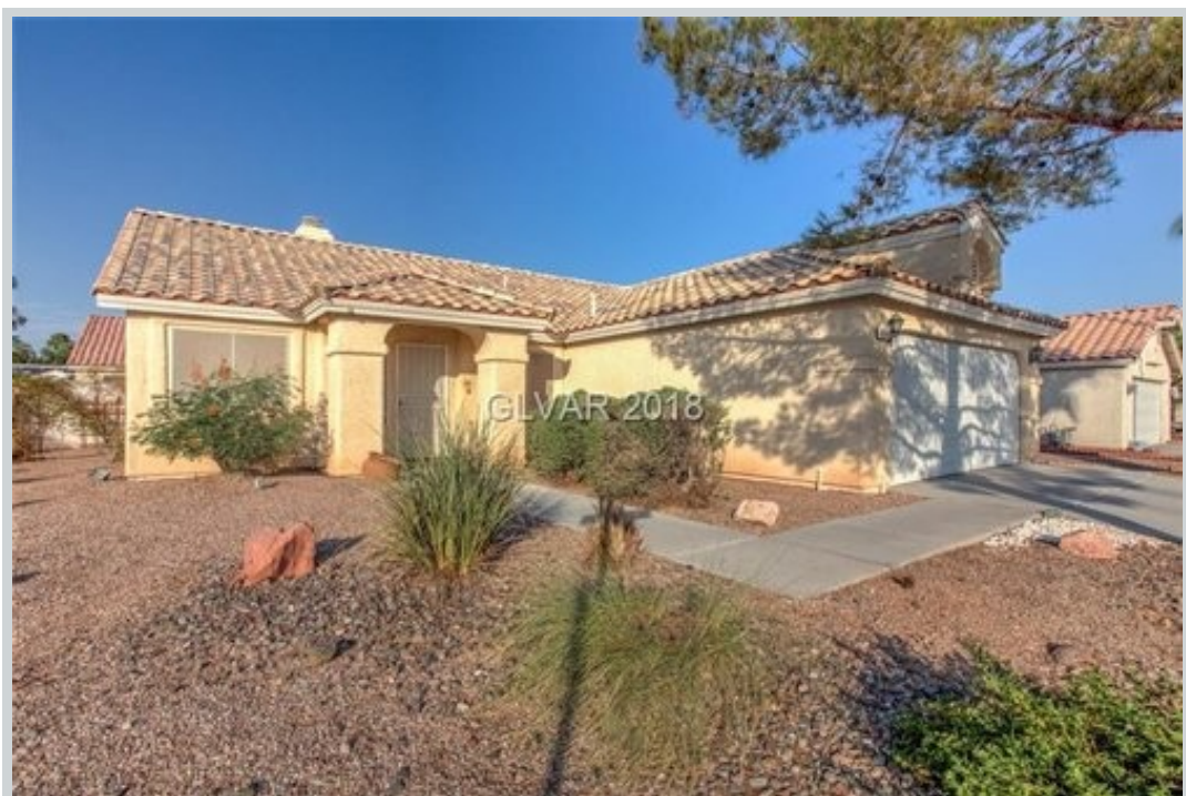
Sold Comp 3 4670 Carefree Dr