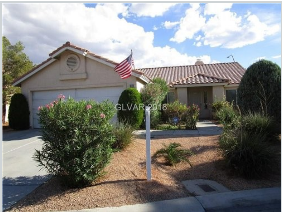
Sold Comp 2 6129 Basilone Ave