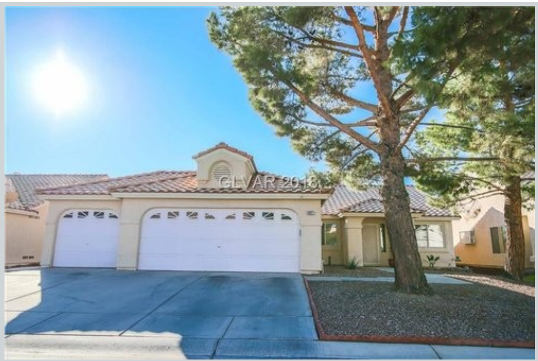
Listing Comp 3 4821 Carefree Dr