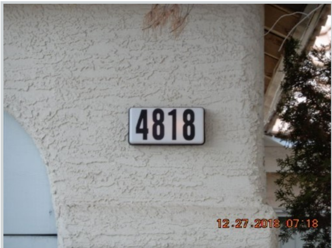
Subject 4818 Carefree Dr