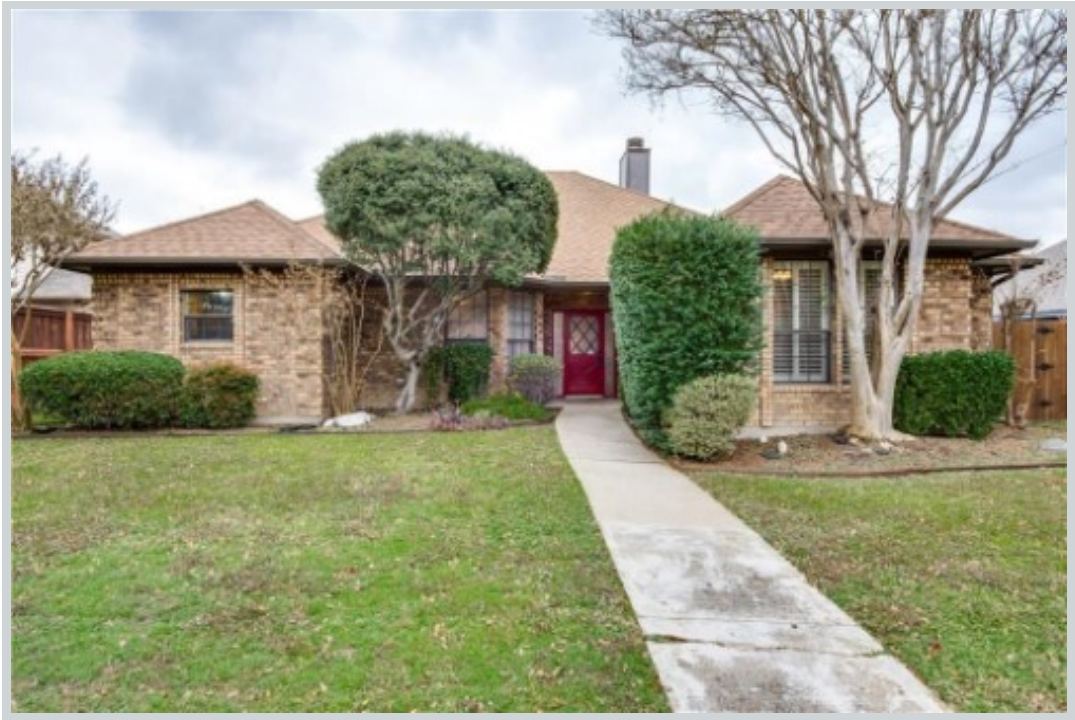
Listing Comp 1 4123 Lawngate Dr