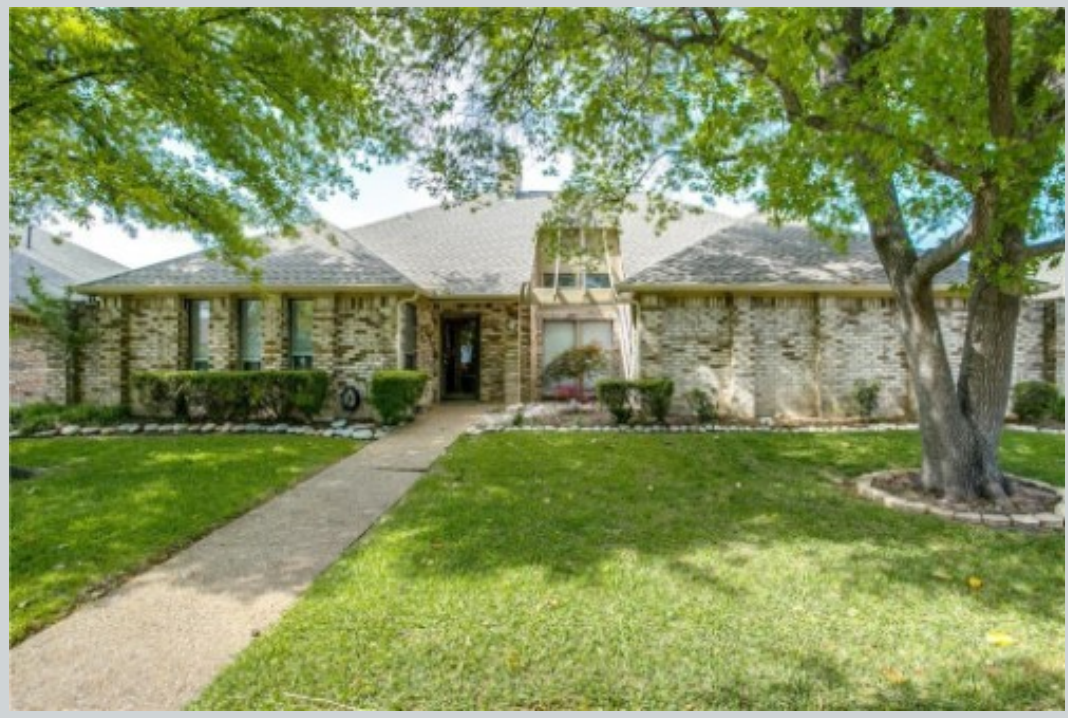
Sold Comp 2 4327 Country Brook Dr View Front

Address 4015 Joshua Lane, Dallas, TX 75287 Loan Number 36750 Suggested List $334,500 Suggested Repaired $334,500 Sale $330,000