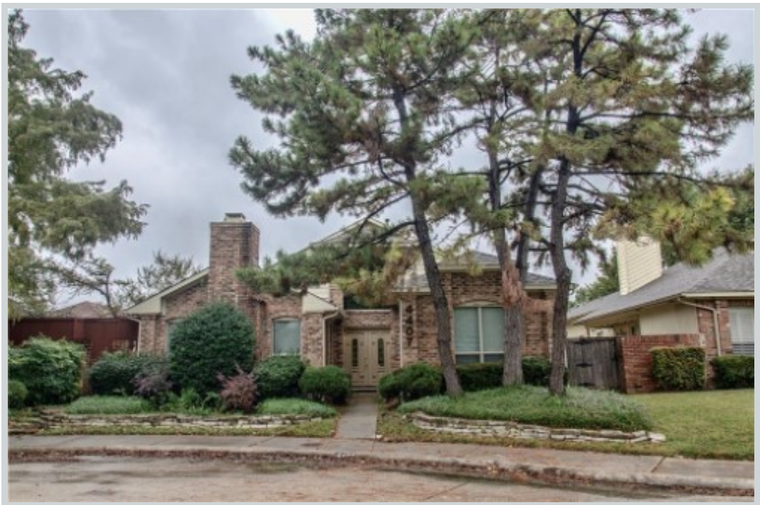
Listing Comp 2 4407 Rushing Rd