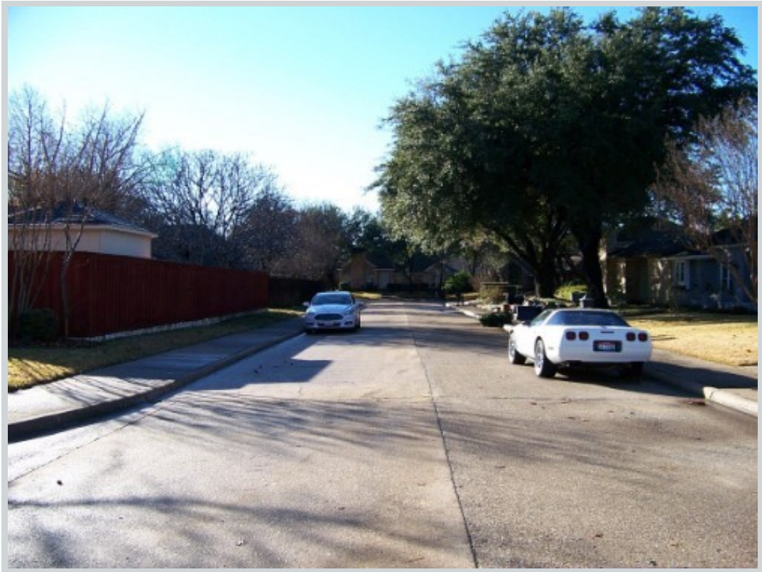
Subject 4015 Joshua Ln

Address 4015 Joshua Lane, Dallas, TX 75287 Loan Number 36750 Suggested List $334,500 Suggested Repaired $334,500 Sale $330,000