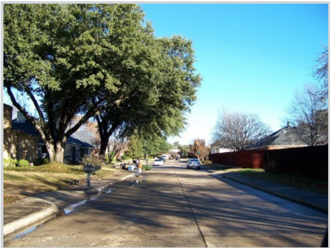
Subject 4015 Joshua Ln