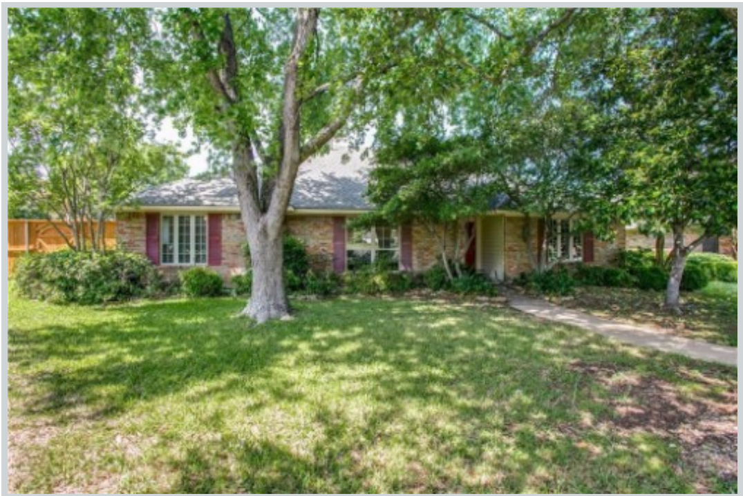
Sold Comp 1 4019 Kentshire Ln