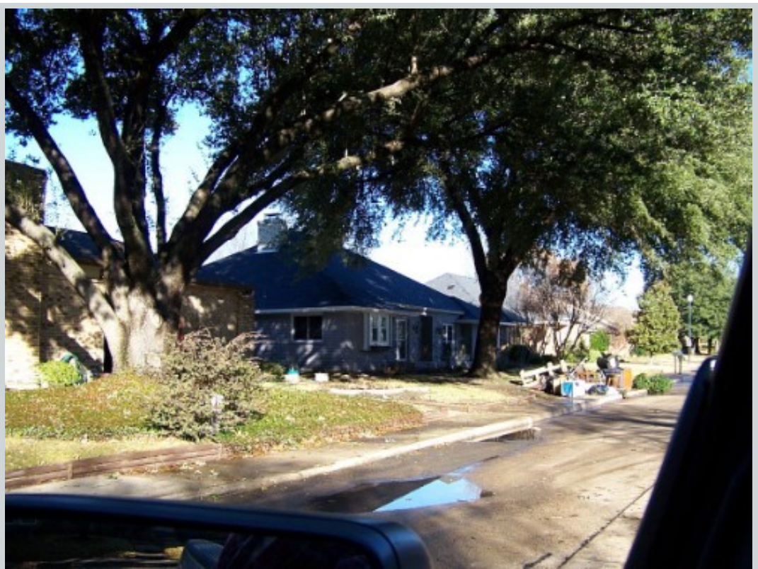
Subject 4015 Joshua Ln