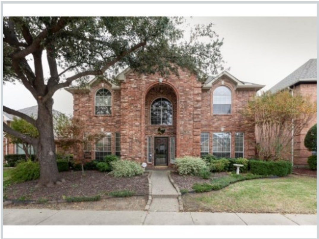
Listing Comp 3 4448 Voss Hills Pl

Address 4015 Joshua Lane, Dallas, TX 75287 Loan Number 36750 Suggested List $334,500 Suggested Repaired $334,500 Sale $330,000