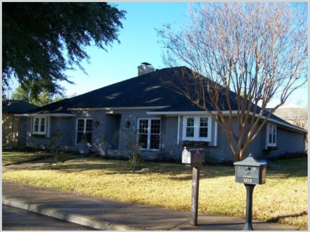
Subject 4015 Joshua Ln

Address 4015 Joshua Lane, Dallas, TX 75287 Loan Number 36750 Suggested List $334,500 Suggested Repaired $334,500 Sale $330,000