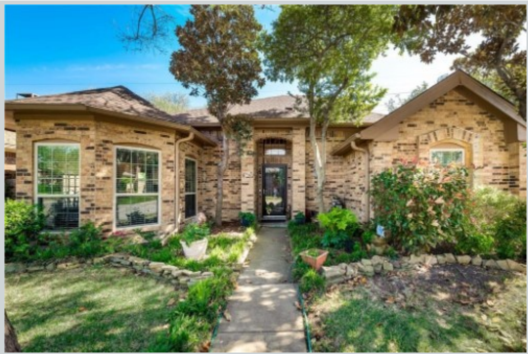
Sold Comp 3 4328 Windhaven Lane View Front