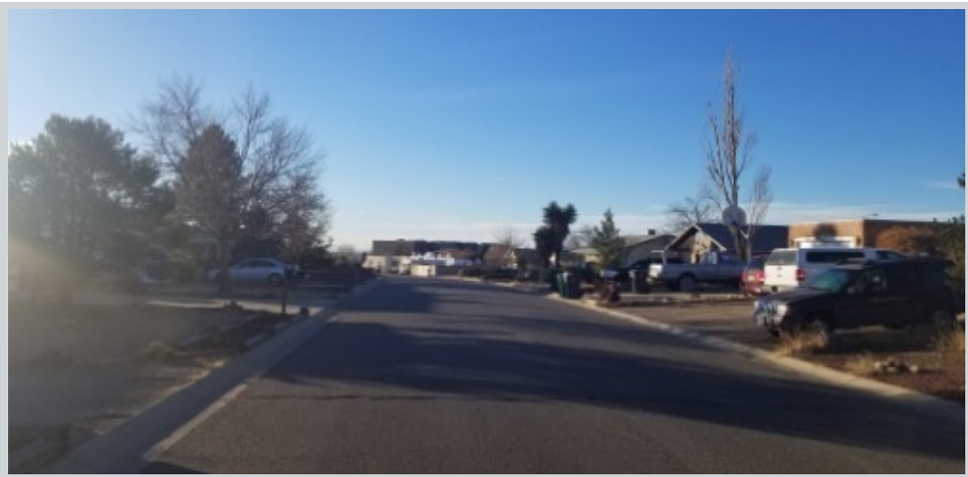
Subject 305 Summer Winds Dr Se