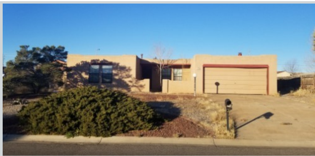
Subject 305 Summer Winds Dr Se