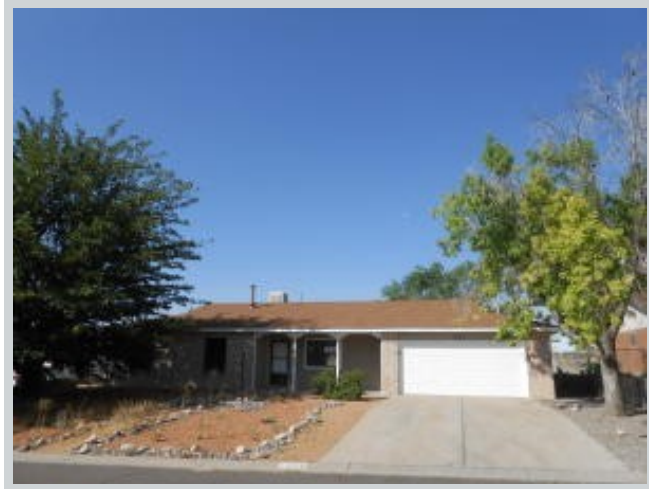
Sold Comp 1 533 Stallion Road View Front