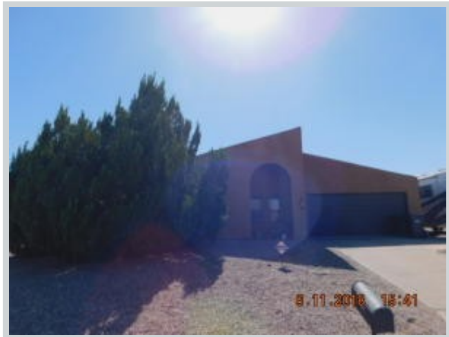
Listing Comp 2 209 Summer Winds Drive View Front