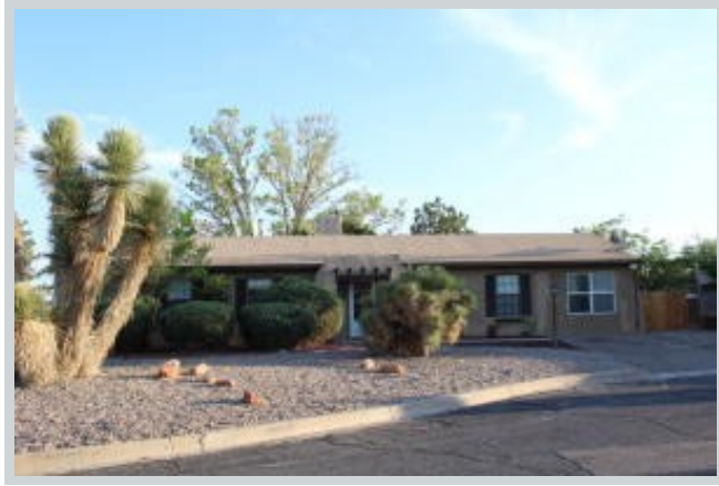
Listing Comp 3 1600 Fornax Road View Front