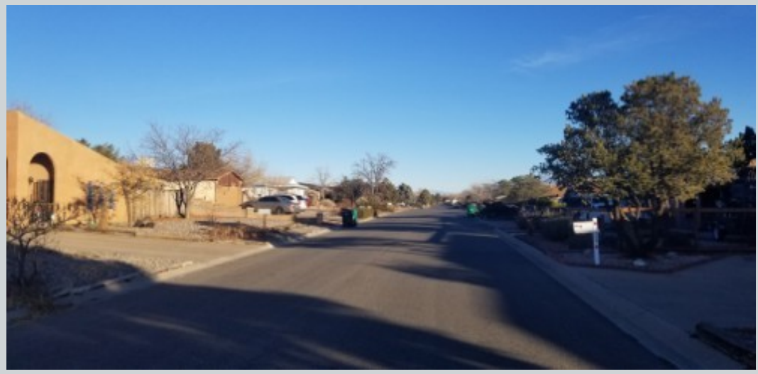
Subject 305 Summer Winds Dr Se