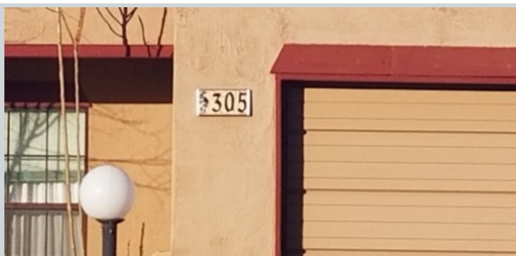
Subject 305 Summer Winds Dr Se