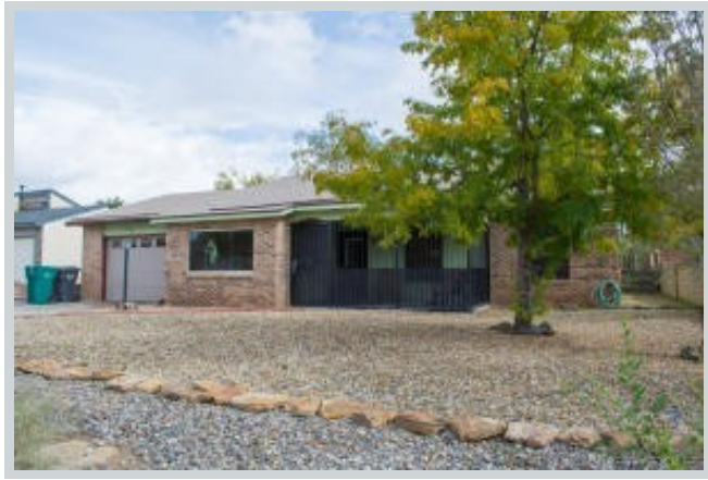
Listing Comp 1 2701 Parr Road View Front