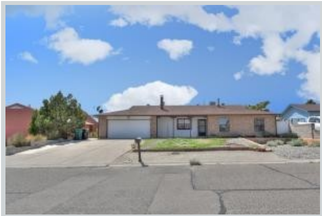
Sold Comp 3 625 Wagon Train Drive View Front