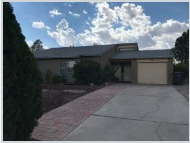
Sold Comp 2 99 Dakota Morning Road View Front