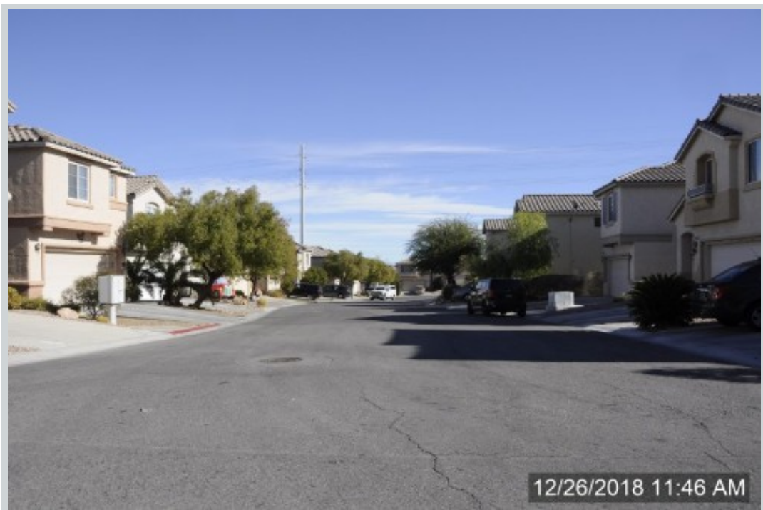
Subject 10646 Streamside Ave View Street Comment "View One"