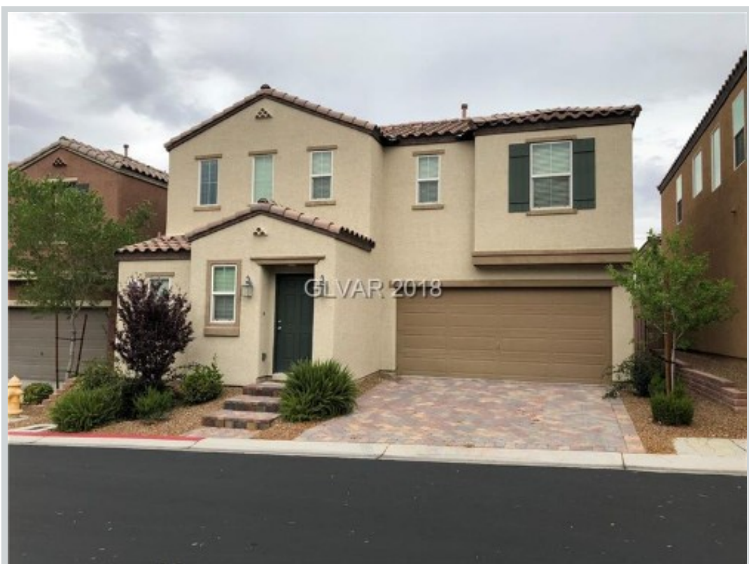
Sold Comp 3 3636 Gainsville St