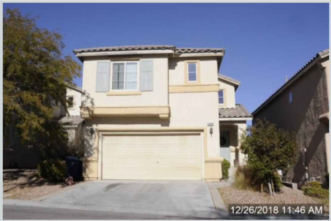
Subject 10646 Streamside Ave