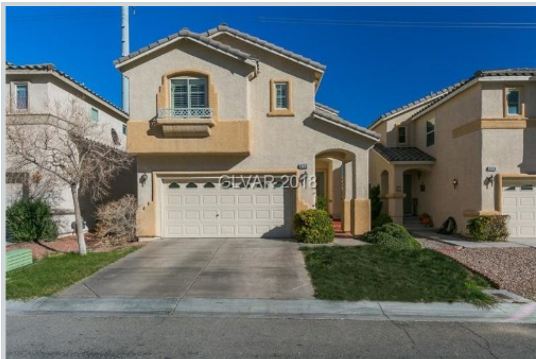
Listing Comp 1 3728 Starlight Evening St View Front

Address 10646 Streamside Avenue, Las Vegas, NV 89129 Loan Number 36755 Suggested List $285,000 Suggested Repaired $285,000 Sale $280,000