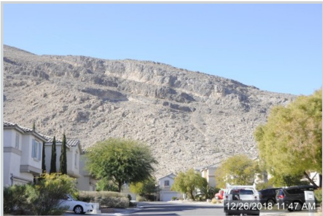
Subject 10646 Streamside Ave View Other Comment "Mountains Visible Beyond the End of the Subject's Street"

Address 10646 Streamside Avenue, Las Vegas, NV 89129 Loan Number 36755 Suggested List $285,000 Suggested Repaired $285,000 Sale $280,000