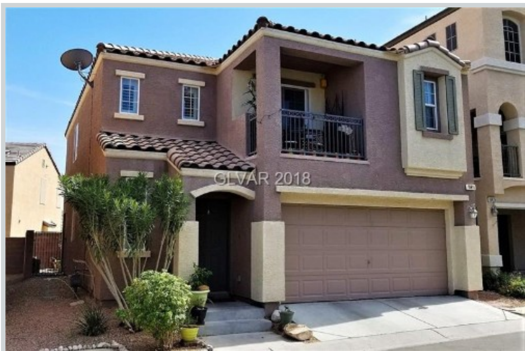
Sold Comp 1 10611 Gibbous Moon Dr View Front