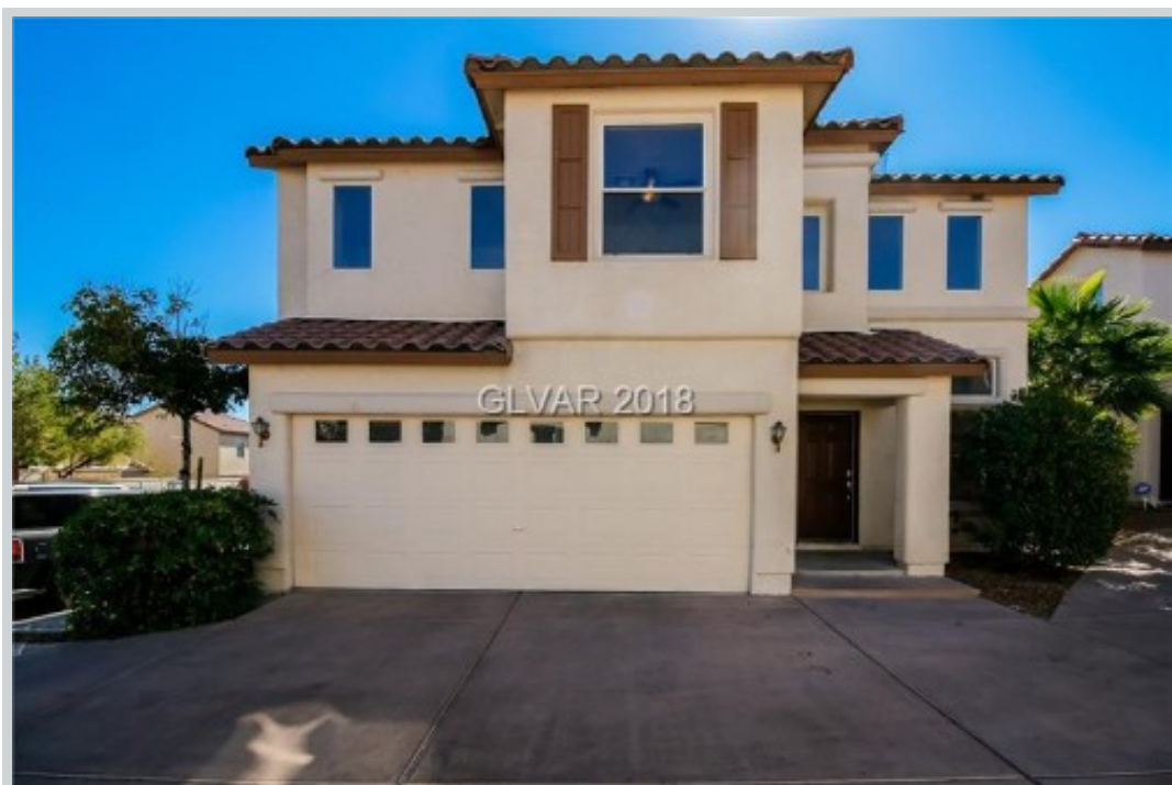
Listing Comp 2 3949 Bayamon St View Front