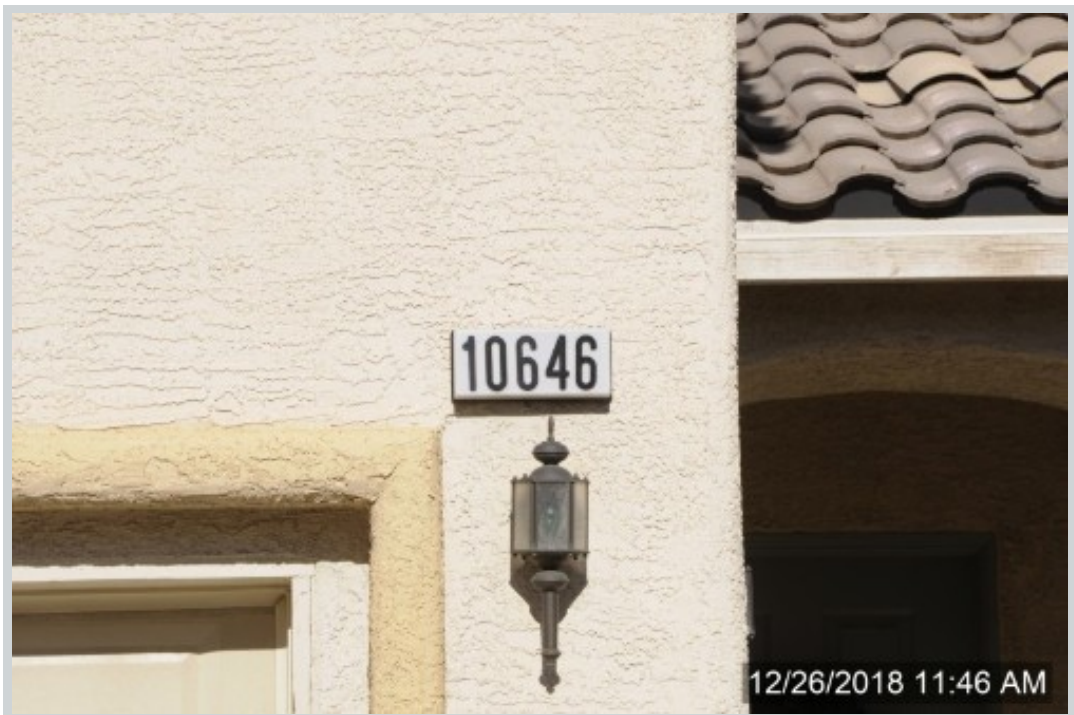
Subject 10646 Streamside Ave