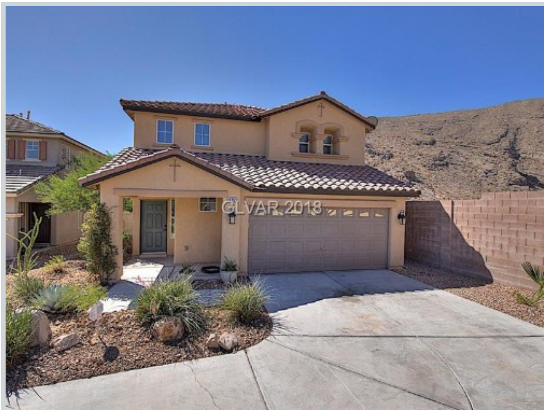
Listing Comp 3 10753 Chickasaw Bend Ct View Front

Address 10646 Streamside Avenue, Las Vegas, NV 89129 Loan Number 36755 Suggested List $285,000 Suggested Repaired $285,000 Sale $280,000