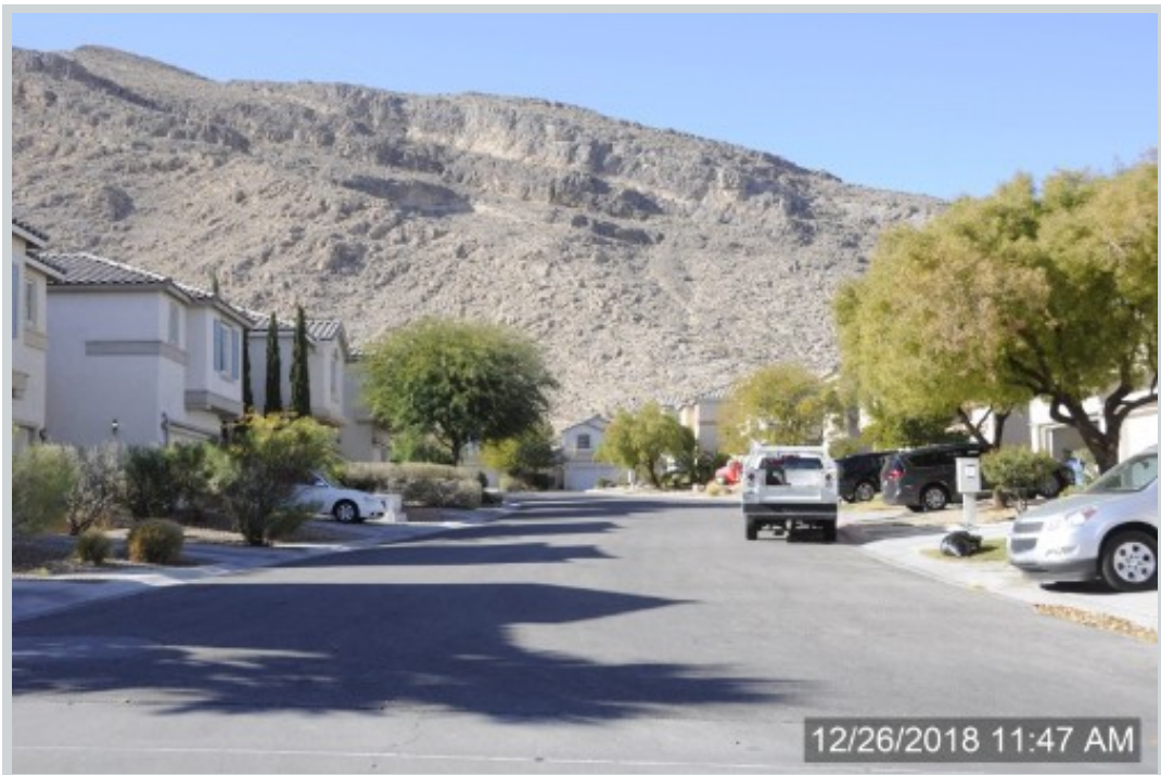
Subject 10646 Streamside Ave View Street Comment "View Two"

Address 10646 Streamside Avenue, Las Vegas, NV 89129 Loan Number 36755 Suggested List $285,000 Suggested Repaired $285,000 Sale $280,000