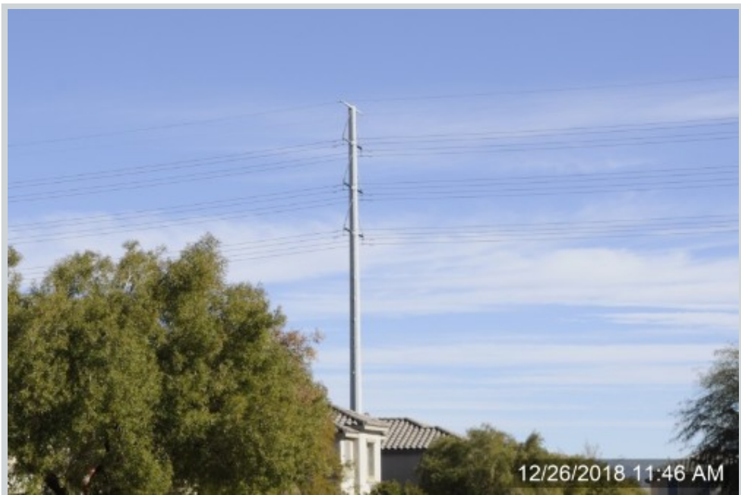
Subject 10646 Streamside Ave View Other Comment "Power Lines Visible Behind the Row of Houses Located Beyond the End of the Subject's Street"