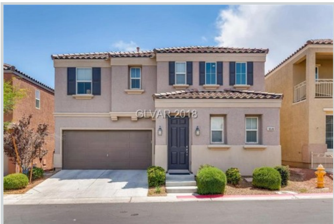
Sold Comp 2 10549 Hamdem Ave

Address 10646 Streamside Avenue, Las Vegas, NV 89129 Loan Number 36755 Suggested List $285,000 Suggested Repaired $285,000 Sale $280,000