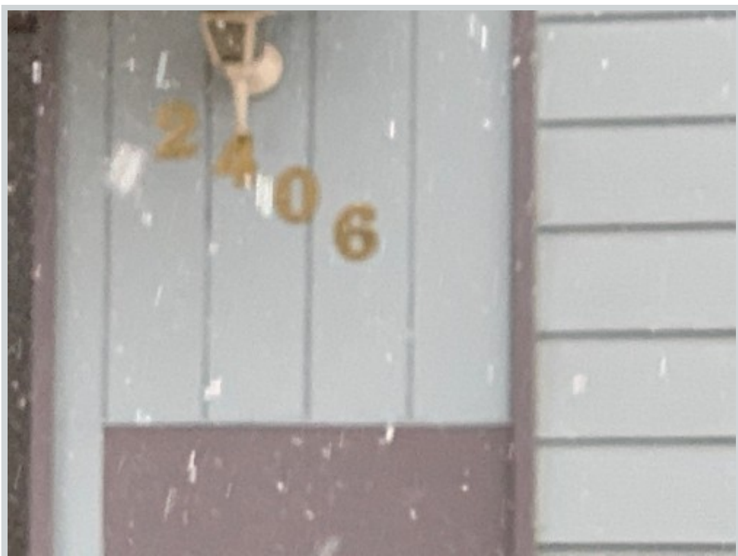
Subject 2406 S Pines Rd

Address 2406 S Pines Road, Spokane, WA 99206 Loan Number 36757 Suggested List $210,000 Suggested Repaired $210,000 Sale $207,500