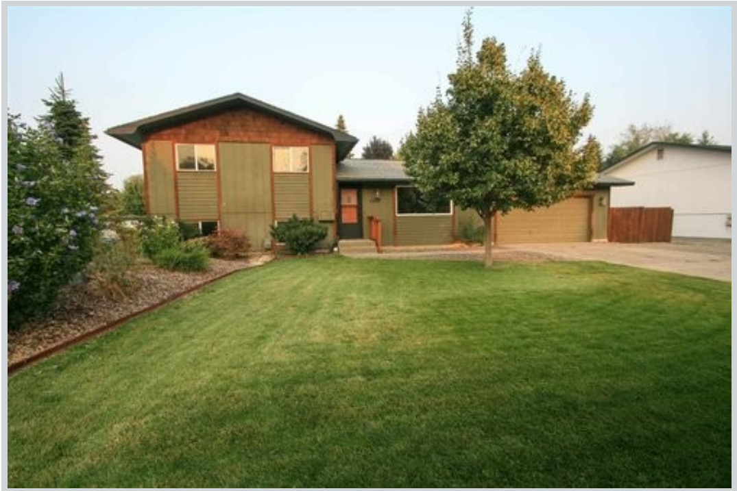
Sold Comp 3 3419 S Bowdish Rd