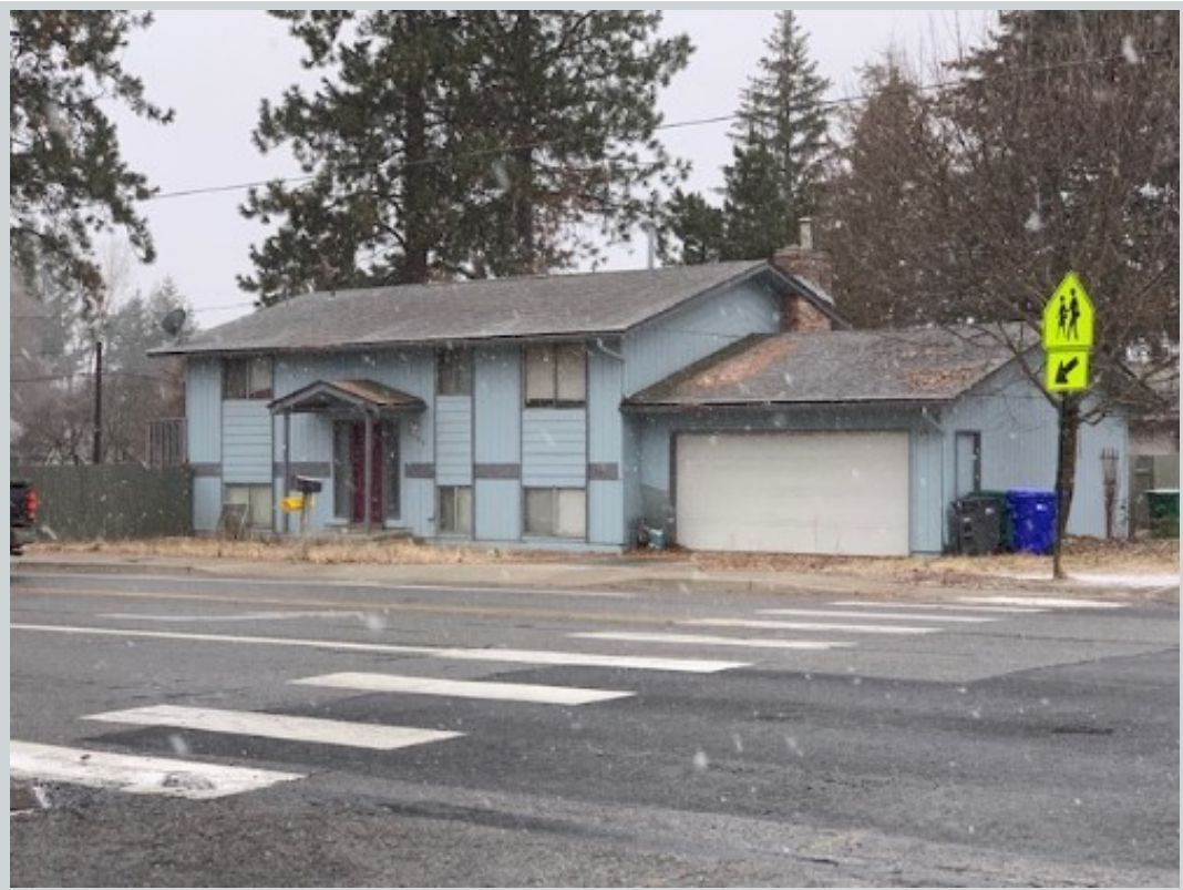
Subject 2406 S Pines Rd