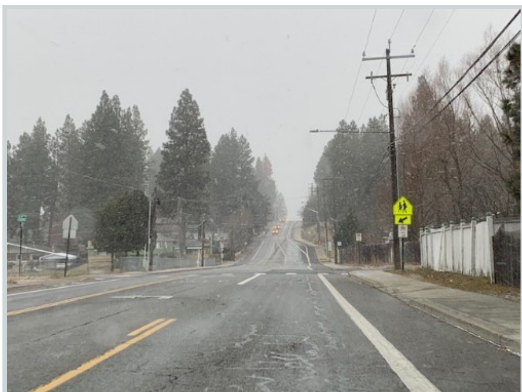
Subject 2406 S Pines Rd