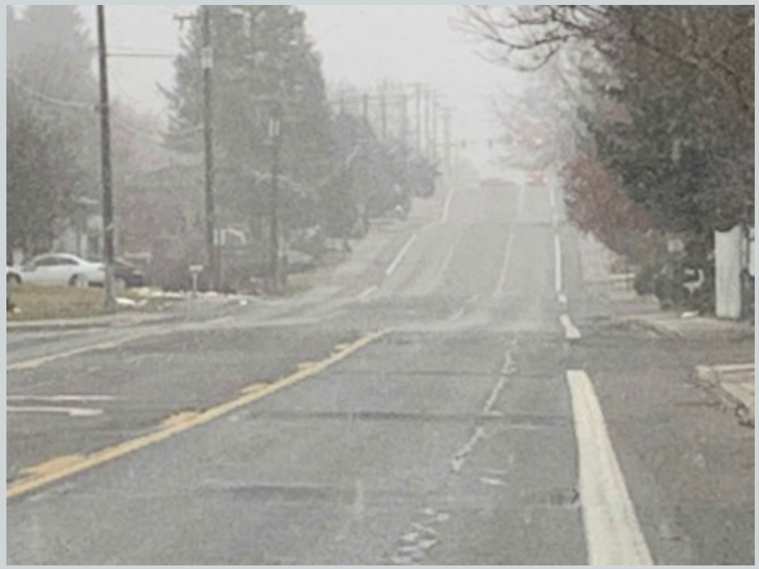
Subject 2406 S Pines Rd