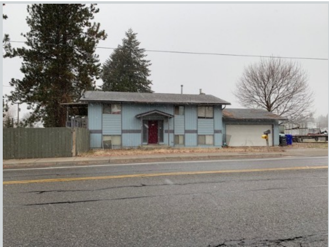
Subject 2406 S Pines Rd