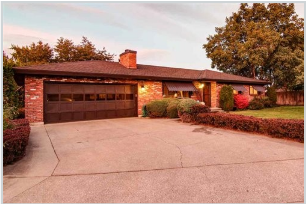
Listing Comp 3 11811 E 26th Ave