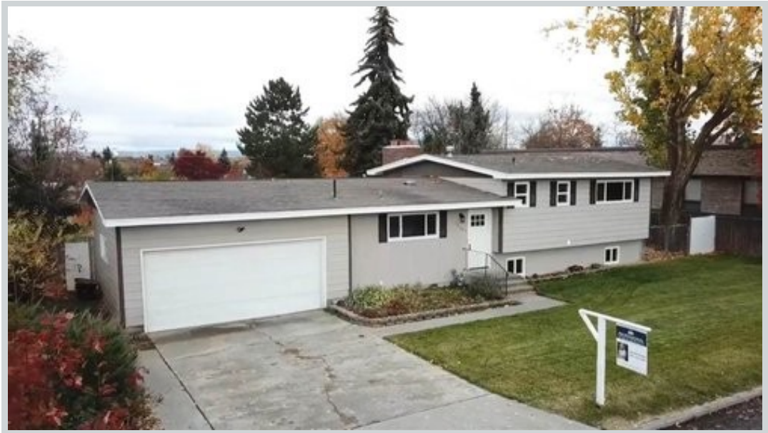
Listing Comp 2 12203 E 10th Ave