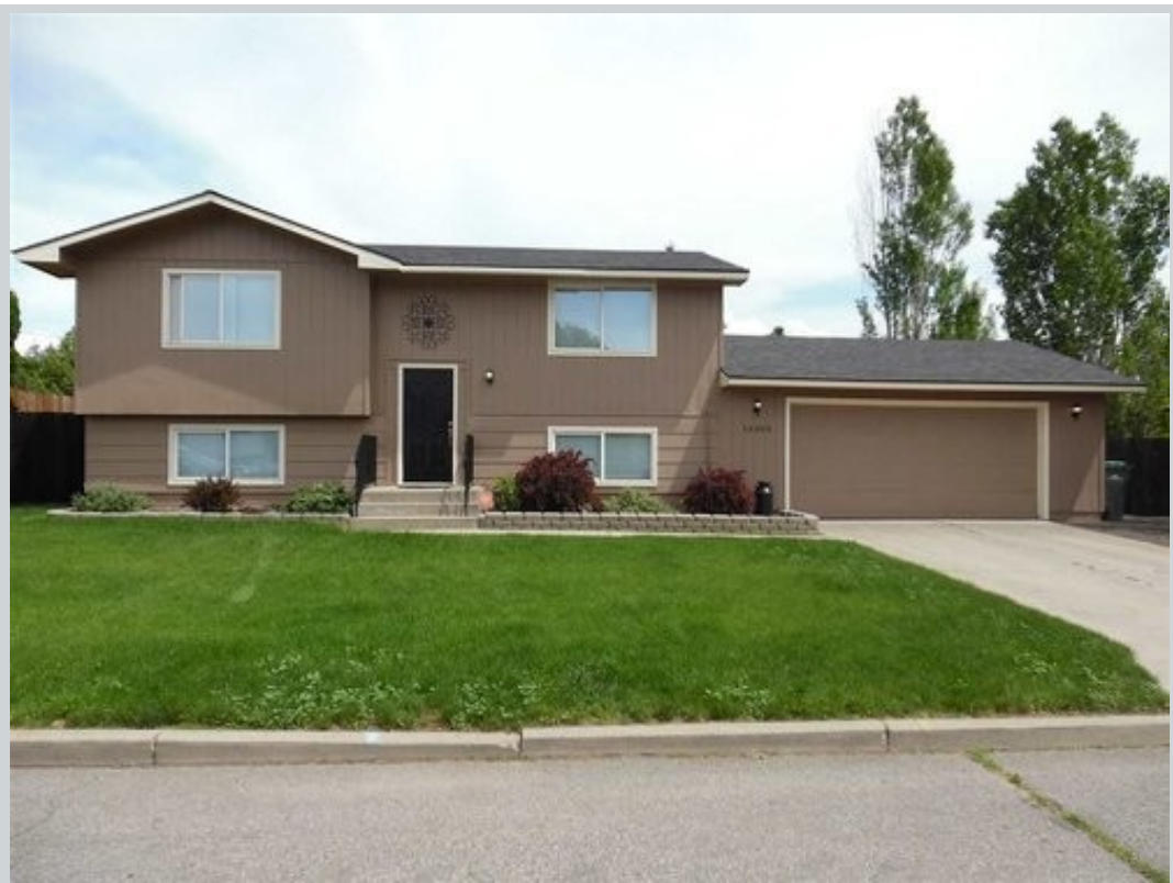
Sold Comp 2 13305 E Guthrie Dr