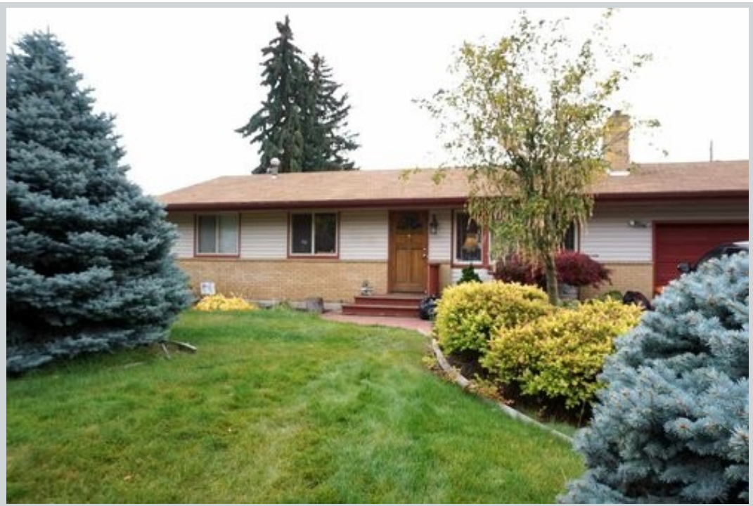
Listing Comp 1 11912 E 22nd Ave