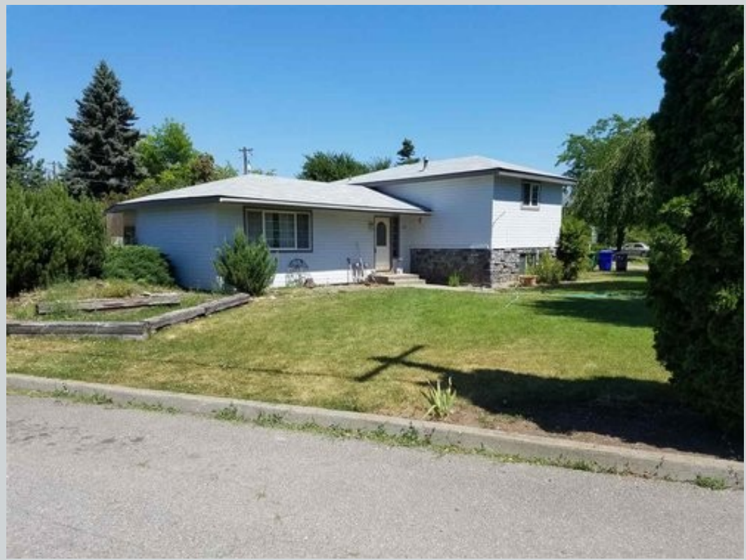
Sold Comp 1 12903 E 31st Ave