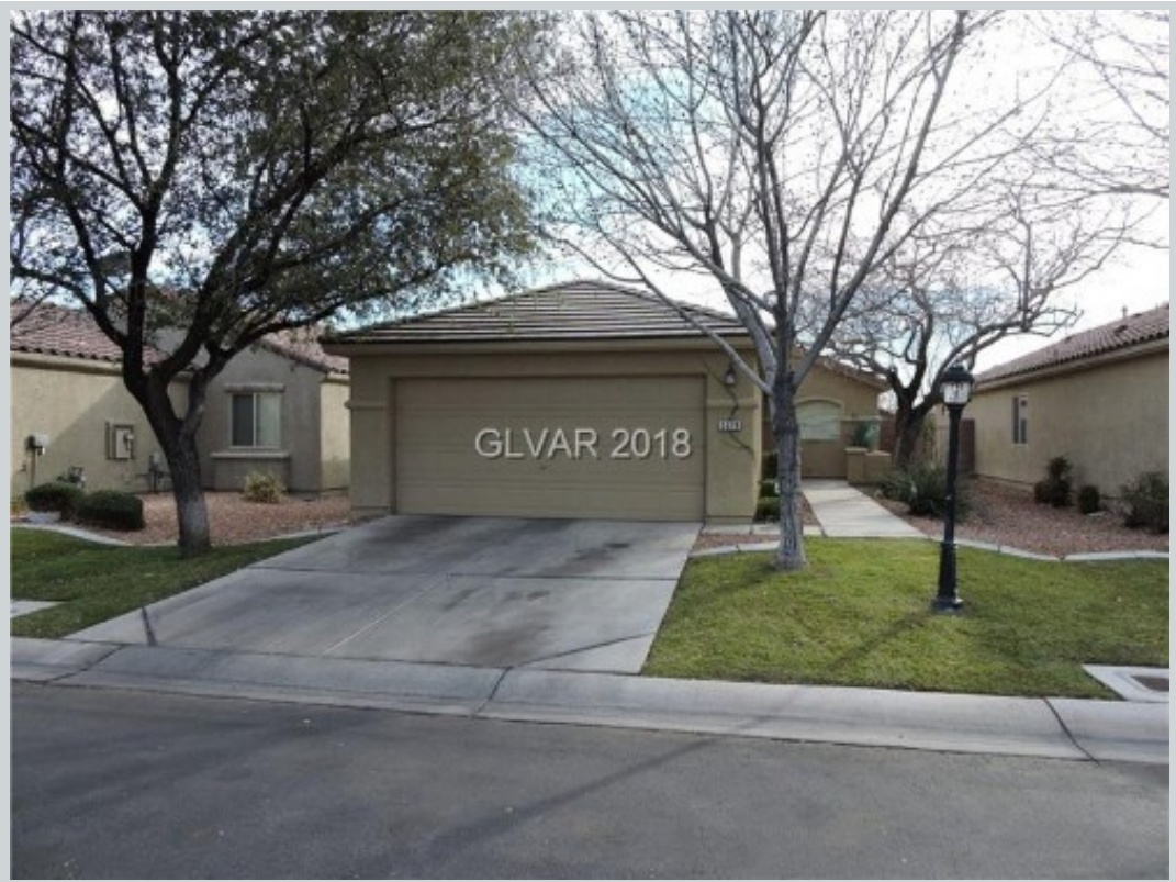
Sold Comp 1 5679 Crowbush Cove Pl