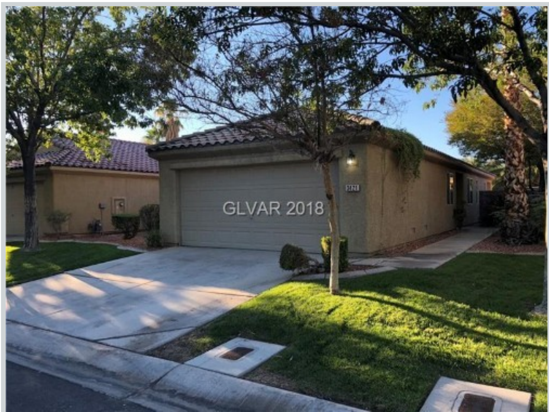
Listing Comp 3 3421 Blue Ash Ln