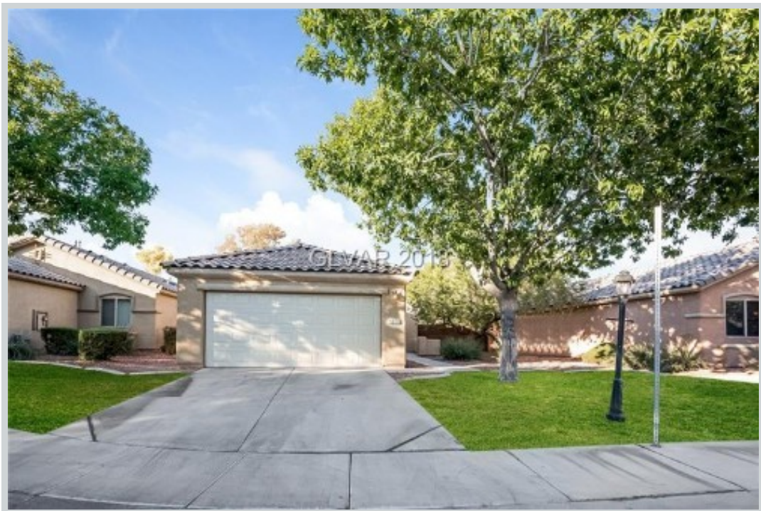
Listing Comp 2 5644 Great Eagle Ct

Address 5419 Golden Leaf Ave, Las Vegas, NV 89122 Loan Number 36764 Suggested List $215,000 Suggested Repaired $215,000 Sale $205,000