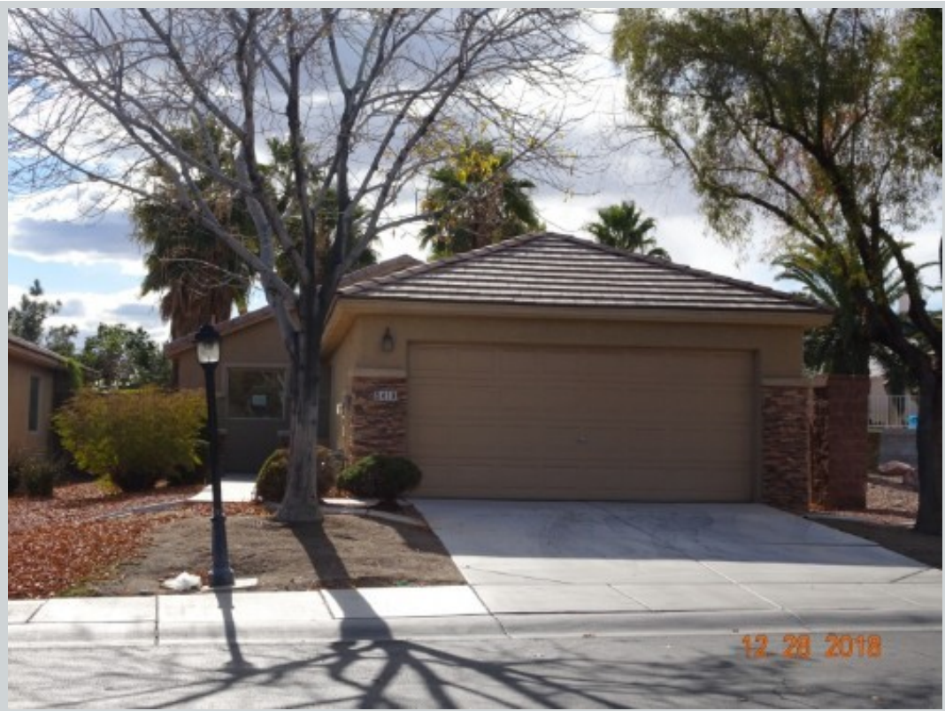
Subject 5419 Golden Leaf Ave