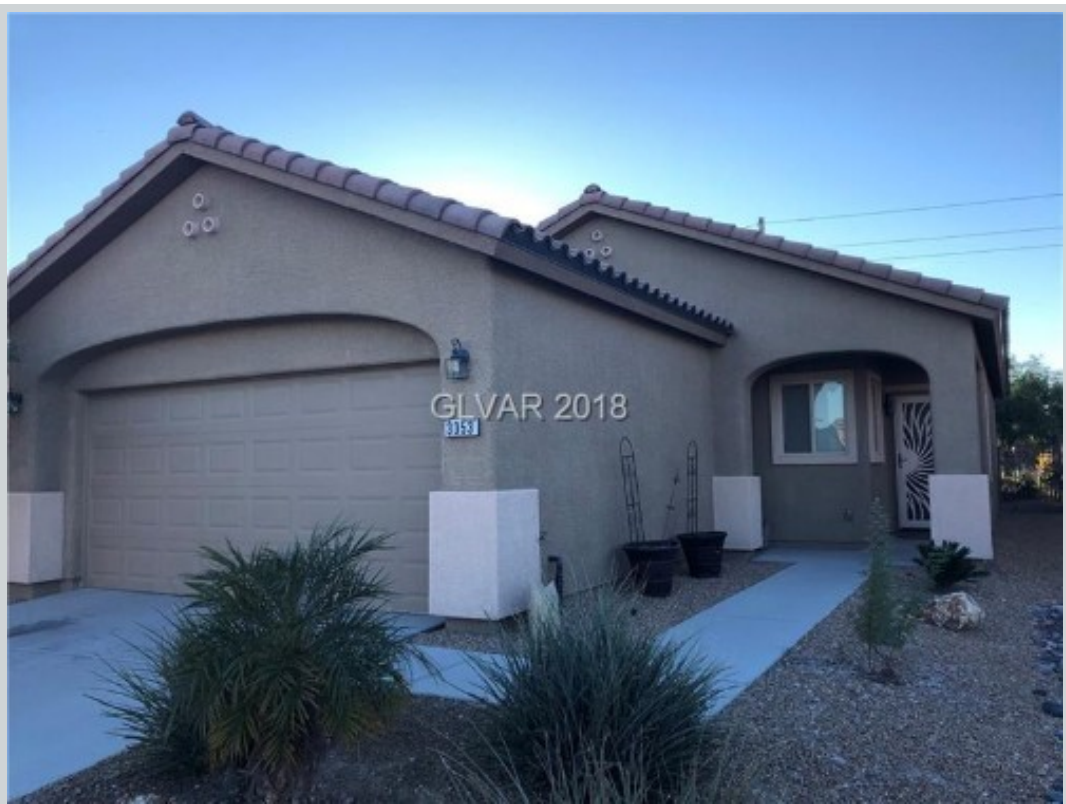
Listing Comp 1 3353 Hackney Horse Ct