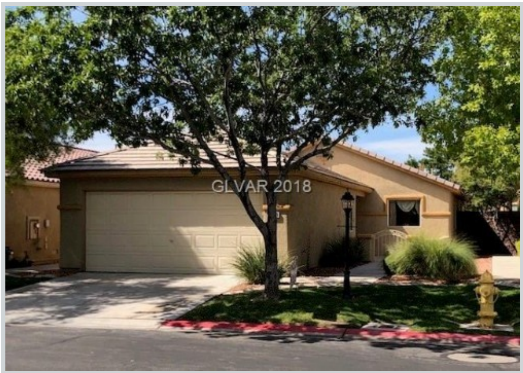
Sold Comp 3 3369 Eagle Bend St