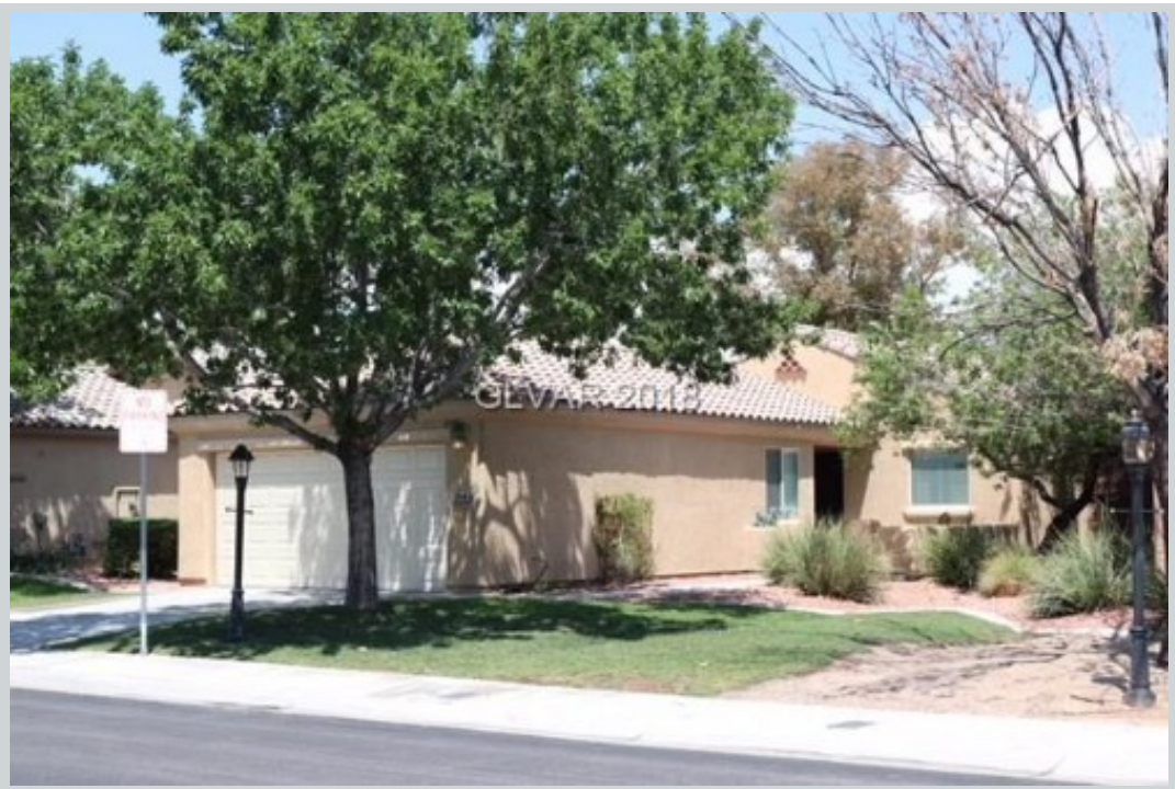
Sold Comp 2 5644 Great Eagle Ct