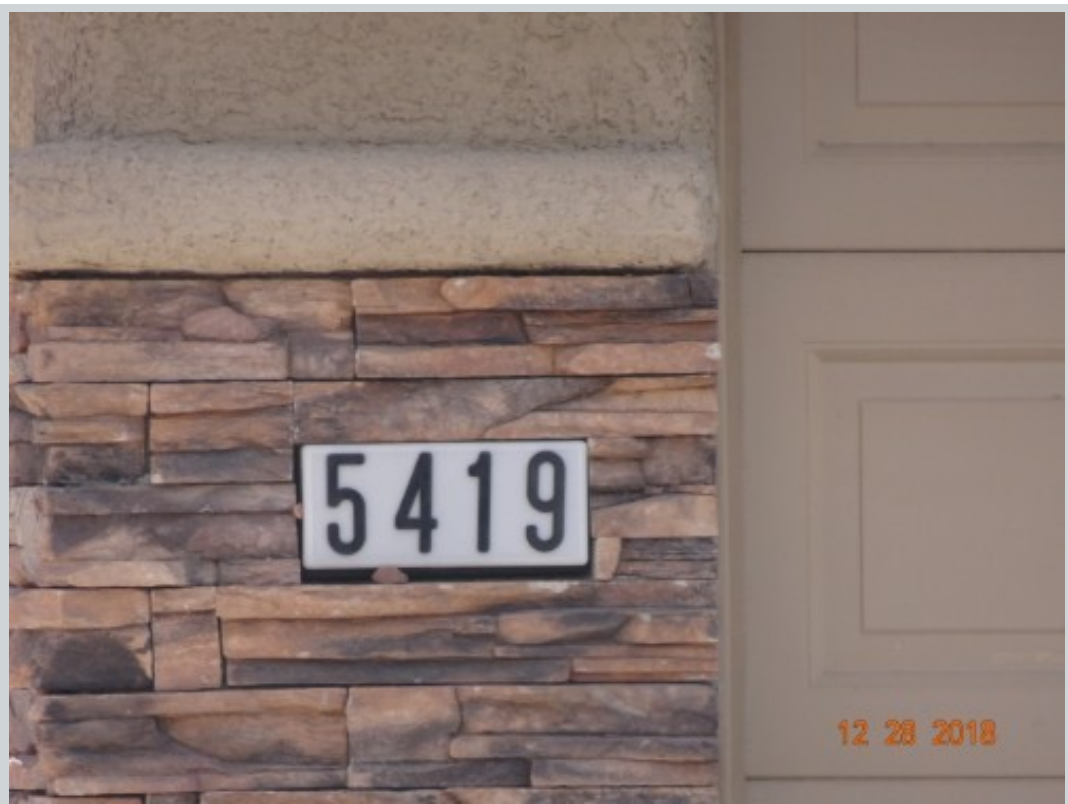
Subject 5419 Golden Leaf Ave