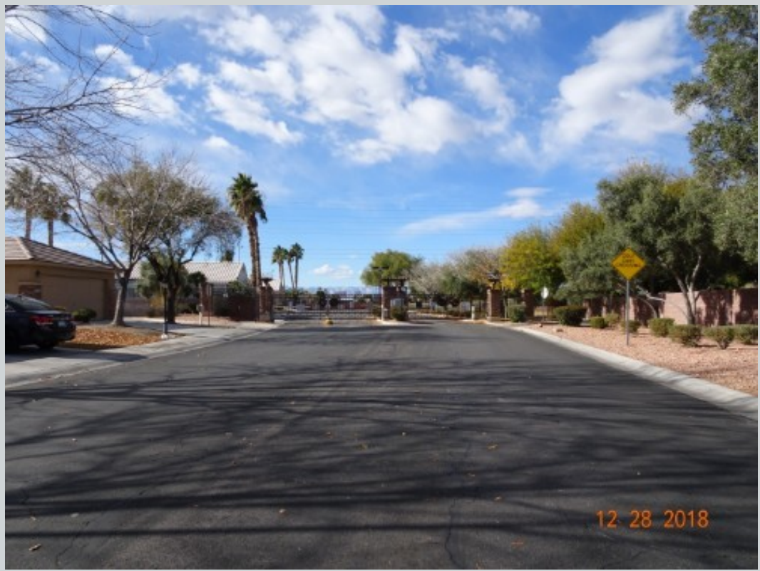
Subject 5419 Golden Leaf Ave