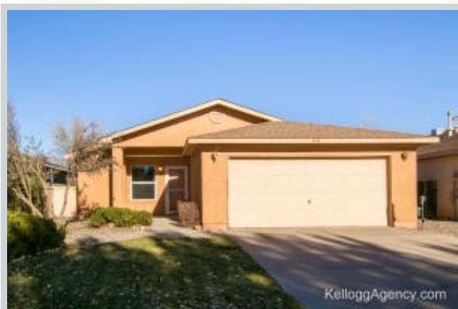
Listing Comp 3 3434 Fowler Meadows Dr Ne View Front