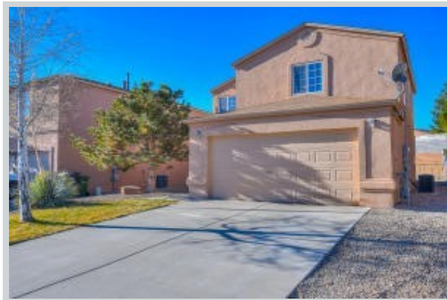
Listing Comp 1 3455 Flat Iron Rd Ne View Front