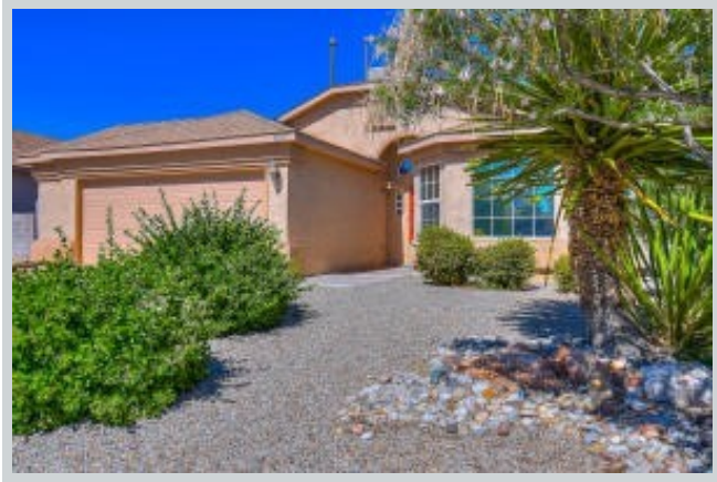
Sold Comp 3 3219 Colmor Meadows Cir Ne View Front

Address 3001 Pagosa Meadows Drive Ne, Rio Rancho, NEWMEXICO 87144 Loan Number 36767 Suggested List $170,000 Suggested Repaired $175,000 Sale $167,000