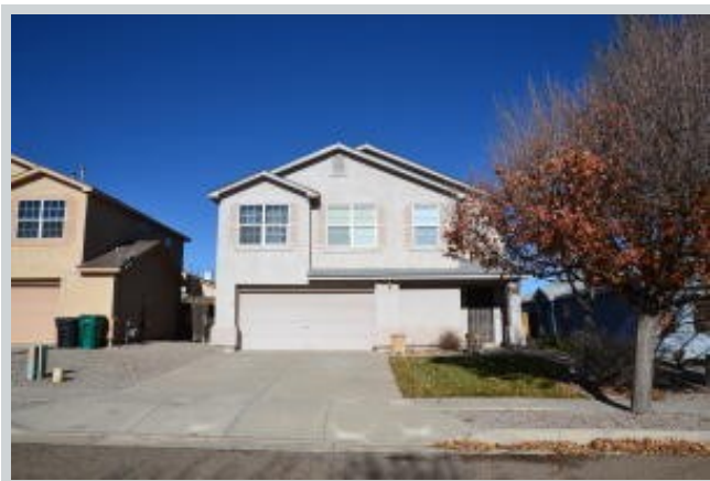
Listing Comp 2 605 Autumn Meadows Dr Ne View Front

Address 3001 Pagosa Meadows Drive Ne, Rio Rancho, NEWMEXICO 87144 Loan Number 36767 Suggested List $170,000 Suggested Repaired $175,000 Sale $167,000