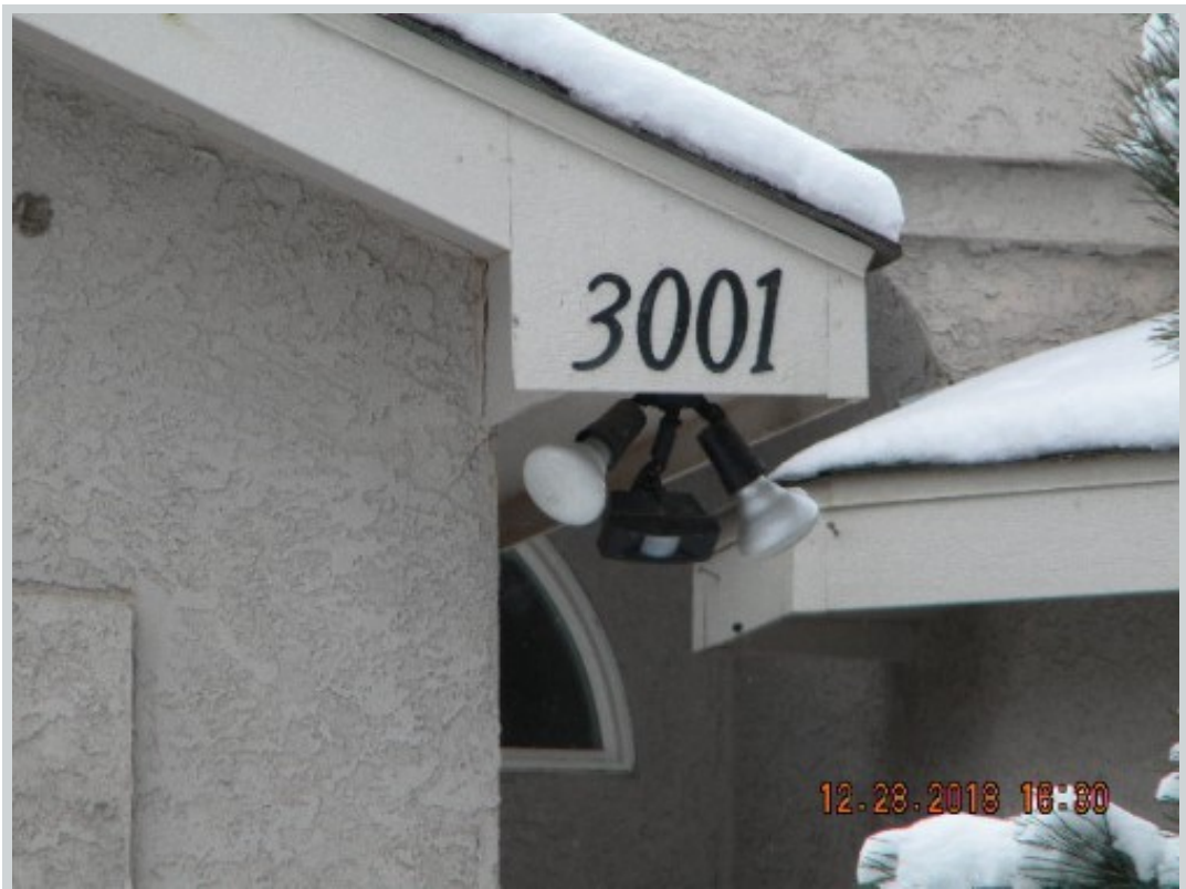
Subject 3001 Pagosa Meadows Dr Ne