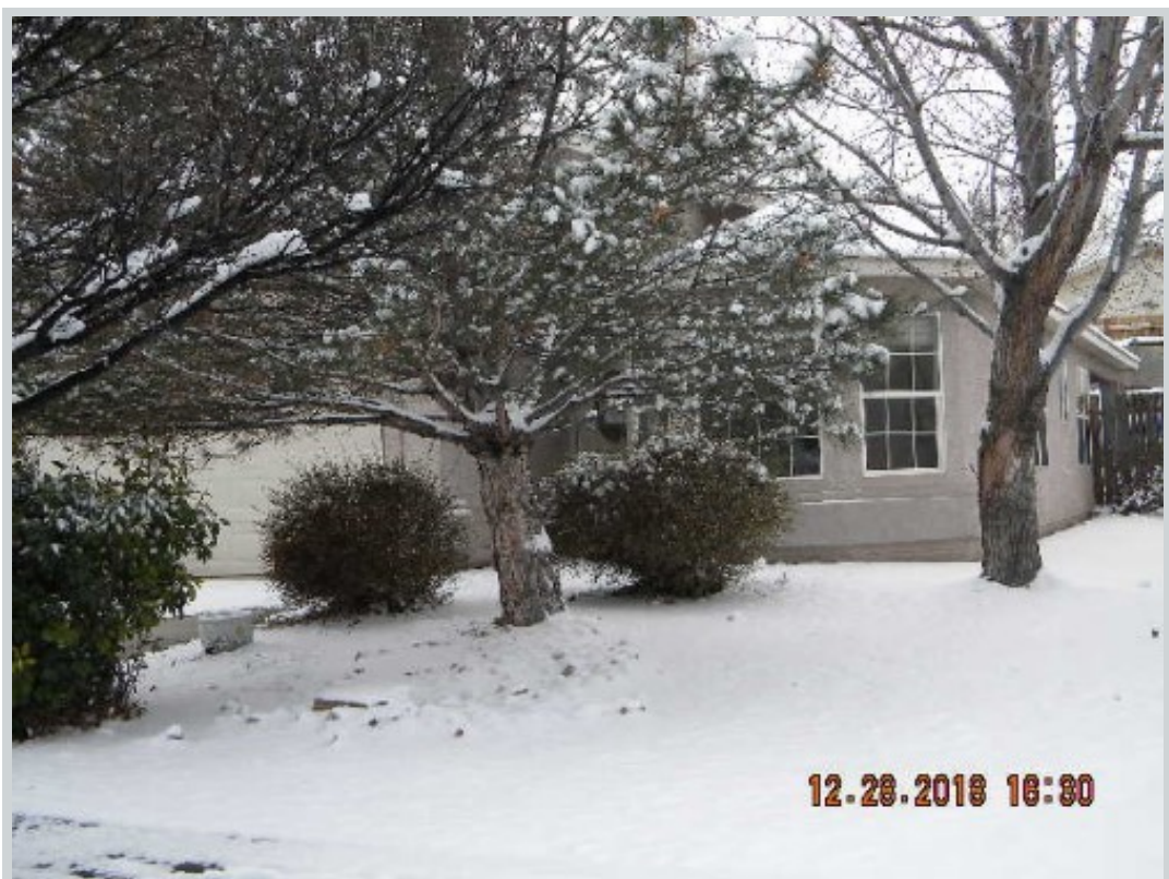
Subject 3001 Pagosa Meadows Dr Ne View Side Comment "Right side"