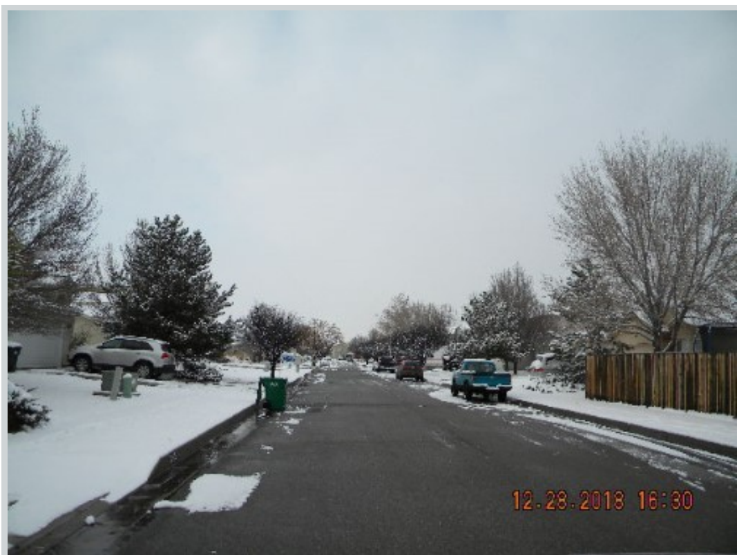
Subject 3001 Pagosa Meadows Dr Ne View Street Comment "Street - North"

Address 3001 Pagosa Meadows Drive Ne, Rio Rancho, NEWMEXICO 87144 Loan Number 36767 Suggested List $170,000 Suggested Repaired $175,000 Sale $167,000