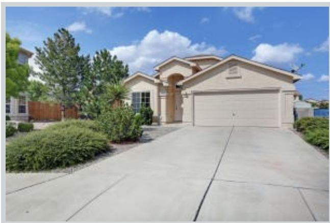
Sold Comp 1 3212 Ocate Meadows Ct Ne View Front

Address 3001 Pagosa Meadows Drive Ne, Rio Rancho, NEWMEXICO 87144 Loan Number 36767 Suggested List $170,000 Suggested Repaired $175,000 Sale $167,000