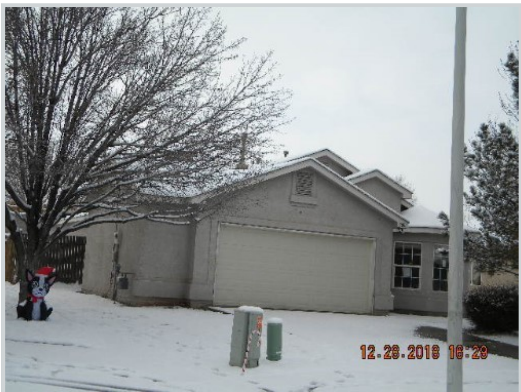
Subject 3001 Pagosa Meadows Dr Ne View Side Comment "Left side"

Address 3001 Pagosa Meadows Drive Ne, Rio Rancho, NEWMEXICO 87144 Loan Number 36767 Suggested List $170,000 Suggested Repaired $175,000 Sale $167,000