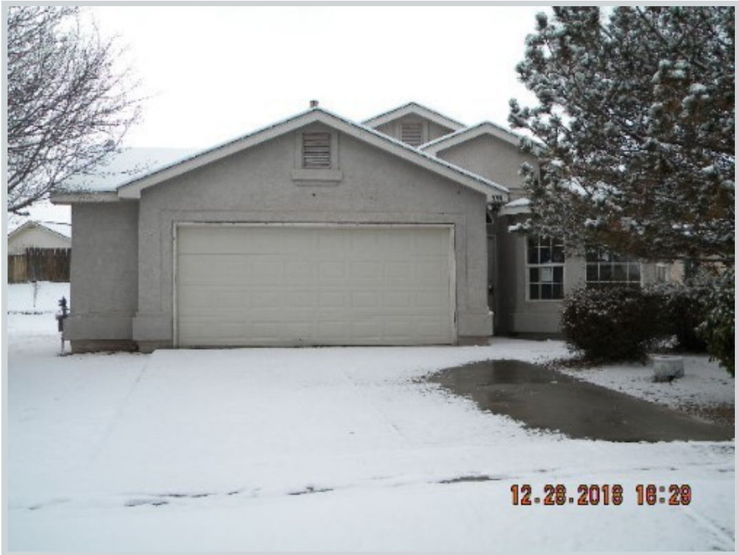
Subject 3001 Pagosa Meadows Dr Ne