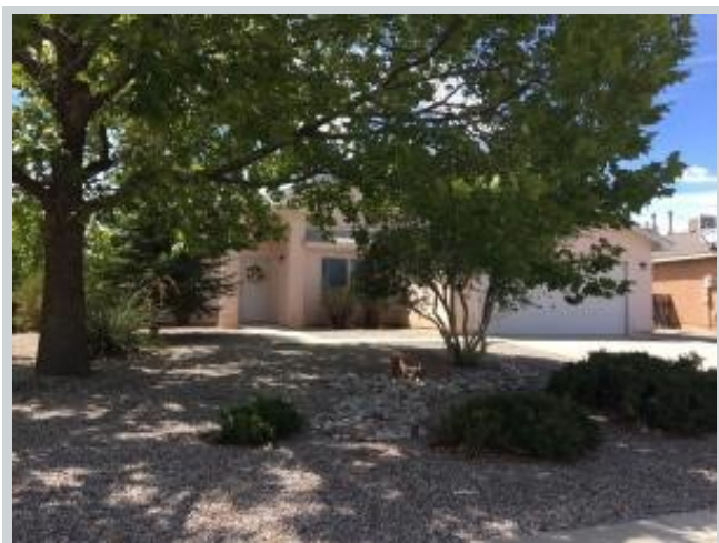
Sold Comp 2 3105 Shelby Meadows Dr Ne View Front