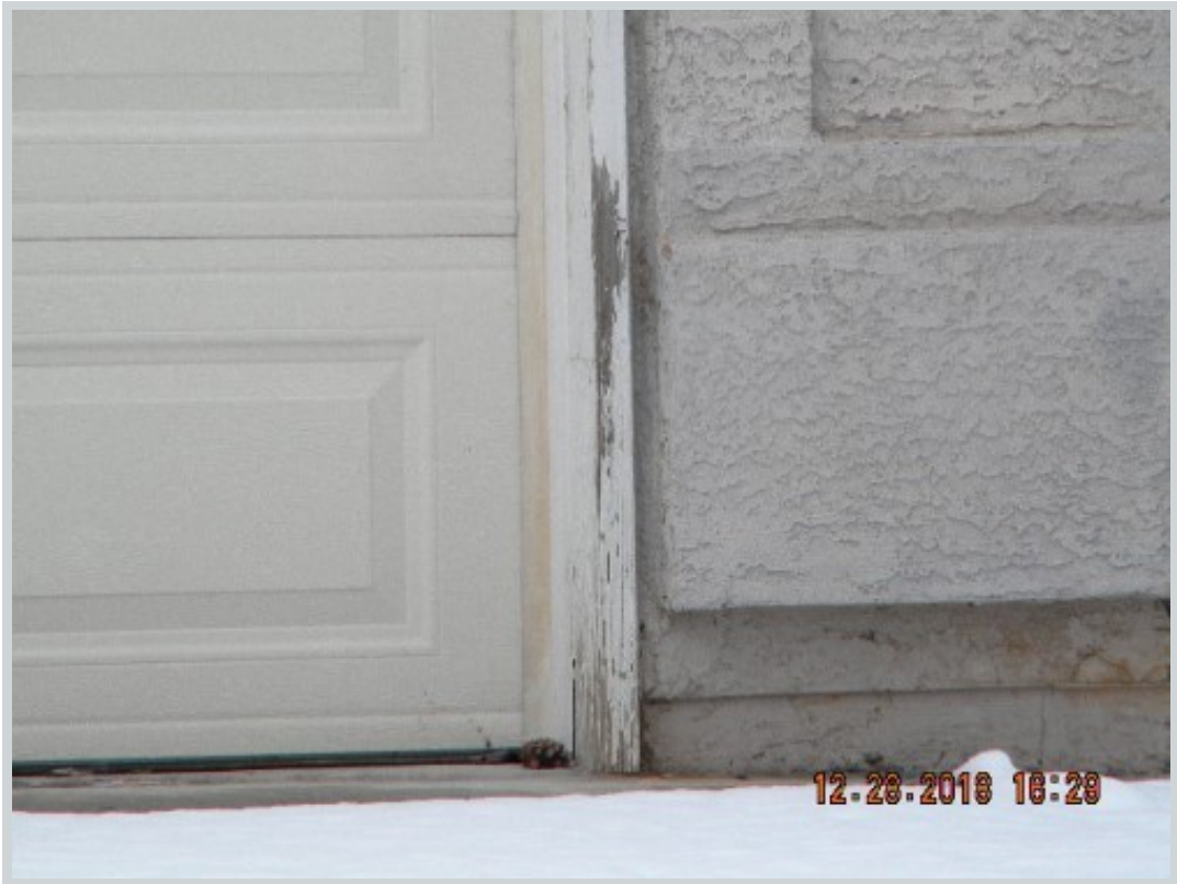
Subject 3001 Pagosa Meadows Dr Ne View Other Comment "Exterior paint"

Address 3001 Pagosa Meadows Drive Ne, Rio Rancho, NEWMEXICO 87144 Loan Number 36767 Suggested List $170,000 Suggested Repaired $175,000 Sale $167,000