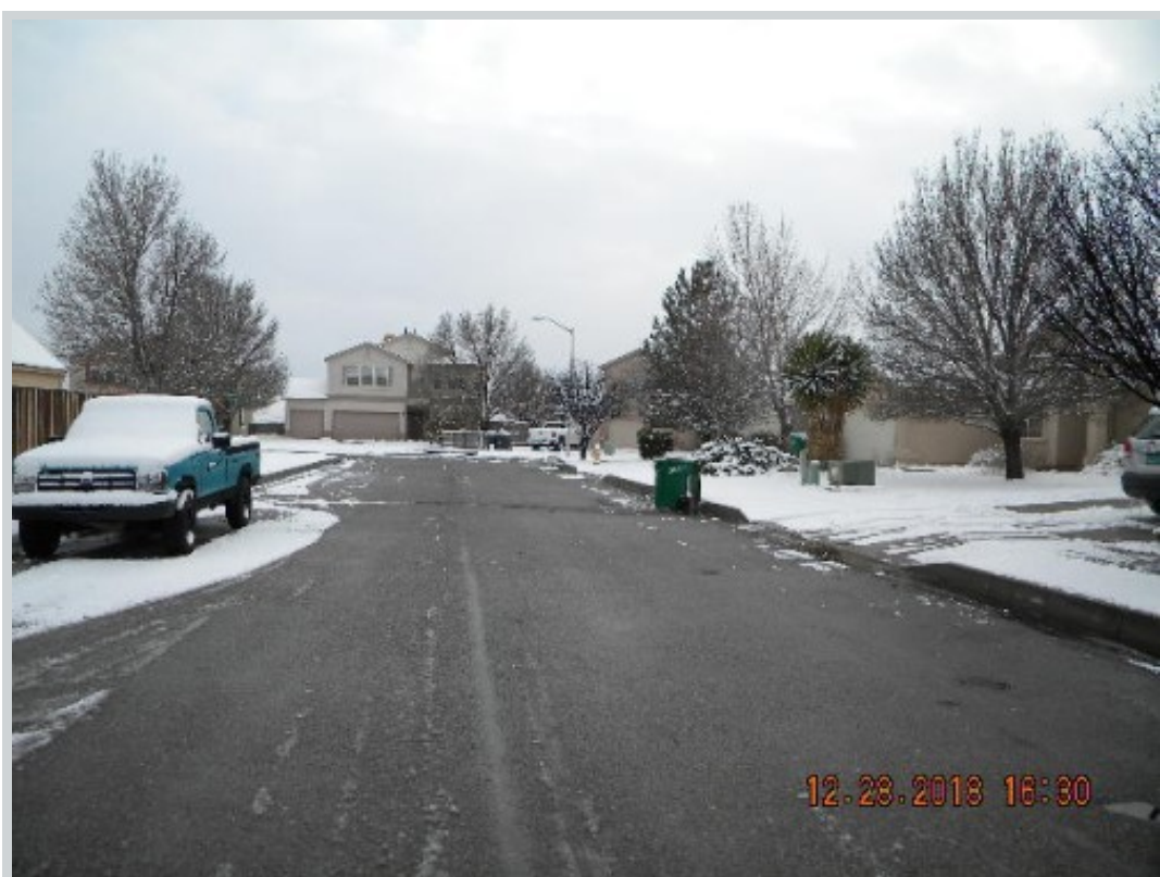
Subject 3001 Pagosa Meadows Dr Ne View Street Comment "Street - South"