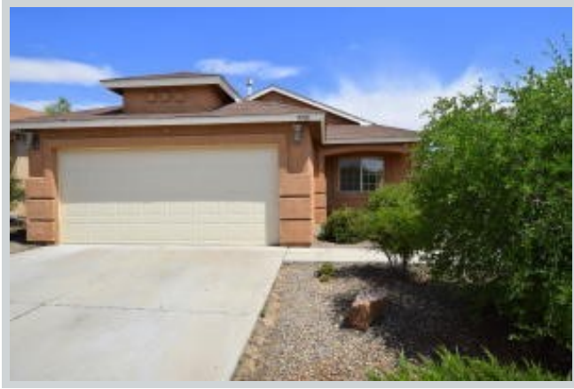
Sold Comp 1 9901 Lone Mountain Ave Sw View Front