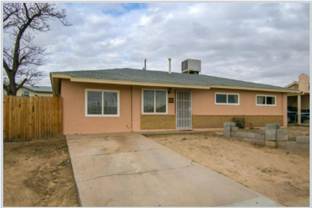
Listing Comp 3 1123 Tomas St Sw