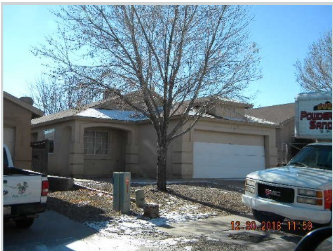
Subject 10500 Lost Arrowhead Ave Sw View Side Comment "Left side"