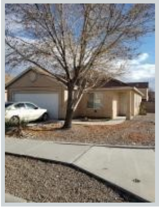
Listing Comp 2 8820 Tenemaha Ave Sw View Front