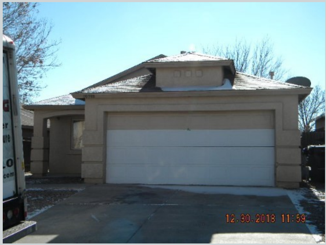
Subject 10500 Lost Arrowhead Ave Sw