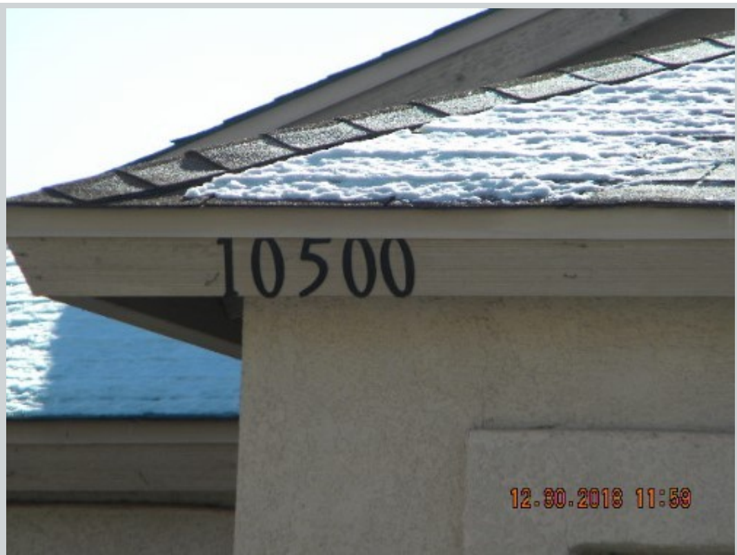
Subject 10500 Lost Arrowhead Ave Sw