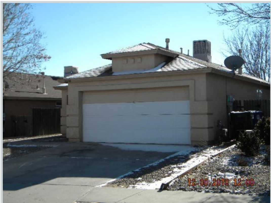
Subject 10500 Lost Arrowhead Ave Sw View Side Comment "Right side"

Address 10500 Lost Arrowhead Avenue Sw, Albuquerque, NM 87121 Loan Number 36769 Suggested List $127,000 Suggested Repaired $130,000 Sale $122,000