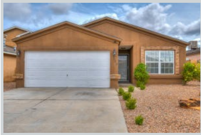
Sold Comp 2 548 Dean Dr Sw View Front