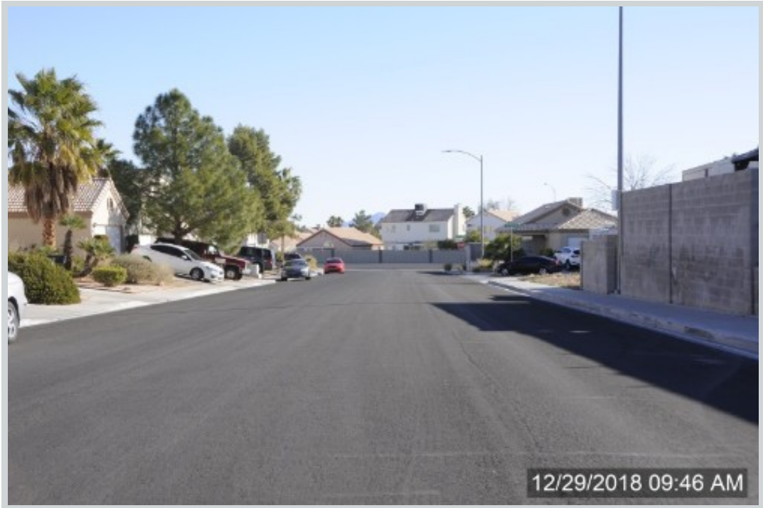
Subject 6480 Burlwood Way View Street Comment "View Two"

Address 6480 Burlwood Way, Las Vegas, NV 89108 Loan Number 36772 Suggested List $245,000 Suggested Repaired $250,000 Sale $235,000