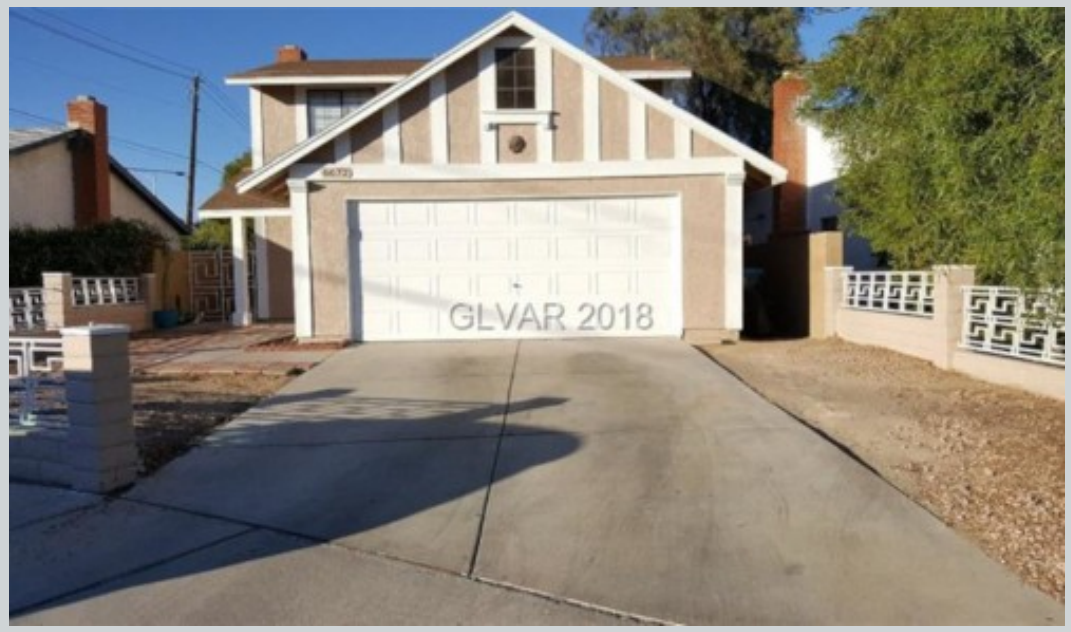
Listing Comp 3 6672 Fredonia Dr