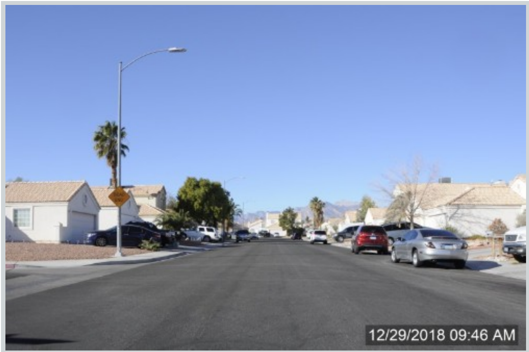
Subject 6480 Burlwood Way View Street Comment "View One"