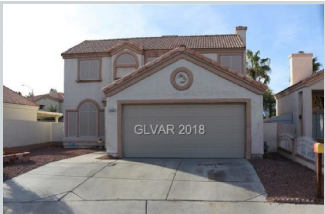
Listing Comp 2 1532 Canyon Rose Way