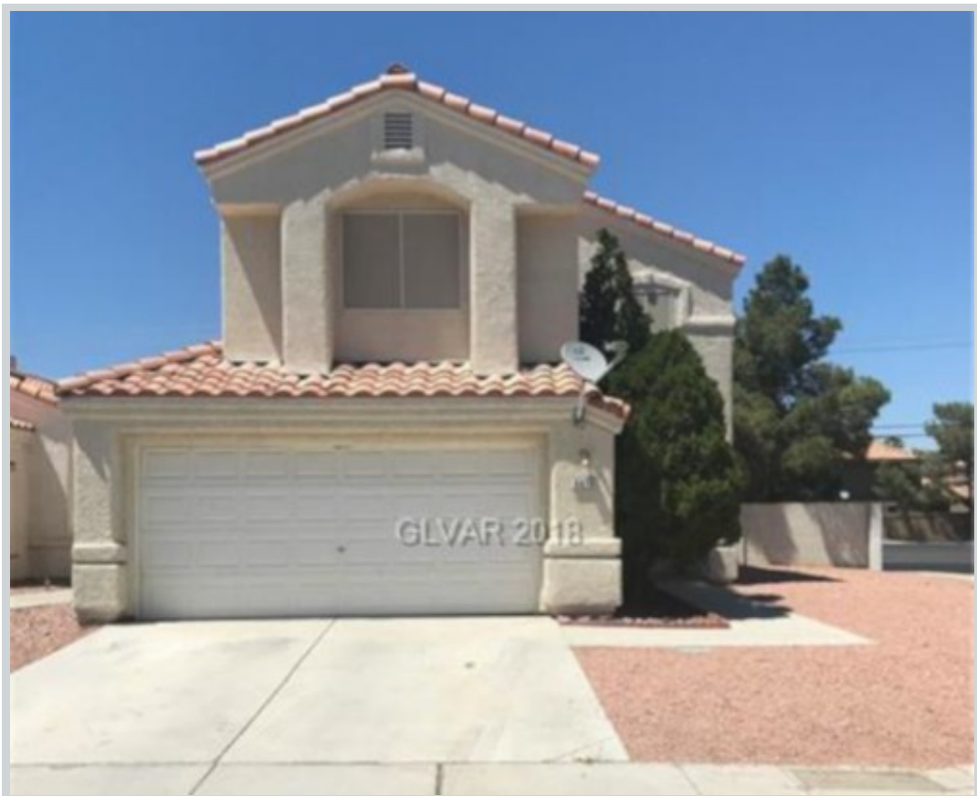
Sold Comp 2 6616 Ives Ave

Address 6480 Burlwood Way, Las Vegas, NV 89108 Loan Number 36772 Suggested List $245,000 Suggested Repaired $250,000 Sale $235,000