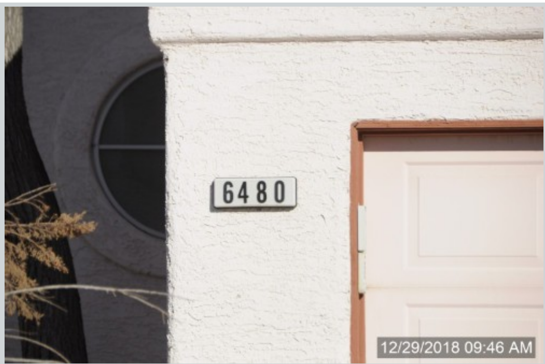
Subject 6480 Burlwood Way