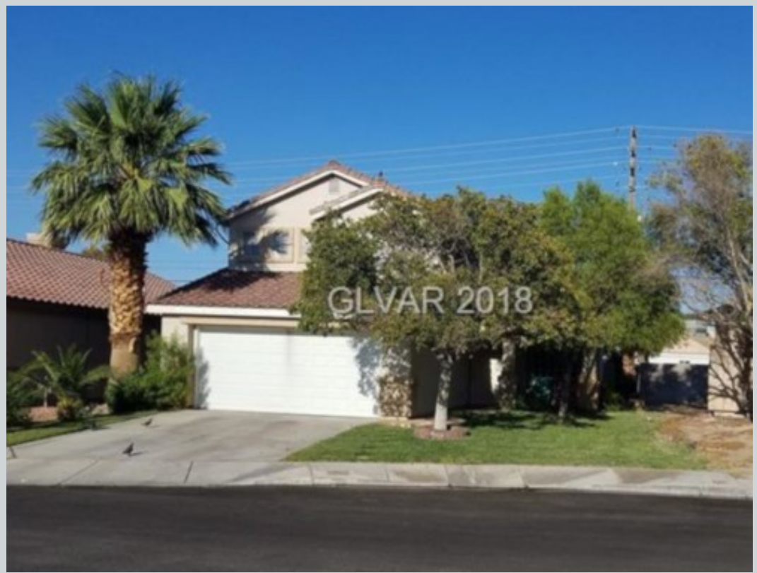
Sold Comp 1 1208 Silver Prospect Dr