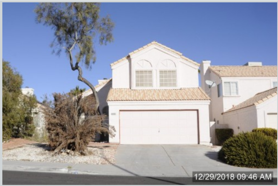
Subject 6480 Burlwood Way