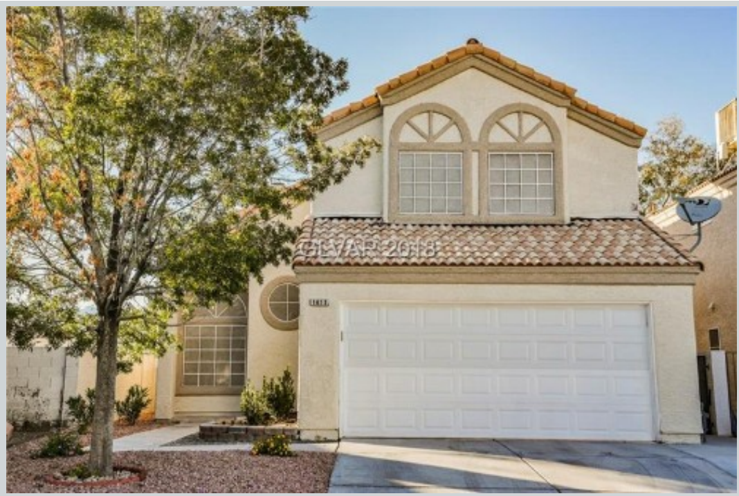
Listing Comp 1 1417 Sapphire Springs Cir