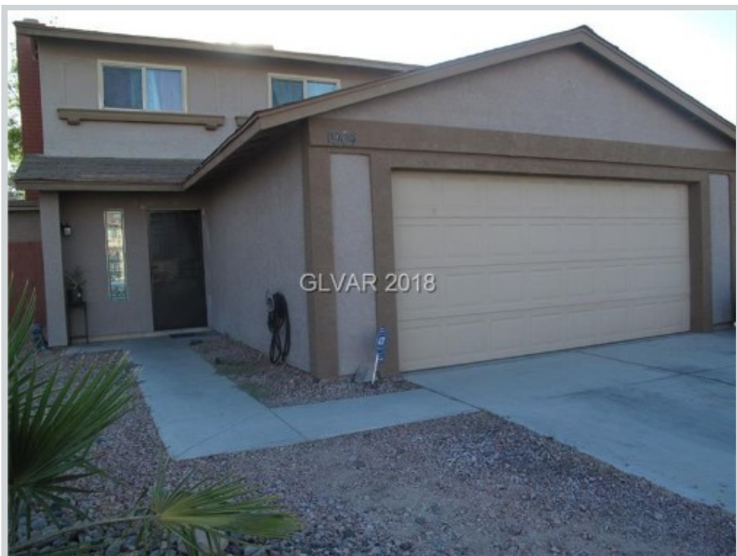
Sold Comp 3 1904 Indrio Cir